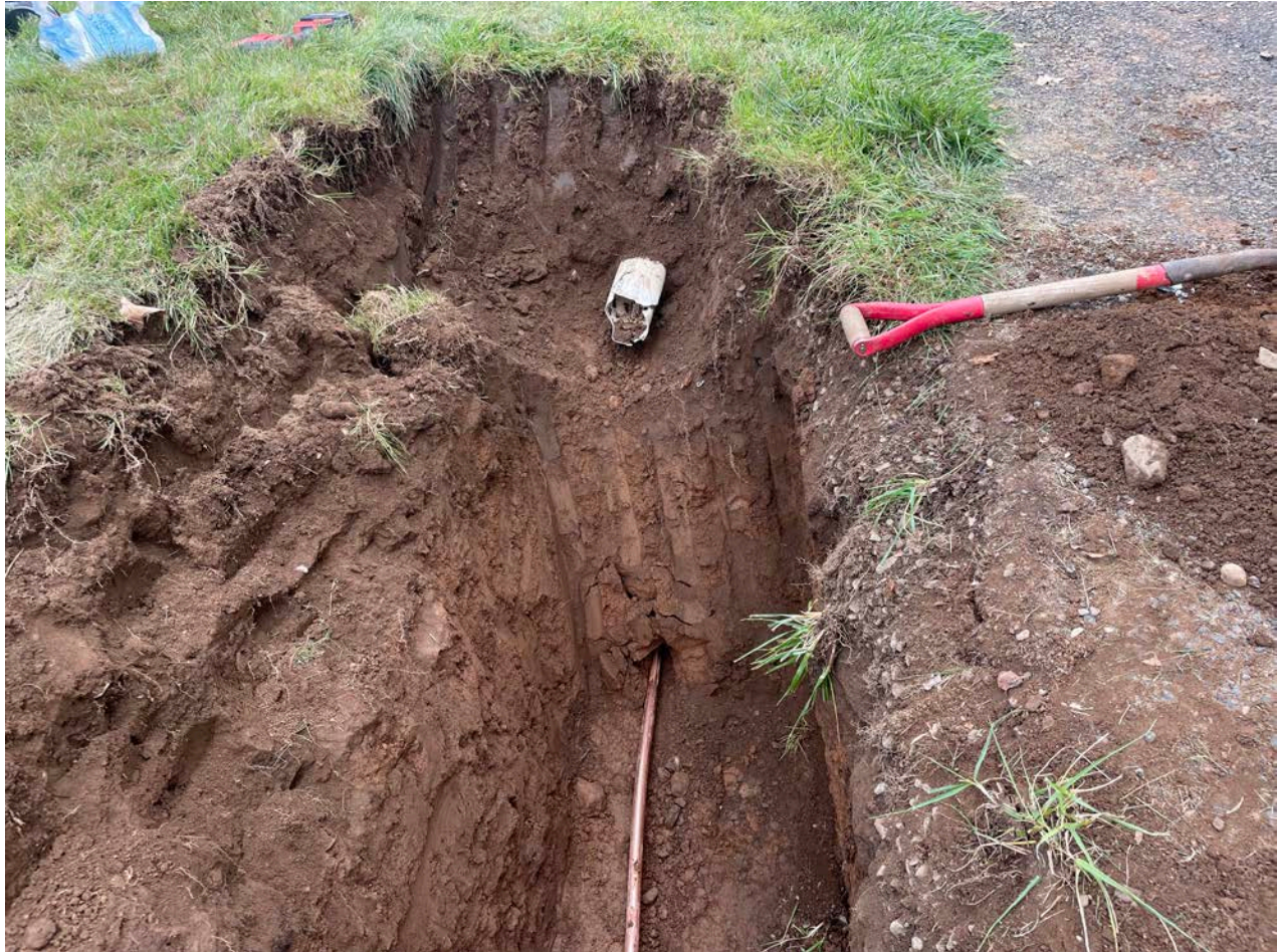
Picture 8: View of the 1" copper water service line that Ludlow ran through a hole that they made with a pneumatic mole on the north side of the driveway for the 173 Maple Avenue residence. View to the east.