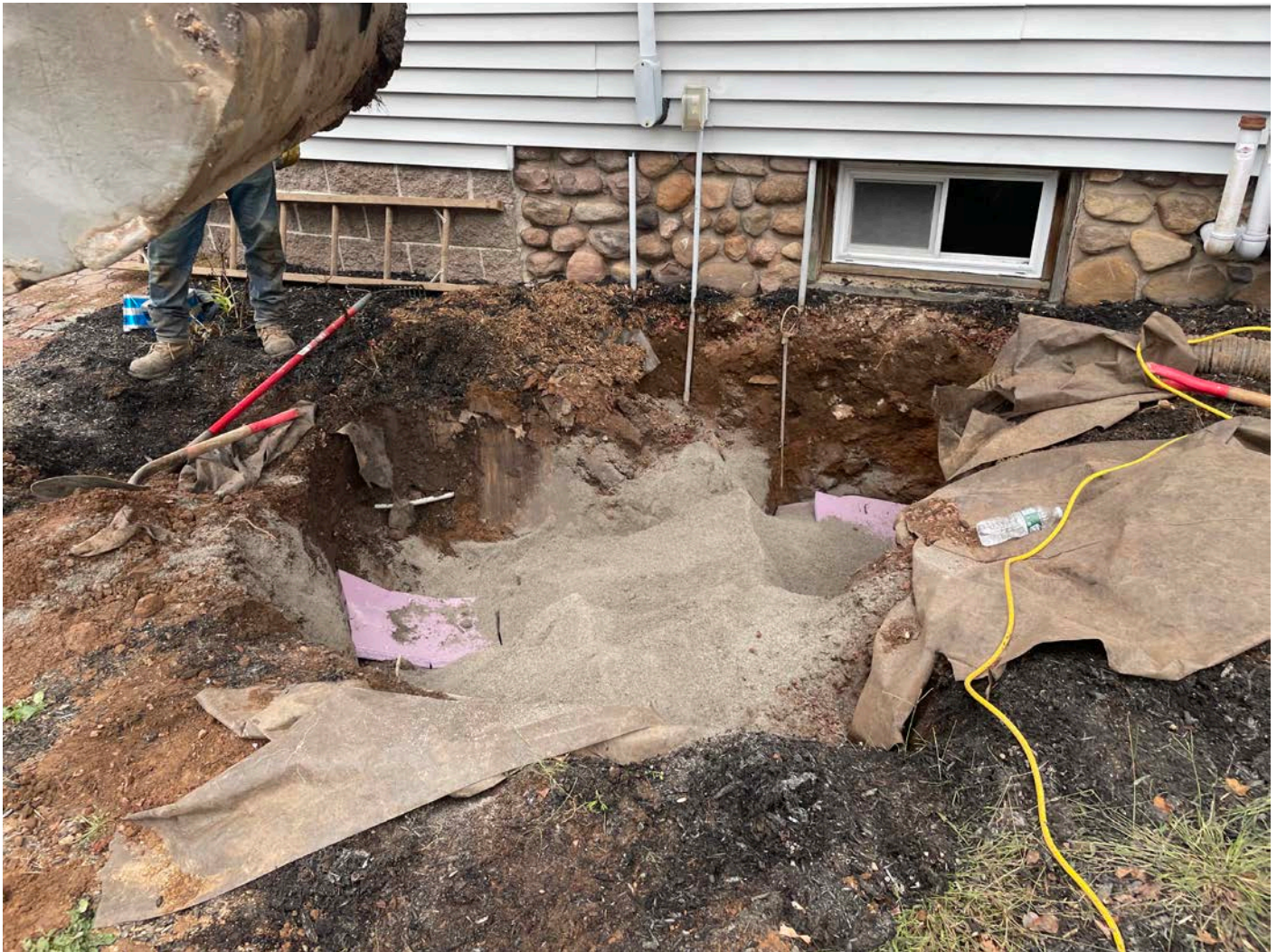
Picture 9: Sand that Ludlow has placed over sections of 2" foam insulation board that was placed over the 1" copper water service line on the south side of the foundation for the 173 Maple Avenue residence. View to the northwest.