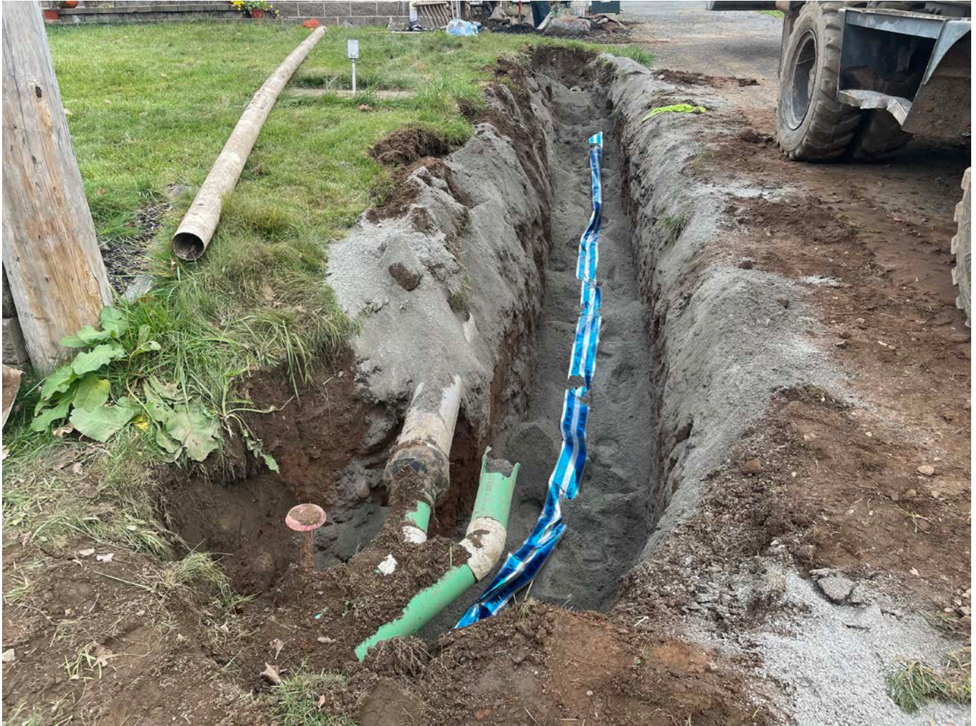
Picture 10: View of the trench that Ludlow excavated on the north side of the driveway for the 173 Maple Avenue residence, where they have placed sand and caution tape over the 1" copper water service line they just installed. View to the east.