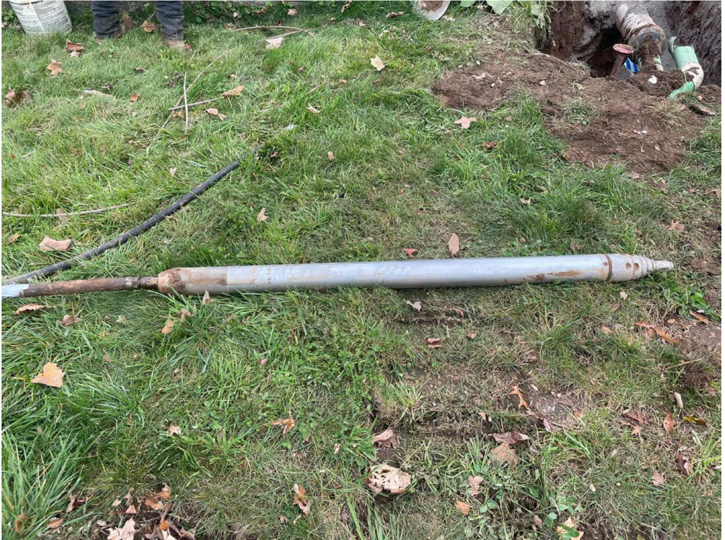
Picture 11: Pneumatic mole that Ludlow used to punch a hole beneath a sidewalk at the 173 Maple Avenue property for the installation of a 1" copper water service line. View to the southeast.