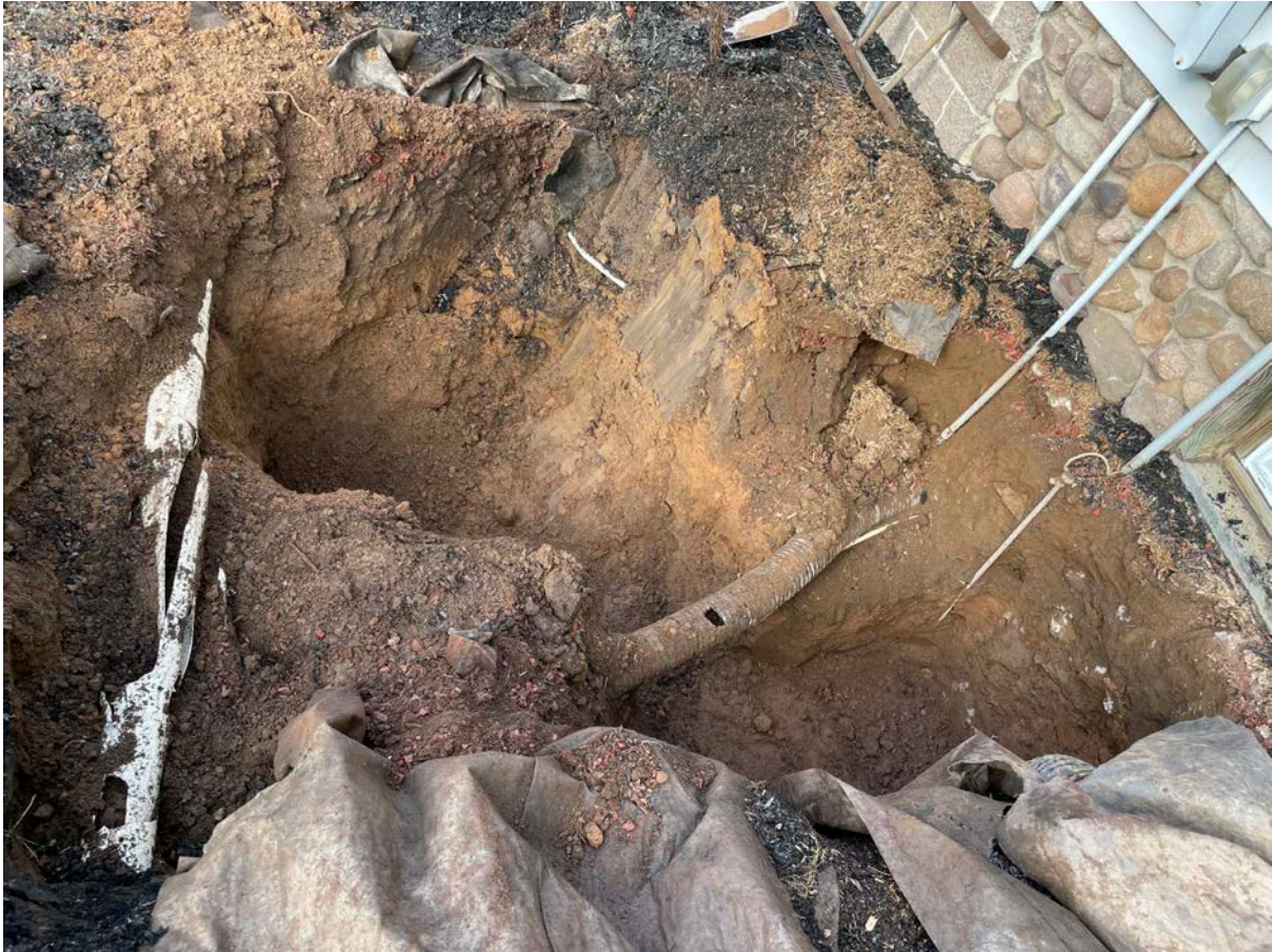
Picture 5: Portion of the trench that Ludlow excavated on the south side of the 173 Maple Avenue residence, showing broken PVC and plastic drain lines that were later repaired prior to backfilling. View to the northwest.