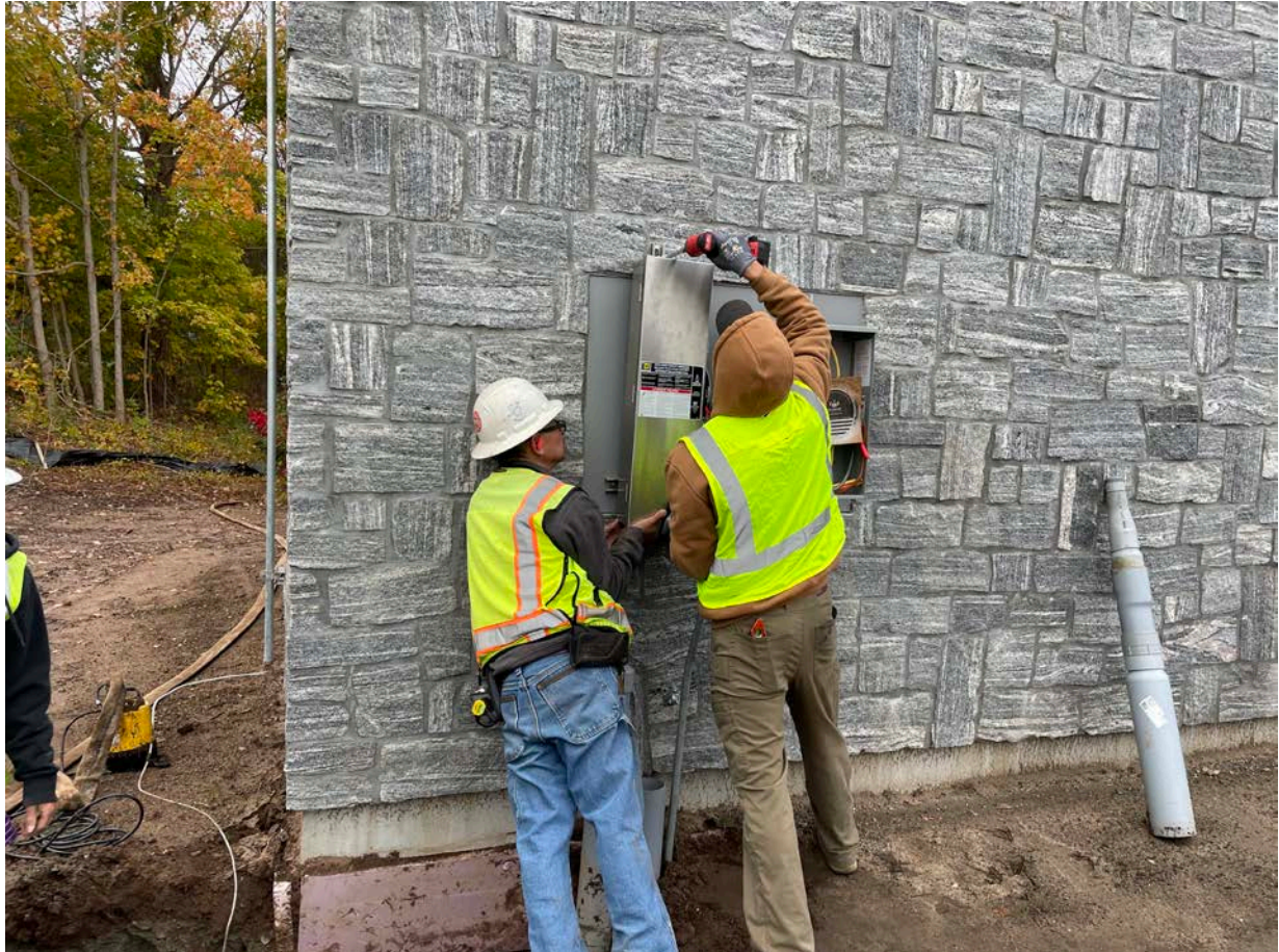
Picture 4: A&R Electrical replacing the electrical disconnect on the northeast corner of the booster station located at Station 750+63 on S. Main Street, Middletown. View to the south.