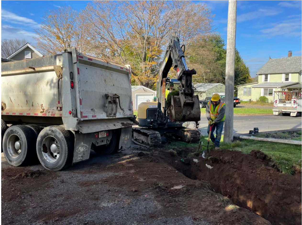
Picture 6: Ludlow excavating on the north side of the driveway for the 173 Maple Avenue residence. View to the northwest.