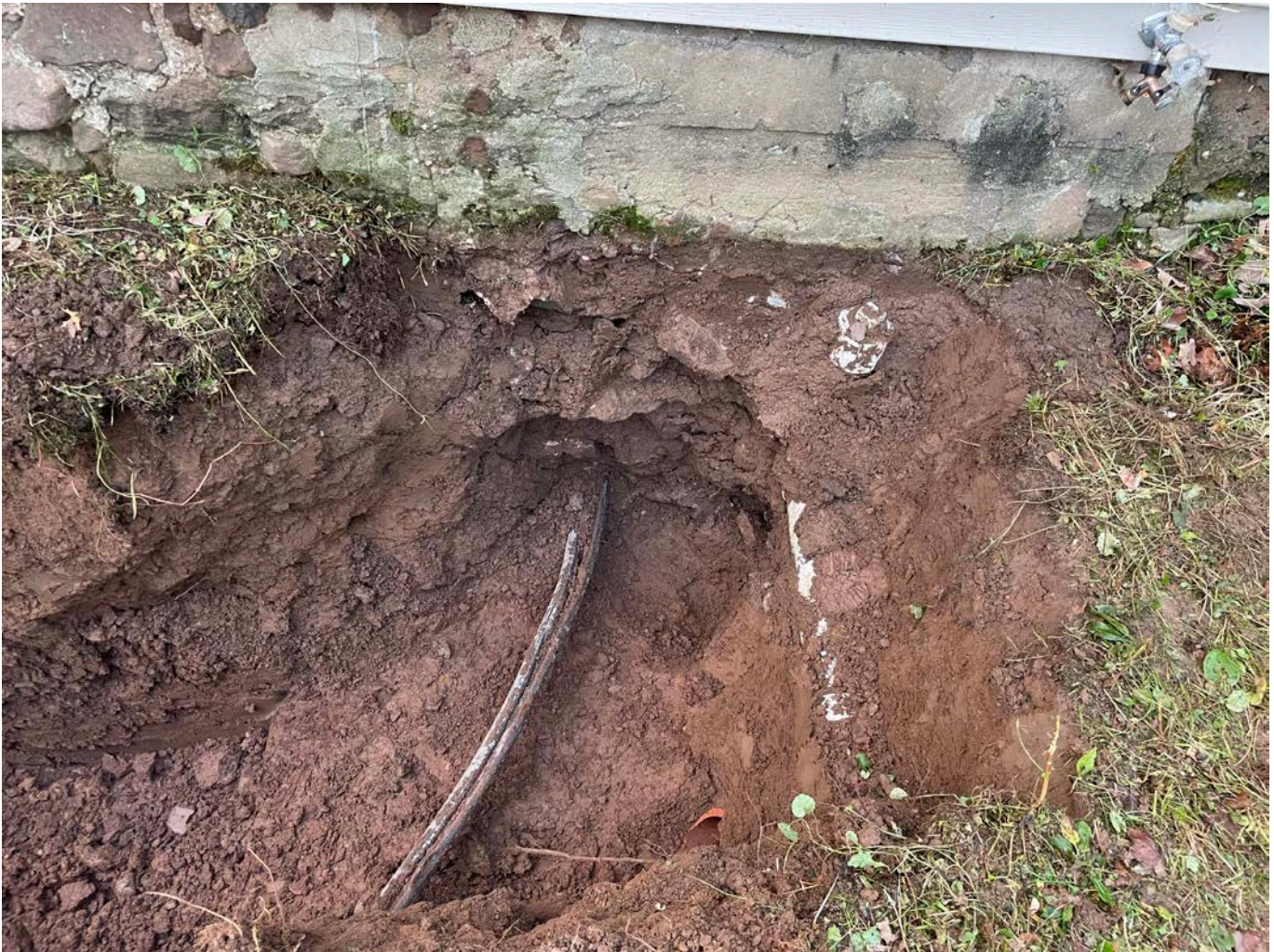
Picture 2: North side of the 172 Maple Avenue residence where Ludlow has daylighted the field stone foundation of the residence along with the well water supply line and a 4" PVC line that runs to the home's septic system. View to the south.