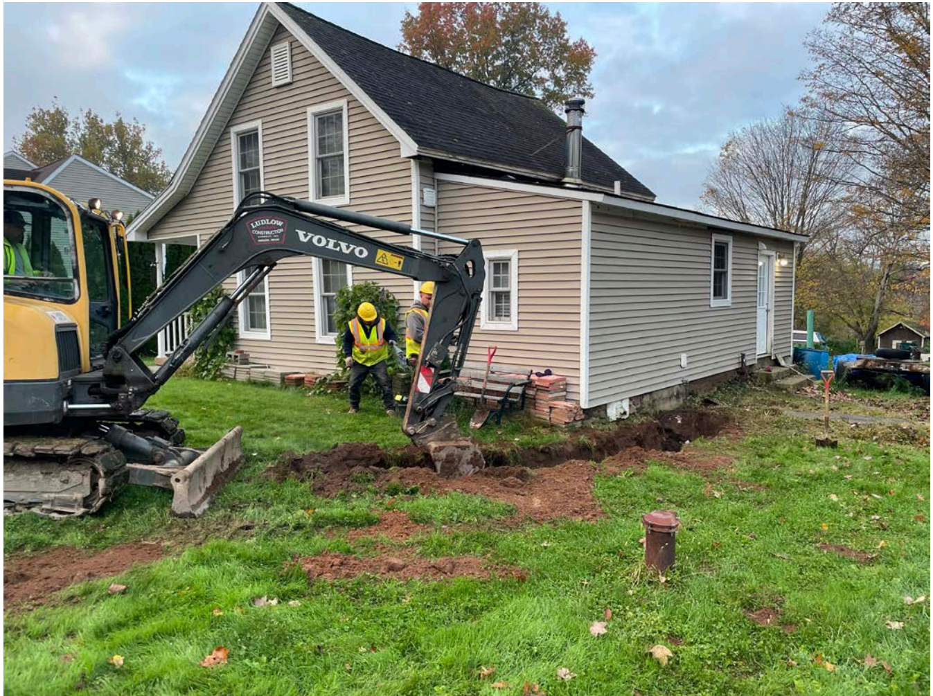
Picture 1: Ludlow excavating on the north and east sides of the 172 Maple Avenue, Durham, residence for the installation of a 1" copper water service line. View to the southwest.