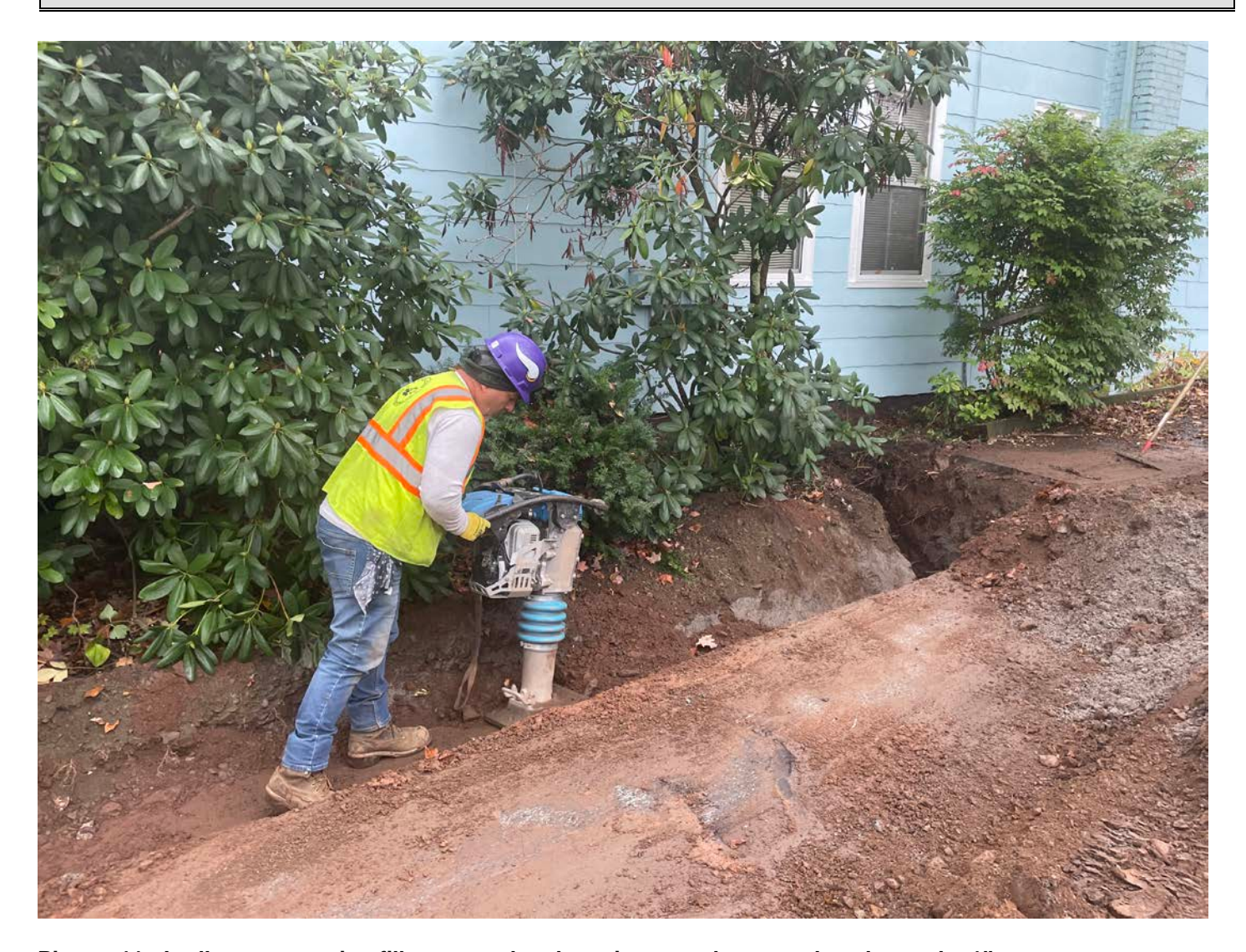
Picture 11: Ludlow compacting fill over sand and caution tape that was placed over the 1" copper water service line they installed at the 208 Main Street residence. View to the southwest.