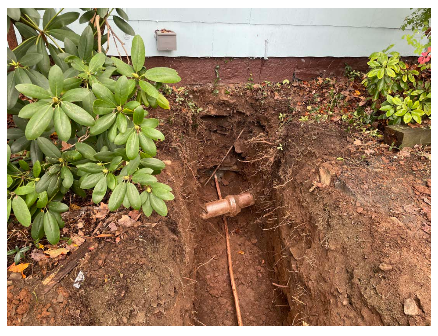
Picture 10: 1" copper water service line that Ludlow has inserted through the northern foundation of the 208 Main Street residence. View to the south.

Contractor: Ludlow Construction Page: 13 of 14