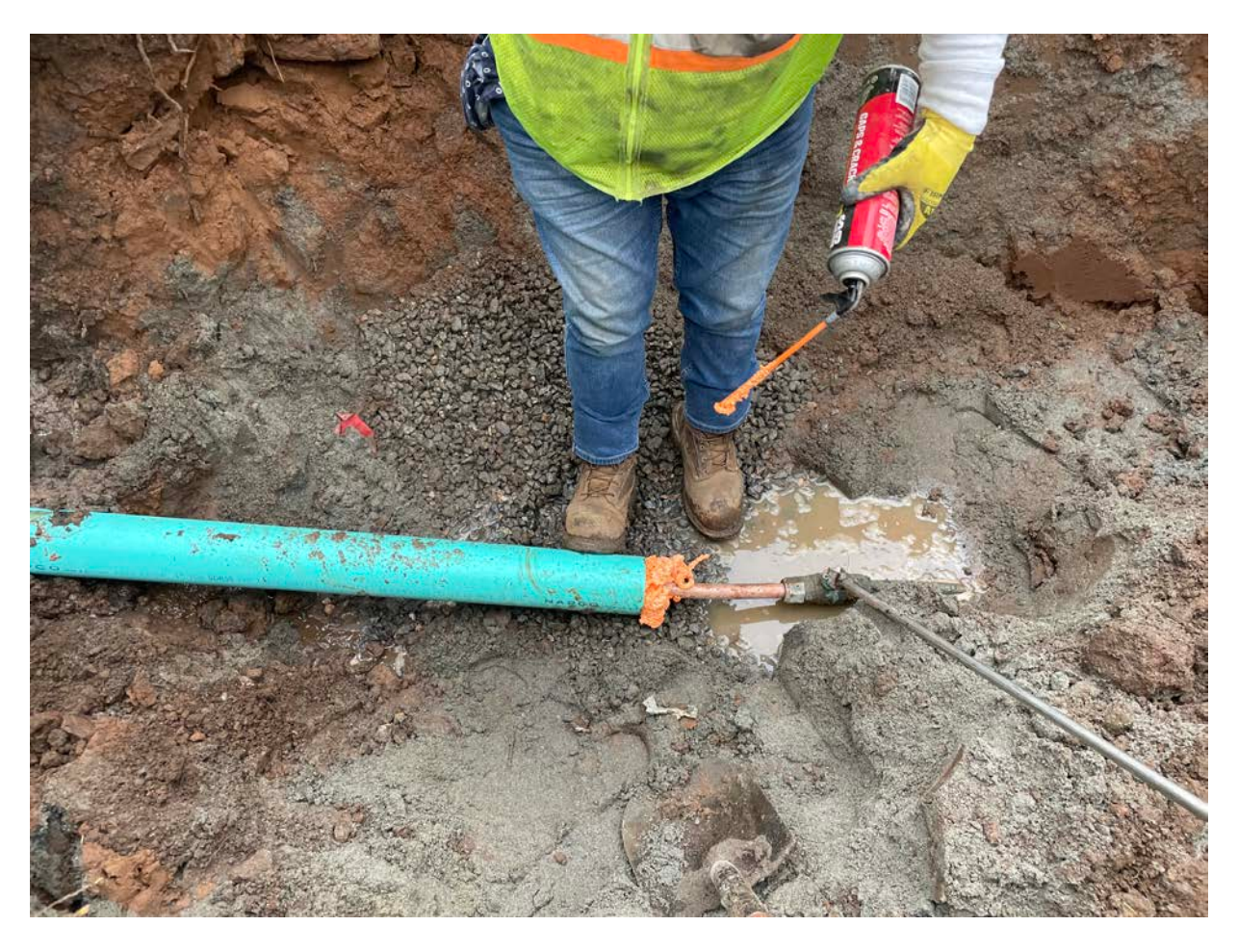
Picture 4: Ludlow has just placed polyurethane foam sealant between the 4" PVC and the 1" copper water service line they are installing on the east side of the 202 Main Street residence. View is of the east side of the 1" copper water line where it connects to the curb stop for the 202 Main Street property. View to the north.

Contractor: Ludlow Construction Page: 7 of 14