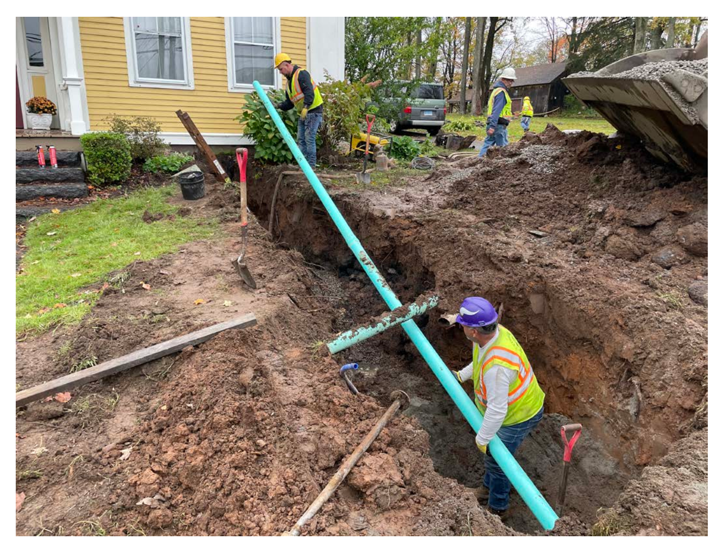
Picture 2: Ludlow placing 4" PVC sewer pipe over the 1" copper water service line they are installing on the east side of the 202 Main Street residence. View to the west.

Contractor: Ludlow Construction Page: 5 of 14