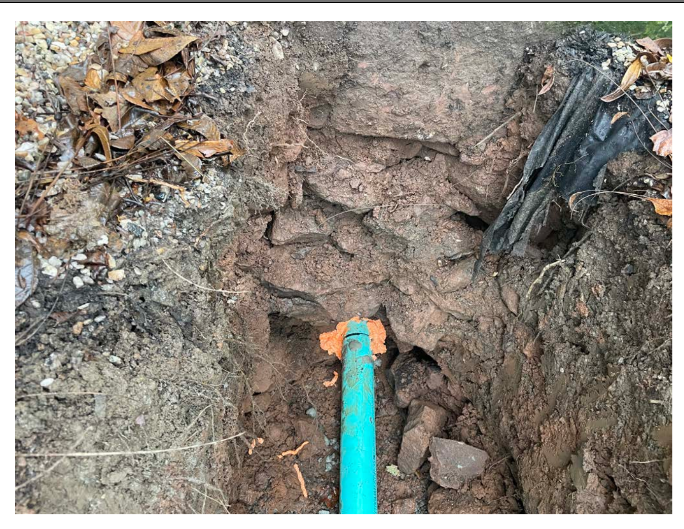
Picture 3: 4" PVC sewer pipe that Ludlow placed over the 1" copper water service line they are installing on the east side of the 202 Main Street residence. Ludlow has placed polyurethane foam sealant between the 4" PVC and the 1" copper line. View to the west.

Contractor: Ludlow Construction Page: 6 of 14