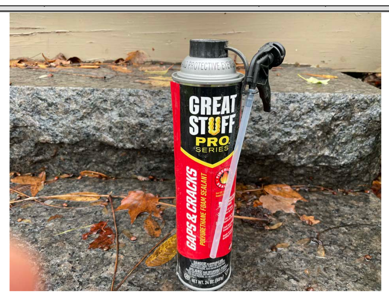
Picture 5: Polyurethane foam sealant that Ludlow used as a seal between the 4" PVC sewer pipe and the 1" copper water service line they are installing on the east side of the 202 Main Street residence.

Contractor: Ludlow Construction Page: 8 of 14