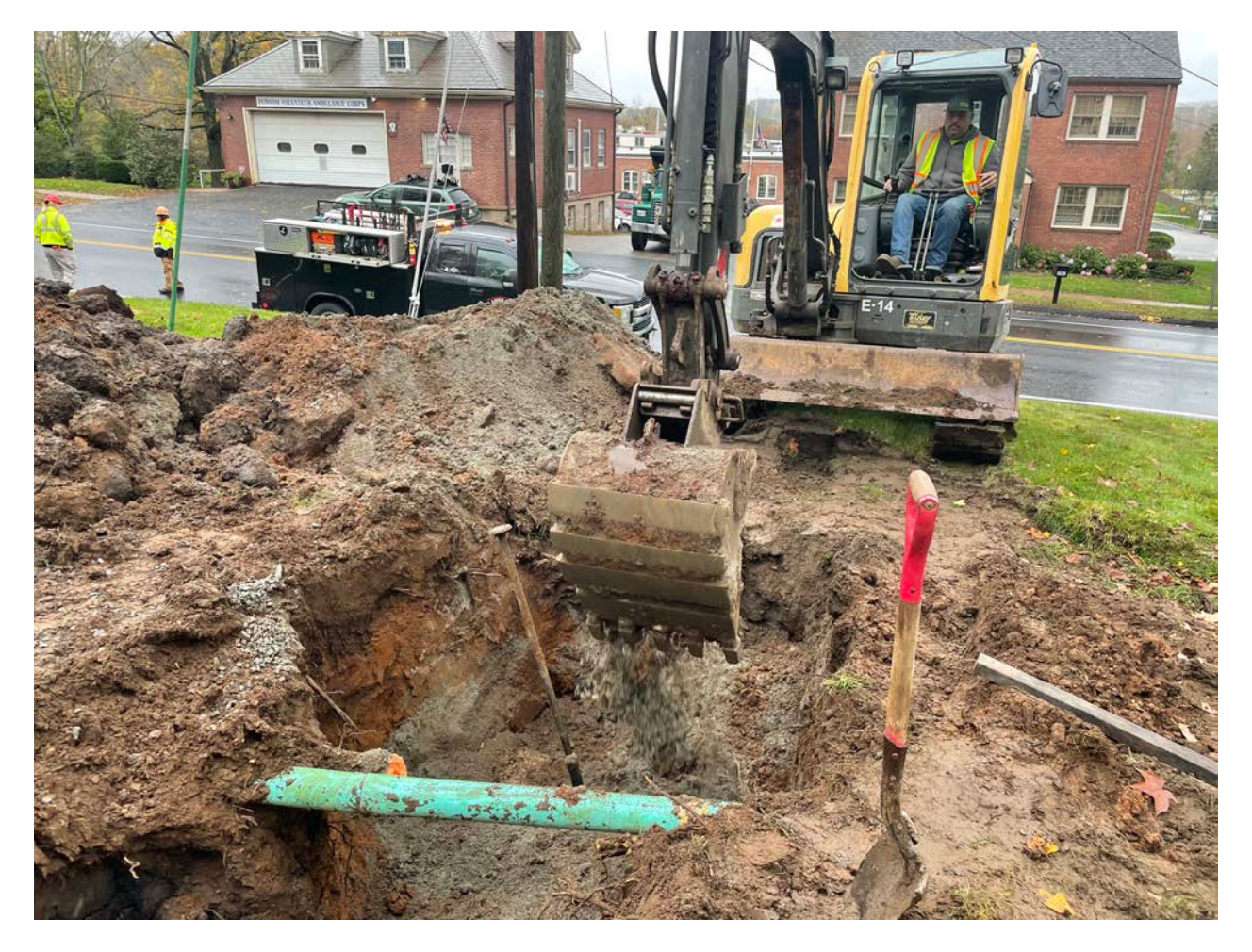
Picture 6: Ludlow placing sand over the 4" PVC sewer pipe that was placed as a sleeve over the 1" copper water service line they installed on the east side of the 202 Main Street residence. View to the west.