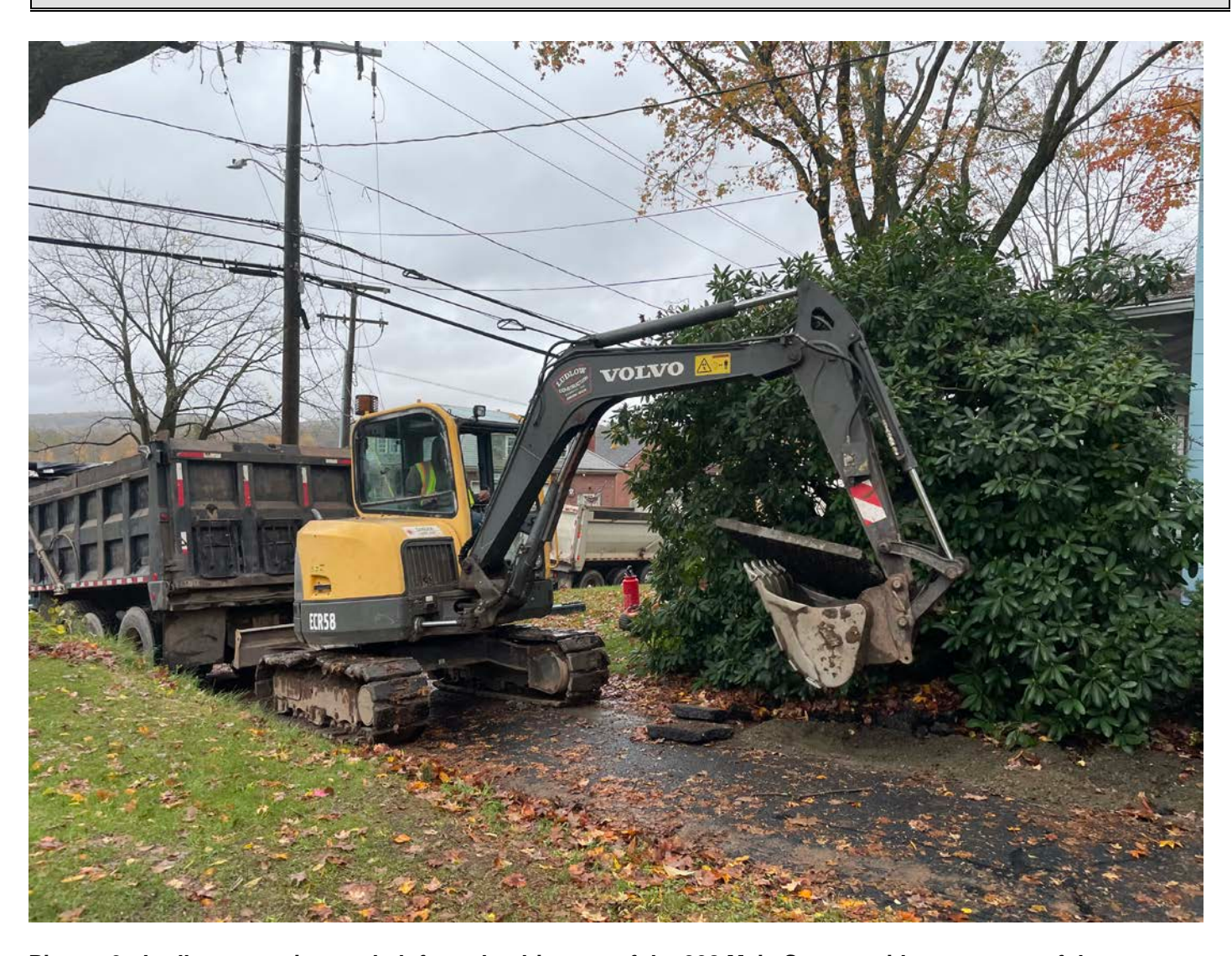
Picture 9: Ludlow removing asphalt from the driveway of the 208 Main Street residence as part of the installation of a 1" copper water service line. View to the southeast.

Contractor: Ludlow Construction Page: 12 of 14