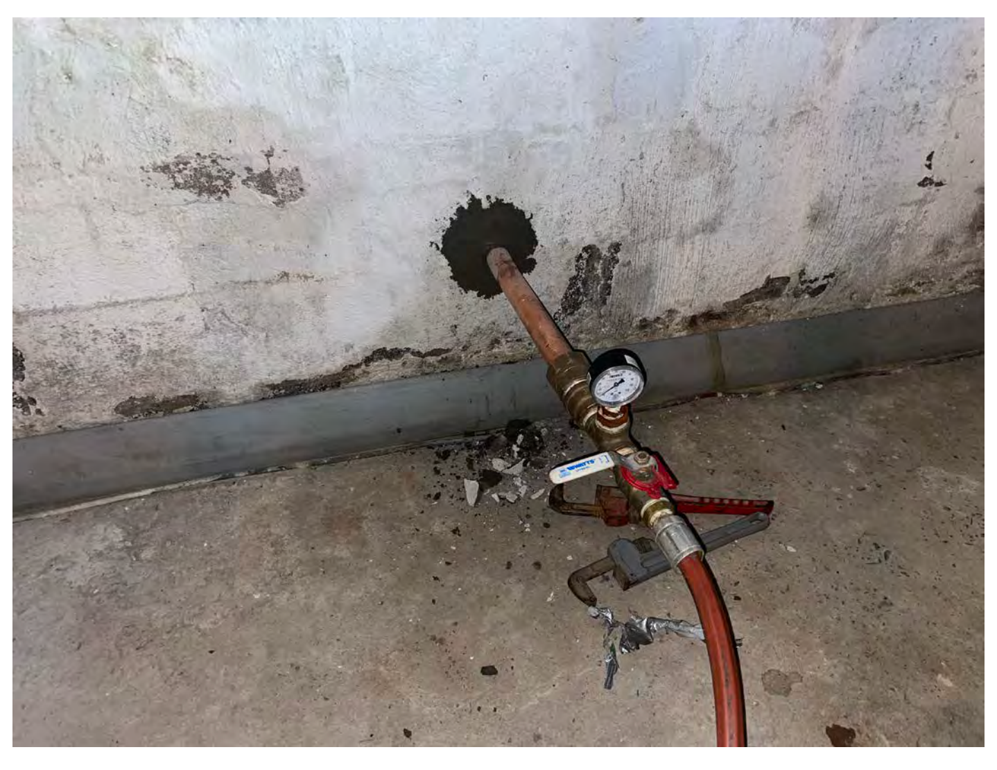
Picture 11: Pressure gauge that Ludlow placed on the 1.5" copper water service line they installed through the western foundation of the 175 Main Street residence. View to northwest.

Contractor: Ludlow Construction Page: 13 of 14