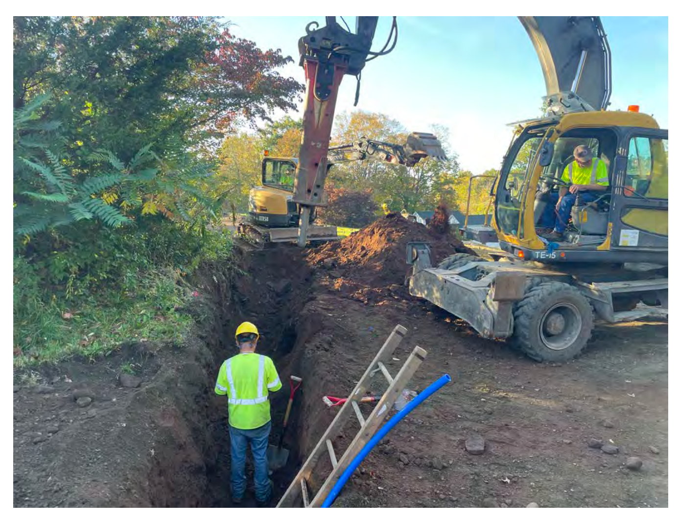
Picture 1: Ludlow preparing to hammer rock they encountered while excavating a trench for the installation of a 1.5" copper water service line at the 175 Main Street, Durham, property. View to the south.

Contractor: Ludlow Construction Page: 3 of 14