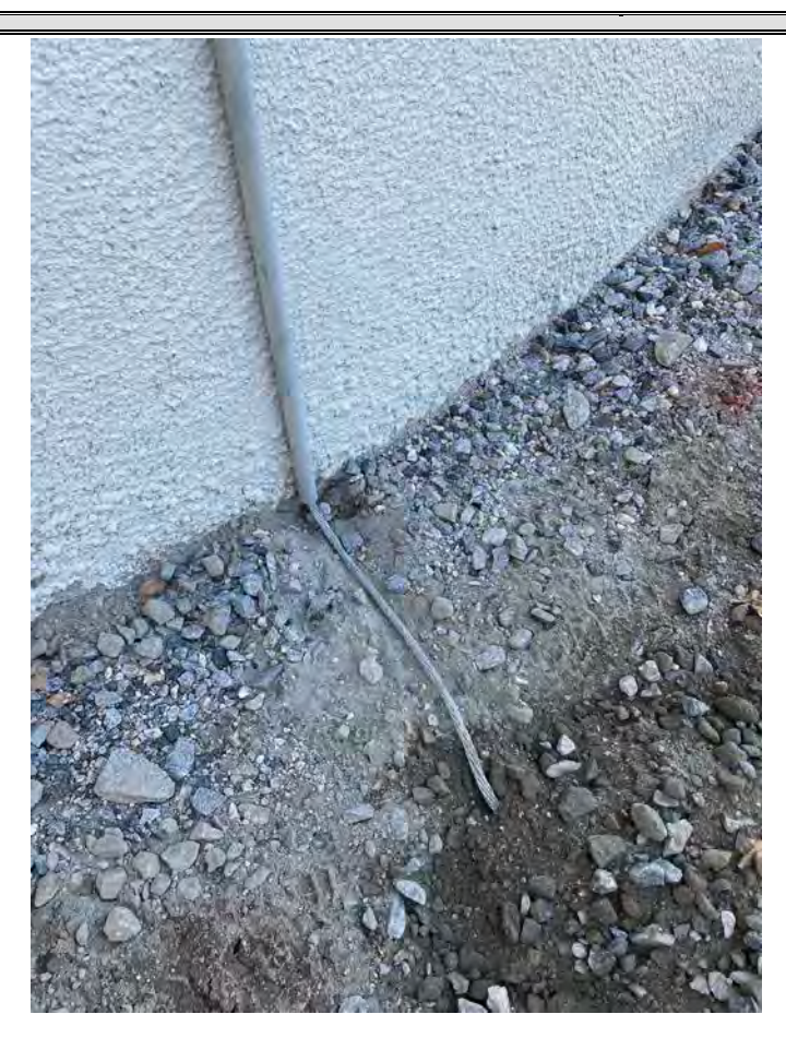
Picture 5: Grounding wire that B&B Lightening Protection installed on the side of the water tank and tied into the existing subsurface grounding wires around the perimeter of the tank. Water tank work zone located east of the Shared Access Driveway. View to south.

Project: Durham Meadows Pipeline Installation Date: October 22, 2021 Friday Day of Week: Location: Main Street, Durham; Shared Access Driveway, Middletown Report No: Project #: AECOM: 6061487 349 Page: 7 of 14 Contractor: Ludlow Construction