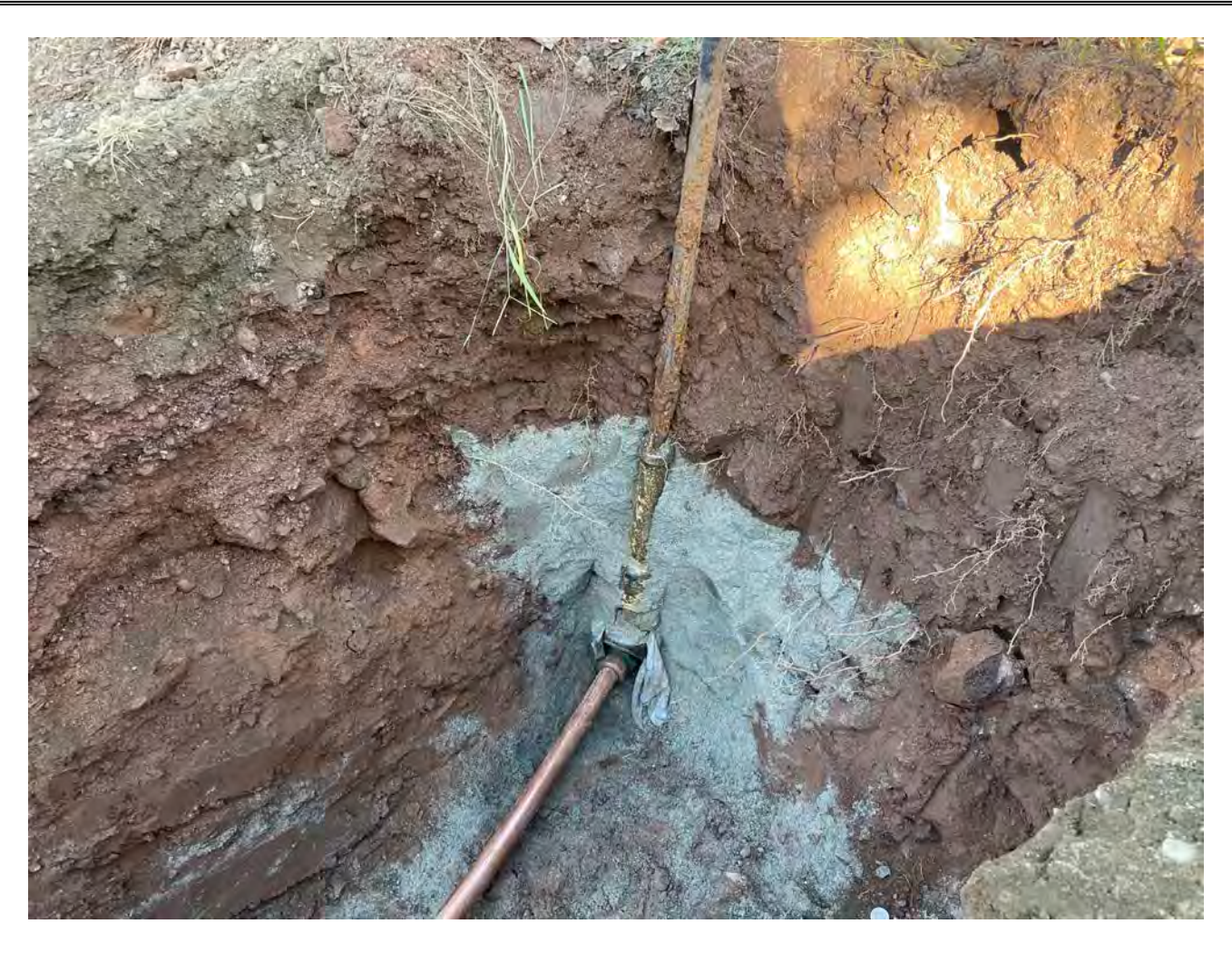
Picture 3: Curb stop that Ludlow installed at the 175 Main Street property, with 1.5" copper pipe installed on the south side of the curb stop. View to the northwest.

Contractor: Ludlow Construction Page: 5 of 14