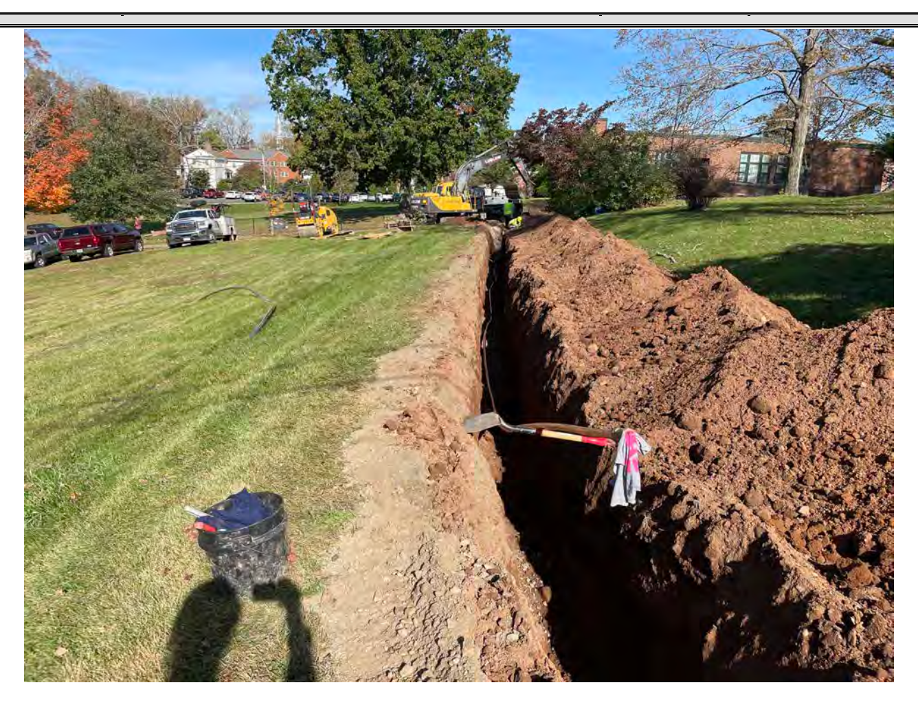
Picture 8: Ludlow in the process of installing a 1.5" copper water service line for the 175 Main Street residence. View to the north.