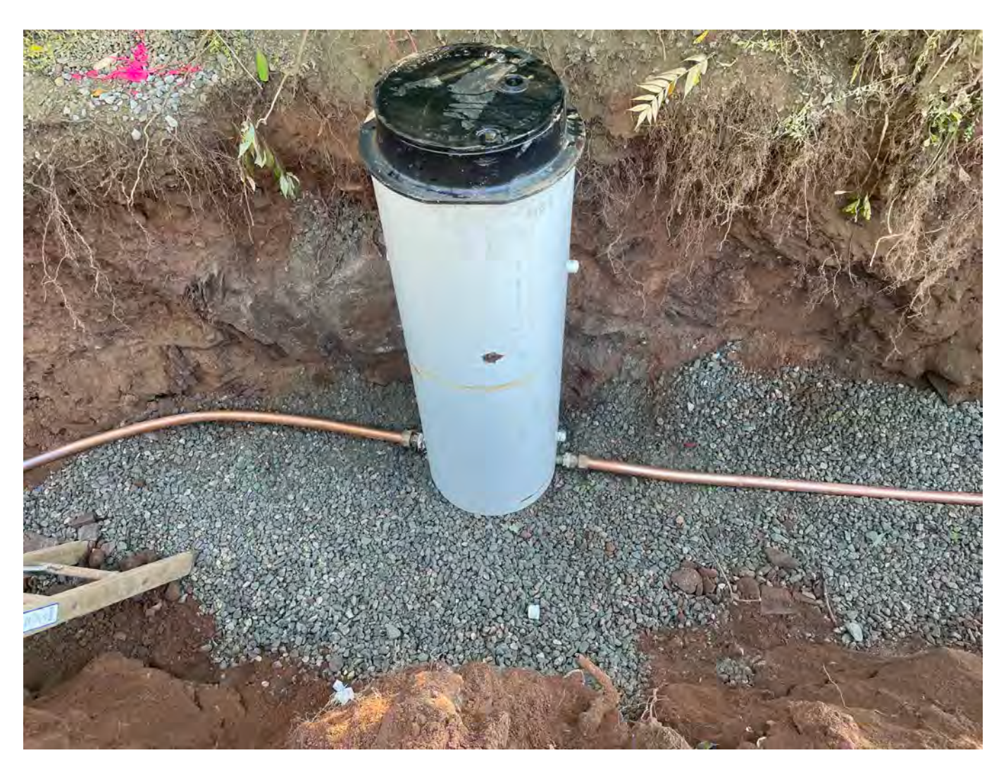
Picture 2: Meter pit that Ludlow installed at the 175 Main Street property, with 1.5" copper pipe installed on the north and south sides of the PVC riser. View to the east.

Contractor: Ludlow Construction Page: 4 of 14