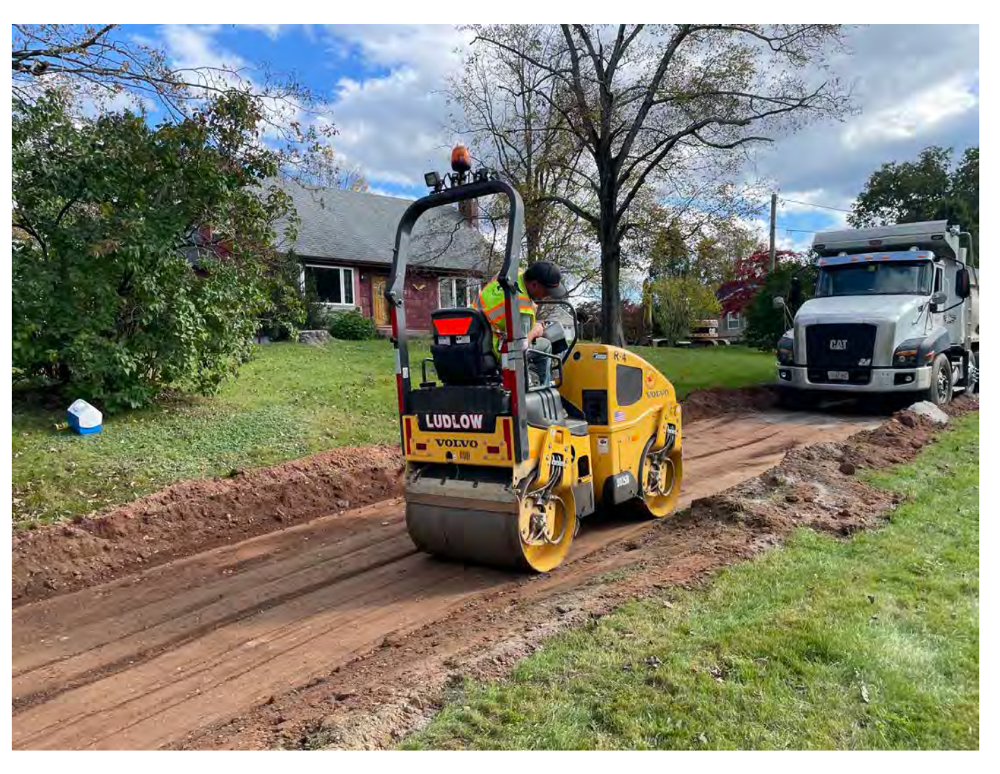
Picture 12: Ludlow compacting gravel they replaced on the driveway for the 175 Main Street property. View to southeast.

Contractor: Ludlow Construction Page: 14 of 14