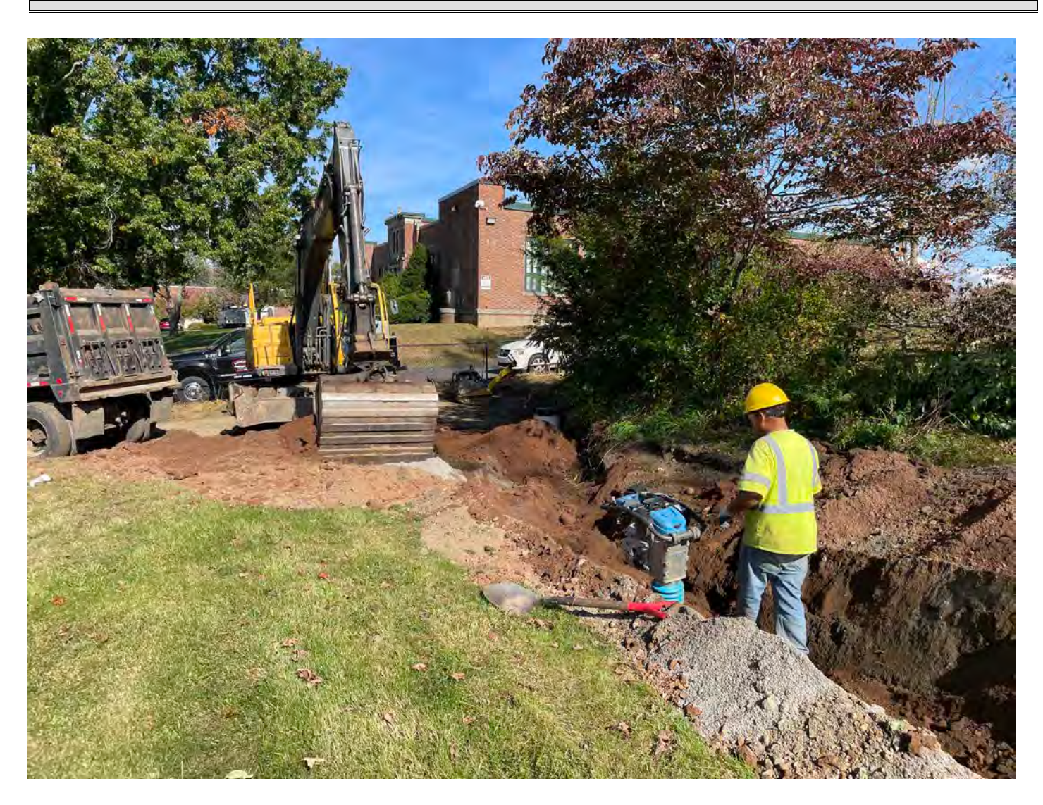
Picture 10: Ludlow compacting fill with a jumping jack they just placed over sand and caution tape as they backfill the trench where they installed a 1.5" copper water service line at the 175 Main Street property. View to northeast.

Contractor: Ludlow Construction Page: 12 of 14