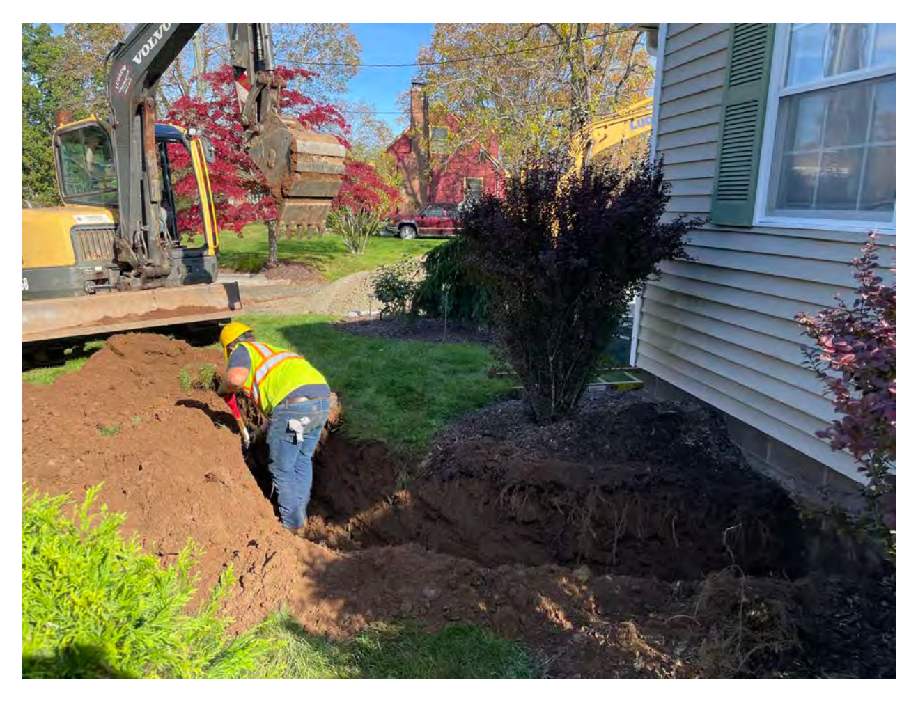
Picture 6: Ludlow excavating a trench northward for the installation of a 1.5" copper water service line at the 175 Main Street property. View to the north.