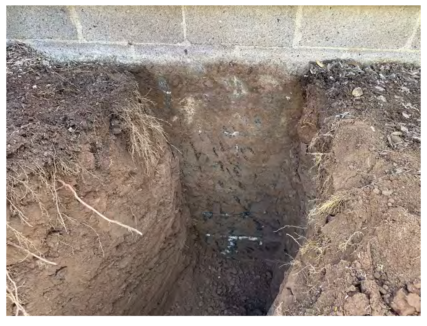
Picture 7: Cinder block foundation of the 175 Main Street residence that Ludlow daylighted on the west side of the house. View to the east.

Contractor: Ludlow Construction Page: 9 of 14