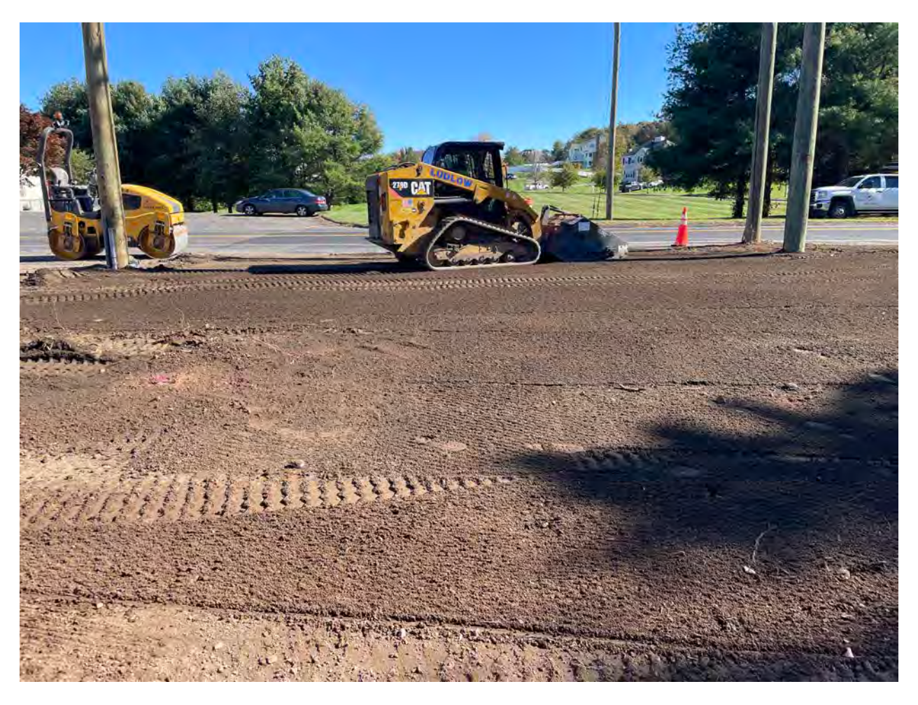
Picture 6: Ludlow sifting loam with a rockhound to the east of the booster station. View to east.