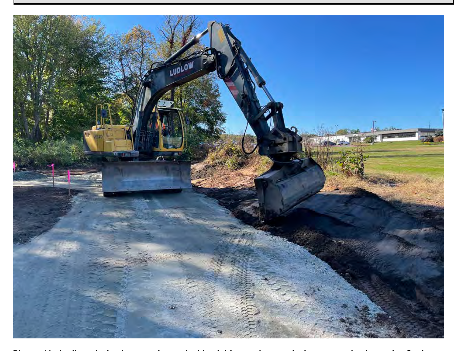
Picture 10: Ludlow placing loam on the north side of driveway base at the booster station located at Station 750+63. View to the west.