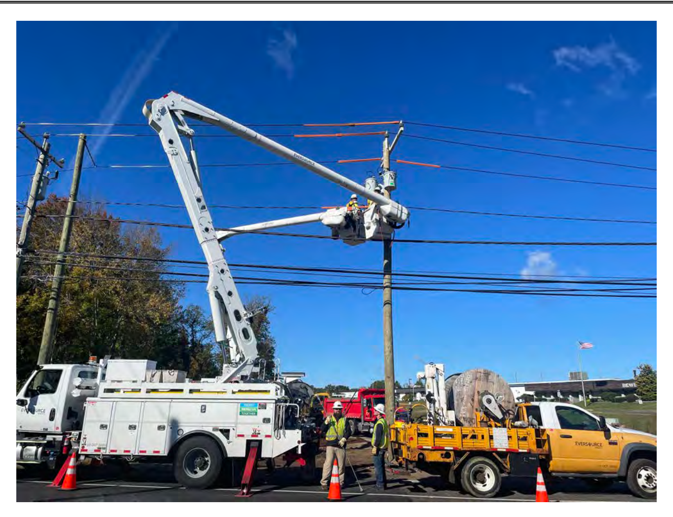
Picture 3: Eversource installing a transformer on one of the two new poles that Frontier installed next to the booster station. View to the west.