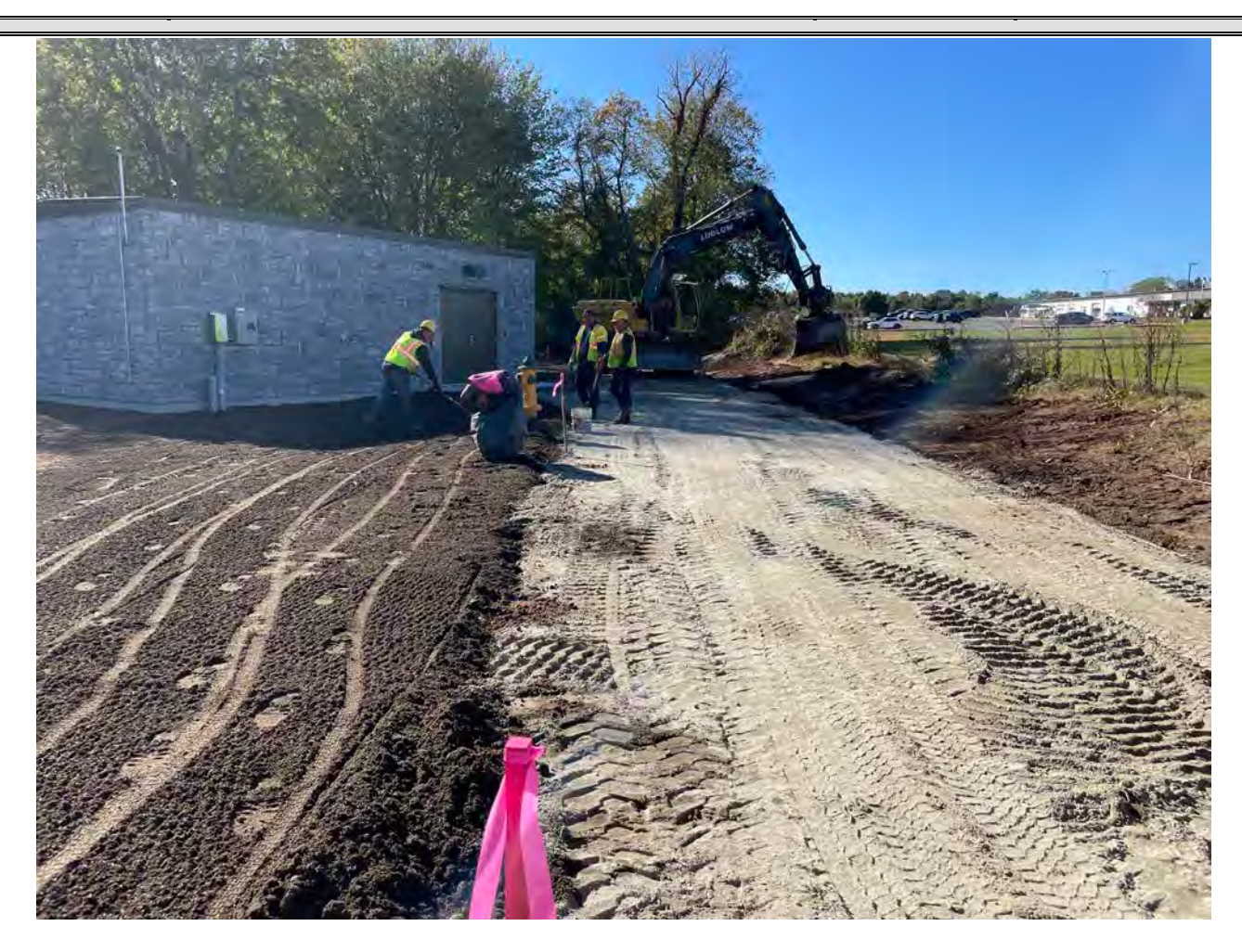
Picture 8: The north side of the booster station where Ludlow has placed and seeded loam on either side of the driveway base they constructed of compacted 1.25"-minus gravel. View to the west.