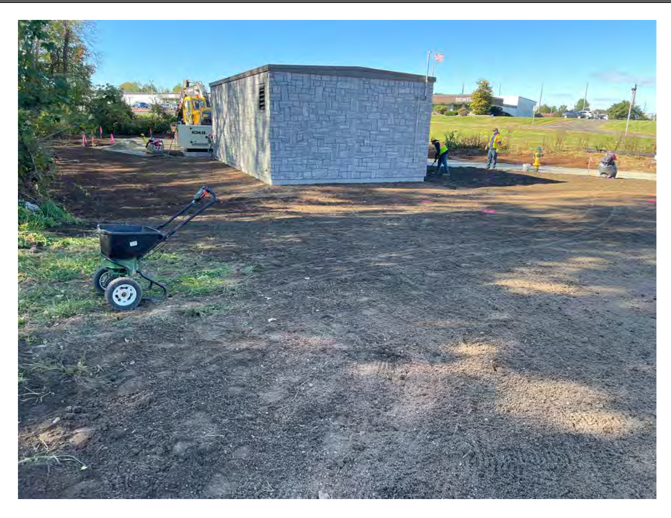
Picture 7: The booster station after Ludlow has placed and seeded loam. View to northwest.