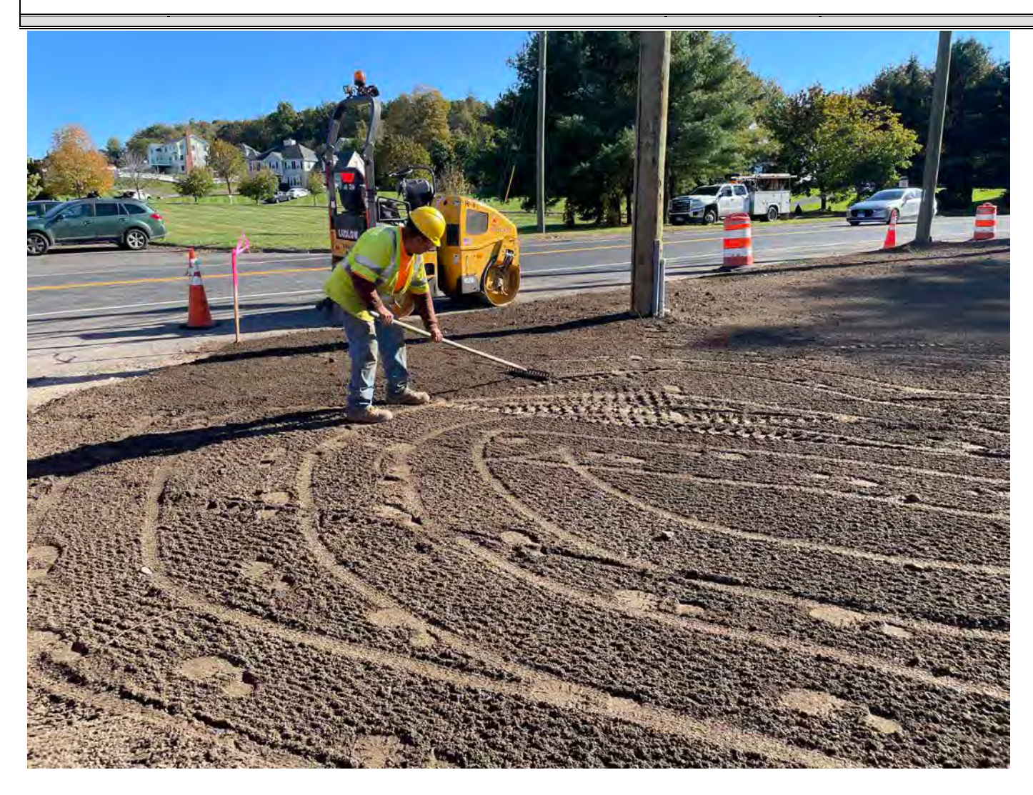
Picture 9: Ludlow raking grass seed into freshly placed loam to the northeast of the booster station. View to southwest.