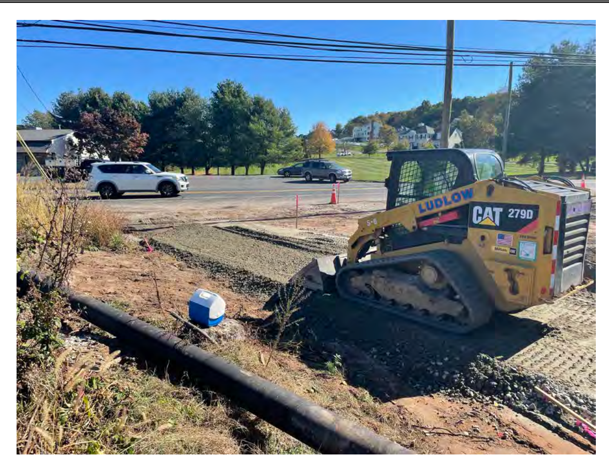
Picture 5: Ludlow placing 1.25"-minus gravel to the northeast of the booster station, building up the base for the driveway that Ludlow will be installing. View to southeast.