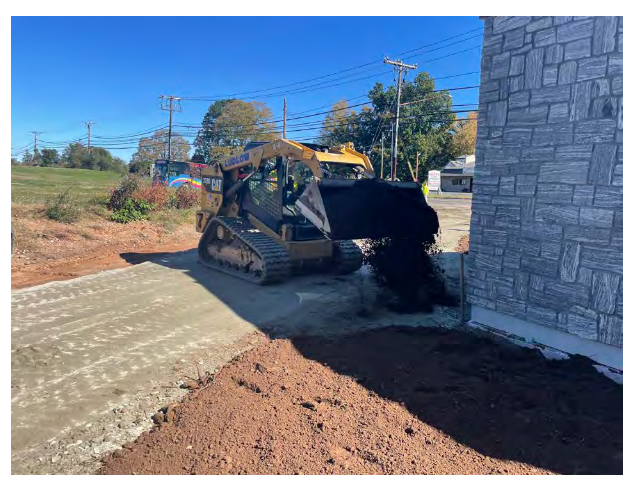
Picture 4: Ludlow placing loam on the northwest corner of the booster station. View to the northeast.

Contractor: Ludlow Construction Page: 7 of 13