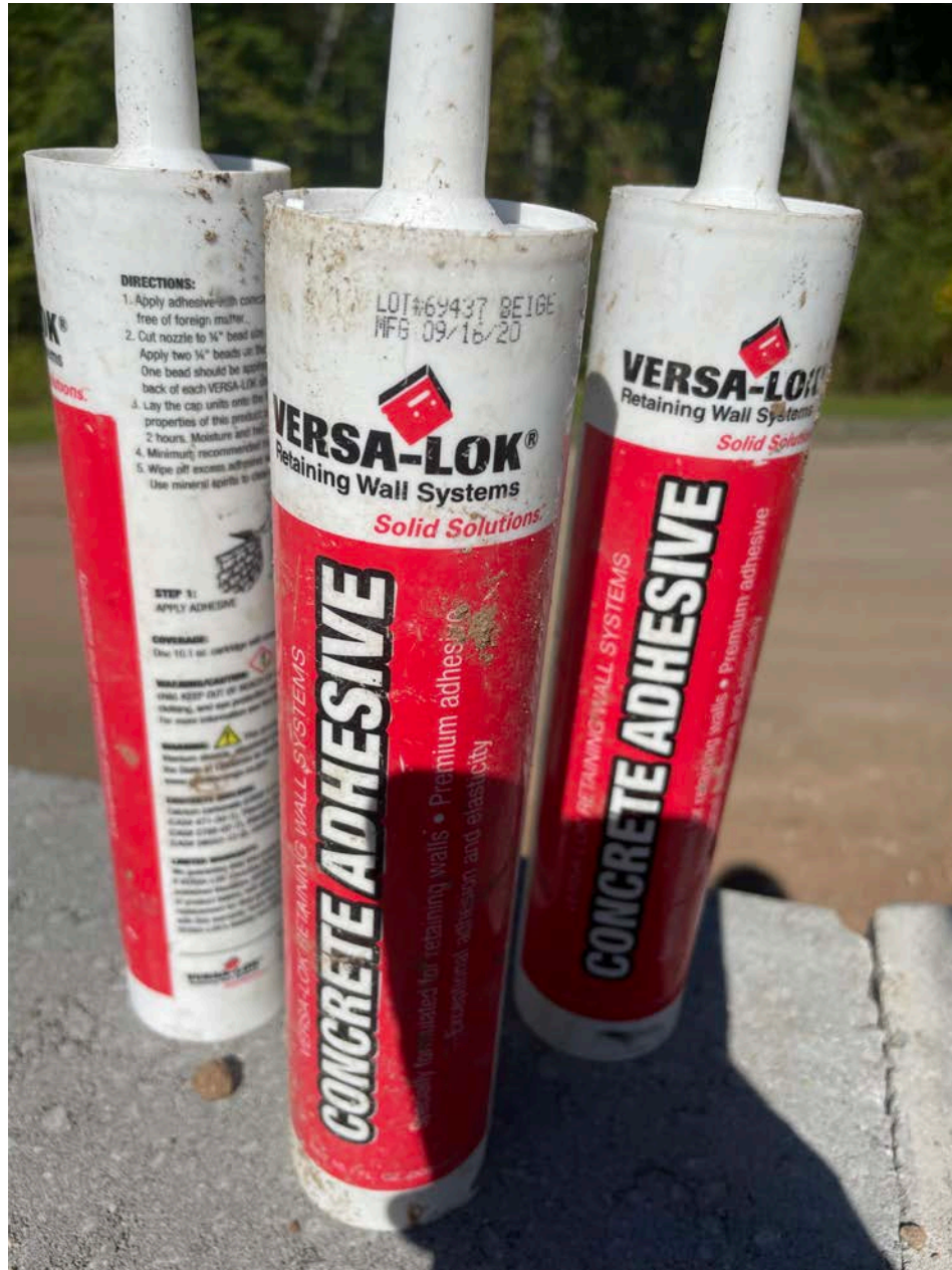
Picture 9: Concrete adhesive that Ludlow used to secure capstones on the top of the retaining wall located between Stations 10+83 and 11+34.