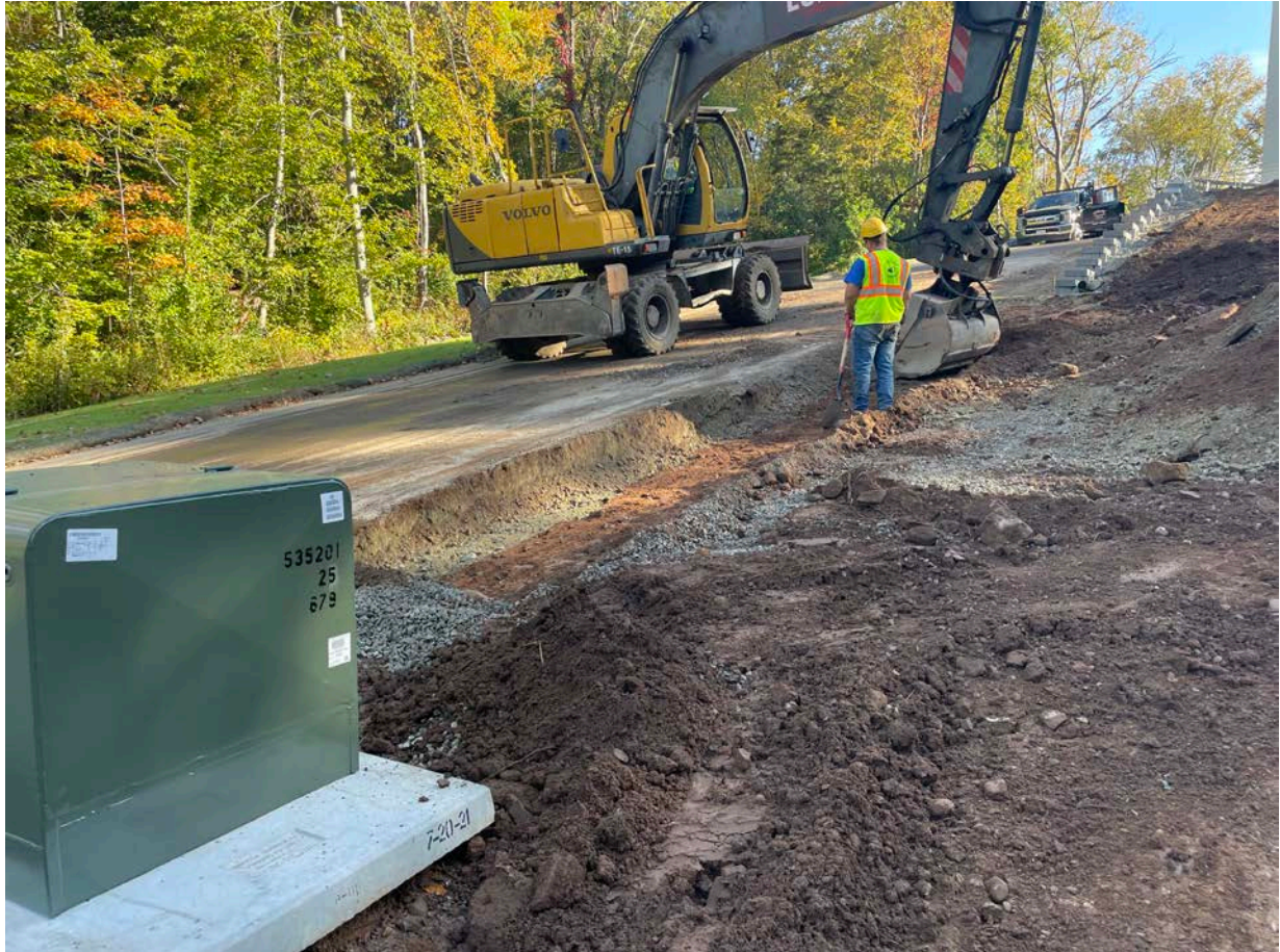
Picture 4: Ludlow excavating footprint for a pull-off located between Stations 11+43 and 11+78 on the south side of the Shared Access Road in Middletown. View to the northeast.