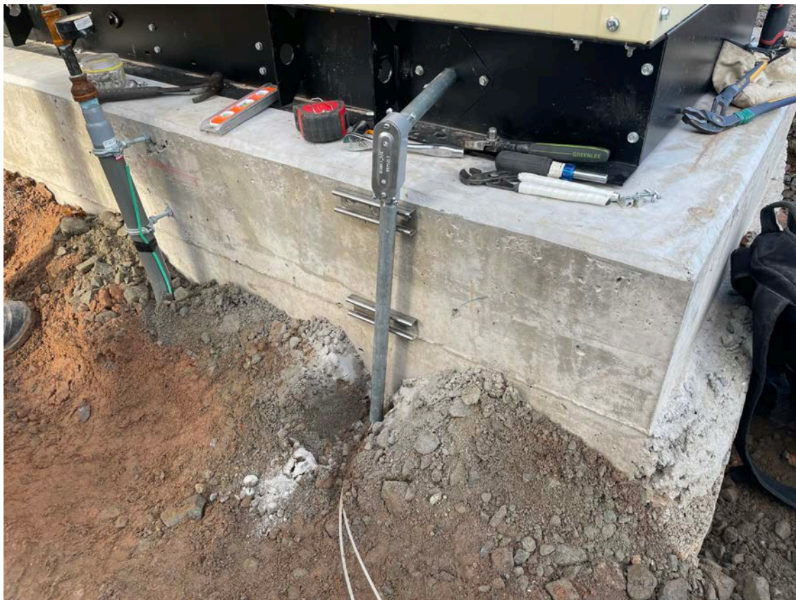
Picture 2: east side of the generator located at the southwest corner of the booster station where A&R Electrical installed conduit for the grounding wires they recently installed. View to west.