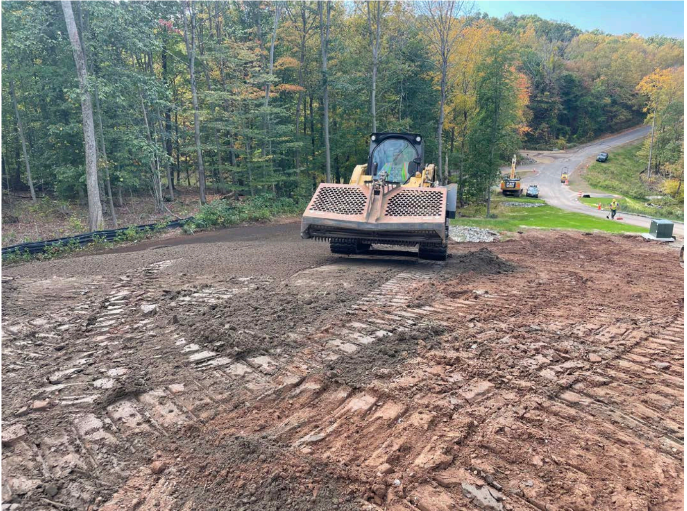
Picture 10: Ludlow using a rock hound on the loam that has been placed on the west side of the altitude vault. View to the west.