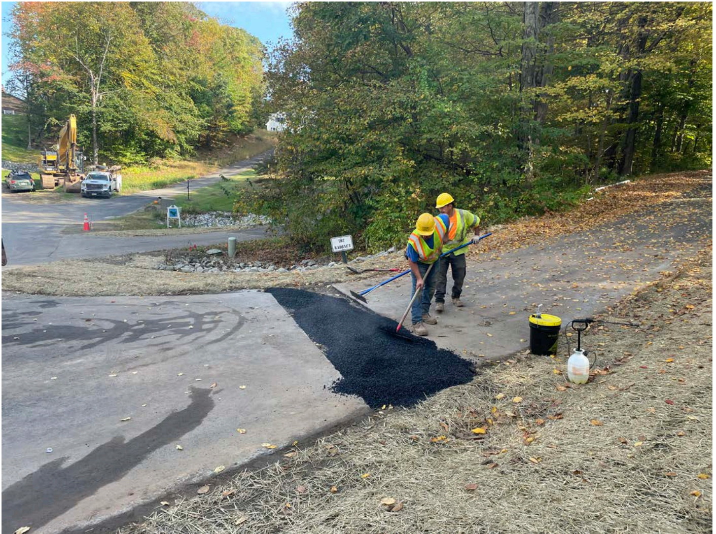
Picture 11: Ludlow raking out asphalt that placed on the trench footprint at the driveway for the 224 Talcott Ridge Drive residence. View to the east.