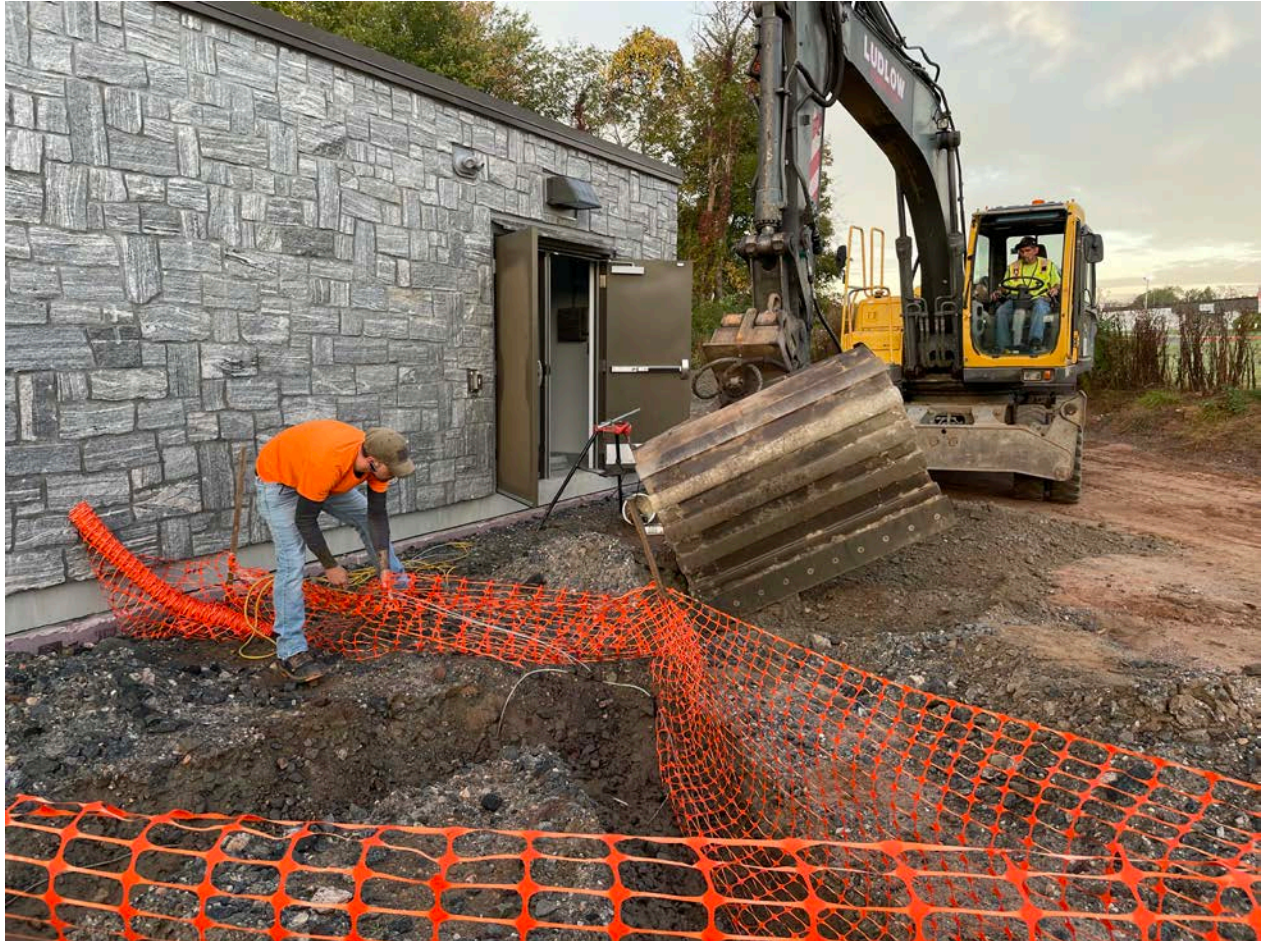
Picture 1: Ludlow assisting A&R Electrical in burying newly installed grounding wires on the north side of the booster station located at Station 750+63 on S. Main Street, Middletown. View to the west.