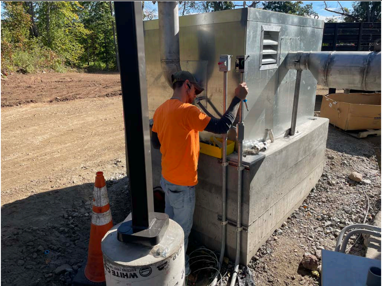
Picture 7: A&R Electrical installing utility conduit on the northwest side of the blower enclosure located on the northeast side of the water tank. View to southeast.