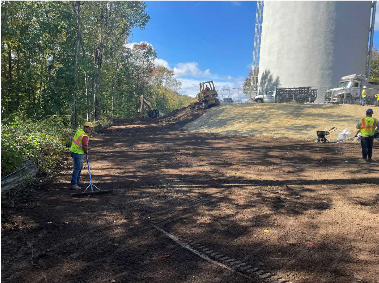
Picture 7: Ludlow raking and seeding loam southeast of the water tank located to the east of the Shared Access Road. View to west.