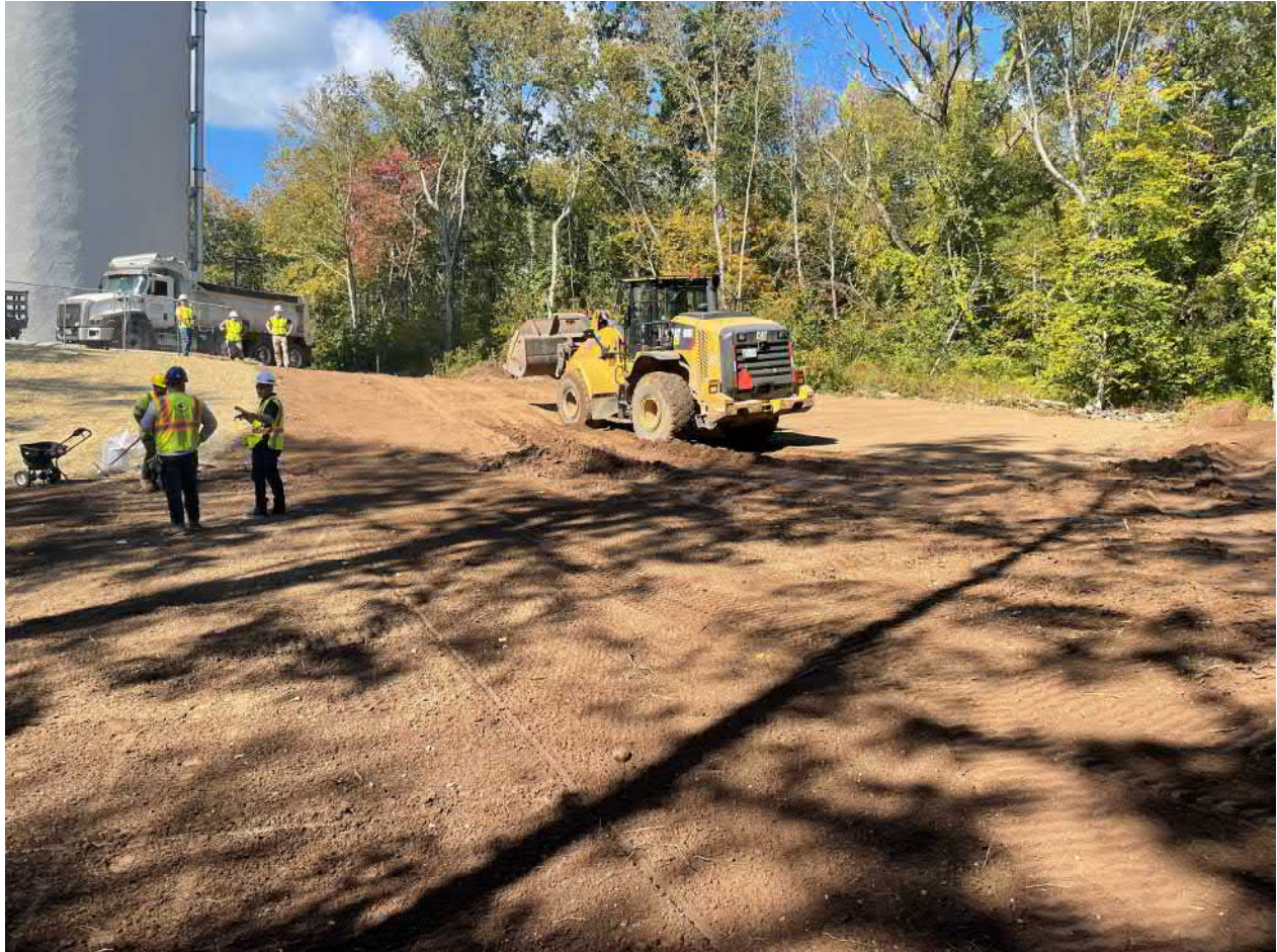
Picture 6: Ludlow grading loam on the slope located to the east of the water tank located to the east of the Shared Access Road. View to northwest.