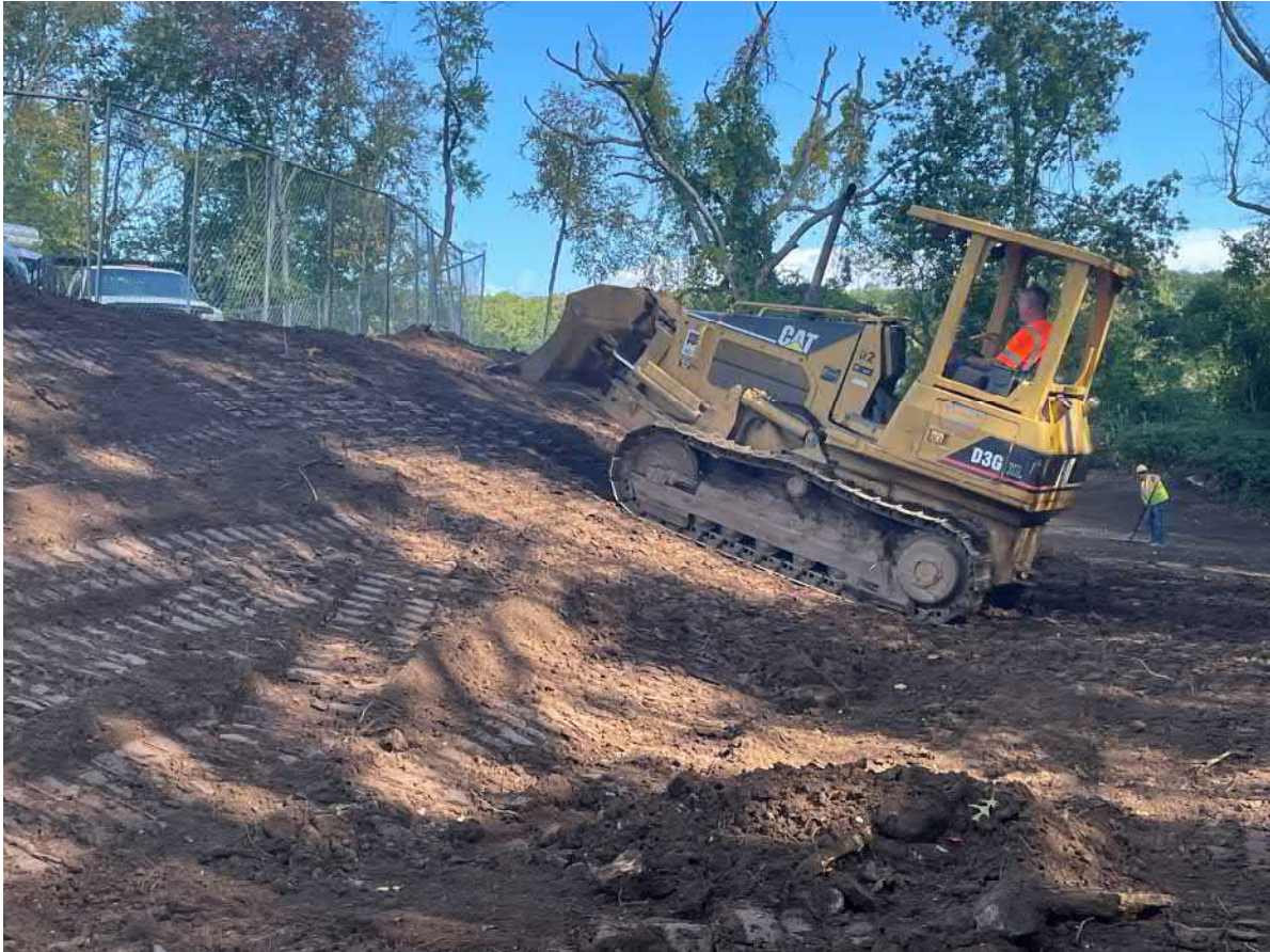
Picture 5: Ludlow grading loam on the slope located to the south of the water tank located to the east of the Shared Access Road. View to east.