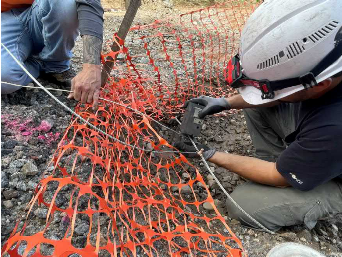
Picture 8: A&R Electrical preparing to cadweld ground wires at the booster station located at Station 750+63.