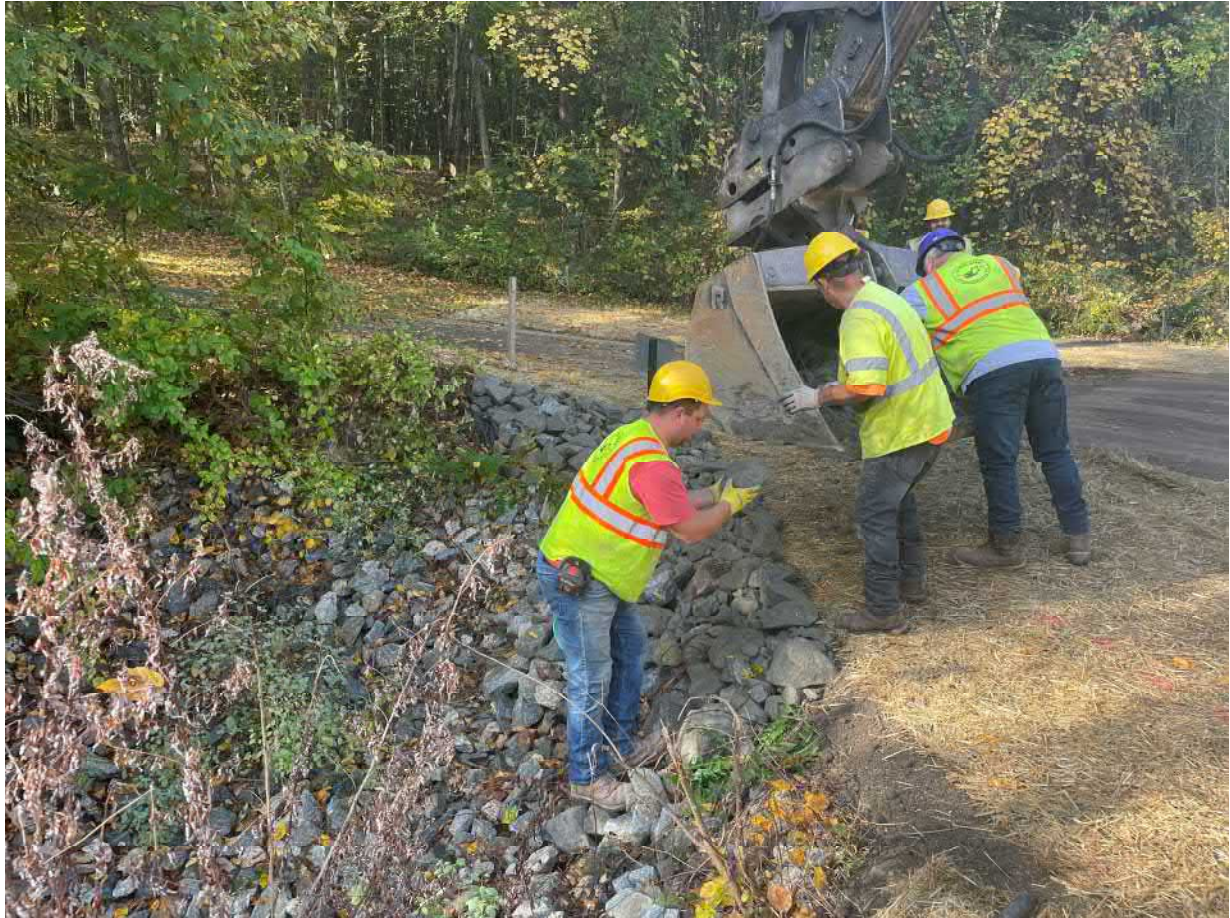
Picture 4: Ludlow placing rock on the plunge bowl located on the east side of the driveway for the 224 Talcott Ridge Drive property. View to the southwest.