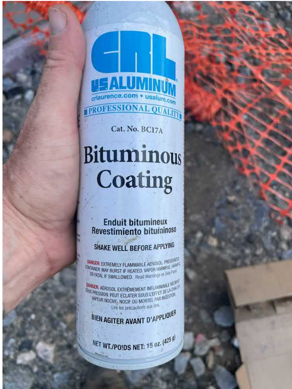
Picture 9: Bituminous coating that A&R Electrical applied to the cadwelded union of grounding wires at the booster station.