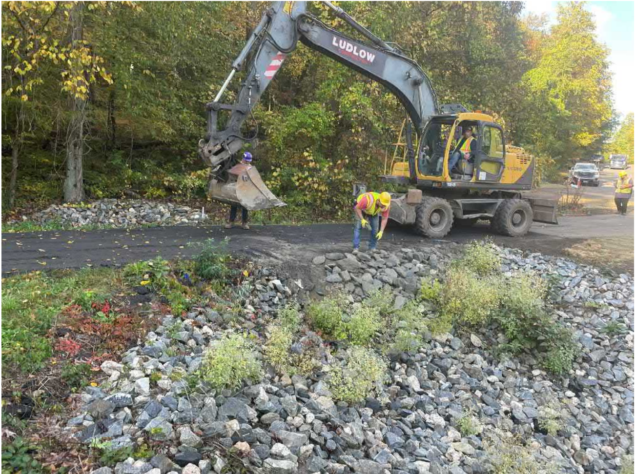
Picture 3: Ludlow placing rock on the plunge bowl located on the northeast side of the driveway for the 216 Talcott Ridge Drive property. View to the southwest.