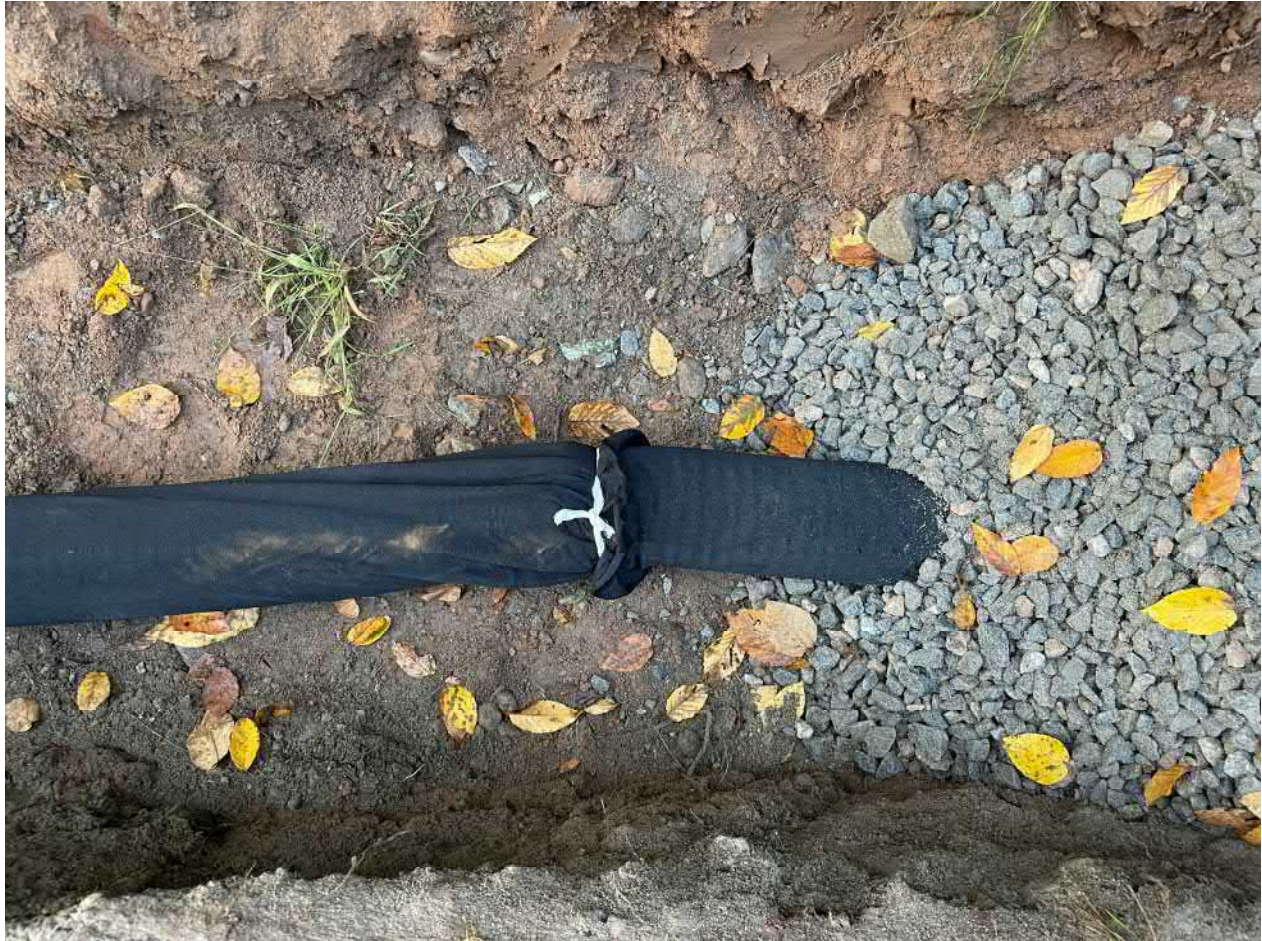
Picture 1: Union of two sections of 4" plastic drainage pipe that were joined together at Station 18+15 on the Shared Access Road.