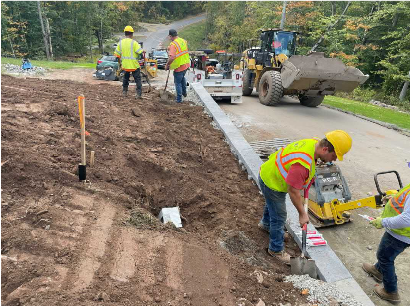
Picture 10: Ludlow placing fill over the ¾" stone that they placed on the south side of the retaining wall located between Stations 10+83 and 11+34. View to the west.