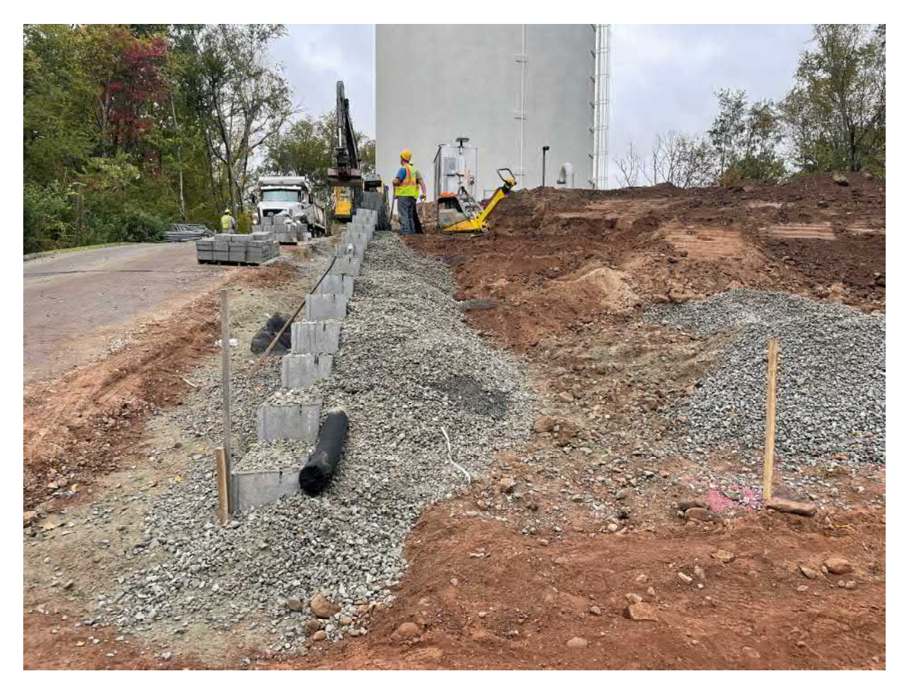
Picture 4: Ludlow 4" drainage pipe after Ludlow placed ¾" stone over it on the south side of the retaining wall located between Stations 10+83 and 11+34. View to the east.