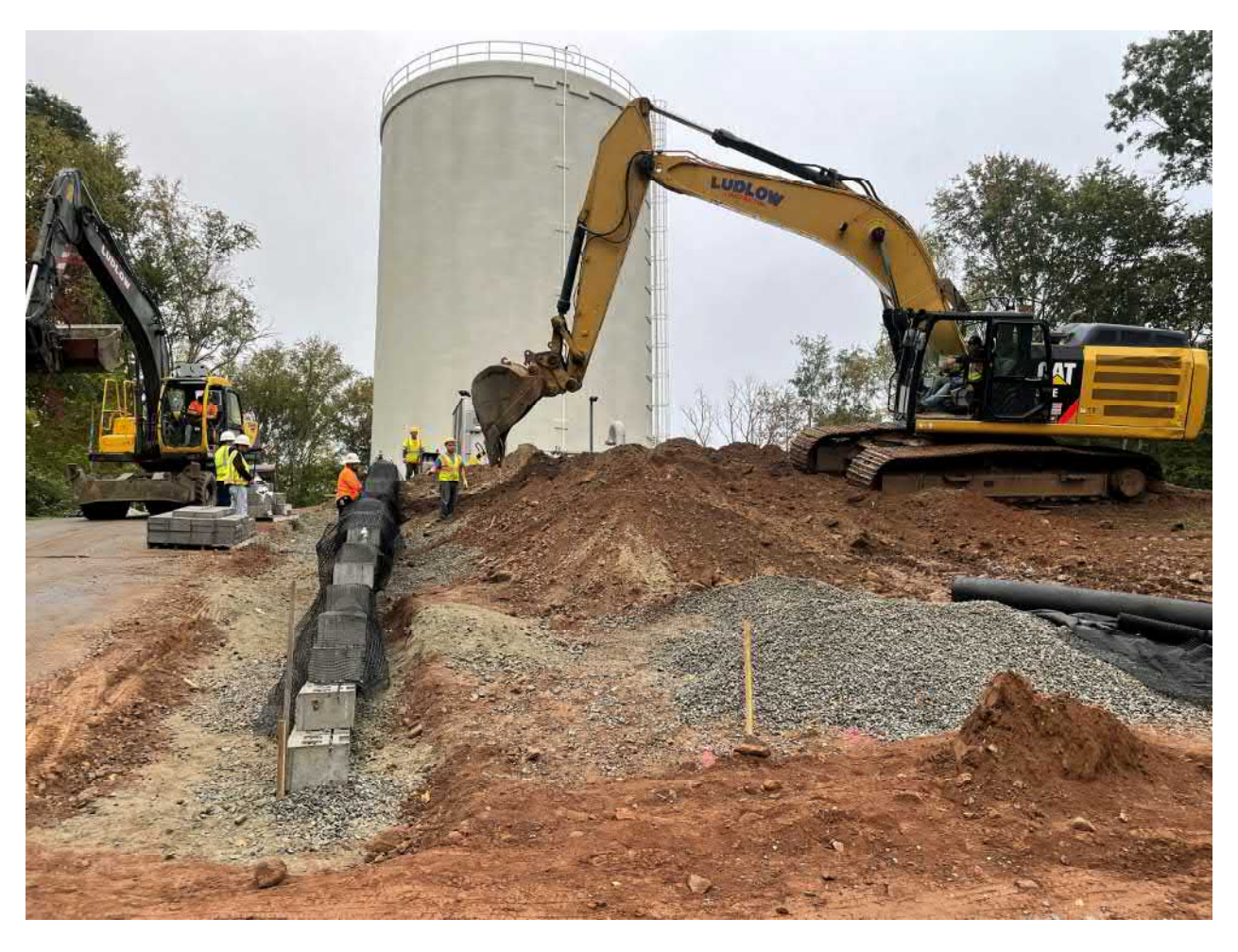
Picture 1: Ludlow pulling back fill on the south side of the retaining wall located between Stations 10+83 and 11+34 in order to place \frac{3}{4} " stone and a 4" drain pipe. View to east.