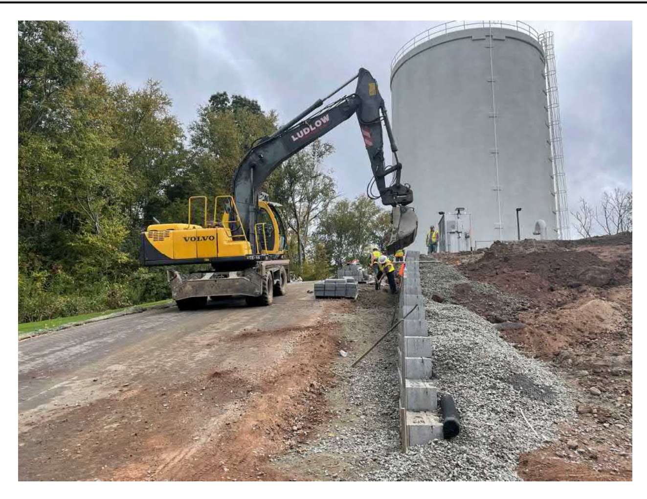
Picture 6: Ludlow placing 1.5"-minus gravel on the north side of the retaining wall located between Stations 10+83 and 11+34. View to the east.