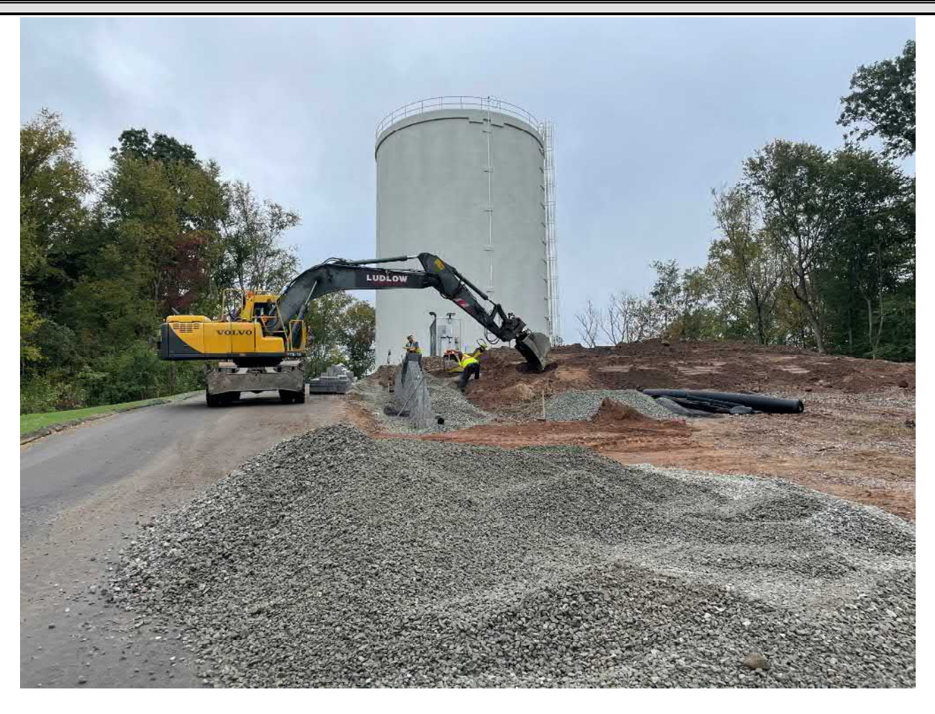
Picture 3: Ludlow placing \frac{3}{4} " stone over the \frac{4}{9} " drainage pipe they just installed on the south side of the retaining wall located between Stations 10+83 and 11+34. View to the east.