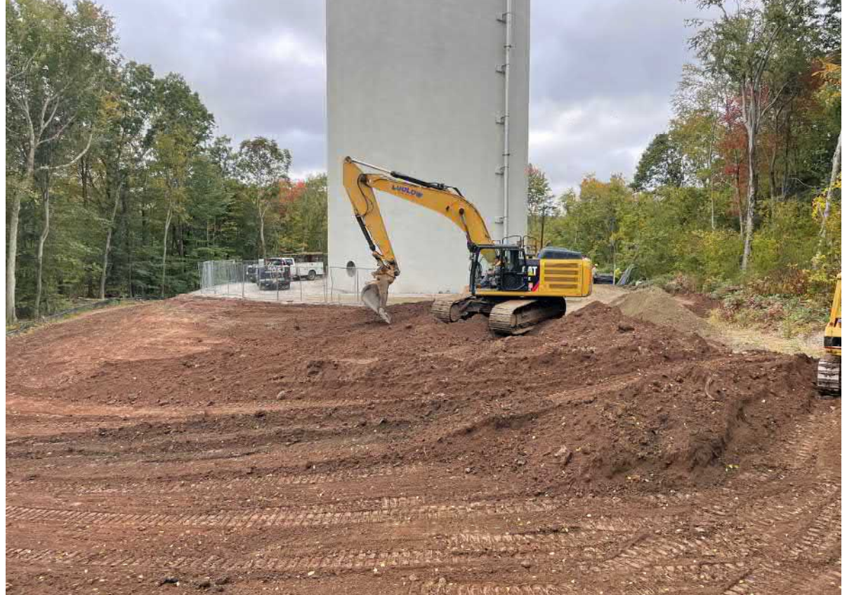
Picture 5: Ludlow performing earth work on the east side of the water tank, shaping the slope. View to the west.

7 of 12 Page: Contractor: Ludlow Construction