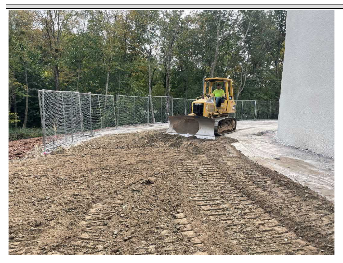
Picture 10: Ludlow grading 1.5"-minus gravel on the southeast side of the water tank. View to the southwest.