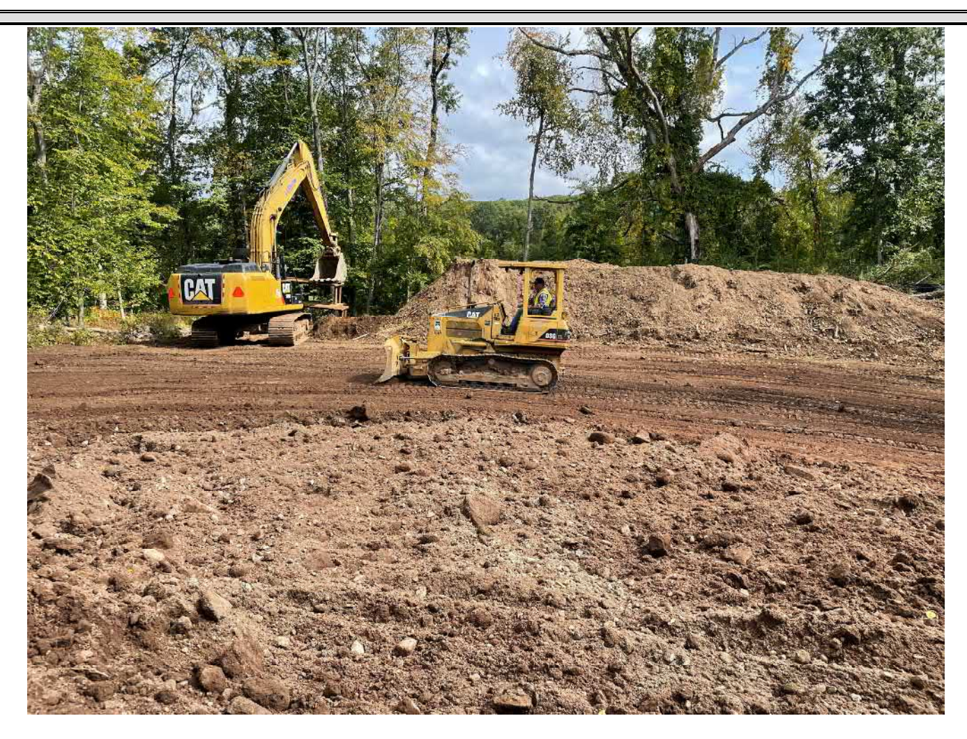
Picture 7: Picture 5: Ludlow performing earth work on the east side of the water tank, shaping the area just east of the toe of the slope. View to the east.