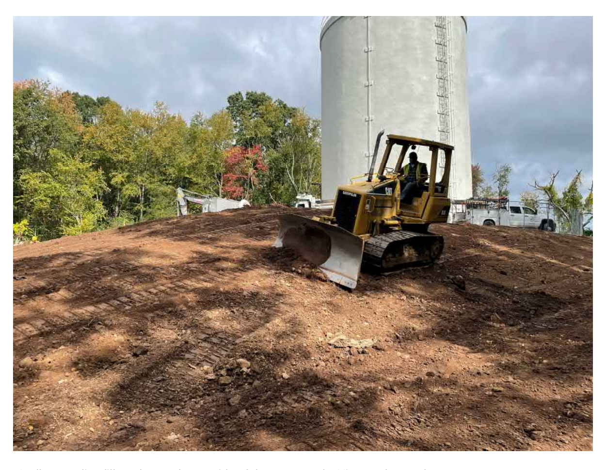
Picture 9: Ludlow grading fill on the southwest side of the water tank. View to the northeast.