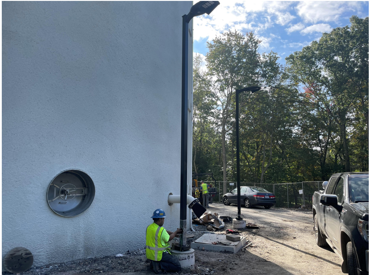
Picture 5: A&R Electrical wiring a light pole they just installed on the west side of the water tank. View to the southeast.