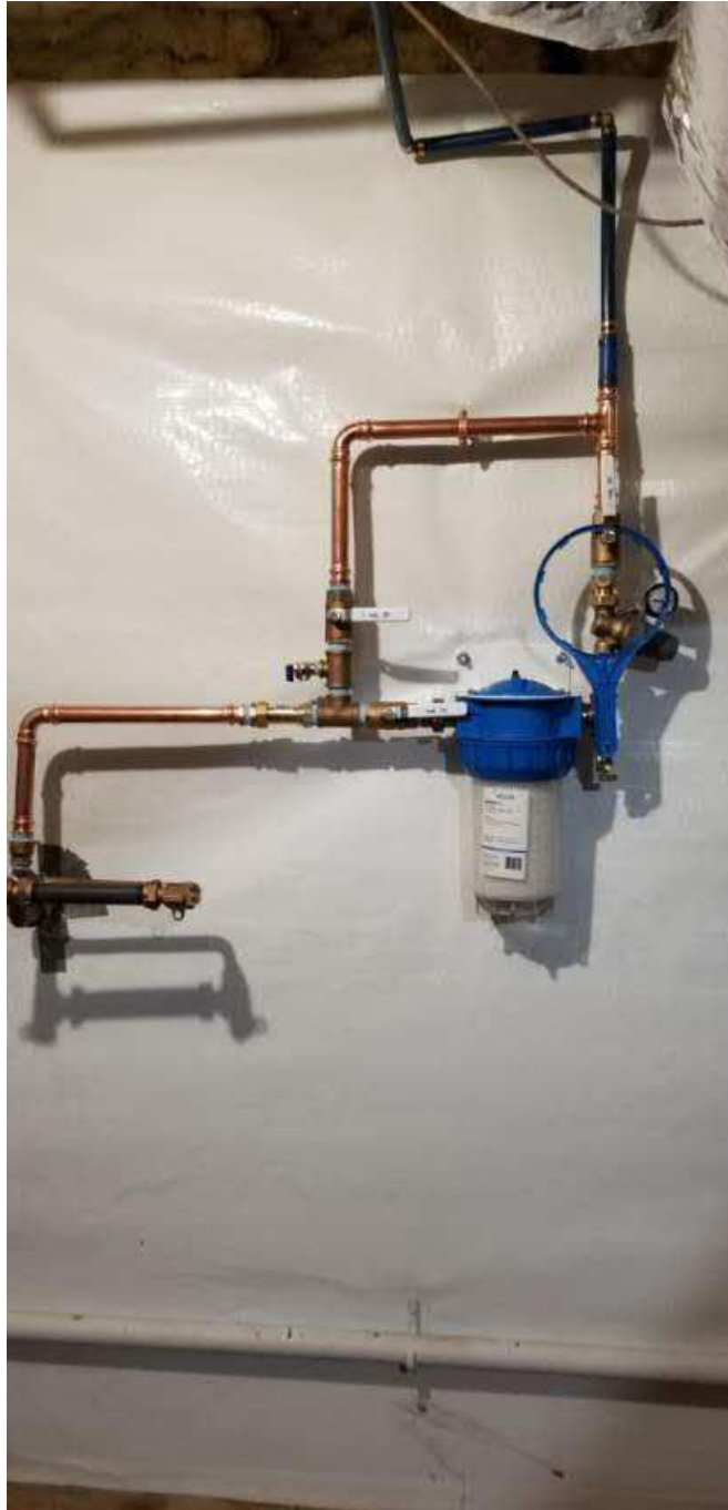
Picture 12: Final water service components that Fazzino Plumbing installed at the 35 Maiden Lane, Durham, residence.