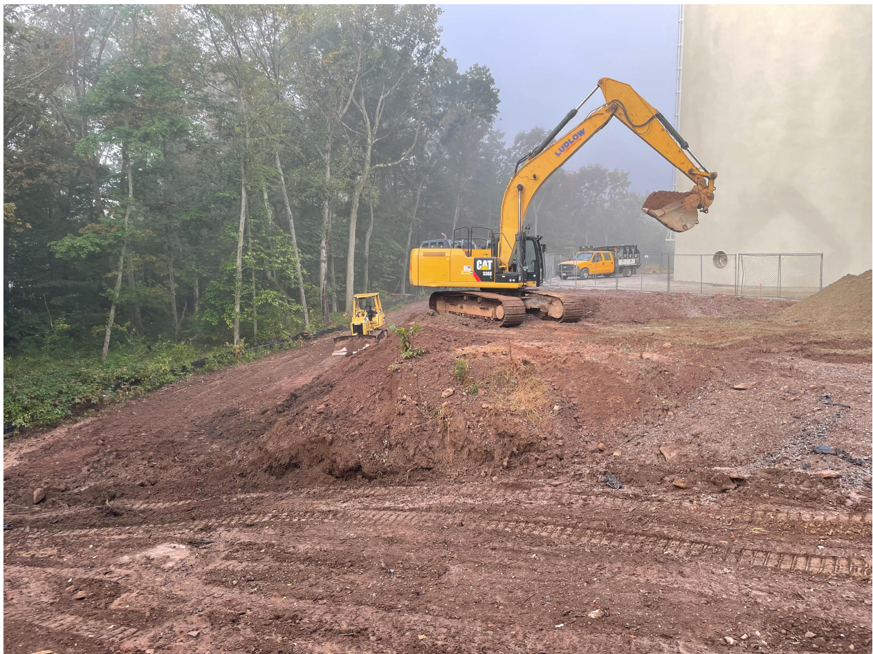
Picture 1: Ludlow shaping the slope to the southeast of the water tank located east of the Shared Access Road in Middletown. View to west.

1338: Fazzino Plumbing just finished with the installation of a 1" copper water service line at the 35 Maiden Lane residence.