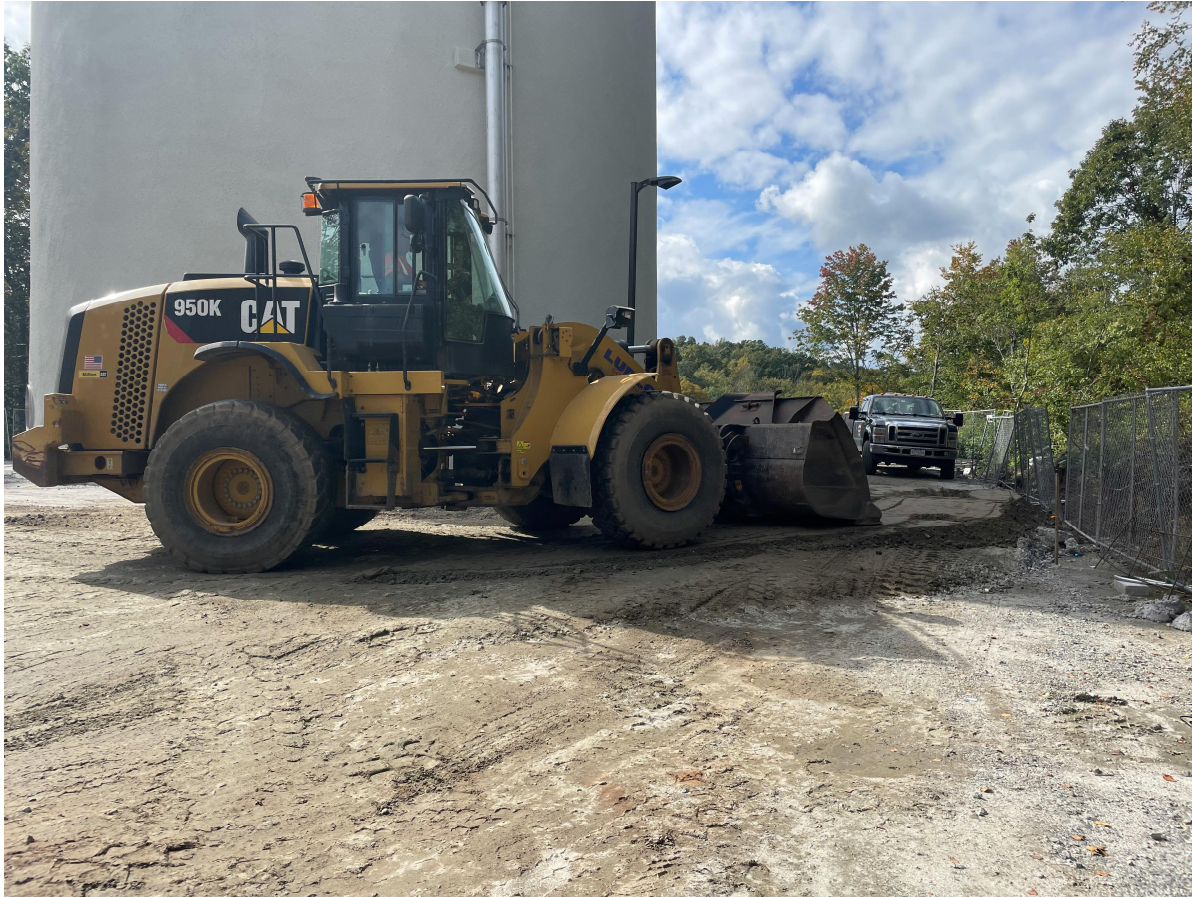
Picture 10: Ludlow grading 1.5'-minus gravel on the northeast side of the water tank. View to the west.