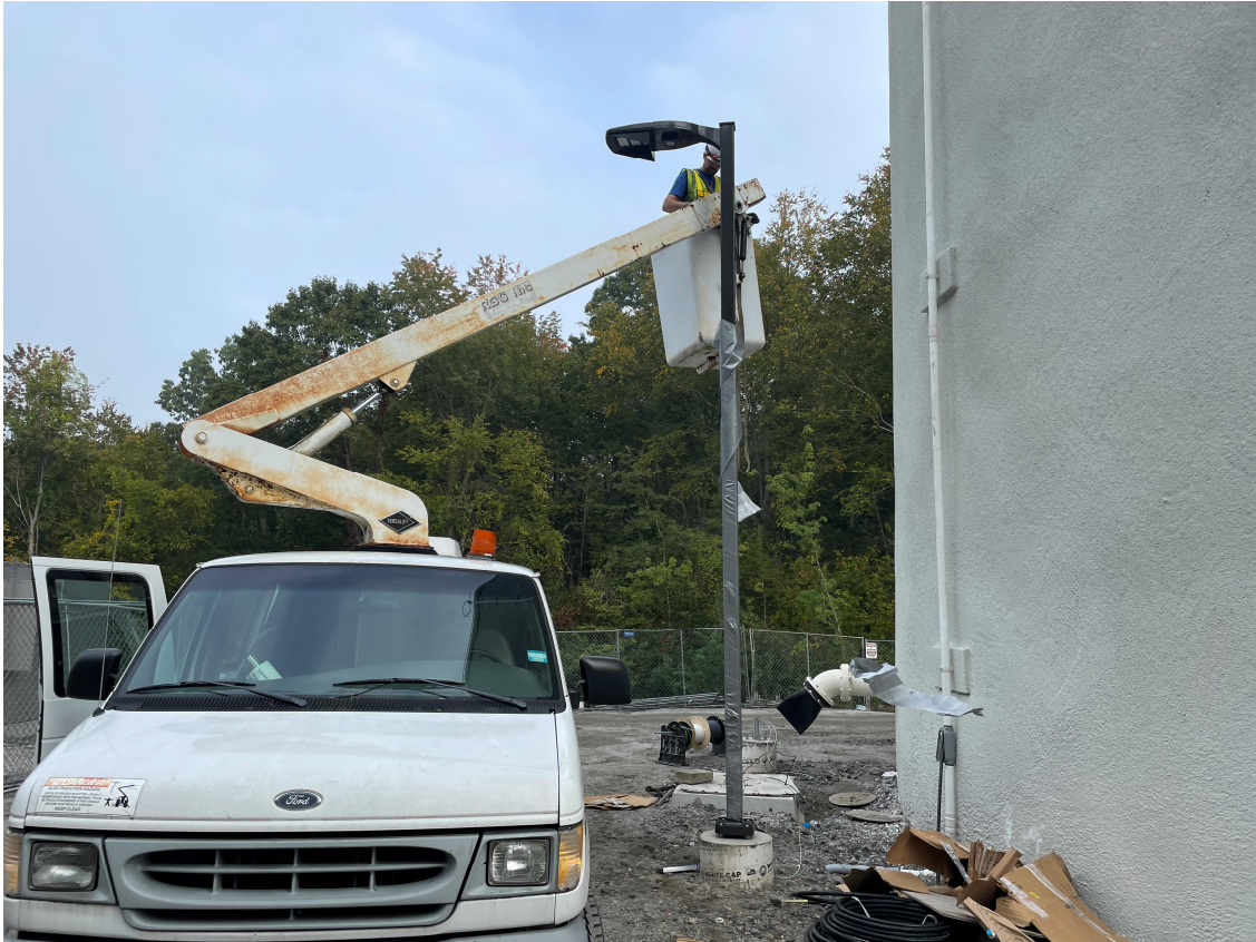
Picture 3: A&R Electrical working on a light pole they just installed on the west side of the water tank. View to the north.