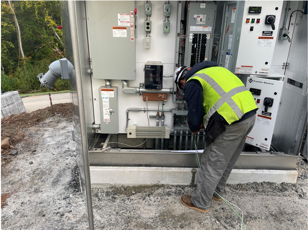
Picture 2: A&R Electrical working inside of the electrical enclosure located on the north side of the altitude vault at the water tank work zone. View to the north.