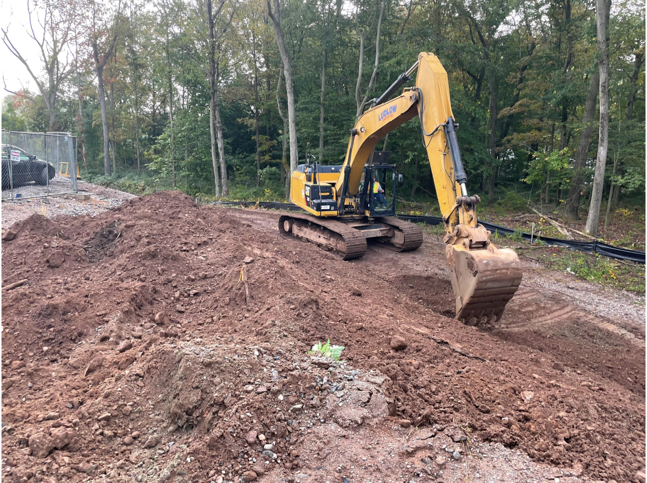
Picture 4: Ludlow shaping the slope to the southwest of the water tank located east of the Shared Access Road in Middletown. View to east.