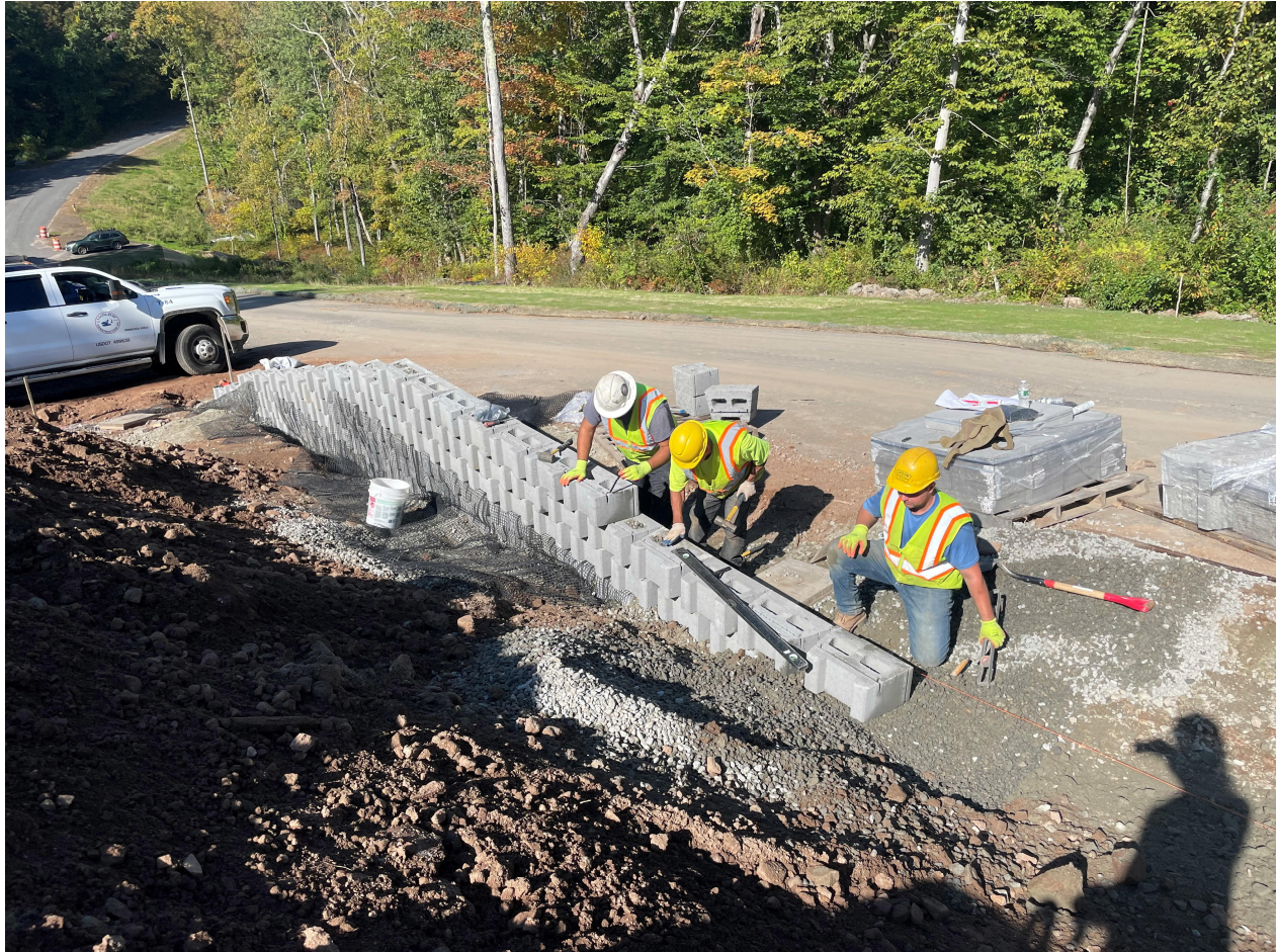
Picture 7: Ludlow constructing a retaining wall between Stations 10+83 and 11+34 on the south side of the Shared Access Road. View to the west.