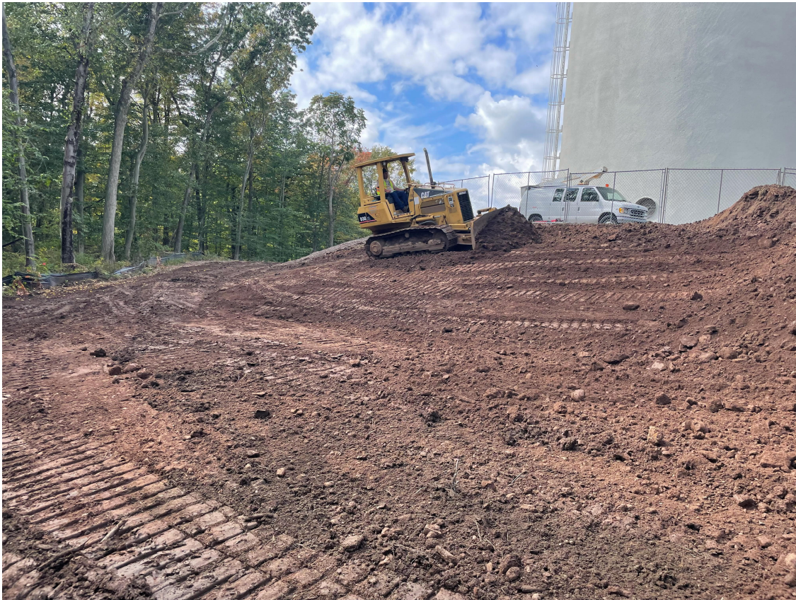
Picture 9: Ludlow shaping the slope to the southeast of the water tank located east of the Shared Access Road in Middletown. View to west.