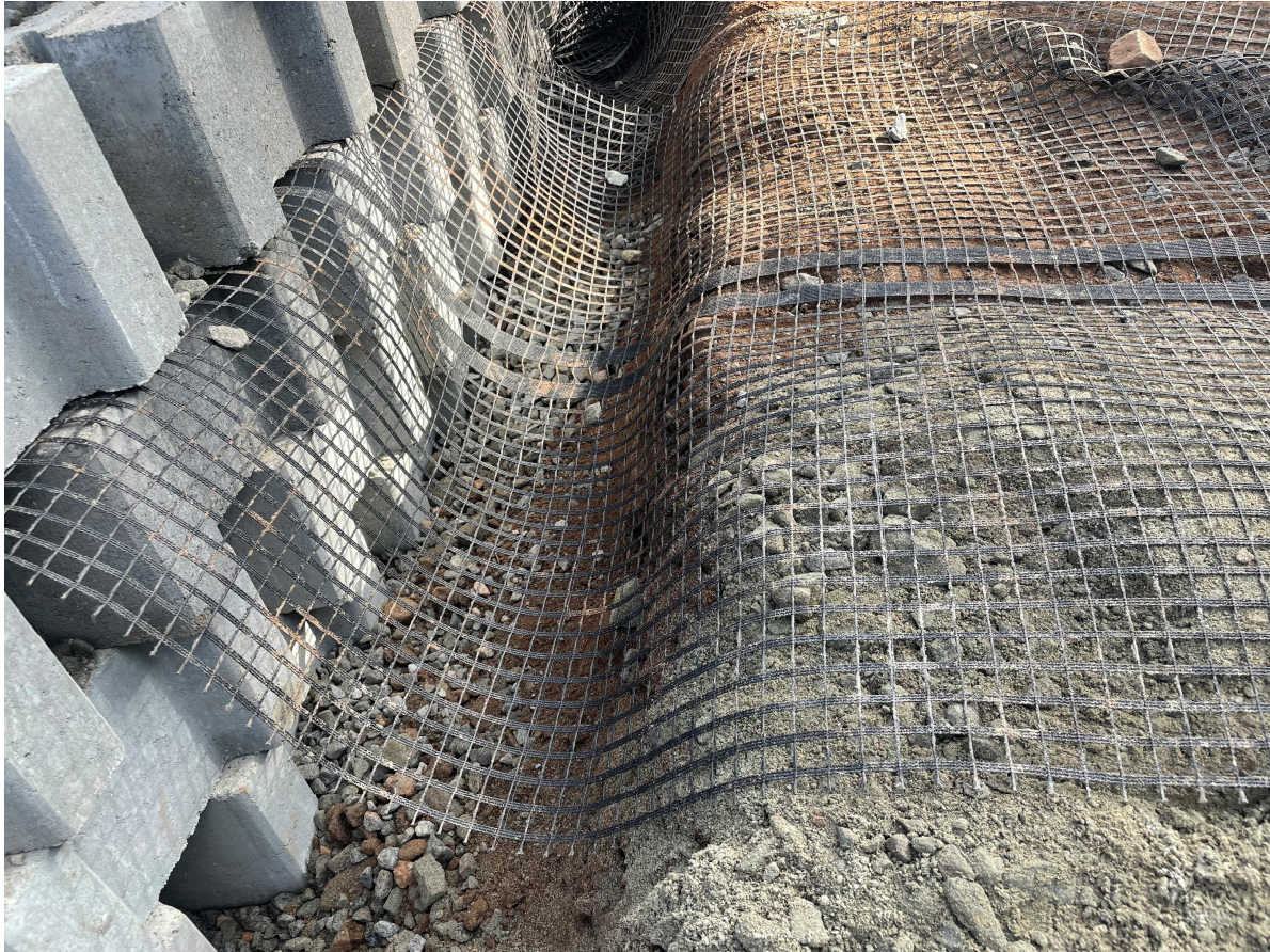
Picture 6: Geogrid that Ludlow placed on the south side of the retaining wall they are constructing between Stations 10+83 and 11+34 on the south side of the Shared Access Road. View to the east.