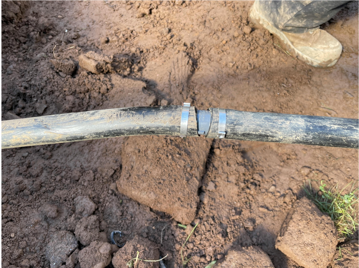
Picture 7: Repair that Ludlow made to a 1" HDPE irrigation line that was severed during the installation of a 1" copper water service line. Ludlow used a barbed, female to female PVC fitting to make the repair, crimping the hose into place with crimped hose clamps.