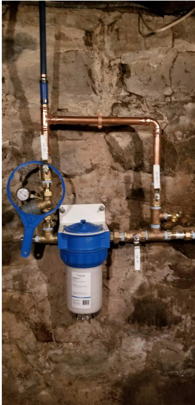
Picture 11: Final water service components that Fazzino Plumbing installed at the 36 Maiden Lane, Durham, residence.