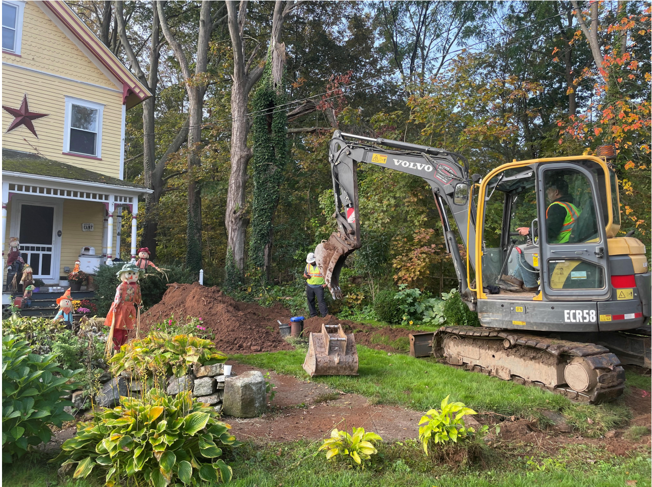
Picture 2: Ludlow excavating on the north/northwest side of the 29 Maiden Lane residence as they prepare to install a 1" copper water service line. View to the southwest.