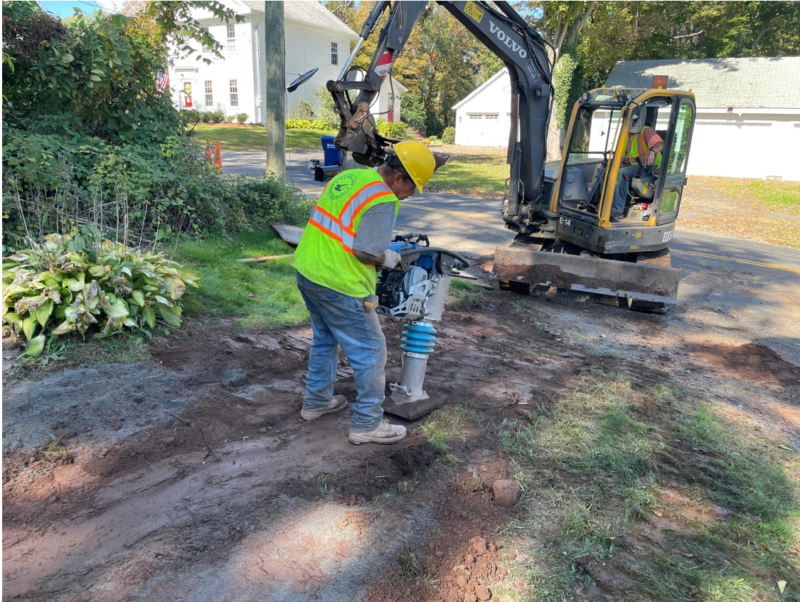
Picture 3: Ludlow using a jumping jack to compact fill placed in 1' lifts as they backfill over the 1" copper water service line they just installed. View to the northwest.