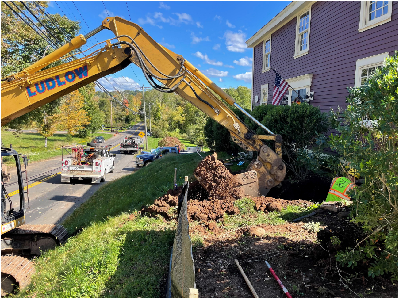
Picture 4: Ludlow excavating on the north side of the 35 Maiden Lane residence as they prepare to install a 1" copper water service line. View to the east.