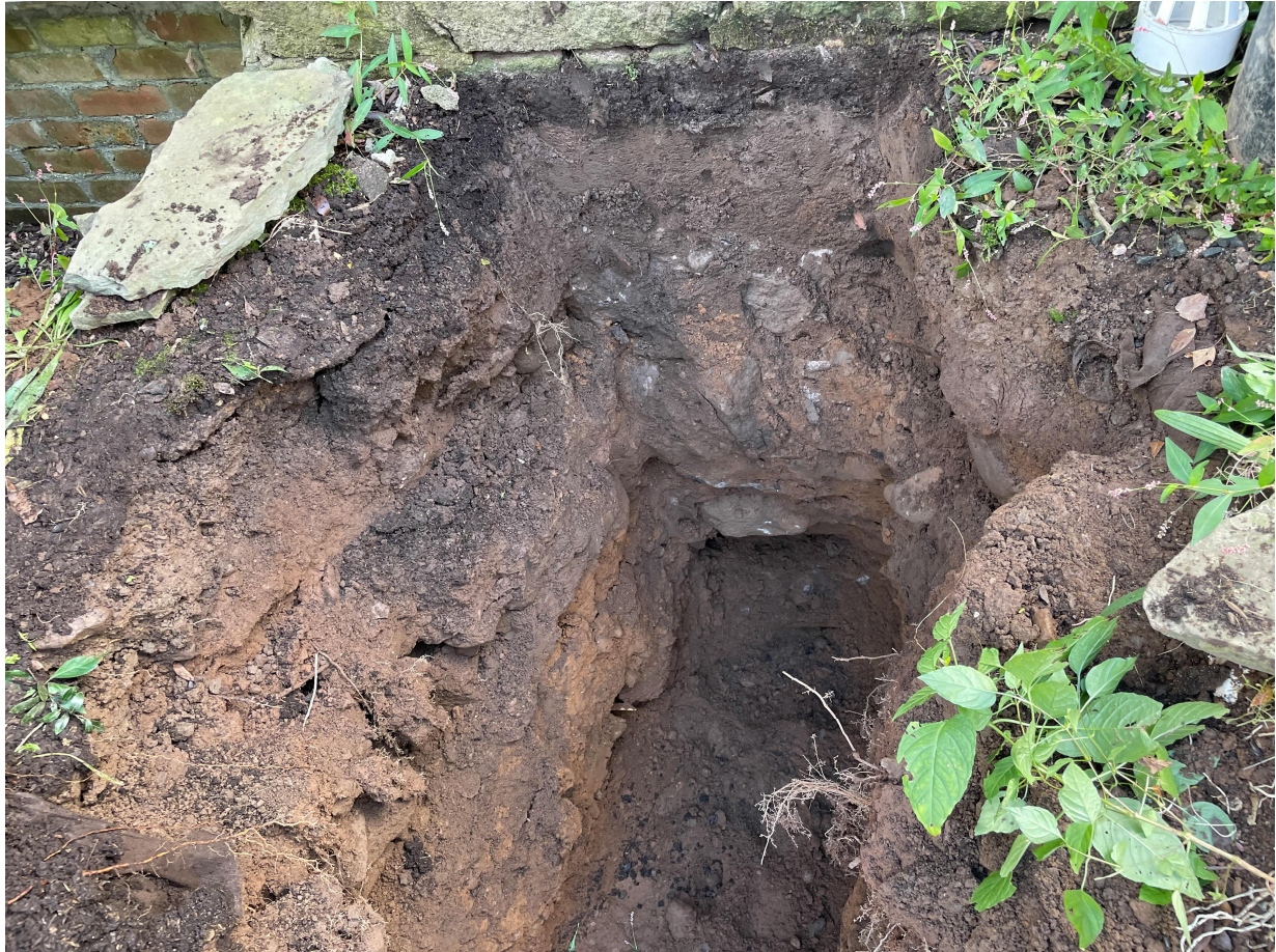
Picture 5: North side of the fieldstone foundation of the 35 Maiden Lane residence. View to the south.