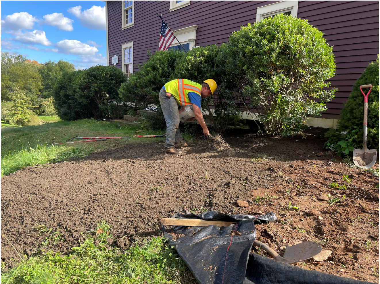
Picture 8: Ludlow spreading grass seed over loam they raked over the areas of the 35 Maiden Lane property that were disturbed by the installation of a 1" copper water service line. View to the southeast.