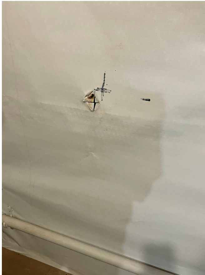
Picture 6: Penetration on the interior of the northern foundation of the 35 Maiden Lane residence that Ludlow made with a rotary hammer.