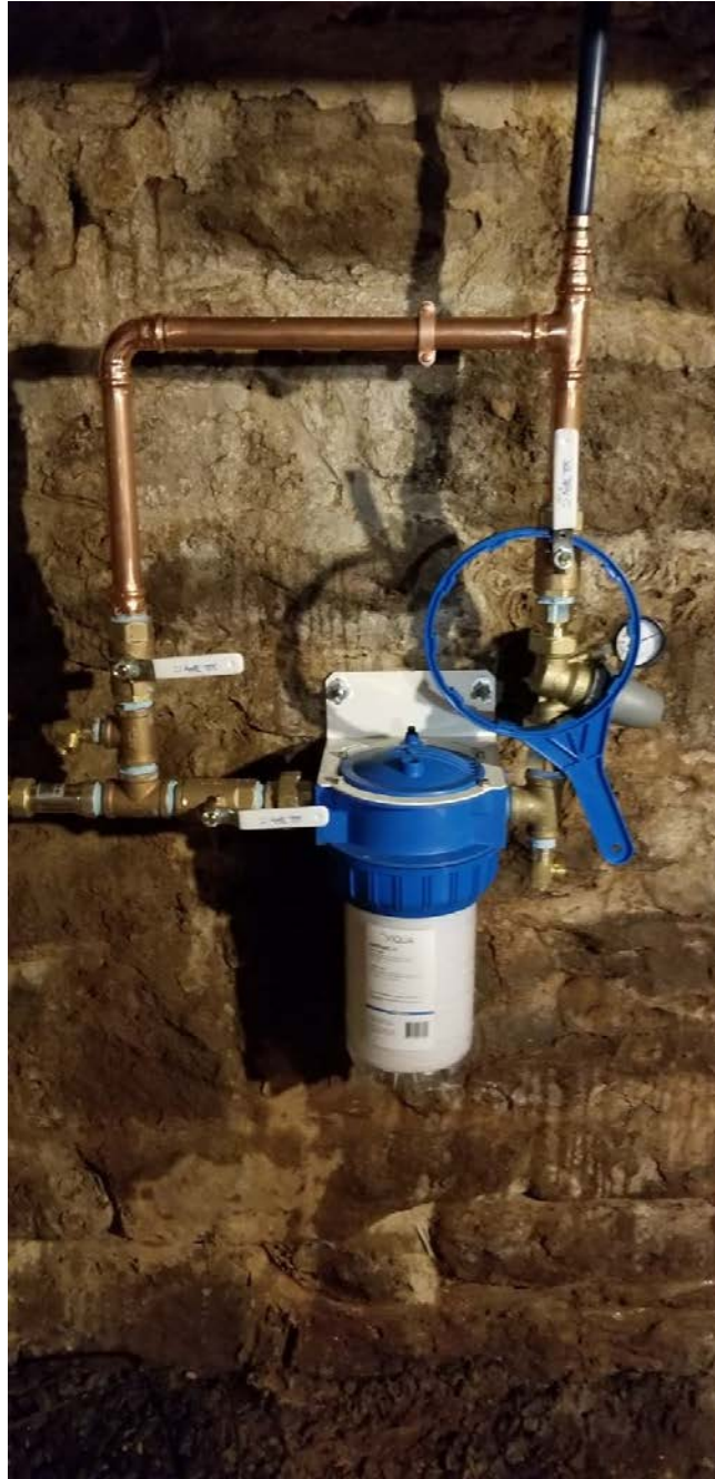
Picture 14: Final water service components that Fazzino Plumbing installed at the 316 Main Street, Durham, residence.