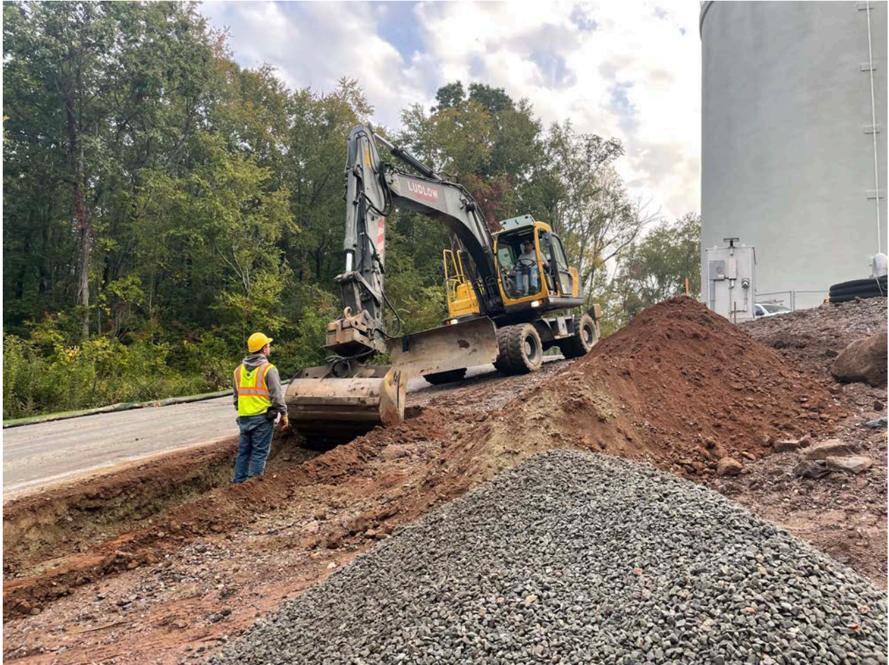
Picture 2: Ludlow excavating on the south side of the Shared Access Driveway between Stations 10+83 and 11+34 as they prepare to construct a retaining wall. View to the northeast.