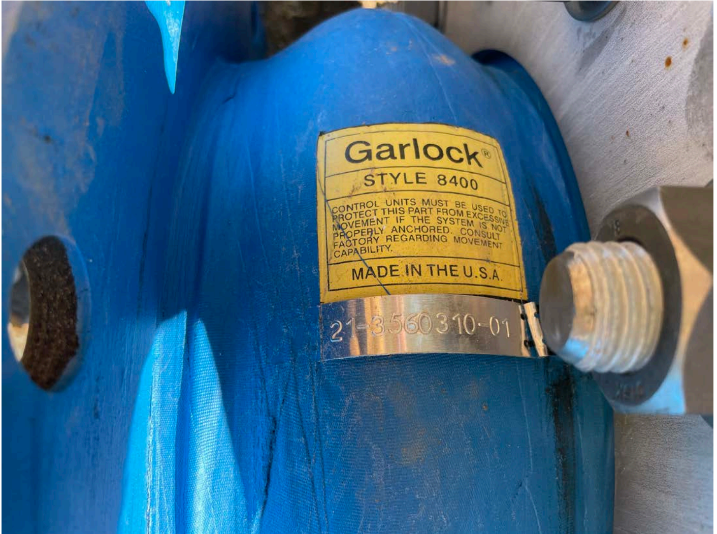
Picture 10: Expansion joint that was installed today, attached to the section of 12” stainless steel air duct that was installed on top of 12” stainless steel air duct that was previously-installed on the northeast side of the water tank.