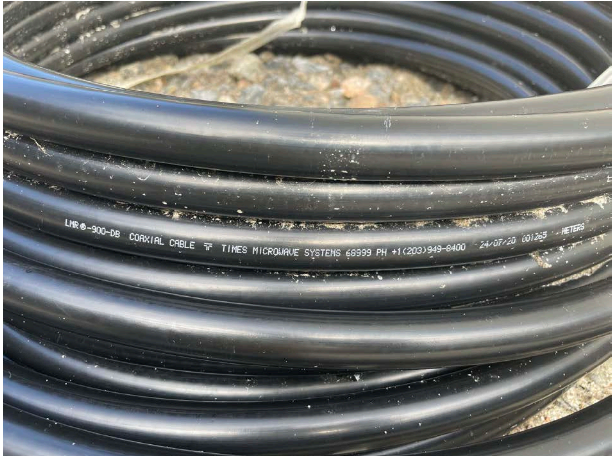
Picture 5: Coaxial cable for the tank radio antenna that was placed inside of the 2" conduit that was installed on the west side of the water tank at the Shared Access Driveway in Middletown.