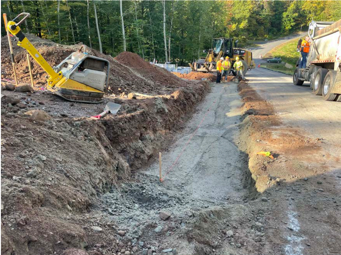
Picture 3: Base that Ludlow has compacted on the south side of the Shared Access Driveway between Stations 10+83 and 11+34 for the placement of VERSA-LOK blocks for the construction of a retaining wall. View to the west.