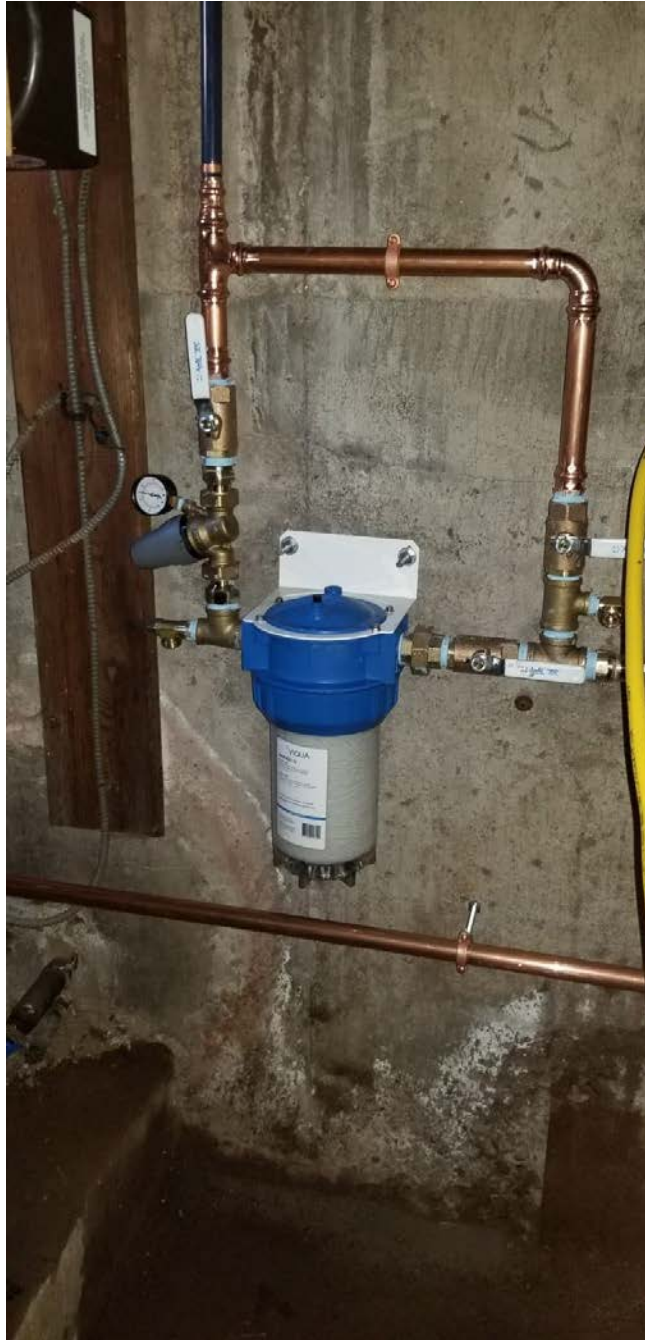
Picture 15: Final water service components that Fazzino Plumbing installed at the 321 Main Street, Durham, residence.