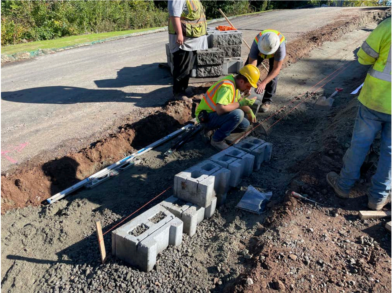
Picture 4: Ludlow placing VERSA-LOK blocks for the construction of a retaining wall on the south side of the Shared Access Driveway between Stations 10+83 and 11+34. View to the northeast.

Project: Durham Meadows Pipeline Installation Date: October 6, 2021 Location: Maiden Lane, Durham; S. Main Street and the Shared Access Driveway, Middletown Day of Week: Wednesday Project #: AECOM: 6061487 Report No: 337 Contractor: Ludlow Construction Page: 7 of 18