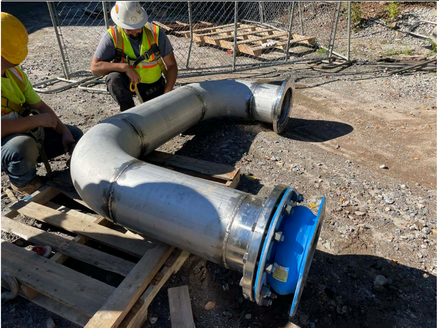
Picture 9: Section of 12" stainless steel air duct that Barnhart will lift with a crane to place on top of 12" stainless steel air duct that was previously installed on the northeast side of the water tank.