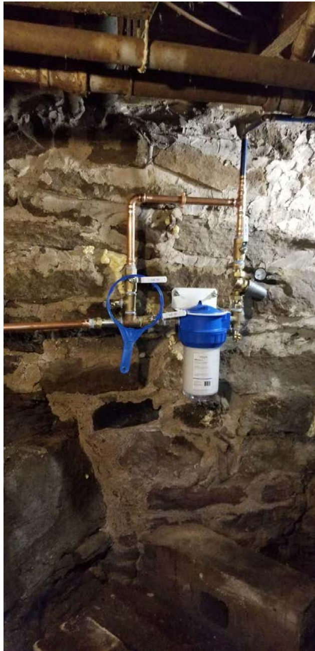
Picture 13: Final water service components that Fazzino Plumbing installed at the 308 Main Street, Durham, residence.