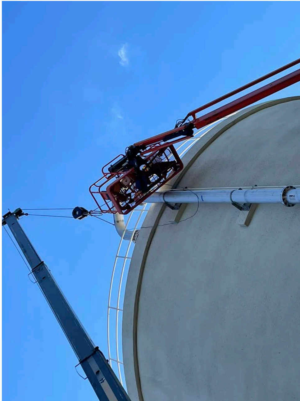
Picture 12: Ludlow installing a section of 12” stainless steel air duct on top of 12” stainless steel air duct that was previously installed on the northeast side of the water tank.