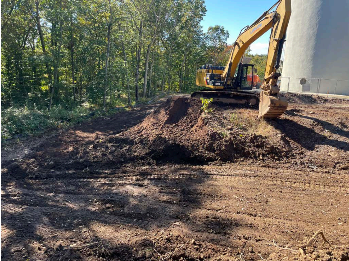
Picture 8: Ludlow excavating fill on the slope located to the southeast of the water tank. Ludlow is loading the excavated soil into a dump truck for off-site removal. View to the west.