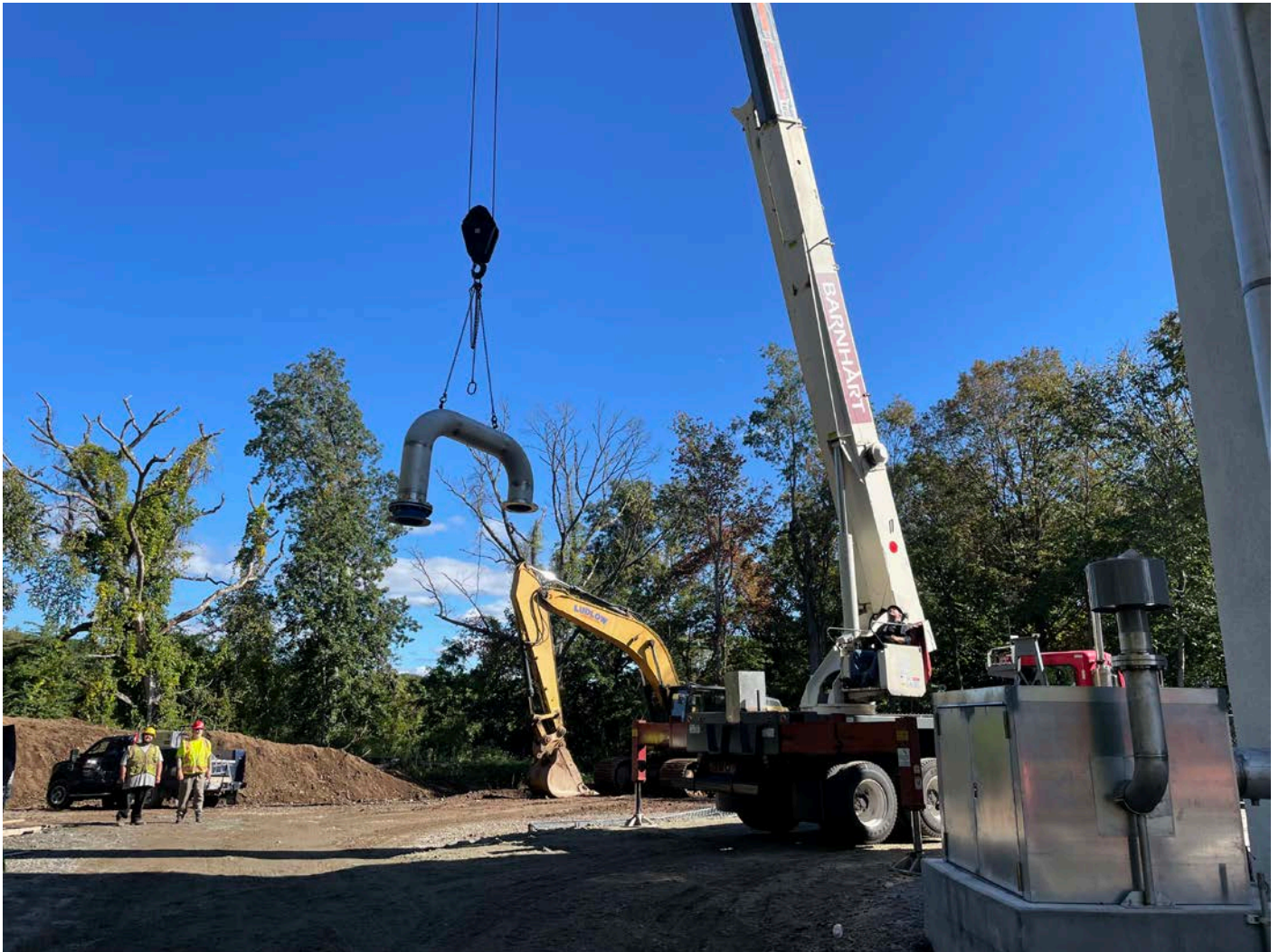
Picture 11: Barnhart lifting a section of 12” stainless steel air duct that will be installed on top of 12” stainless steel air duct that was previously installed on the northeast side of the water tank.