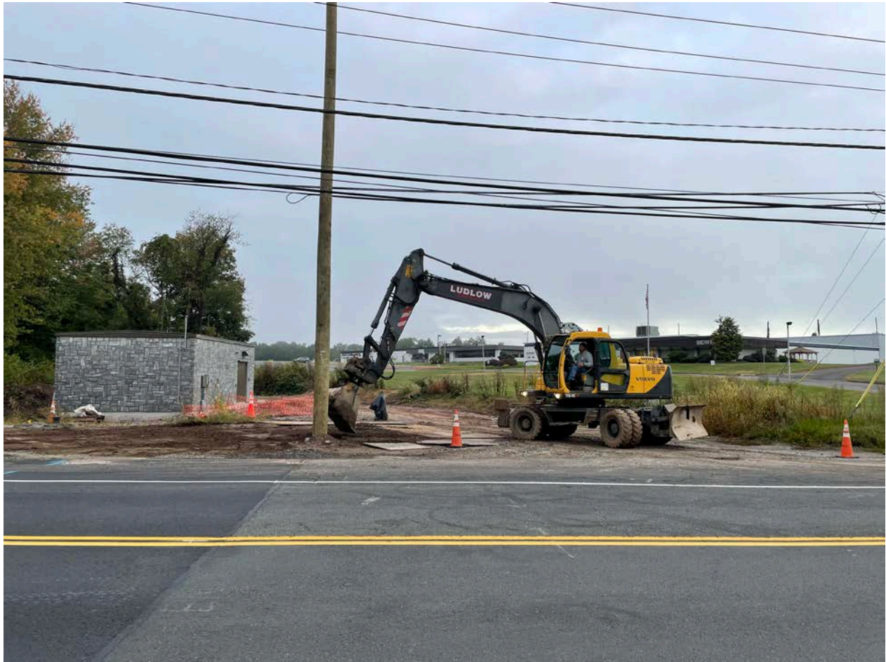
Picture 1: Ludlow grading fill at the booster station located at Station 750+63 on S. Main Street in Middletown. View to the west.