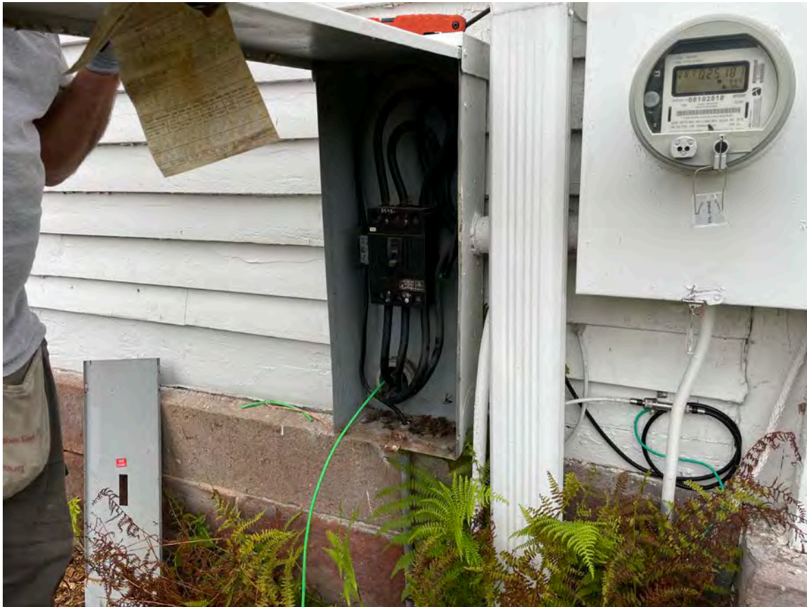
Picture 6: Apuzzo Electric running grounding cable from the main electric panel in the basement of 236 Main Street, Durham, to the exterior of the church. View to the northwest.