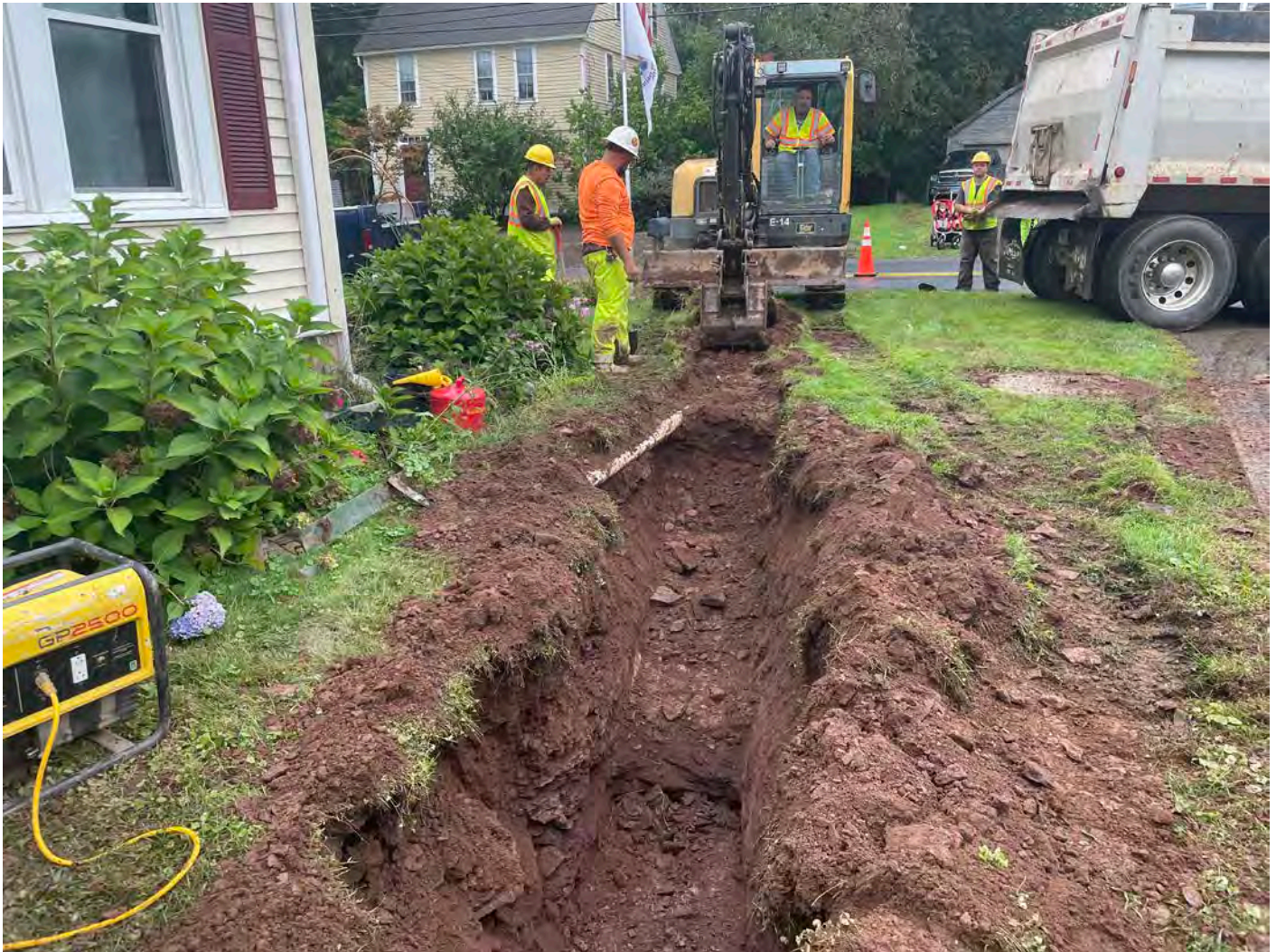
Picture 7: Ludlow excavating at the 18 Maiden Lane property for the installation of a 1" copper water service line. View to the south.