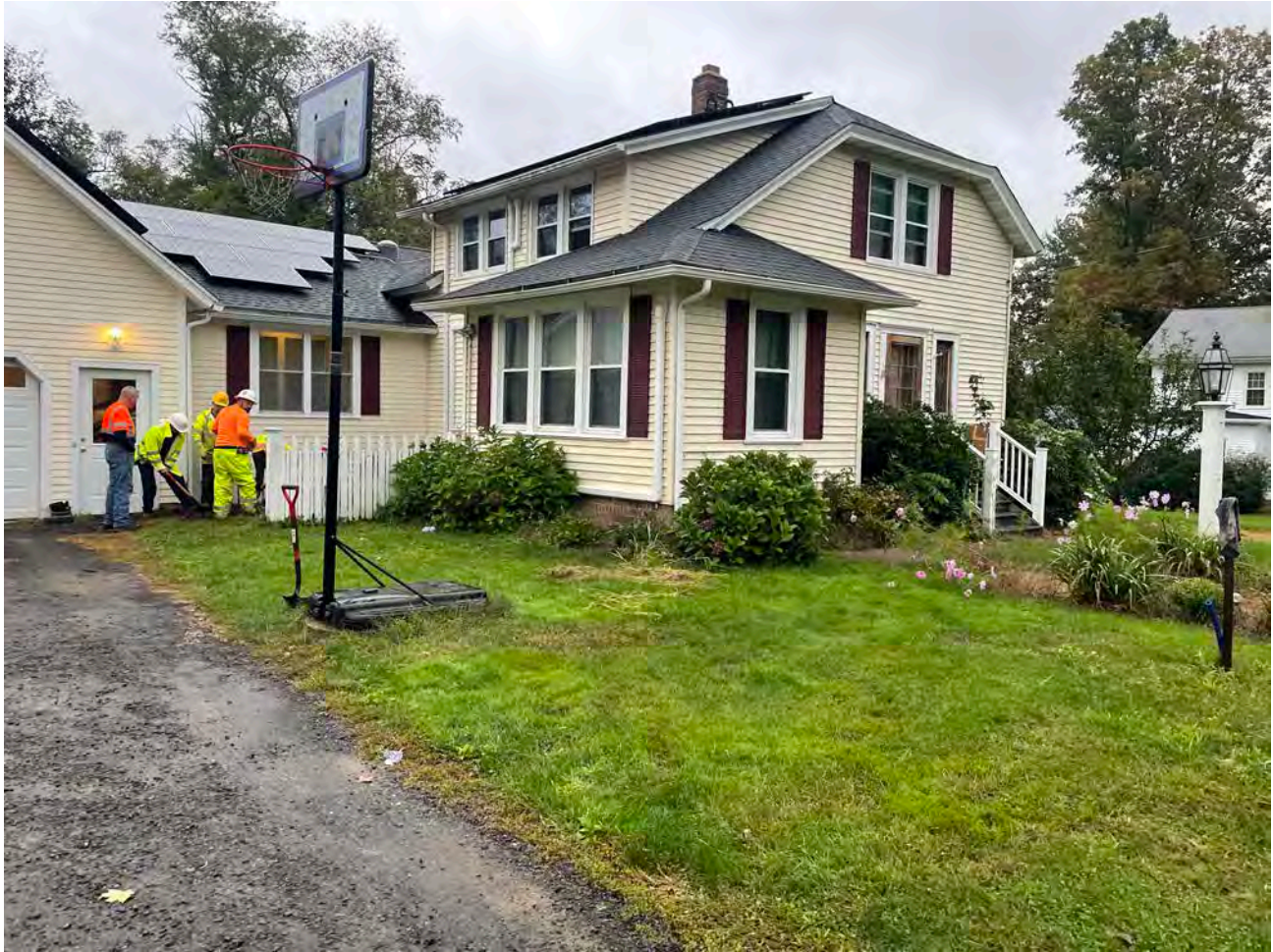
Picture 2: Overview of the 18 Maiden Lane residence where Ludlow is working to install a 1" copper water service line. View to the northeast.

Project: Durham Meadows Pipeline Installation Date: October 4, 2021 Location: Maiden Lane, Wallingford Road, Main Street, Durham Day of Week: Monday Project #: AECOM: 6061487 Report No: 335 Contractor: Ludlow Construction Page: 5 of 15