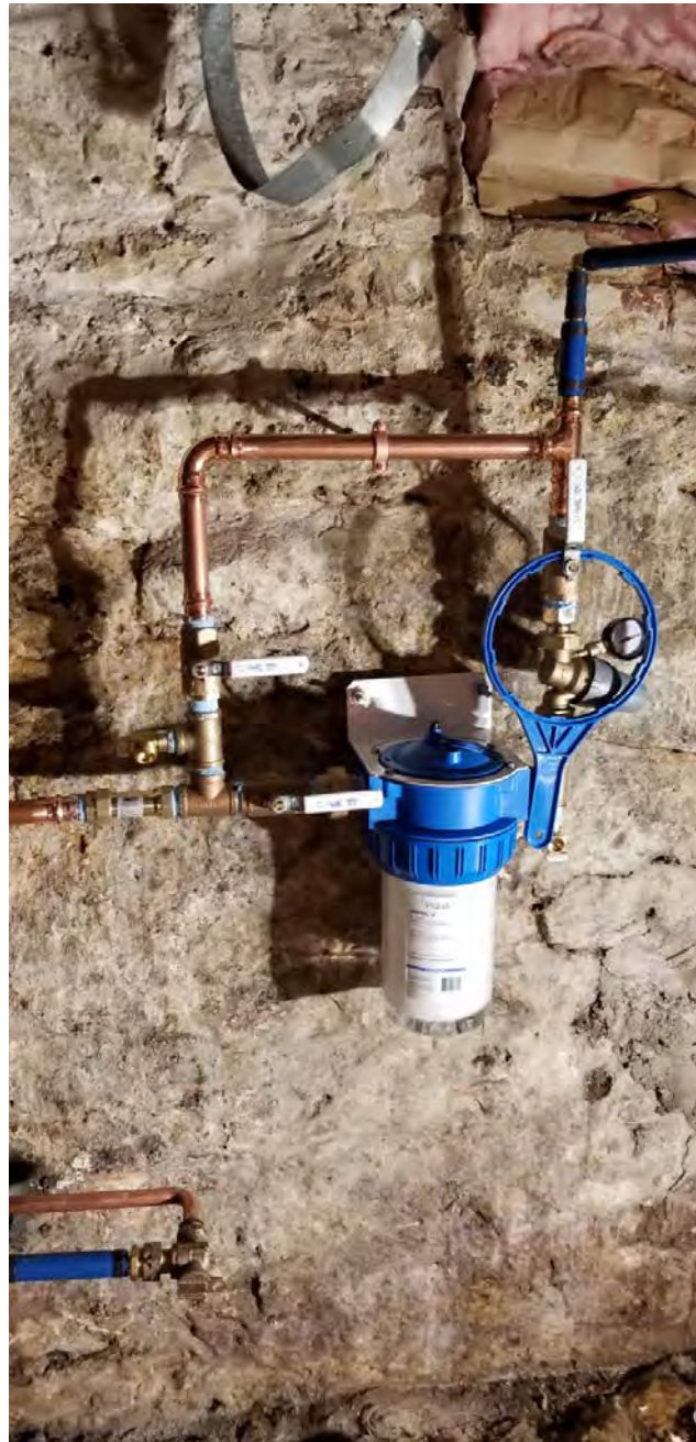
Picture 12: Final water service components that Fazzino Plumbing installed at the 313 Main Street, Durham, residence.