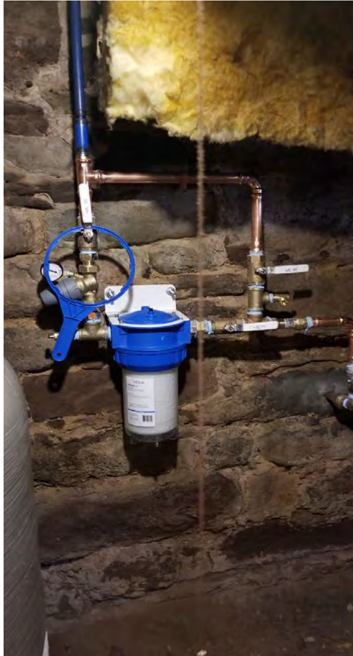
Picture 8: Final water service components that Fazzino Plumbing installed at the 307 Main Street, Durham, residence.