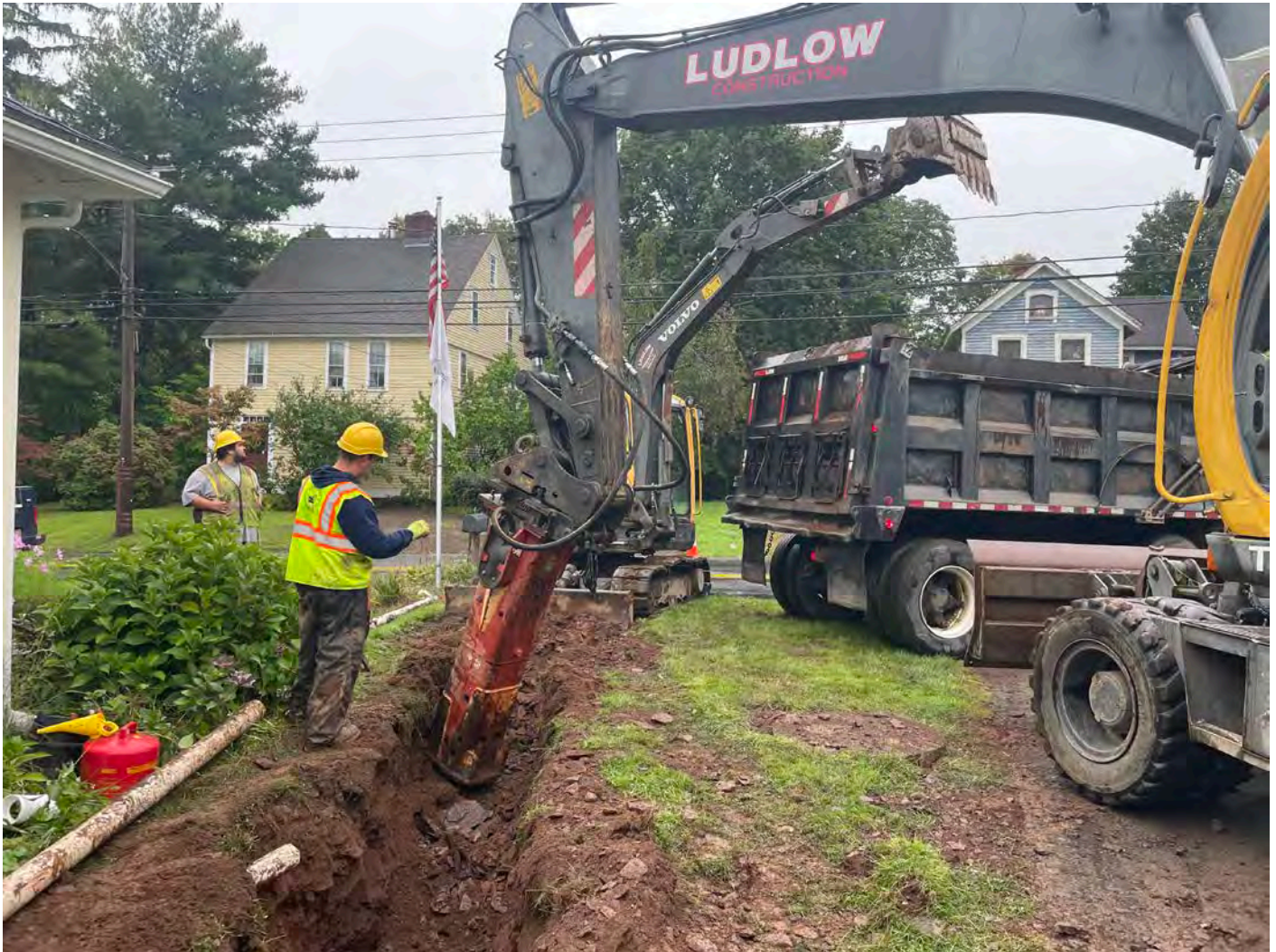
Picture 9: Ludlow hammering bedrock as they excavate a trench at the 18 Maiden Lane property for the installation of a 1" copper water service line. View to the south.