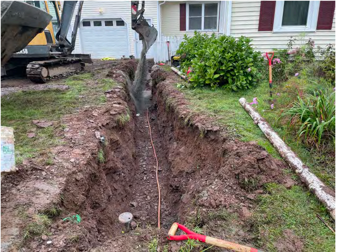
Picture 10: Ludlow placing sand over a 1" copper water service line they installed at the 18 Maiden Lane property. View to the north.