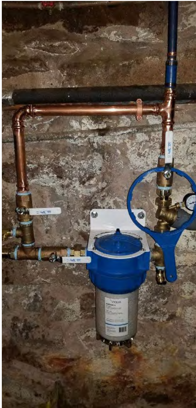
Picture 11: Final water service components that Fazzino Plumbing installed at the 312 Main Street, Durham, residence.