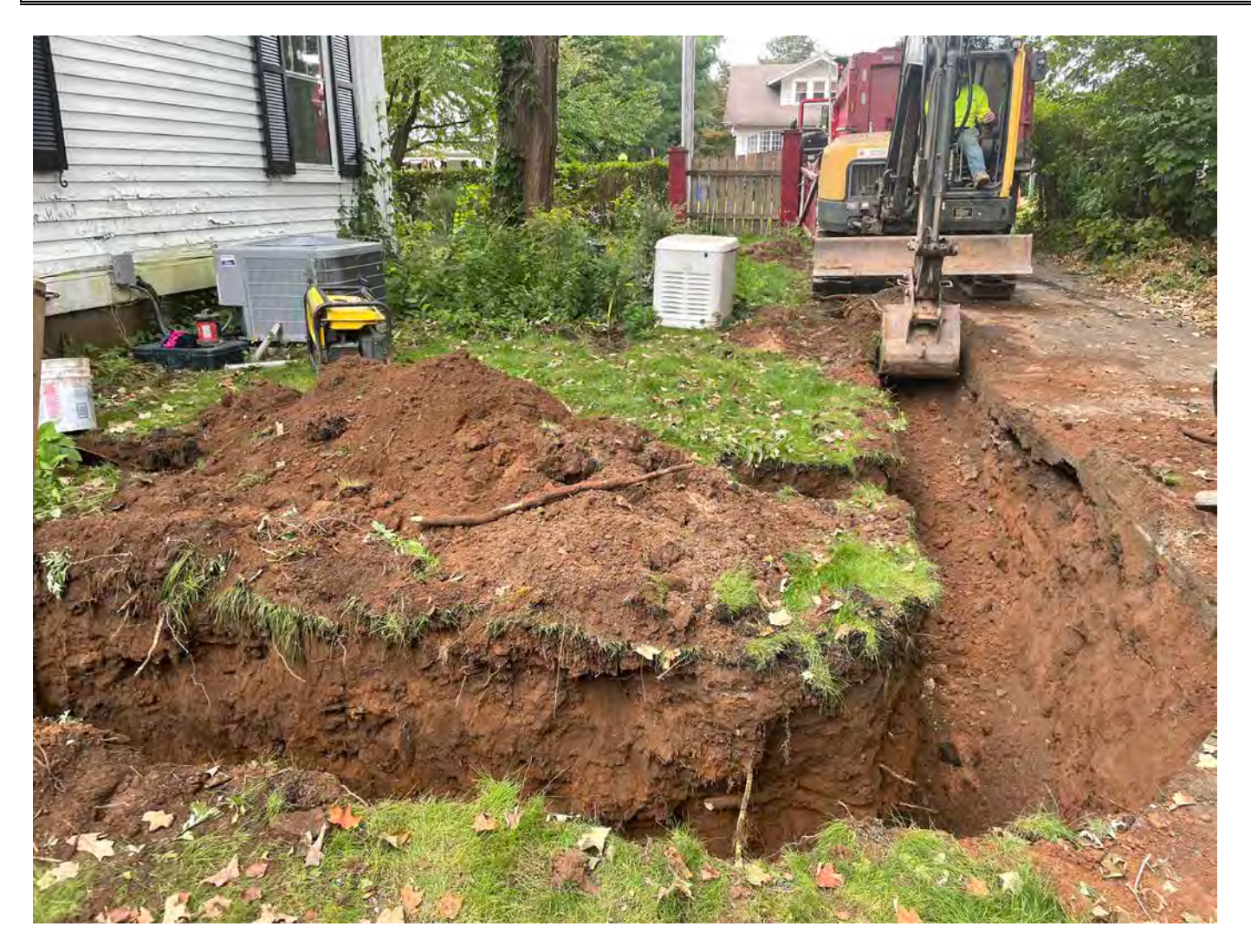
Picture 6: Ludlow excavating a trench on the north side of the 313 Main Street residence for the installation of a 1" copper water service line. View to the east.