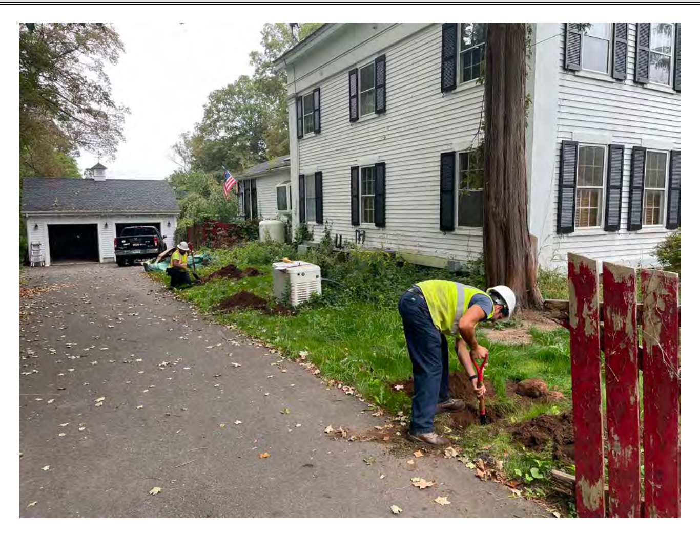
Picture 2: Ludlow hand excavating at the 313 Main Street, Durham, property to locate a recently-installed gas line that conflicts with the planned route that Ludlow had planned to run a 1" copper water service line to the residence. View to the east.