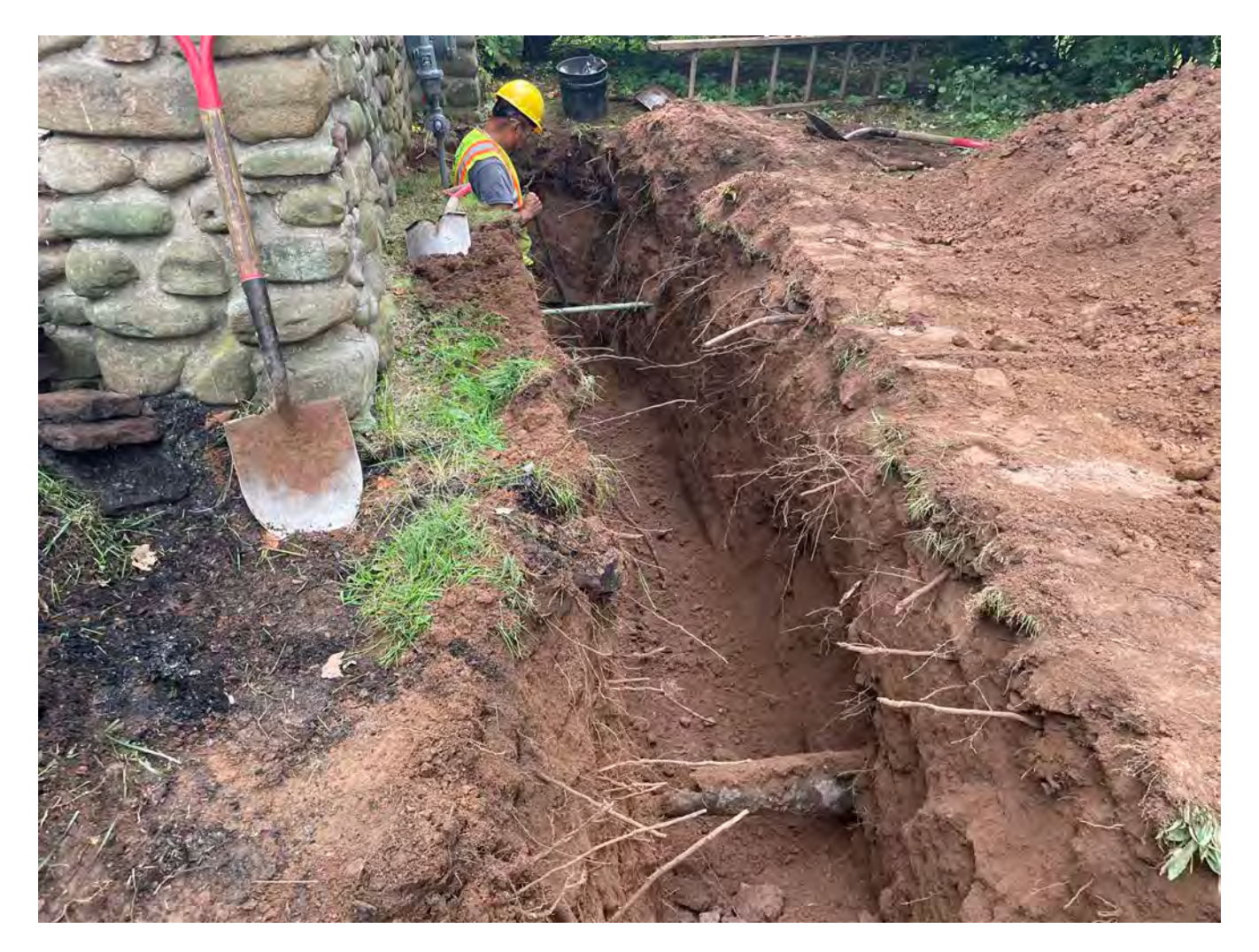
Picture 1: Trench that Ludlow excavated on the north side of the 316 Main Street, Durham, residence for the installation of a 1" copper water service line. View to the west.