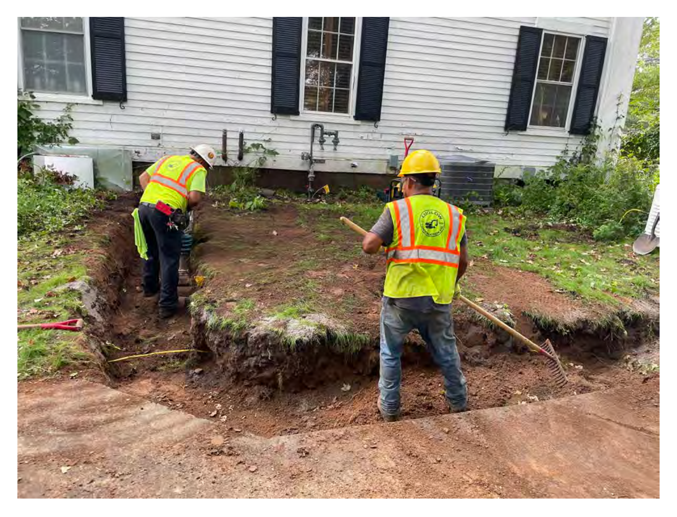
Picture 8: Ludlow compacting fill with a jumping jack that they placed over the 1" copper water service line they installed at the 313 Main Street residence. View to the south.