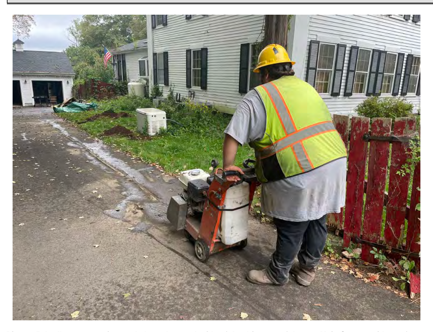
Picture 5: Ludlow saw cutting asphalt on the south side of the driveway of the 313 Main Street residence for the installation of a 1" copper water service line. View to the southeast.