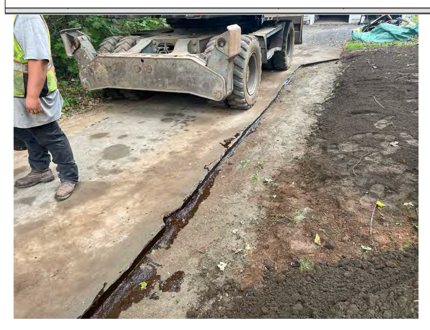
Picture 9: Tack coating that Ludlow placed on the cut edges of driveway pavement on the north side of the 313 Main Street residence for the installation of a 1" copper water service line. View to the east.