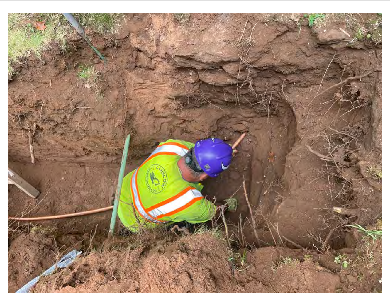
Picture 3: Ludlow inserting 1" copper water service line through a penetration they made through the north side of the foundation of the 316 Main Street residence.

Contractor: Ludlow Construction Page: 6 of 13