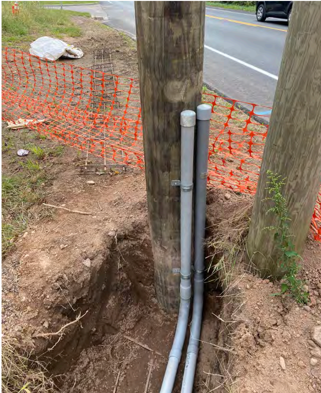
Picture 8: A & R Electric installs two 2" telephone conduits to the utility pole at the meter building on S. Main Street by Acorn Drive. View to the West.