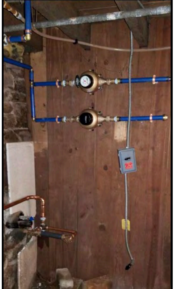
Picture 12: Final water service components that Fazzino Plumbing installed today at the residence located at 303 Maple Avenue, Durham. (Photo on right is of submeters)