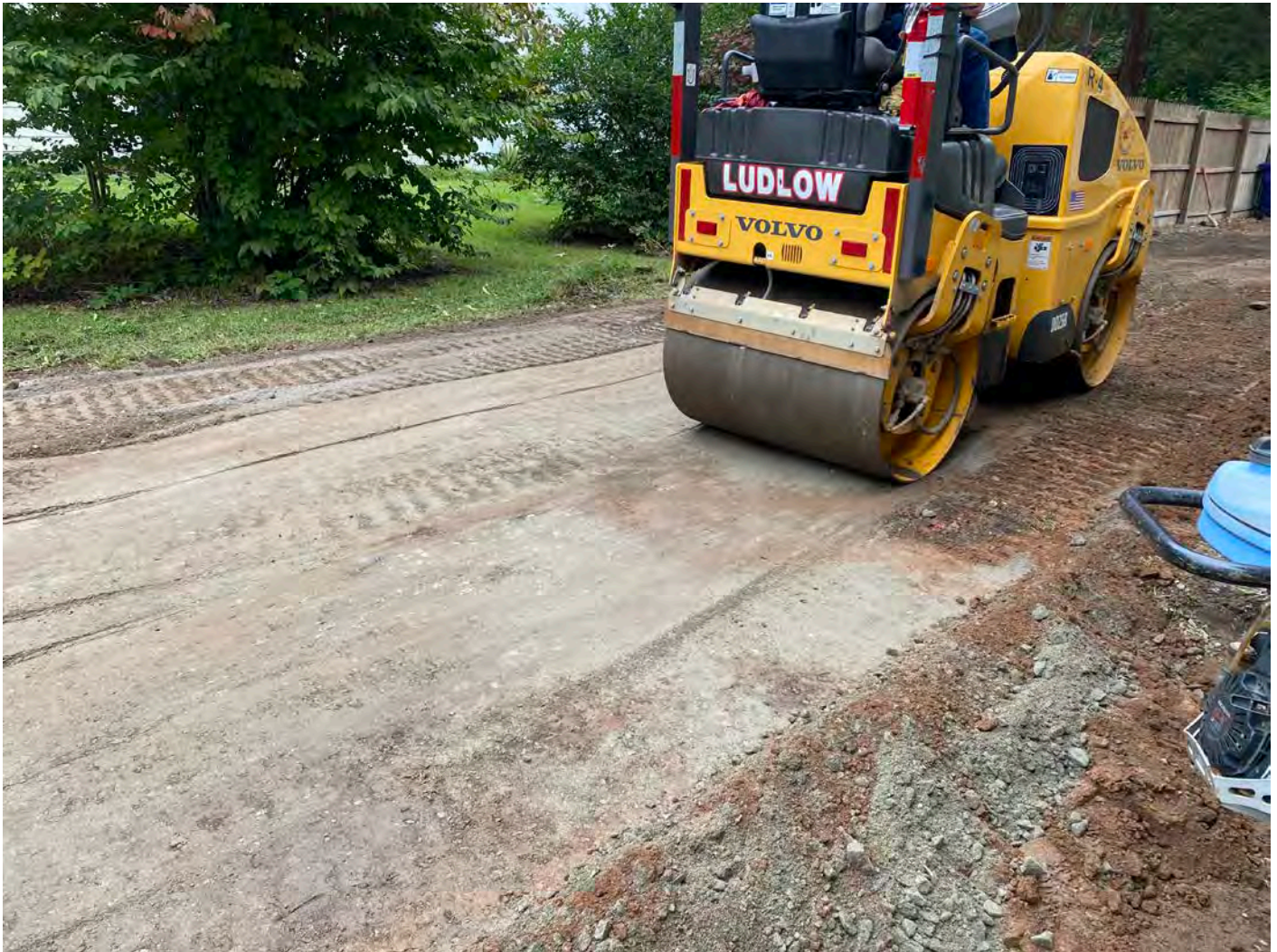
Picture 7: Ludlow compacting native fill that they backfilled into the trench at the 305R Main Street residence. View to the North.