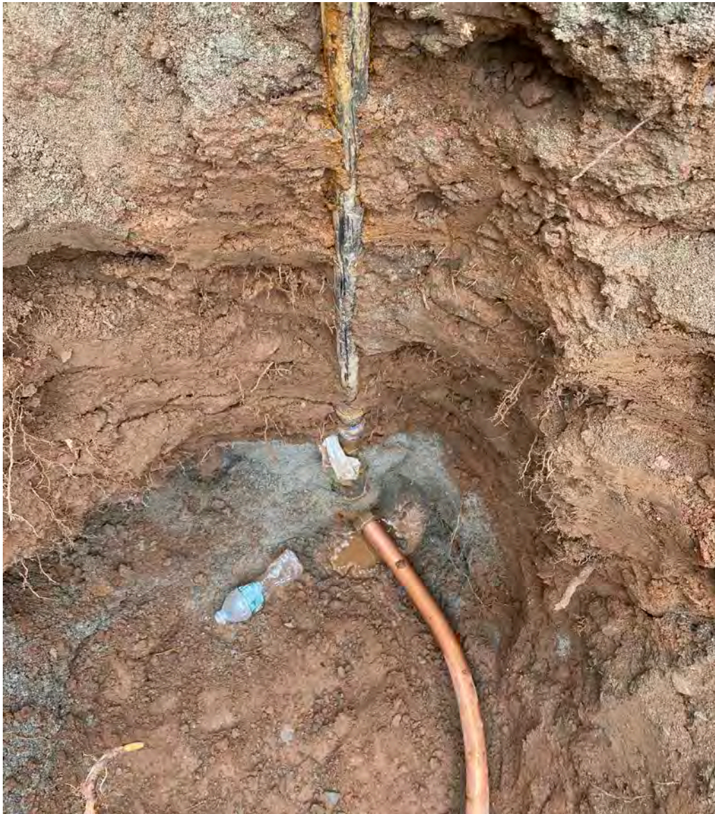
Picture 5: Ludlow connects the 1.5" copper water service line to the curb stop for the 305R Main Street residence. View to the West.