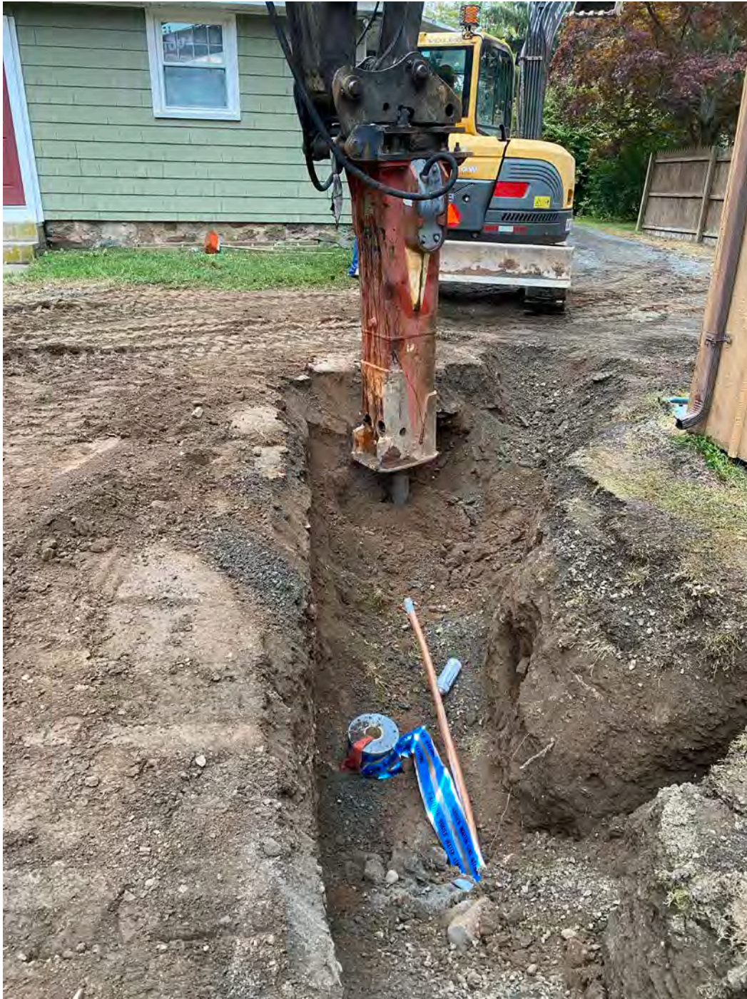
Picture 1: Ludlow hammers a segment of rock by the South west corner of the 305R Main Street Residence. View to the West.