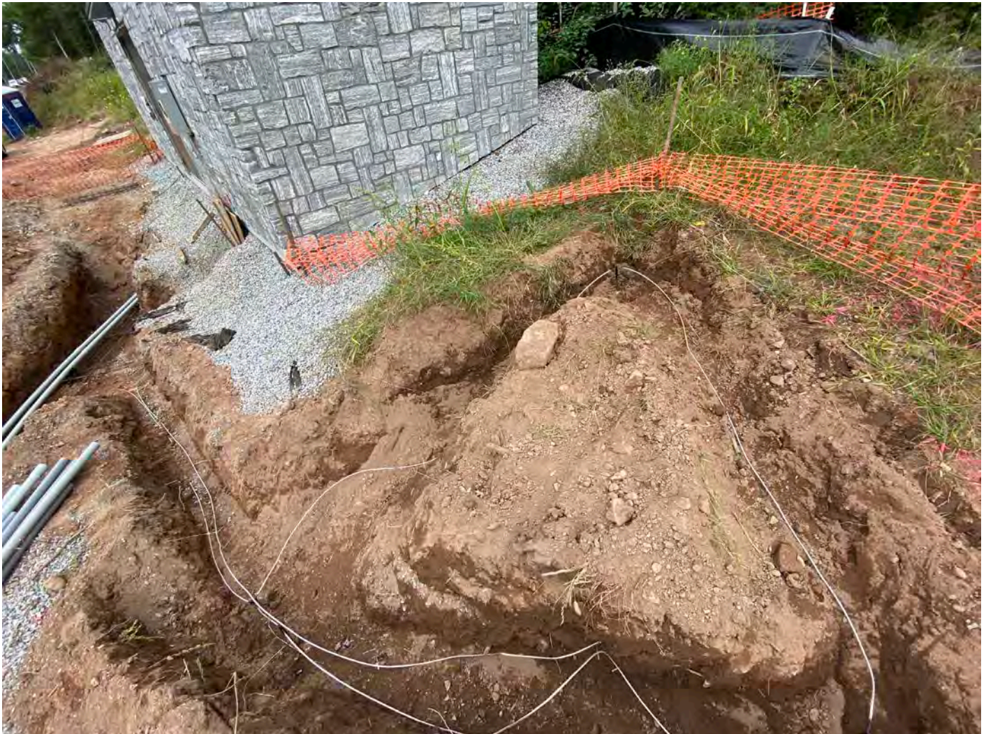
Picture 9: A & R Electric installs the underground grounding grid at the water meter building. View to the North