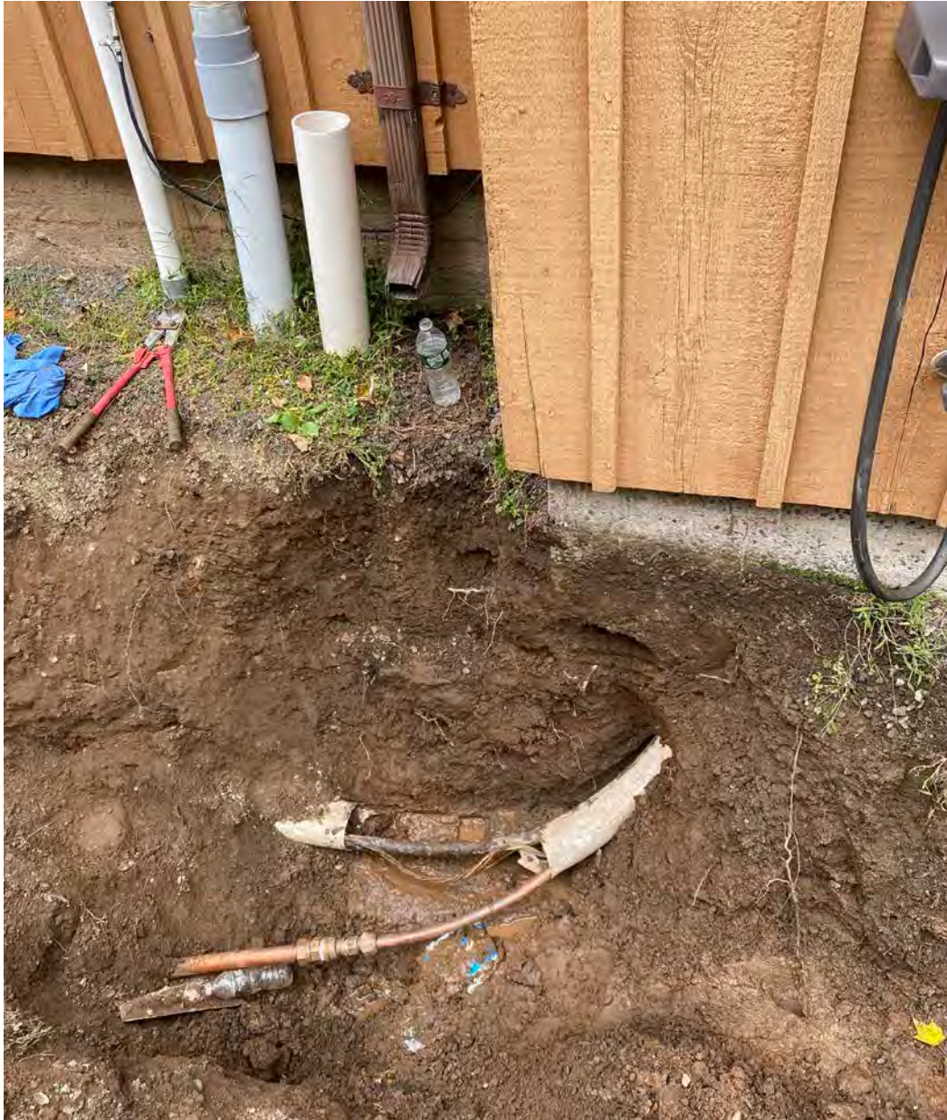
Picture 6: 1" copper water service line that Ludlow has inserted through the foundation via the existing sleeve from the abandoned well line for the 305R Main Street residence. Note transition from 1.5" to 1" entering the foundation. View to the West.