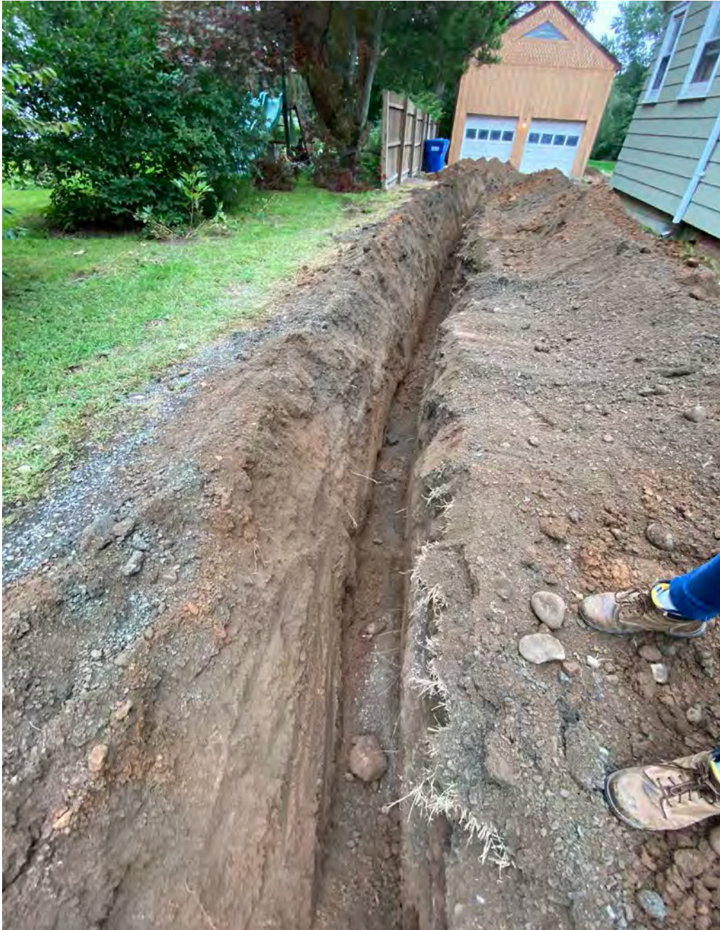
Picture 3: Ludlow excavates a trench for the 1.5" copper service line down the driveway for the 305R Main Street Residence. View to the East.

Project: Durham Meadows Pipeline Installation Date: September 17, 2021 Location: S. Main Street, Middletown, Main Street, Maple Avenue, Durham Day of Week: Friday Project #: AECOM: 6061487 Report No: 325 Contractor: Ludlow Construction Page: 6 of 16