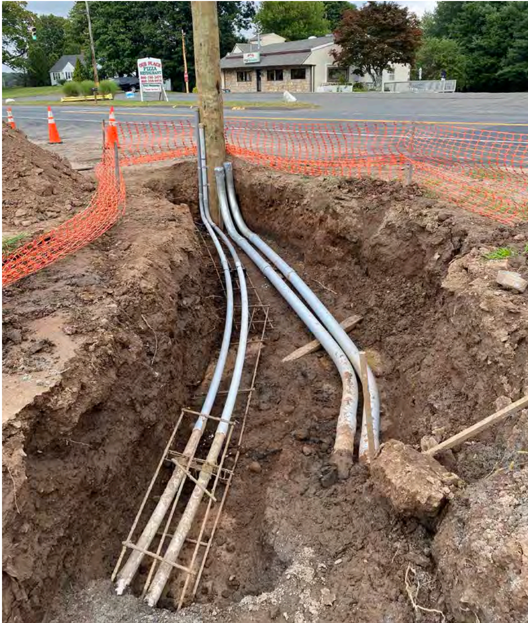
Picture 10: A & R Electric extends the 4" electric and 2" telephone conduits to the utility pole at the booster station on S. Main Street, Middletown. View to the East.