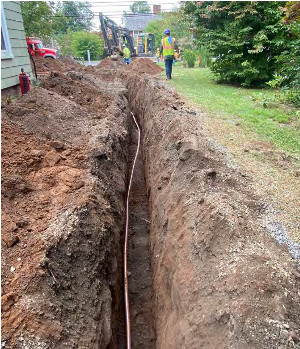
Picture 4: Ludlow places 1.5” copper tubing in trench for the service connection for the 305R Main Street residence. View to the West.