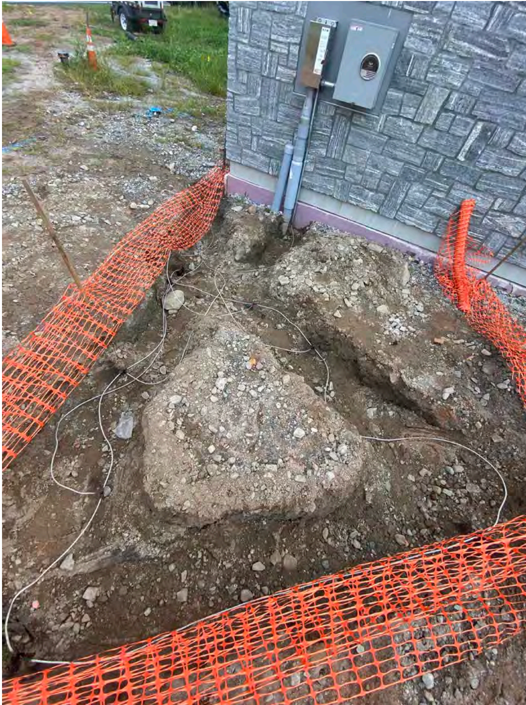
Picture 11: A & R Electric installs underground grounding grid at the booster station on S. Main Street, Middletown. View to the South.