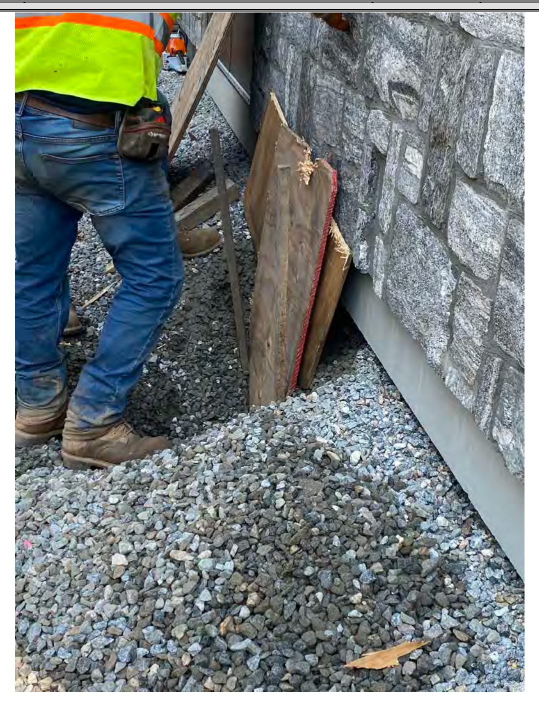
Picture 9: Ludlow constructs and inserts a temporary wall against the Meter Vault to restrain loose aggregate upon excavation. View to the north.

Contractor: Ludlow Construction Page: 12 of 14