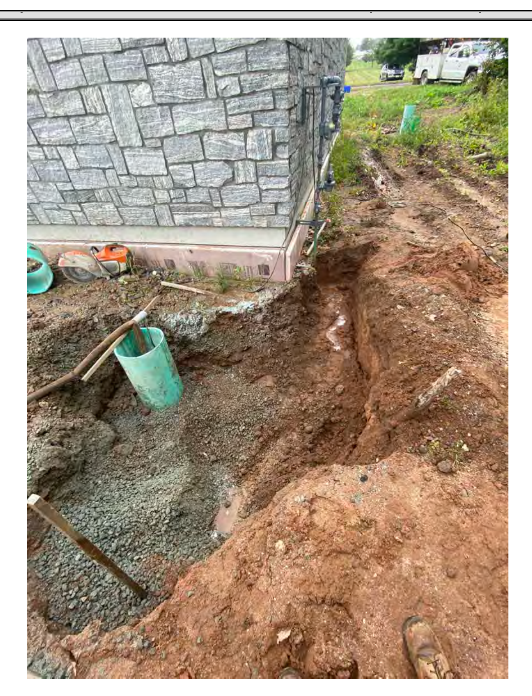
Picture 4: Ludlow excavates trench from the generator set to the Booster Station for gas line connection. View to the east.

Contractor: Ludlow Construction Page: 7 of 14