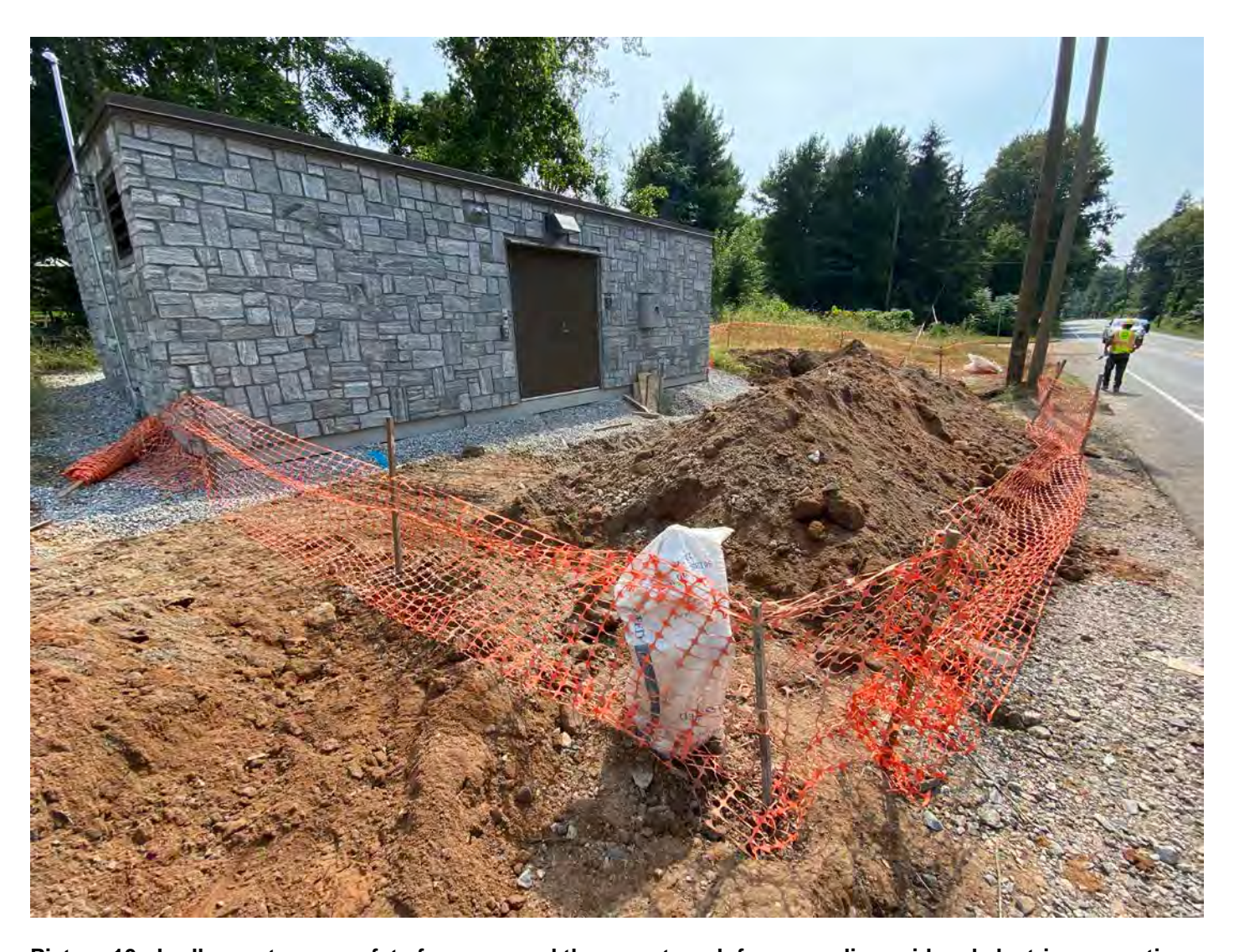
Picture 10 : Ludlow puts up a safety fence around the open trench for grounding grid and electric connection at the Meter Vault. View to the south.

Contractor: Ludlow Construction Page: 13 of 14