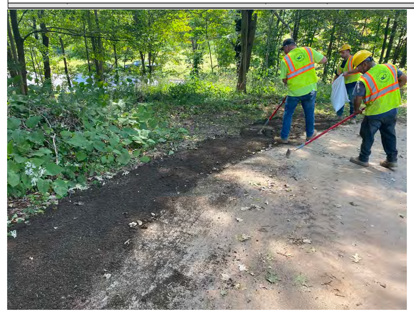
Picture 11: Ludlow placing loam and seed on the areas of the 95R Maple Avenue property that were disturbed during the installation of water service line. View to the west.

Contractor: Ludlow Construction Page: 14 of 14