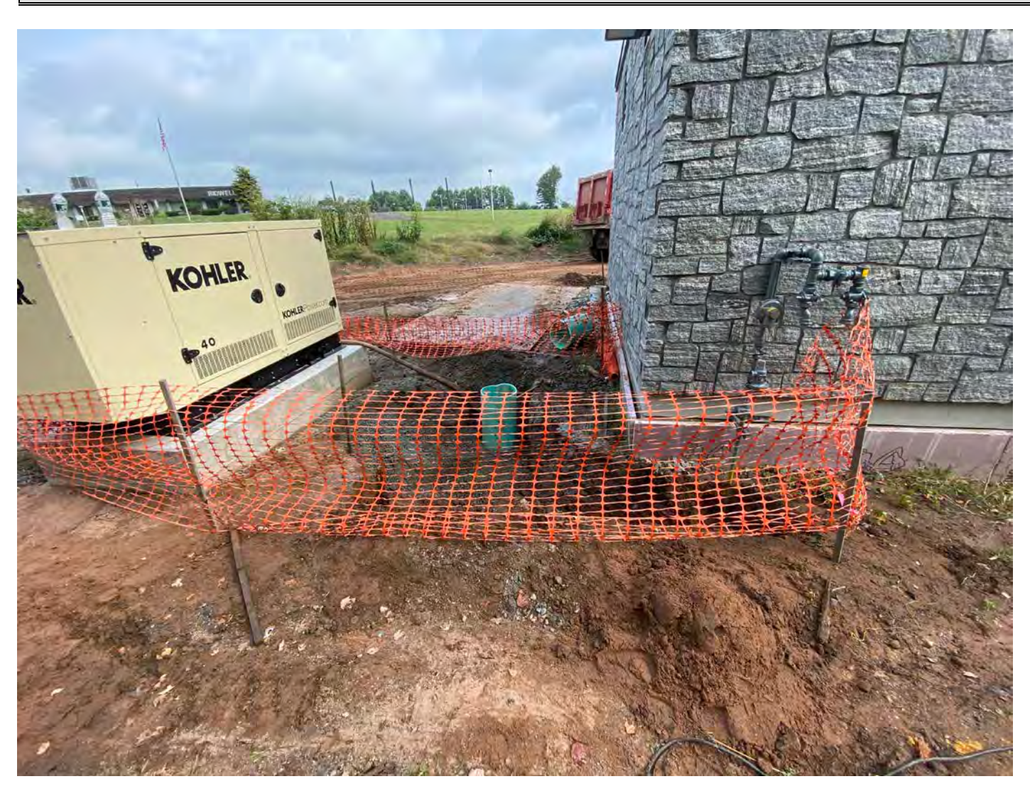
Picture 6: Ludlow puts up a safety fence around trench for gas line connection at the Booster Station. View to the north.

Contractor: Ludlow Construction Page: 9 of 14