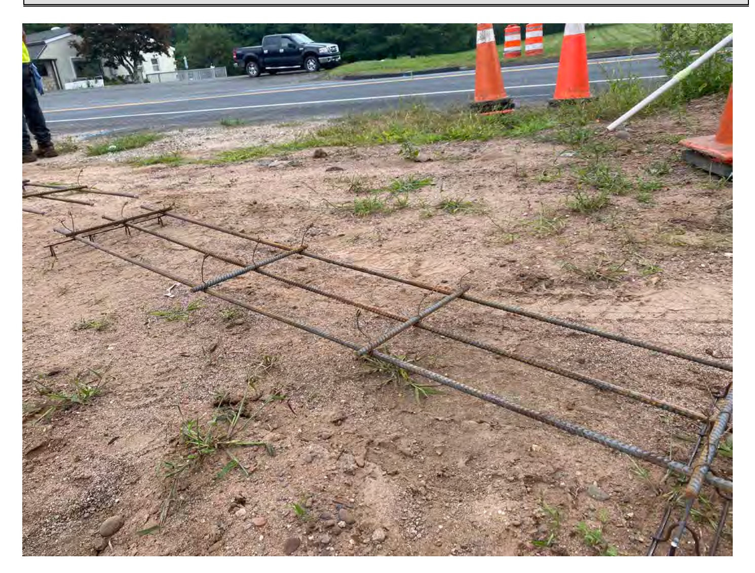
Picture 5: Ludlow assembles reinforcing cage for electric conduit at the Booster Station.