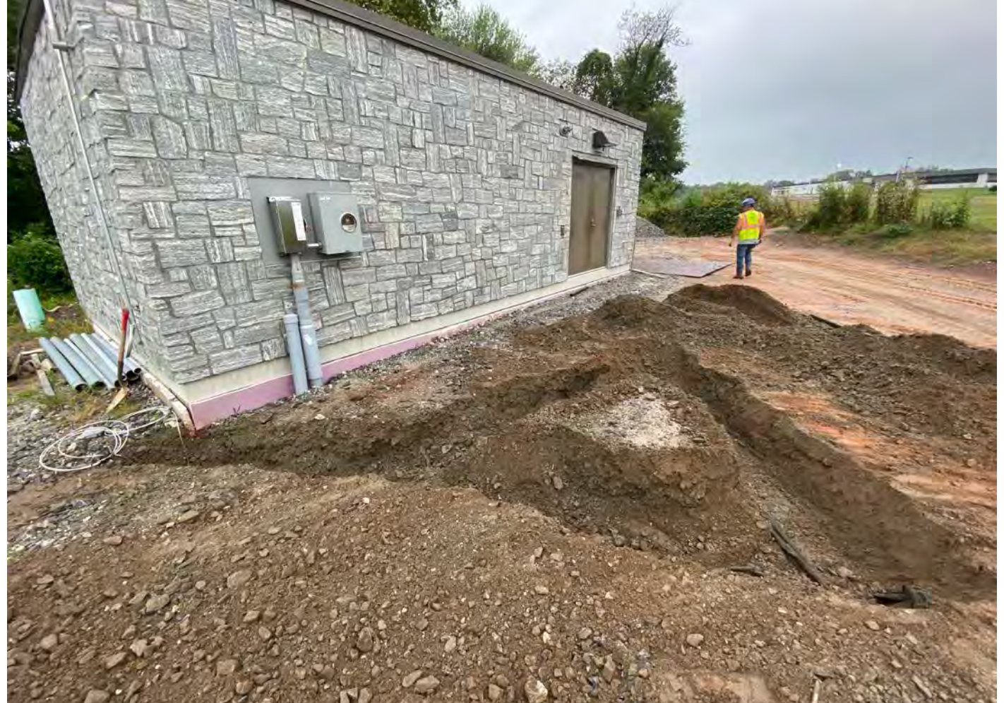
Picture 2: Ludlow excavating a trench for electrical grounding grid at the Booster Station in Middletown. View to the west.

Page: 5 of 14 Contractor: Ludlow Construction