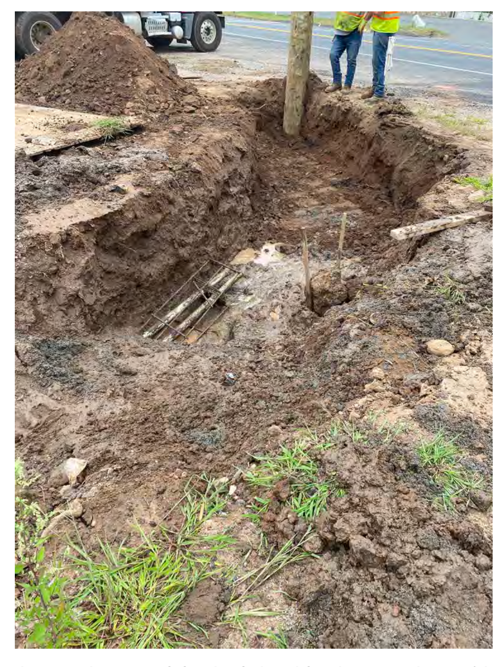
Picture 3: Ludlow locates and exposes existing electrical conduit and excavates the rest of the trench to the utility pole at the Booster Station. View to the northeast.

Contractor: Ludlow Construction Page: 6 of 14