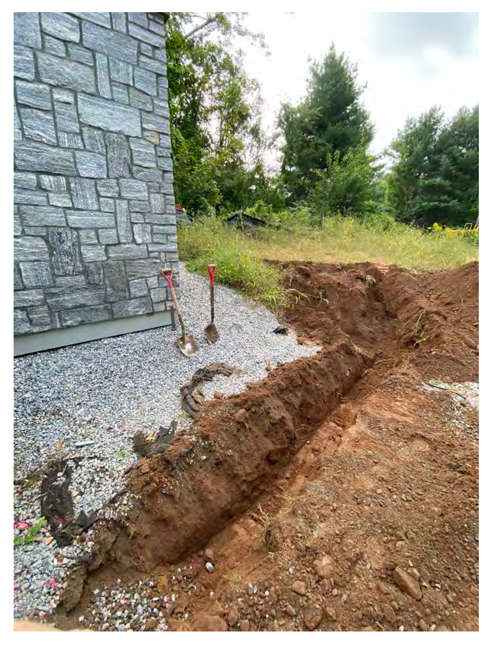
Picture 7: Ludlow excavating a trench for electrical grounding grid at the Meter Vault, South Main Street, Middletown. View to the south.