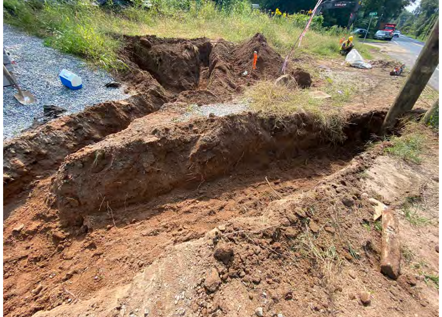
Picture 8: Ludlow excavates trench for power and communication connection to the Meter Vault, South Main Street, Middletown. View to the south.

Page: 11 of 14 Contractor: Ludlow Construction