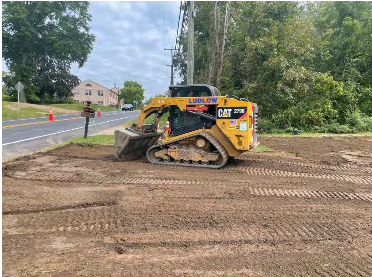
Picture 8: Ludlow grading loam they placed on the 22 Wallingford Road property to restore those areas of the lawn that were disturbed during the installation of a 1.5" copper water service line. View to the east.