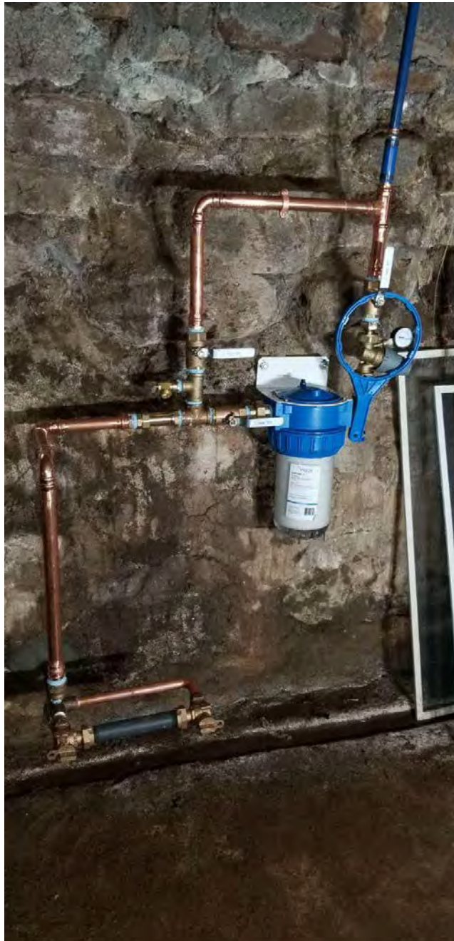
Picture 11: Final water service components that Fazzino Plumbing installed today at the residence located at 133 Maple Avenue, Durham.