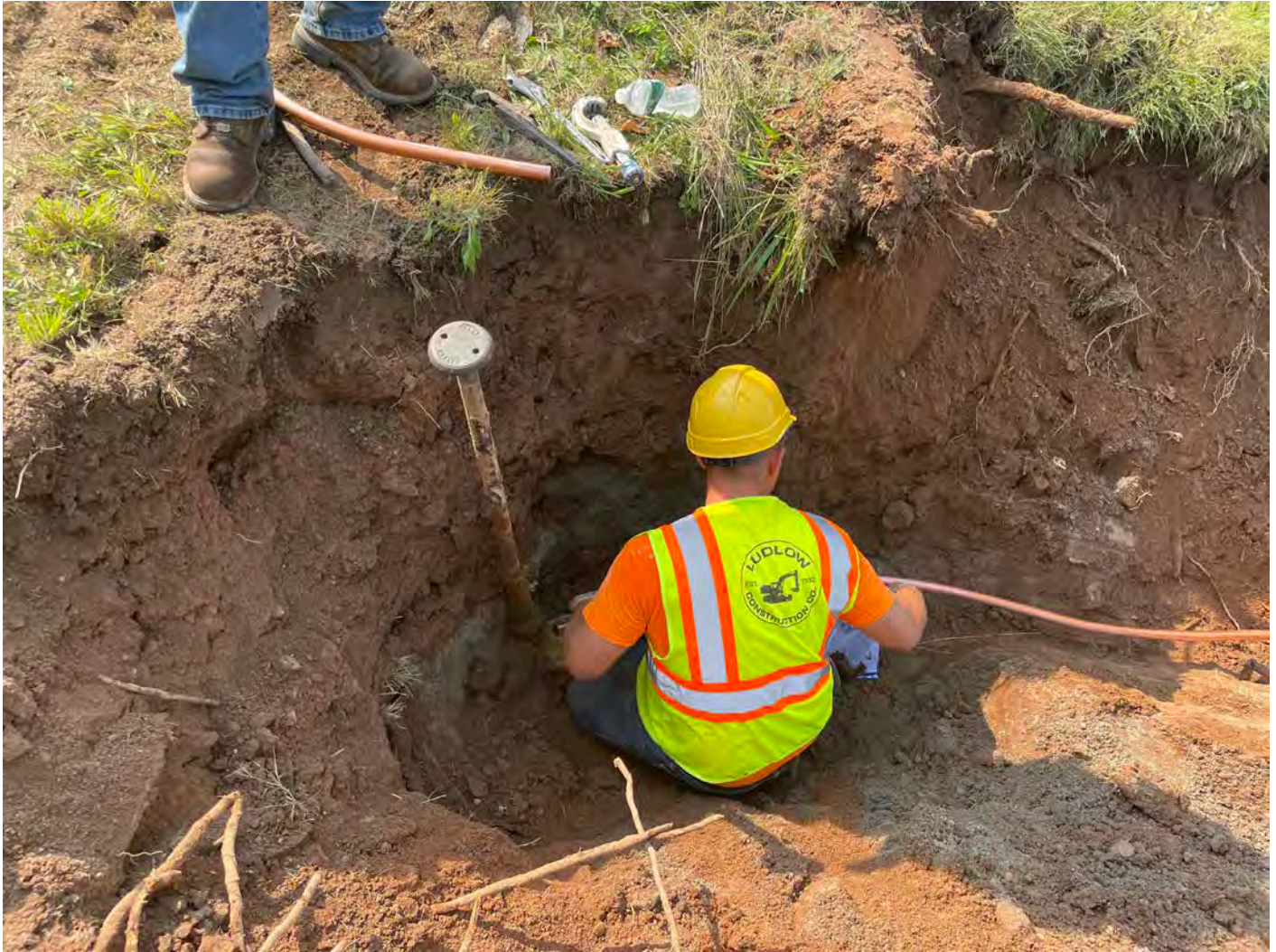
Picture 4: Ludlow connecting 1" copper water service line to the curb stop for the 148 Maple Avenue to property in Durham. View to the south.