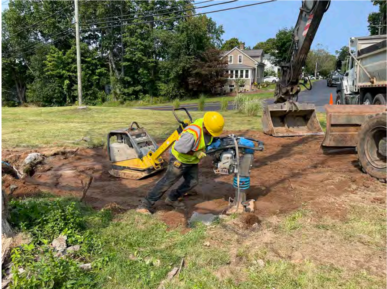
Picture 7: Ludlow compacting native fill that they backfilled into the trench at the 148 Maple Avenue residence in 1' lifts. View to the north.