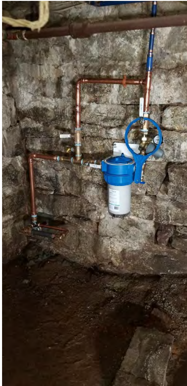
Picture 13: Final water service components that Fazzino Plumbing installed today at the residence located at 146 Maple Avenue, Durham.