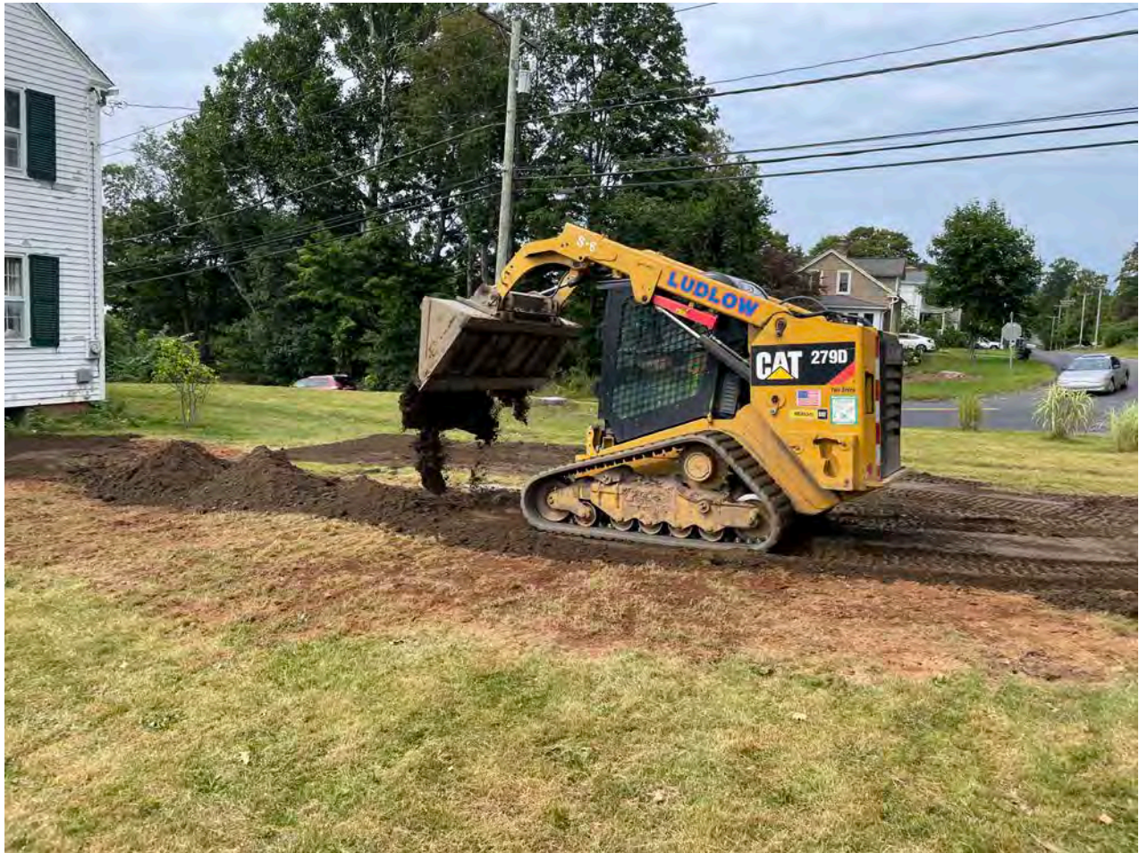
Picture 10: Ludlow placing loam on the areas of the 148 Maple Avenue property that were disturbed during the installation of a 1" copper water service line. View to the north.