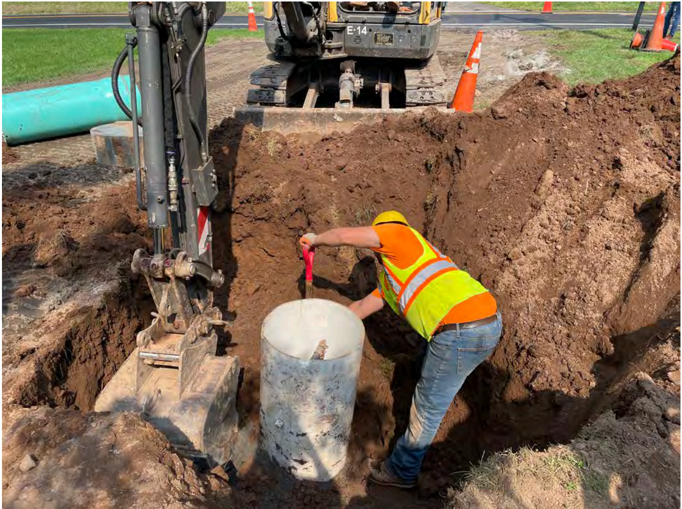
Picture 6: Ludlow removing the meter pit they damaged yesterday at 22 Wallingford Road in Durham as they prepare to replace it. View to the north.