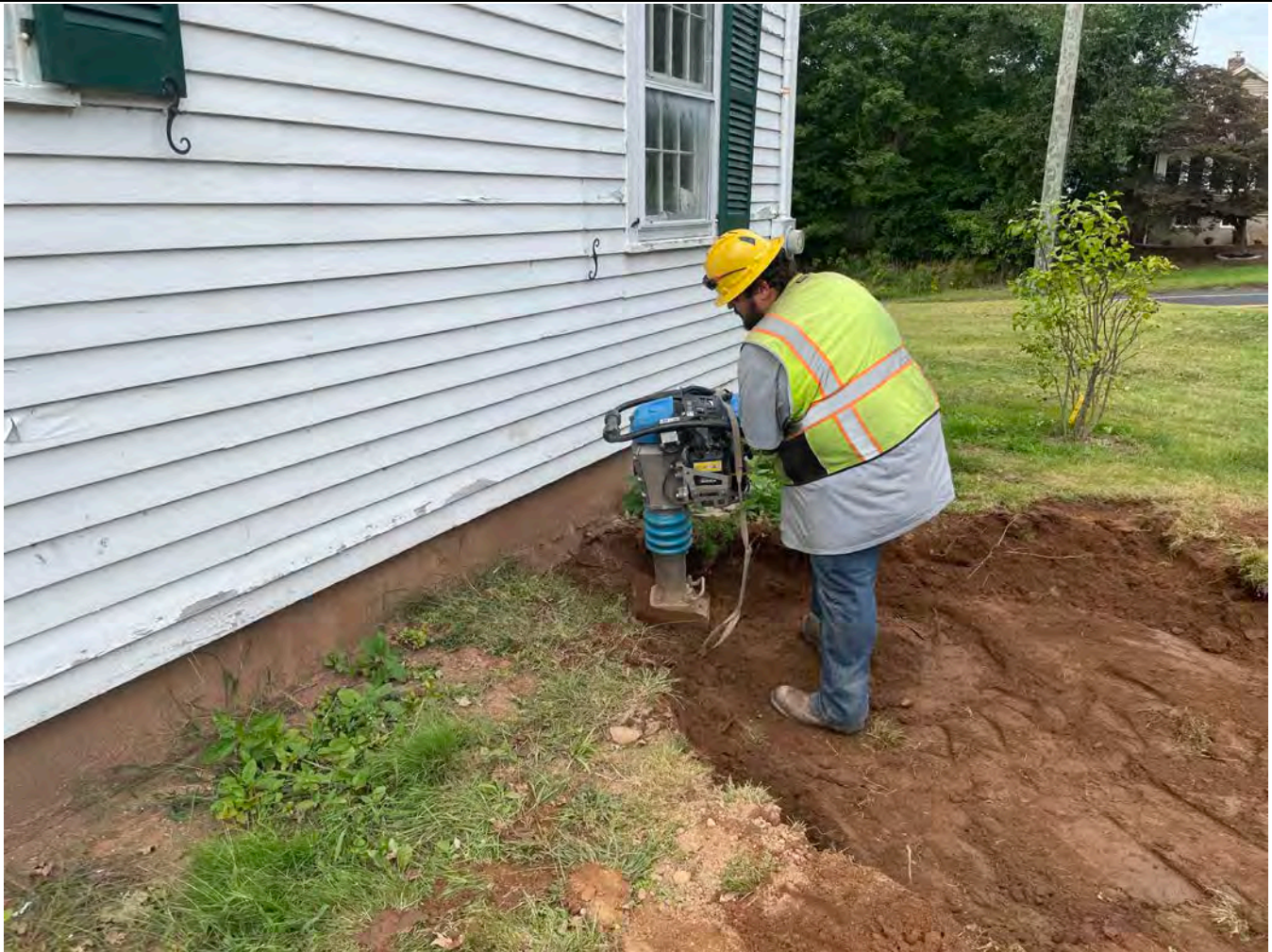
Picture 9: Ludlow compacting fill against the eastern foundation of the 148 Maple Avenue residence after installing a 1" copper water service line at the residence. View to the northwest.