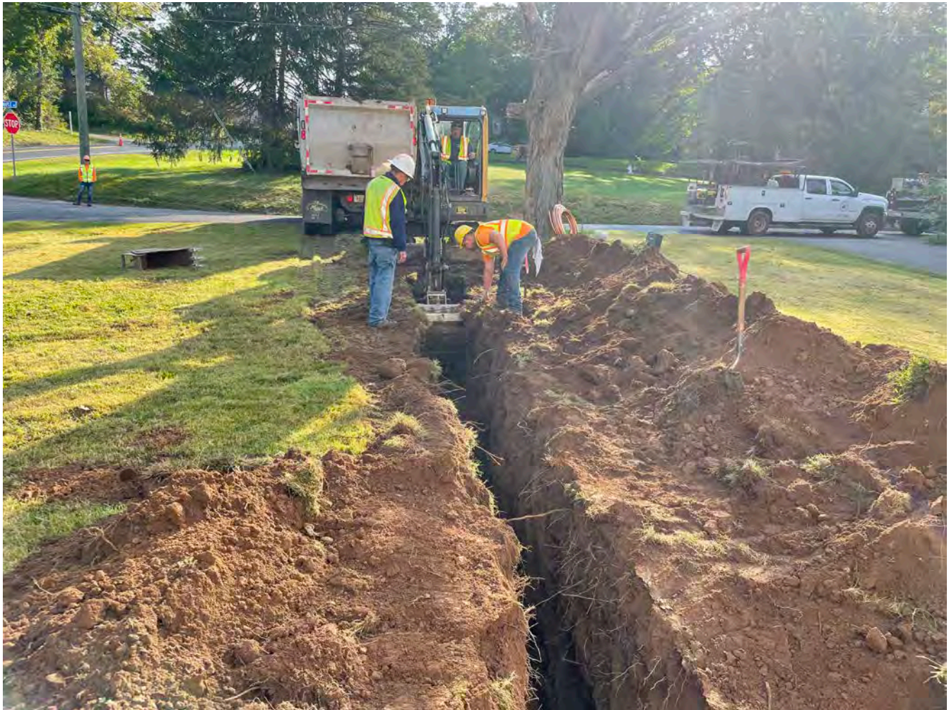
Picture 1: Ludlow excavating a trench at the 148 Maple Avenue property for the installation of a 1" copper water service line. View to the east.