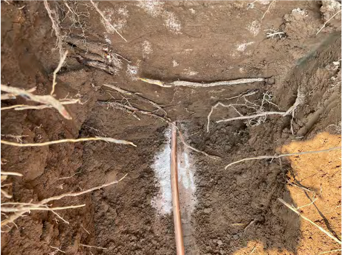
Picture 5: 1" copper water service line that Ludlow has inserted through the foundation for the 148 Maple Avenue residence, prior to securing it in place with non-shrink grout. View to the west.