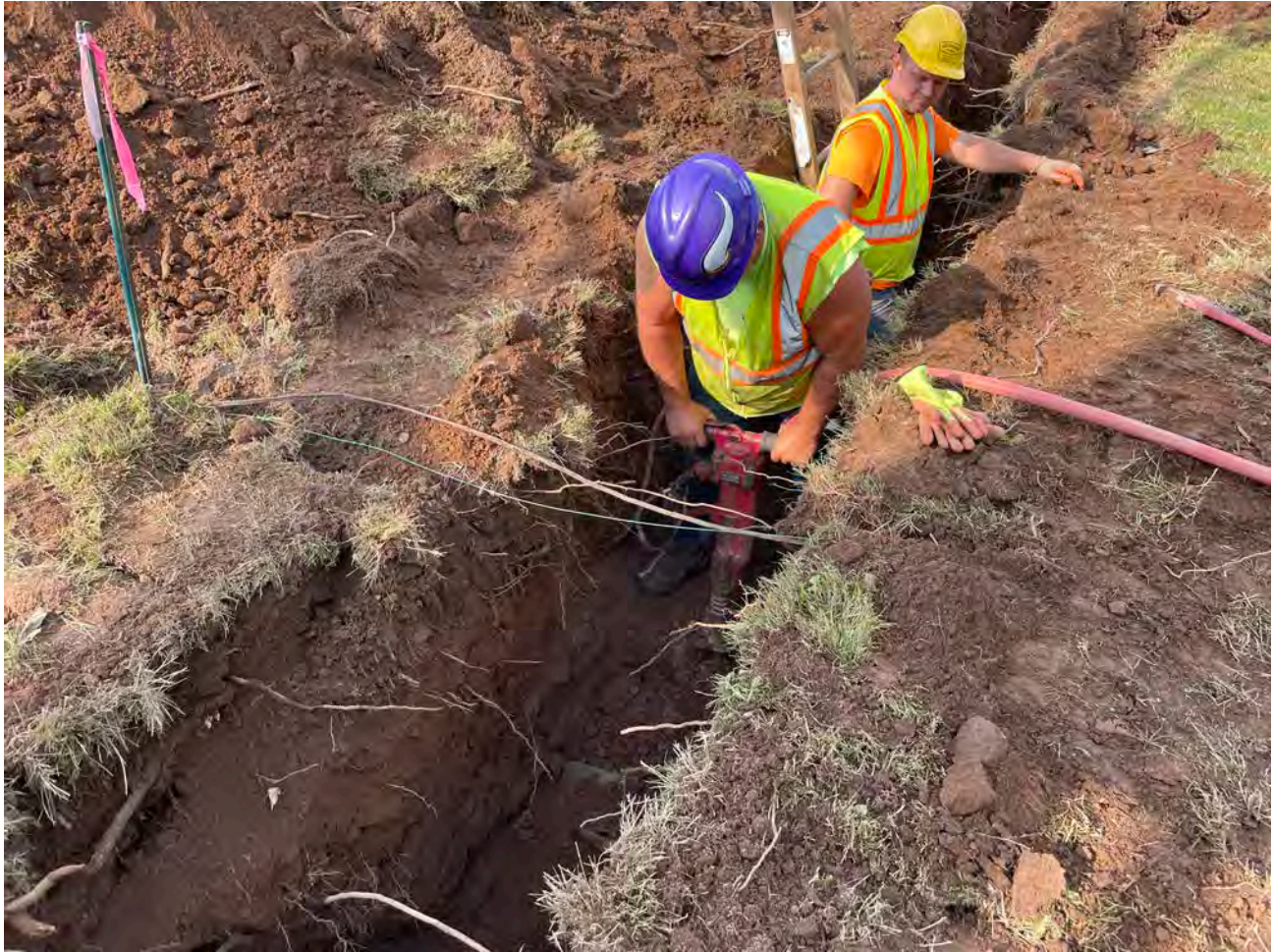
Picture 2: Ludlow jackhammering rock they encountered while excavating a trench at the 148 Maple Avenue property in Durham. View to the west.