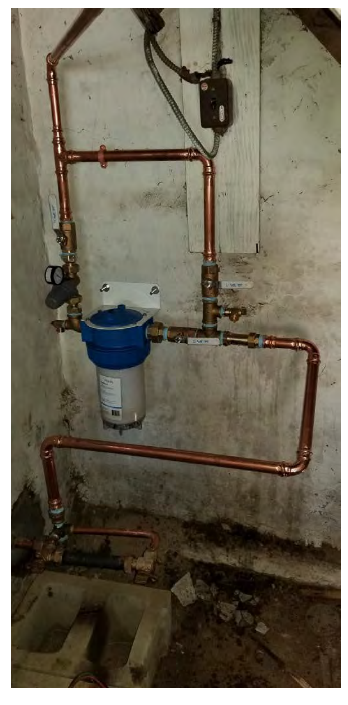
Picture 12: Final water service components that Fazzino Plumbing installed today at the residence located at 47 Wallingford Road, Durham.