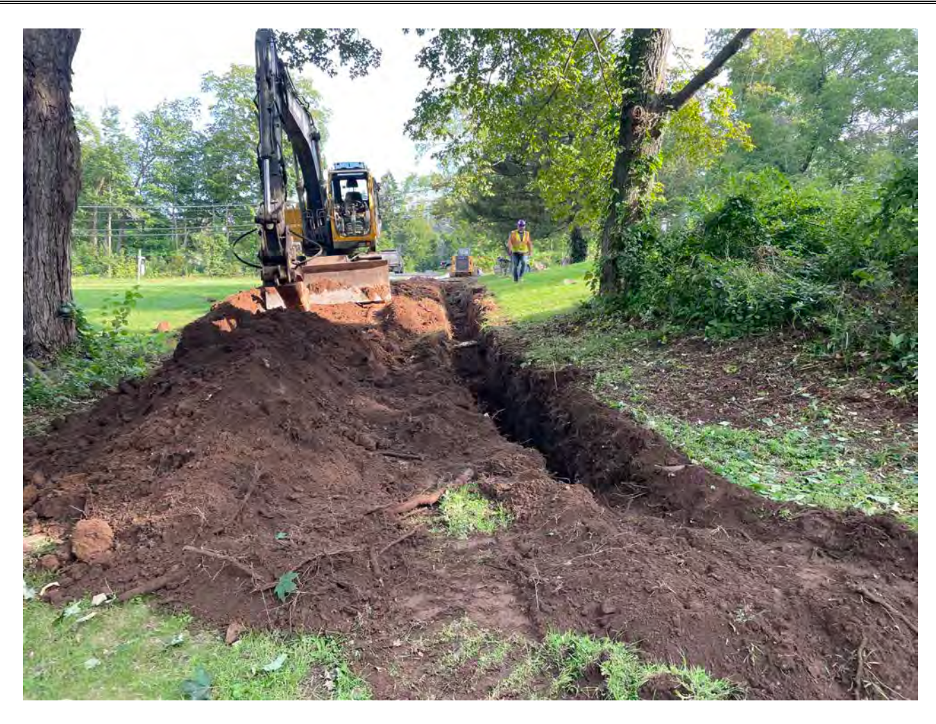
Picture 2: View of the trench that Ludlow is excavating at the 22 Wallingford Road, Durham, residence for the installation of a 1.5" copper water service line. View to the north.