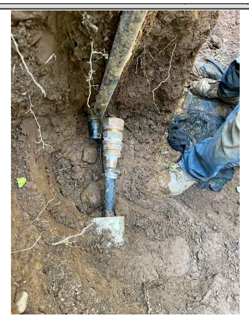
Picture 8: Brass fitting that Ludlow connected to the 1" HDPE well water line that penetrates the western foundation of the 22 Wallingford Road property in Durham. Ludlow ended up connecting the 1.5" copper water service line to the compression fitting located on the opposite end of the brass fitting.