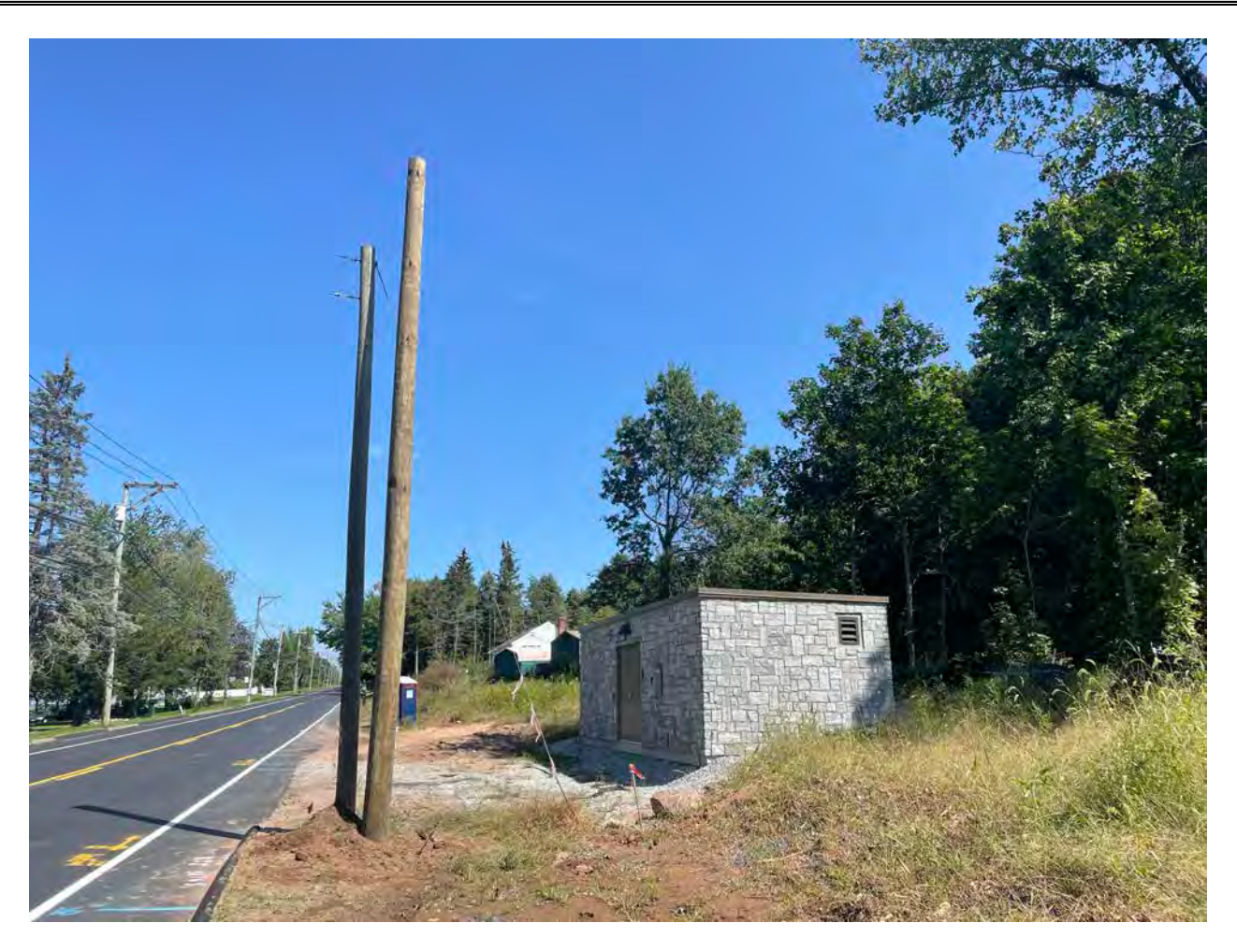
Picture 7: One pole that Frontier installed today at the water meter building. View to the north.