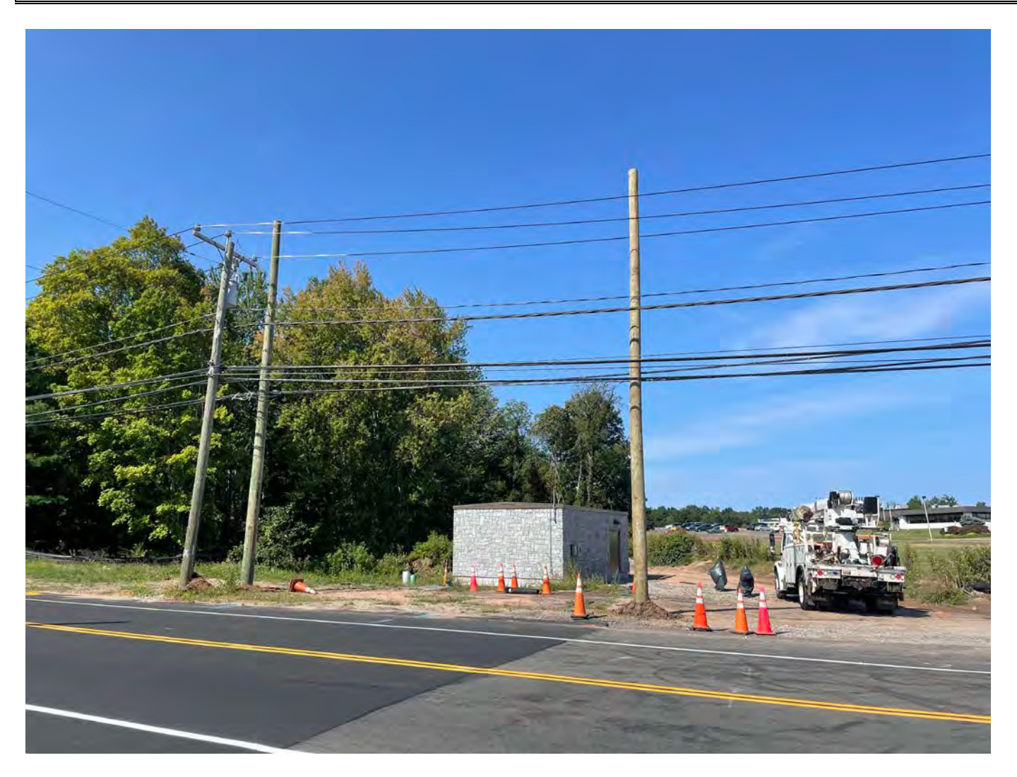
Picture 6: Two poles that Frontier installed today at the booster station. View to the west.