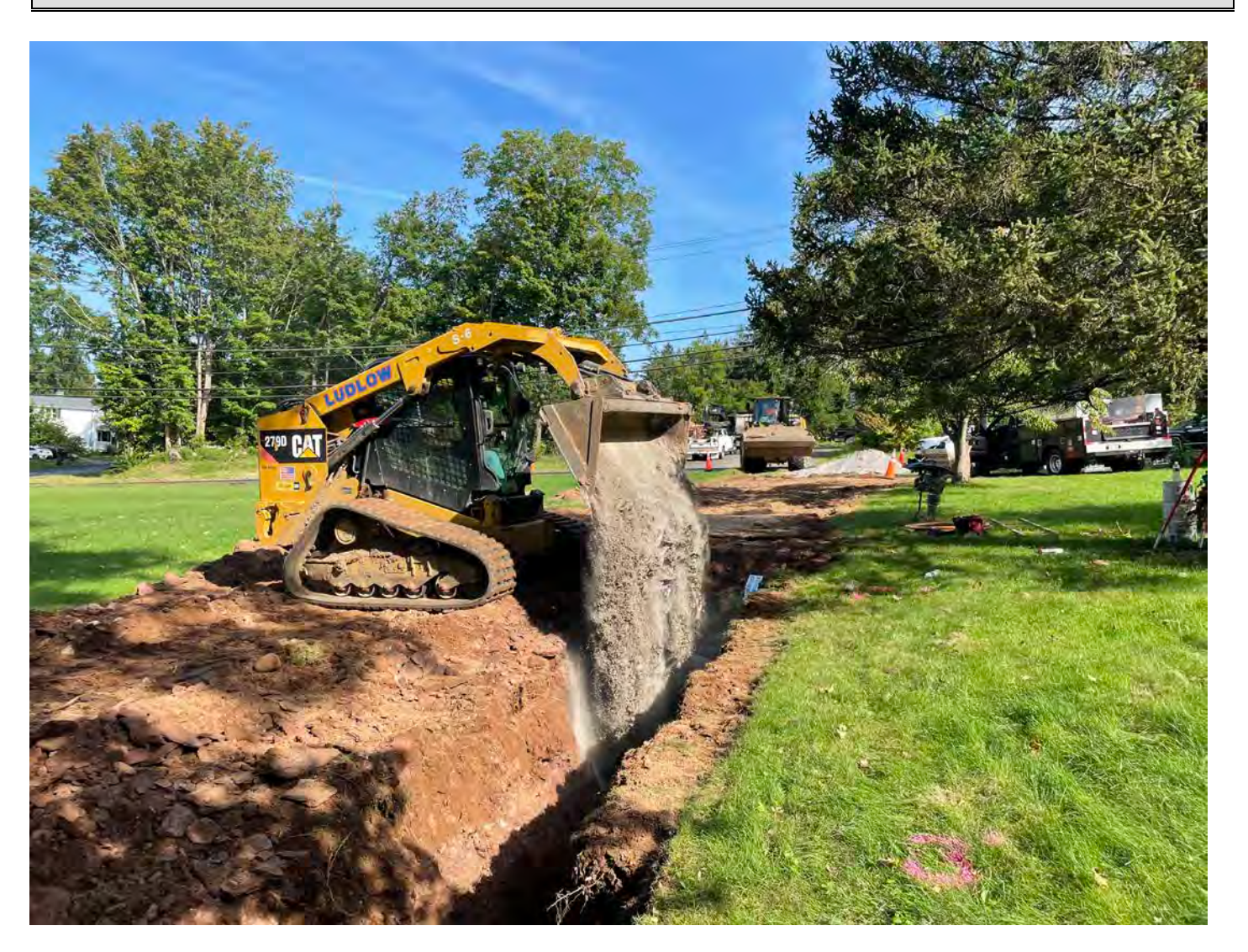
Picture 4: Ludlow placing sand over the 1.5" copper water service line they are installing at the 22 Wallingford Road, Durham, residence. View to the north.