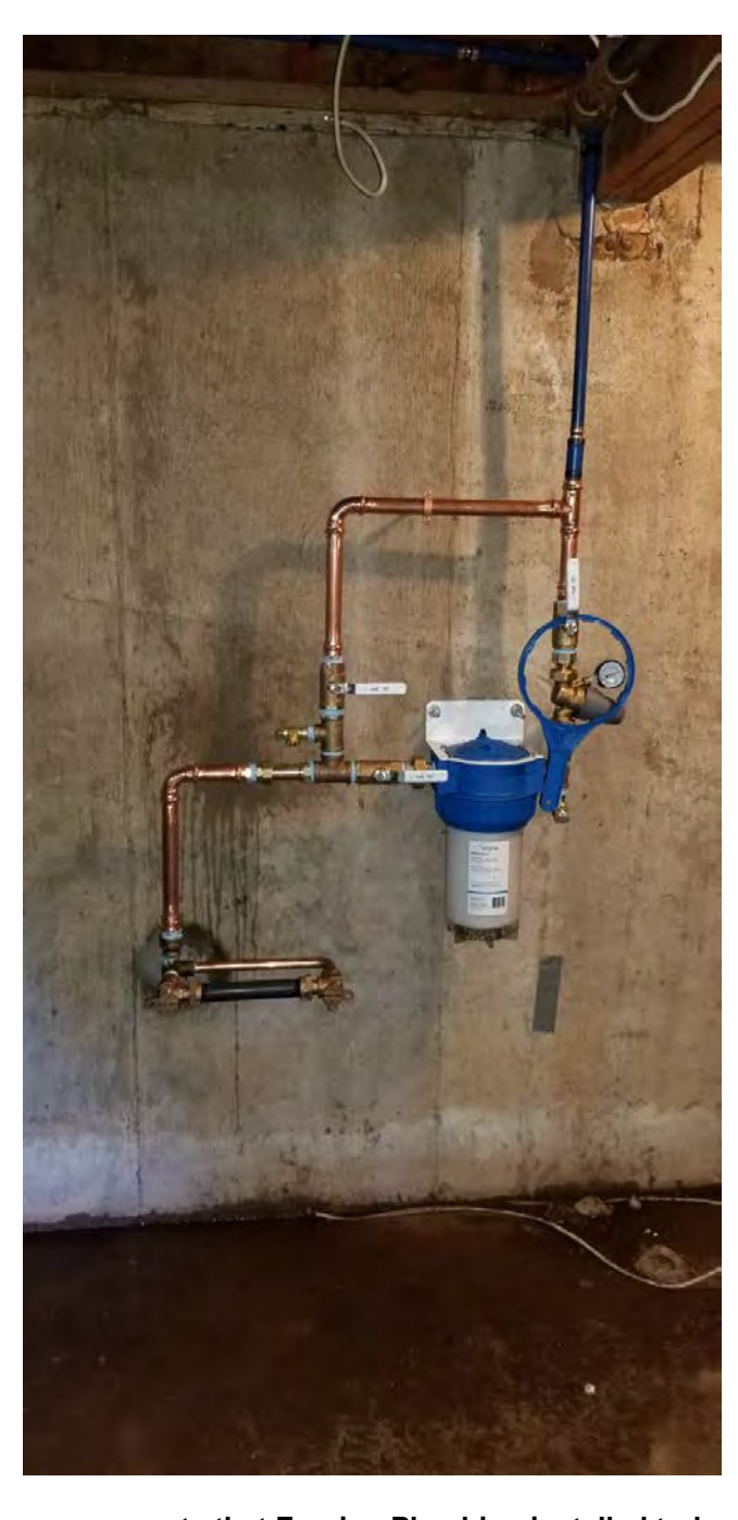
Picture 10: Final water service components that Fazzino Plumbing installed today at the residence located at 17 Wallingford Road, Durham.