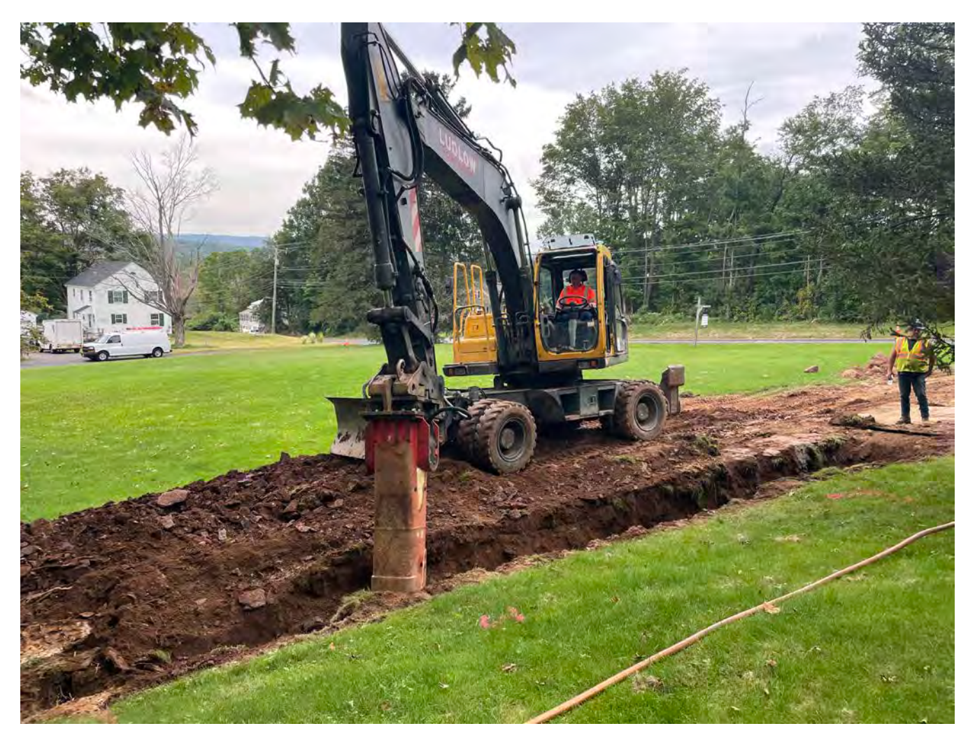
Picture 1: Ludlow breaking up rock as they continue to excavate a trench at the 22 Wallingford Road, Durham, residence for the installation of a 1.5" copper water service line. View to the northwest.