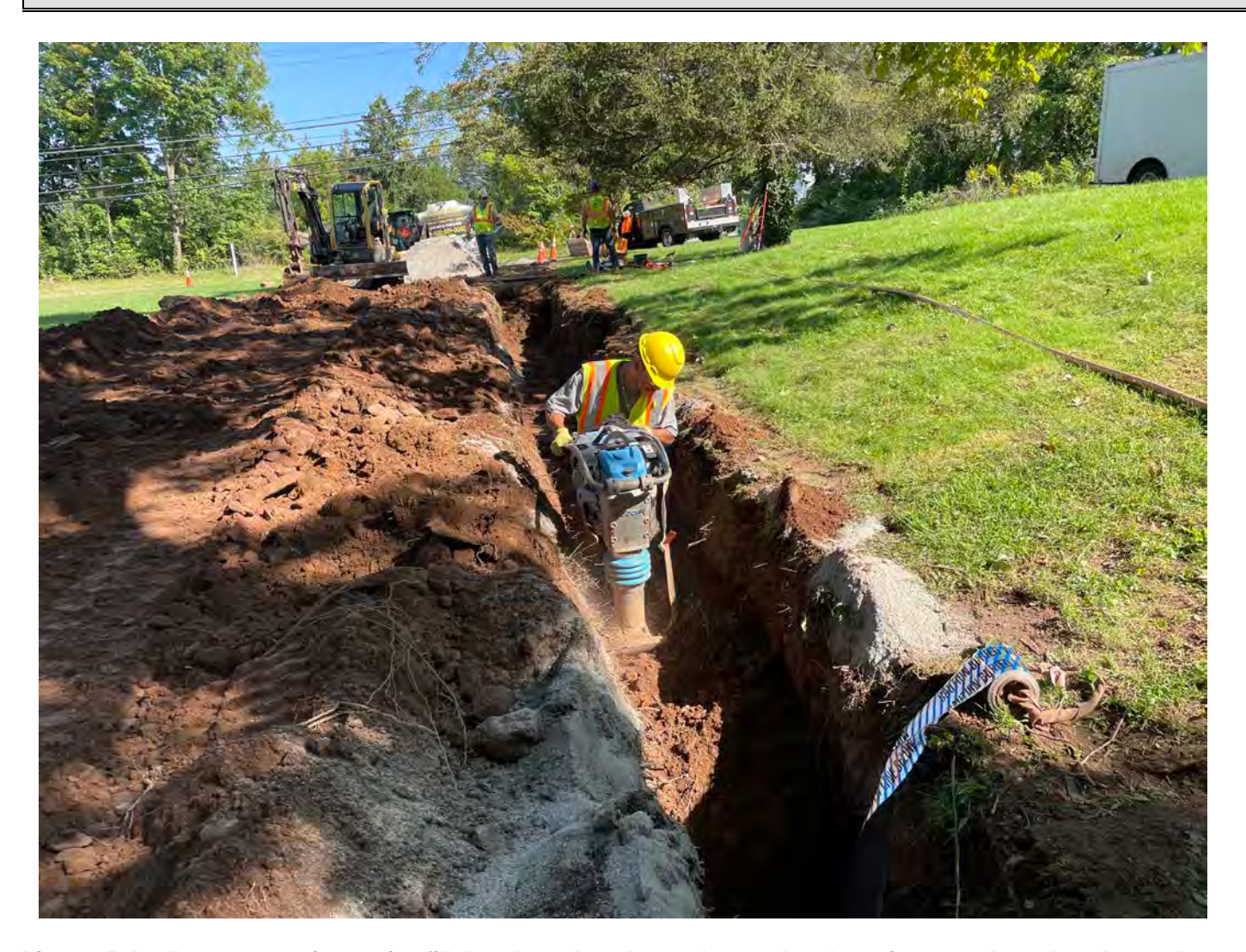
Picture 5: Ludlow compacting native fill that they placed over the sand and caution tape they placed over the 1.5" copper water service line they installed at the 22 Wallingford Road property. View to the north.