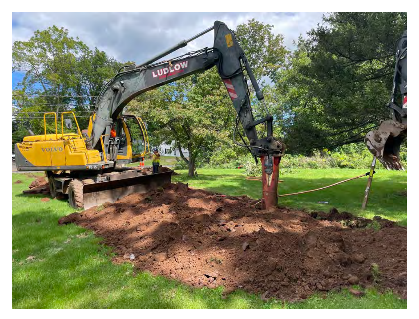
Picture 10: Ludlow hammering rock at the 22 Wallingford Road property for the installation of a 1.5" copper water service line. View to the northeast.