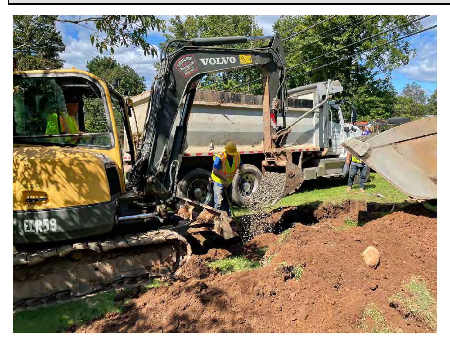
Picture 6: Ludlow placing a bed of gravel for the placement of a meter pit at the 22 Wallingford Road property. View to the west.