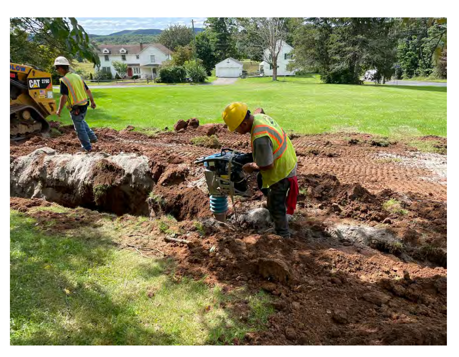
Picture 11: Ludlow compacting backfill with a jumping jack as part of the water service installation activities at the 22 Wallingford Road residence. View to the southwest.

Contractor: Ludlow Construction Page: 13 of 14