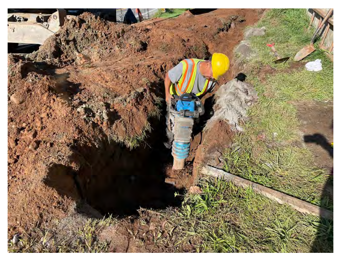
Picture 3: Ludlow compacting backfill with a jumping jack as part of the water service installation activities at the 47 Wallingford Road residence. View to the west.