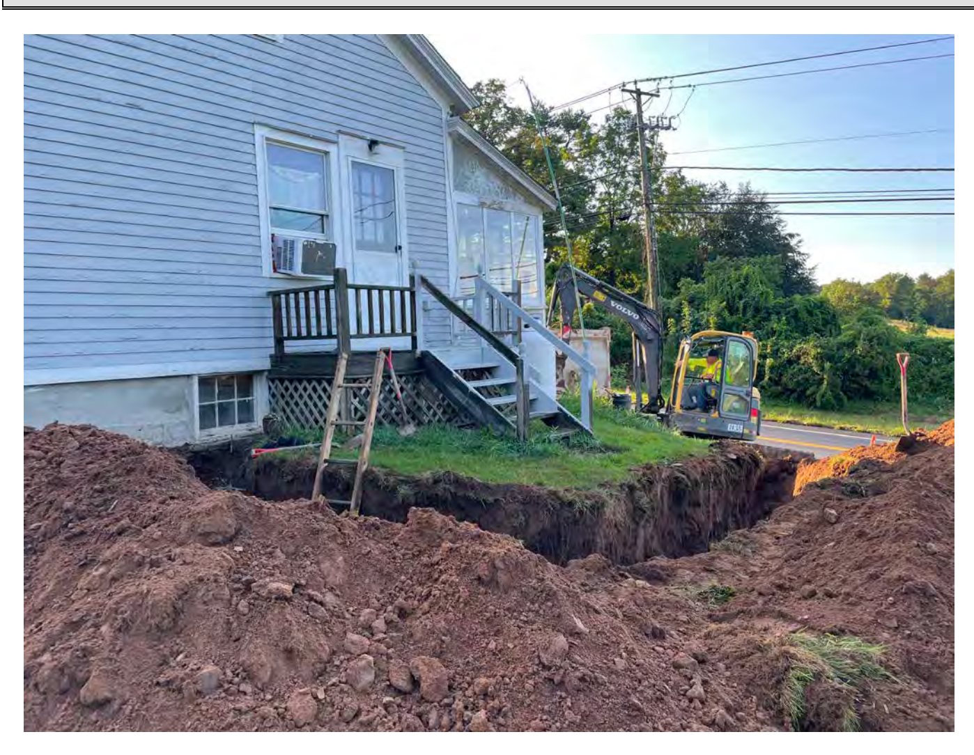
Picture 1: Ludlow excavating on the west side of the 47 Wallingford Road, Durham, residence for the installation of a 1" copper water service line. View to the south.

Contractor: Ludlow Construction Page: 3 of 14