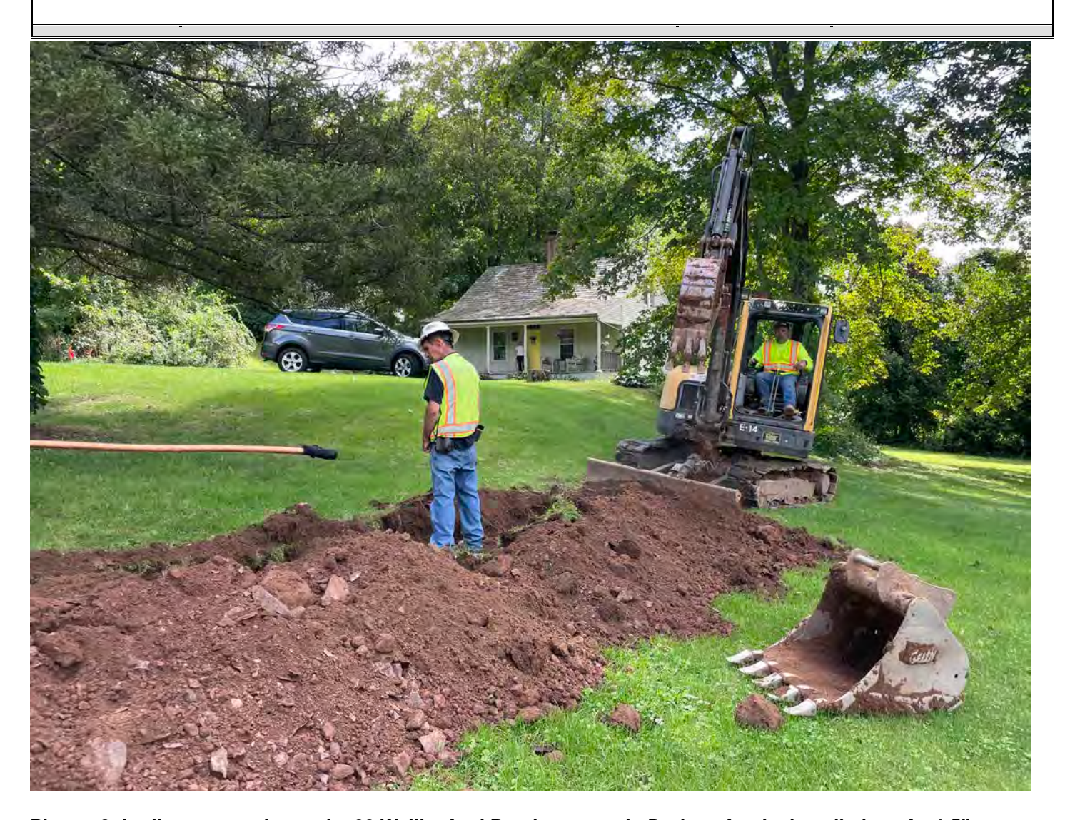
Picture 8: Ludlow excavating at the 22 Wallingford Road property in Durham for the installation of a 1.5" copper water service line. View to the south.