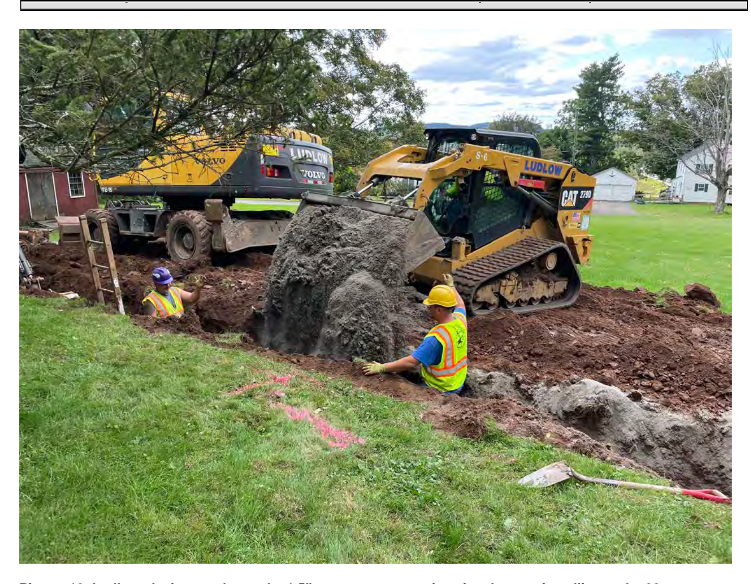
Picture 12: Ludlow placing sand over the 1.5" copper water service pipe they are installing at the 22 Wallingford Road property. View to the southwest.

Contractor: Ludlow Construction Page: 14 of 14