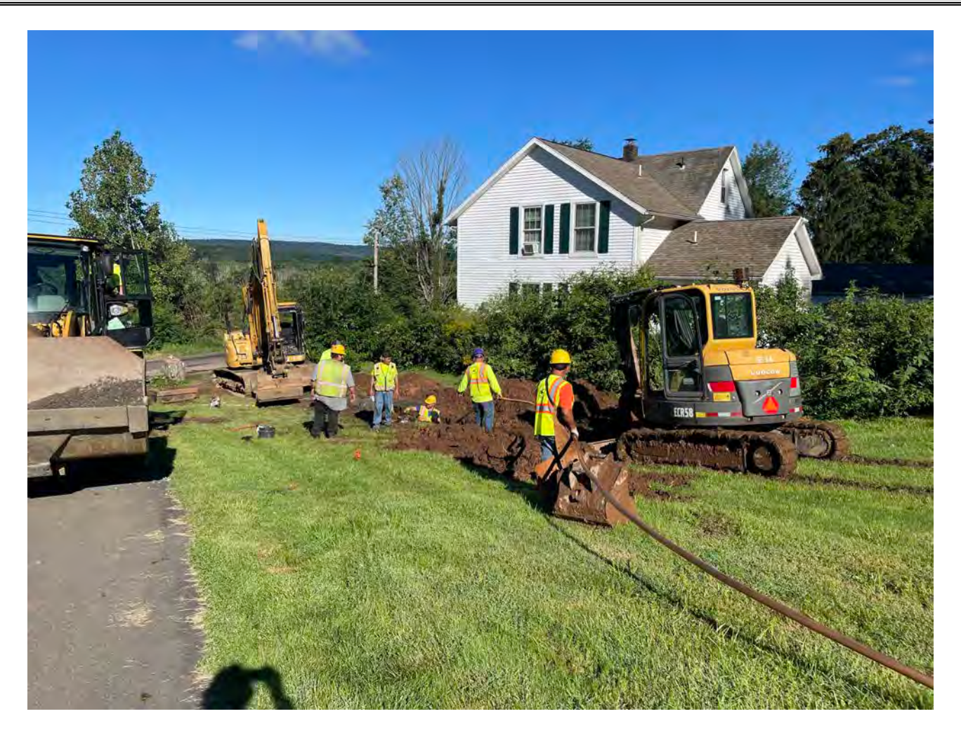
Picture 2: Ludlow installing 1.5" copper water service pipe at the 129 Maple Avenue property. View to the north.