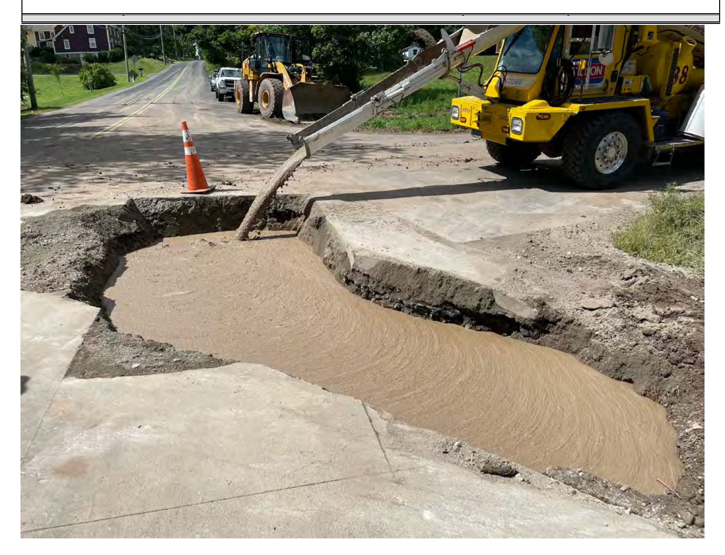
Picture 8: Tilcon placing flowable fill into the excavation at Station 410+47 under the direction of Ludlow. View to the west.