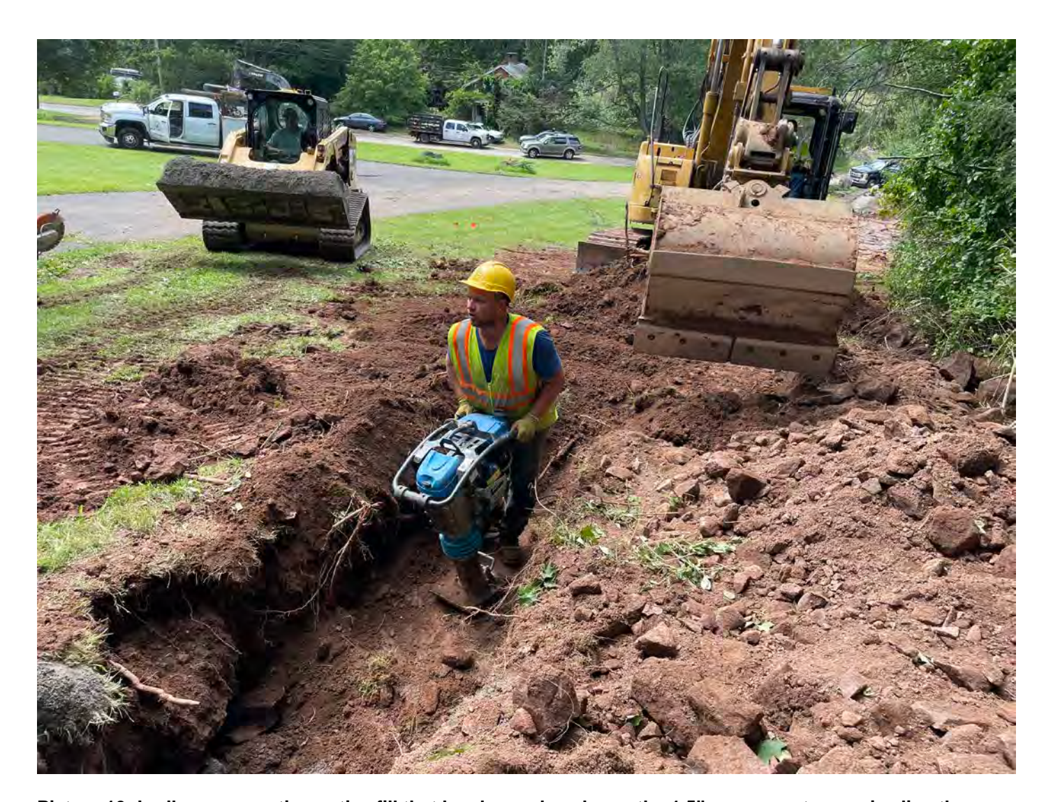
Picture 10: Ludlow compacting native fill that has been placed over the 1.5" copper water service line they installed at the 129 Maple Avenue property. View to the west.