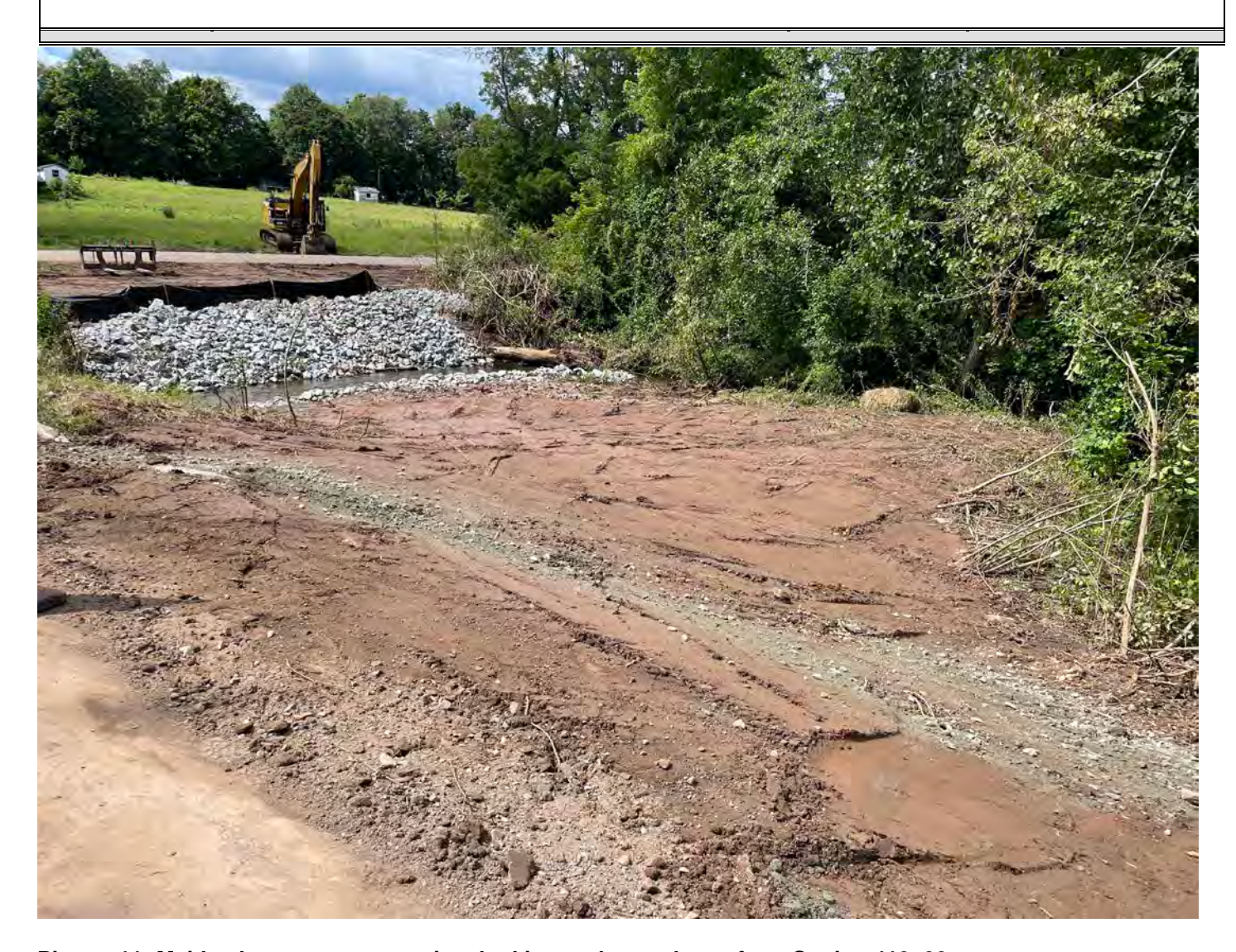
Picture 11: Maiden Lane stream crossing, looking to the northeast from Station 412+20.