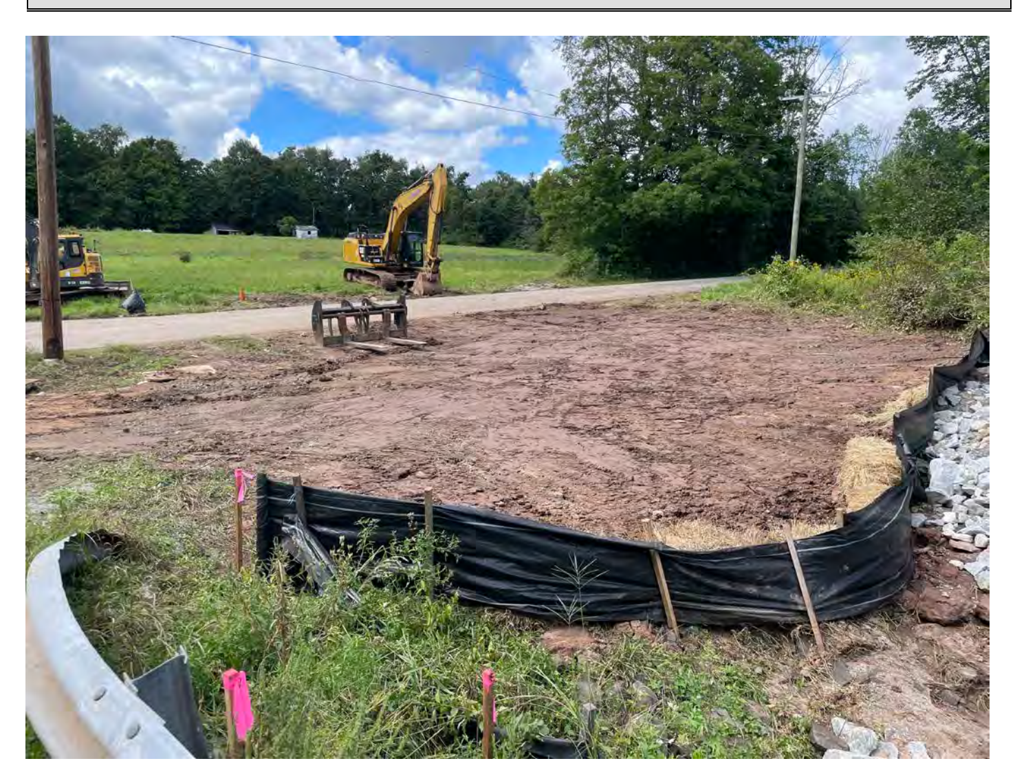
Picture 12: Area located on the west bank of Ball Brook at the Maiden Lane stream crossing. View to the northwest.

Contractor: Ludlow Construction Page: 15 of 15