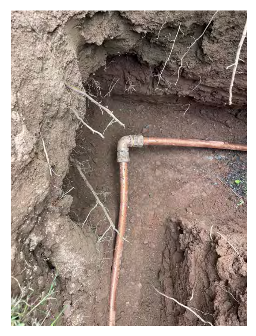
Picture 9: Union between two sections of 1.5" copper water service line that Ludlow installed at the 129 Maple Avenue residence.