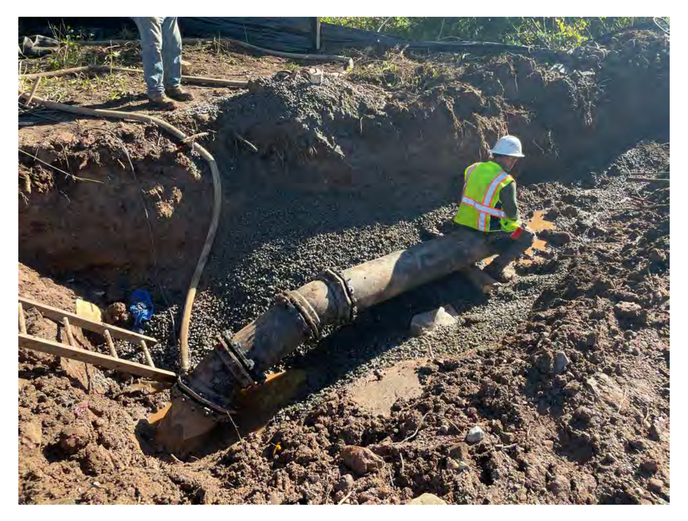
Picture 3: Section of 12" DIP that Ludlow connected to the 12" DIP coming off the east side of the Maiden Lane Stream crossing. View to the southeast.