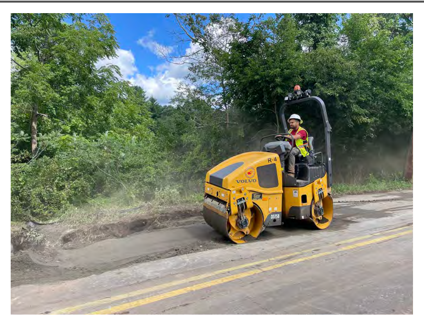
Picture 7: Ludlow using a rolling compactor on the backfilled excavation at Station 412+20. View to the northeast.