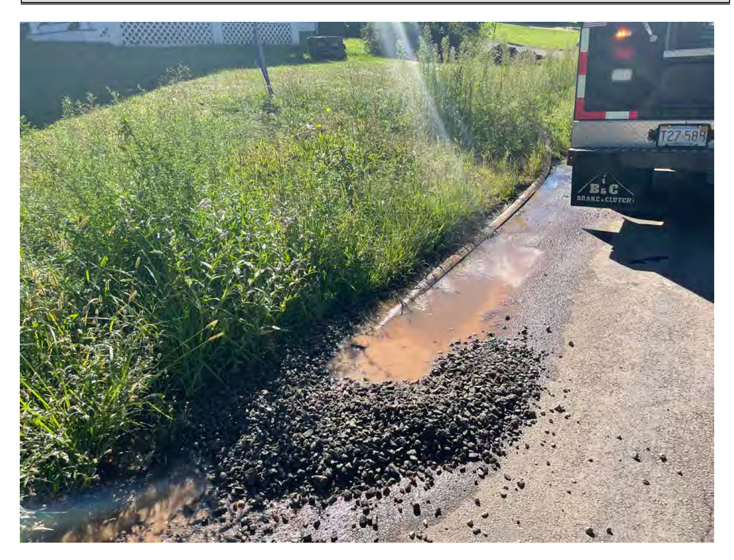
Picture 4: Water being discharged to the east side of Maple Avenue that is being pumped from the excavation at the 129 Maple Avenue, Durham, property. The water was later redirected into a silt bag. View to the southeast.