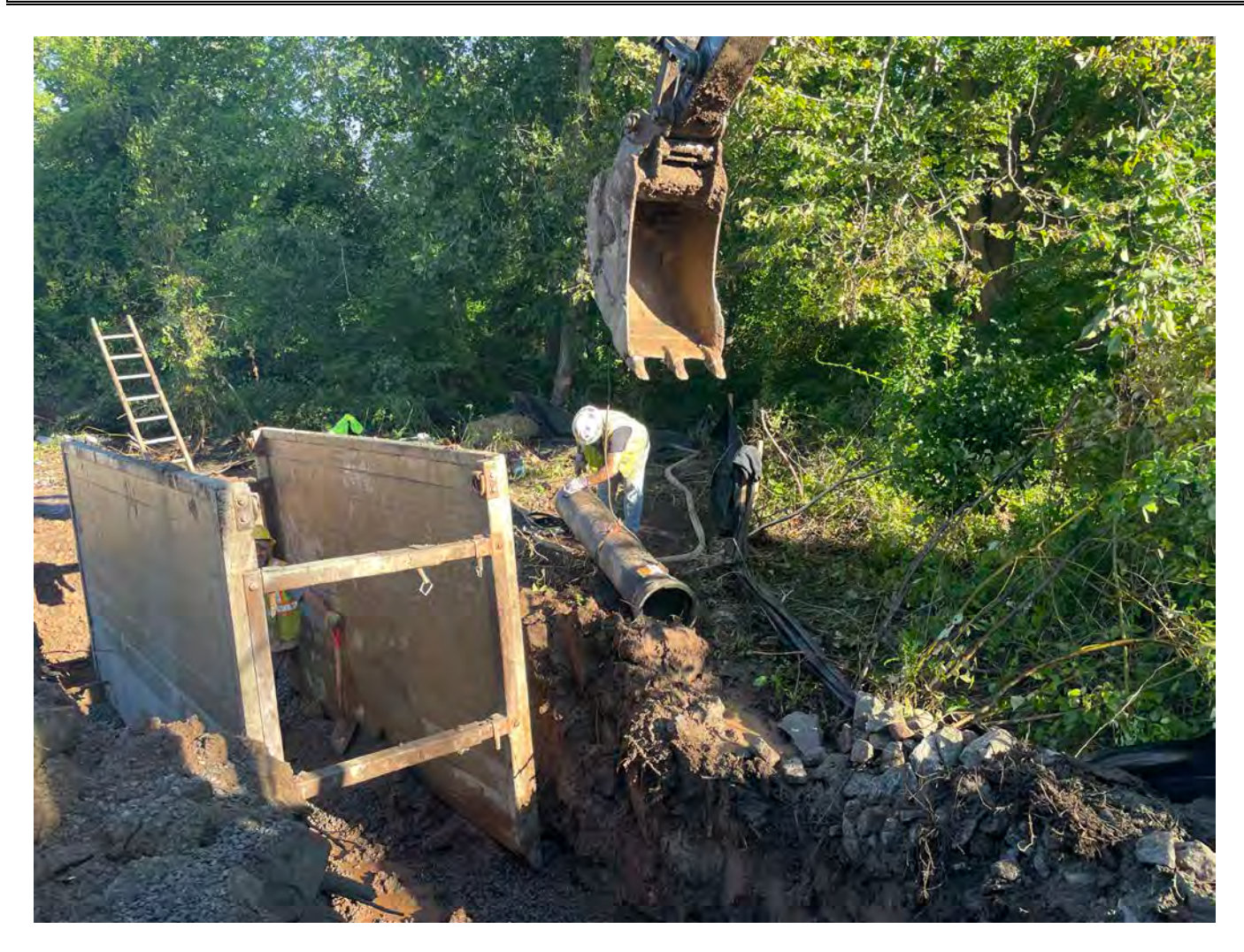
Picture 1: Ludlow installing 12" DIP to the northwest of Station 412+20. View to the north.