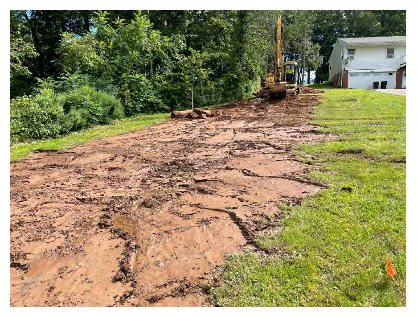
Picture 6: Portion of the lawn at 129 Maple Avenue that was disturbed during the installation of 1.5" copper water service line. View to the east.