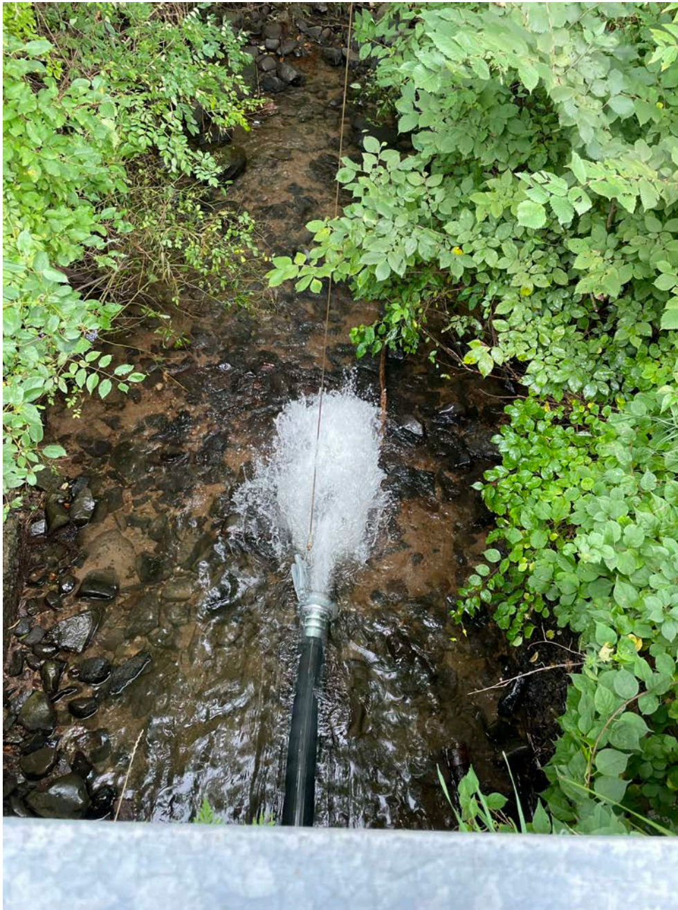
Picture 9: Stream water that is pumped from upstream of the Maiden Lane work zone. The water is being discharged back into Ball Brook, downstream of the bridge on Maiden Lane. View to the south.