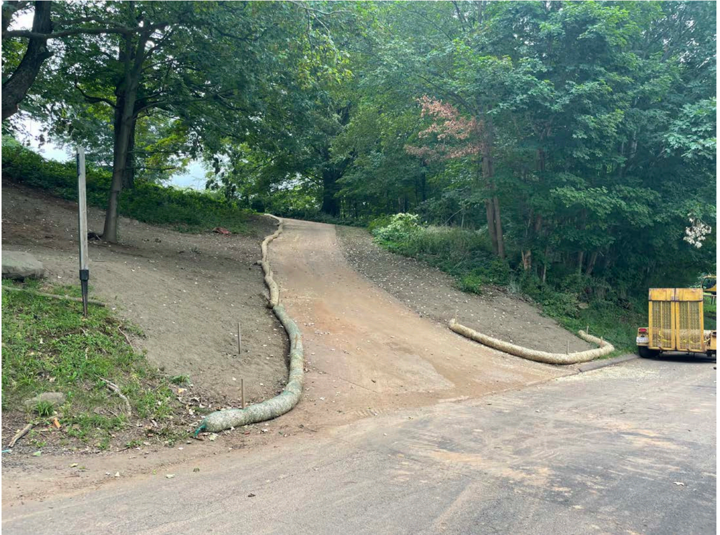
Picture 4: Straw wattles that Ludlow placed at the 95R Main Street property after the installation of a copper water service line. View to the southeast.