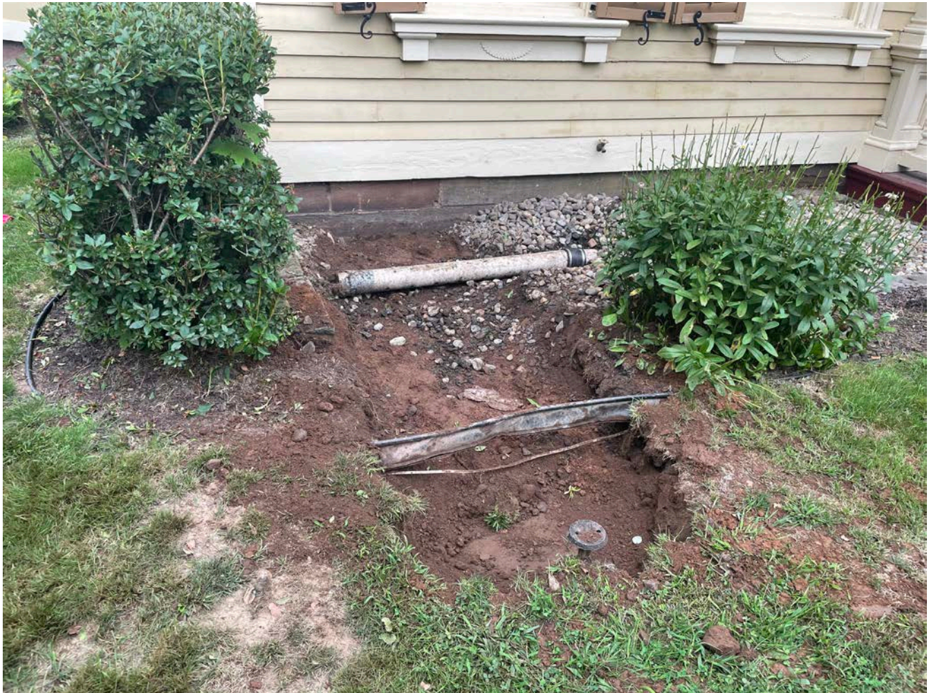
Picture 1: The eastern side of the 322 Main Street residence where Ludlow has daylighted utilities during the installation of a 1" copper water service line. View to the west.

Project: Durham Meadows Pipeline Installation Date: August 30, 2021 Location: Maple Avenue, Main Street, and Maiden Lane, Durham Day of Week: Monday Project #: AECOM: 6061487 Report No: 313 Contractor: Ludlow Construction Page: 4 of 16