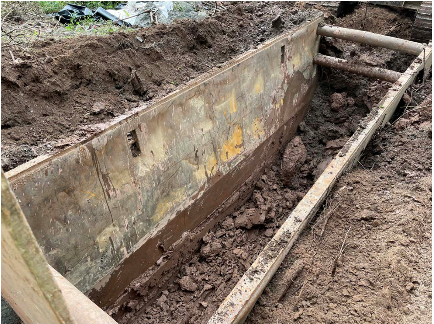
Picture 8: View Inside of the trench box after Ludlow has excavated within the box's footprint as part of the Maiden Lane stream crossing activities. View to the southwest.

Project: Durham Meadows Pipeline Installation Date: August 30, 2021 Location: Maple Avenue, Main Street, and Maiden Lane, Durham Day of Week: Monday Project #: AECOM: 6061487 Report No: 313 Contractor: Ludlow Construction Page: 11 of 16