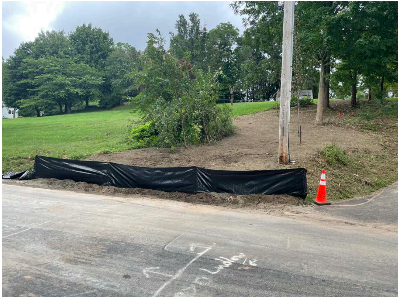
Picture 3: Silt fence that Ludlow erected at the 109 Main Street property after they installation of a copper water service line. View to the east.