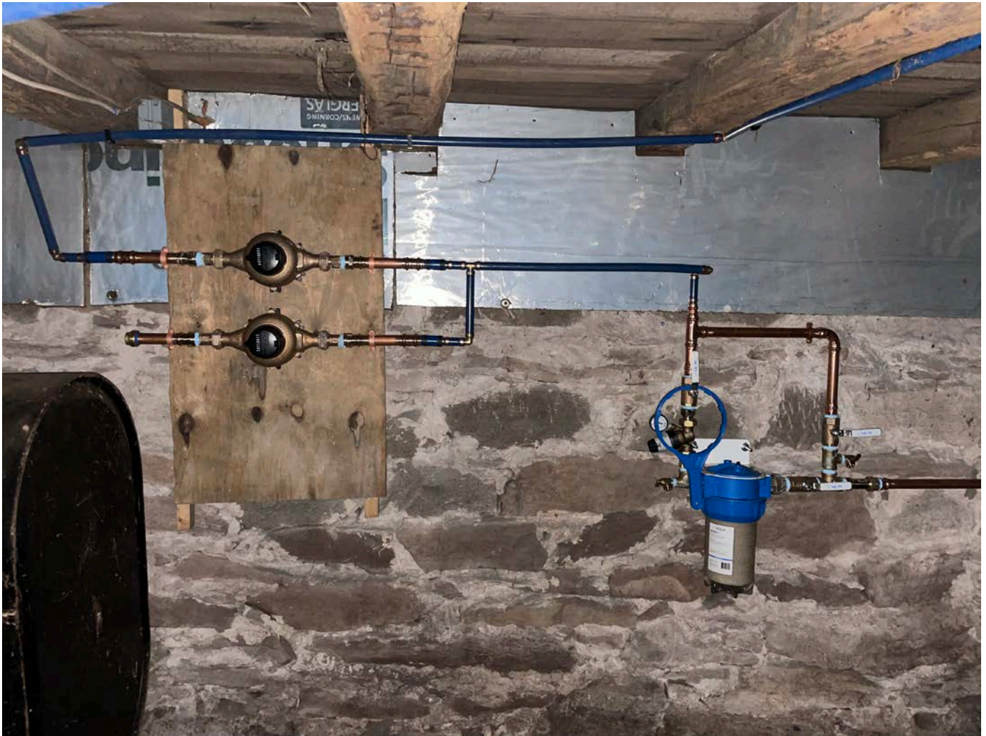
Picture 12: View of submeters that Fazzino Plumbing installed today at the 227 Main Street, Durham, residence.