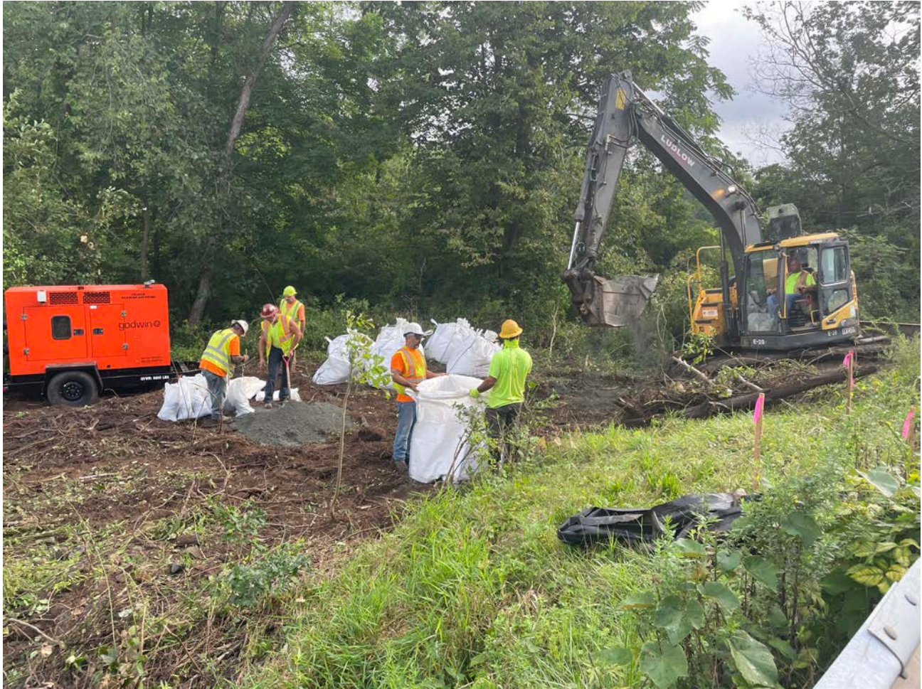
Picture 2: Ludlow filling sand bags that they will use to build coffer dams at the Maiden Lane stream crossing. View to the northeast.