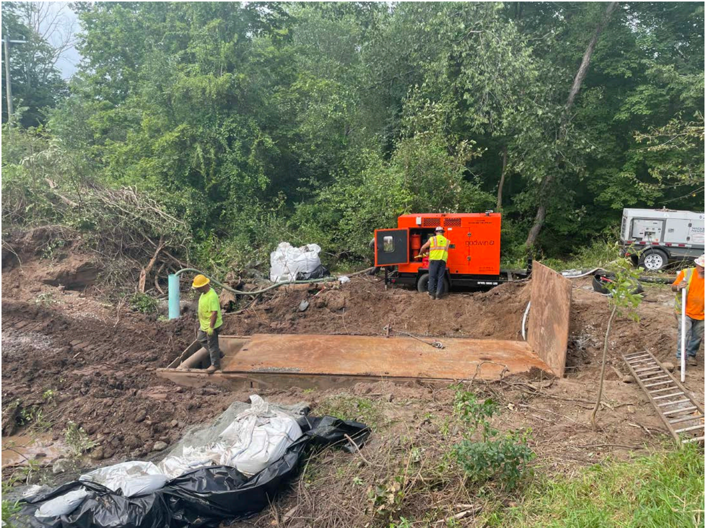
Picture 11: Ludlow securing the trench box at the Maiden Lane stream crossing at the end of the day with steel plates placed on top of it. View to the north.