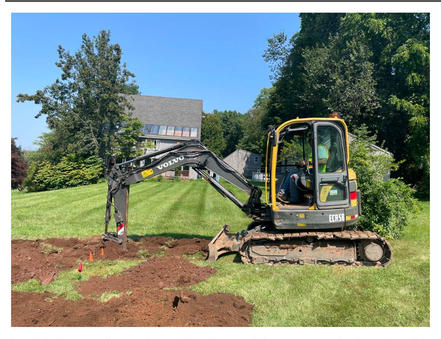
Picture 5: Ludlow excavating a trench ahead of the placement of 2" copper water service pipe at the 109 Maple Avenue property. View to the north.

Contractor: Ludlow Construction Page: 7 of 9