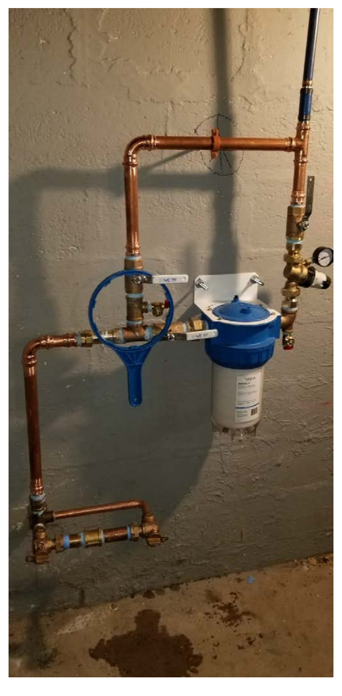
Picture 7: Installation of final water service components at 29 Maple Avenue, Durham.