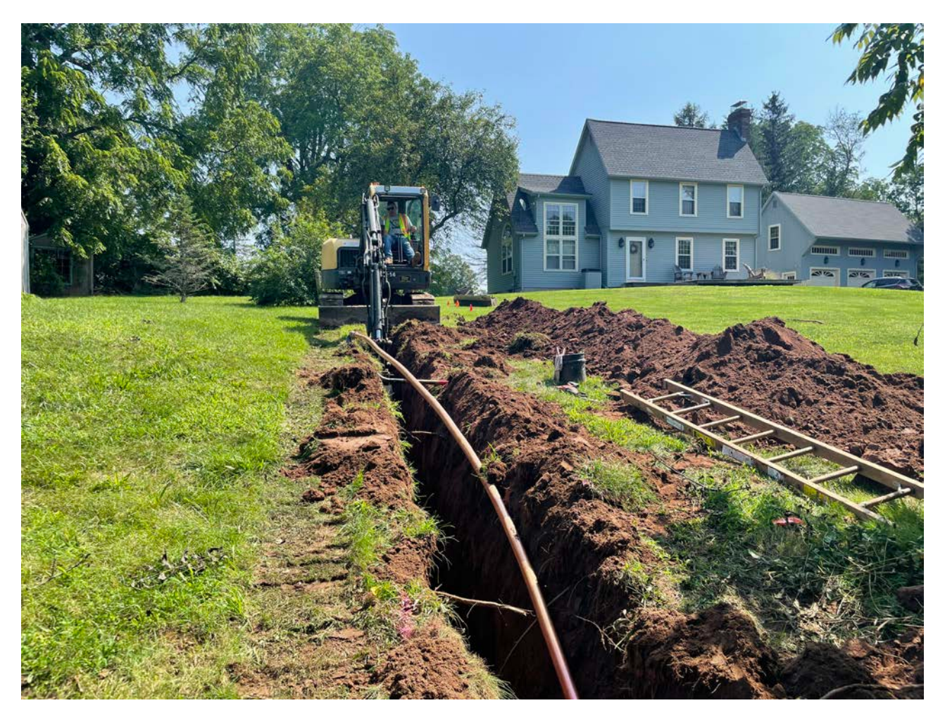
Picture 3: Ludlow excavating a trench ahead of the placement of 2" copper water service pipe at the 109 Maple Avenue property. View to the east.

Contractor: Ludlow Construction Page: 5 of 9