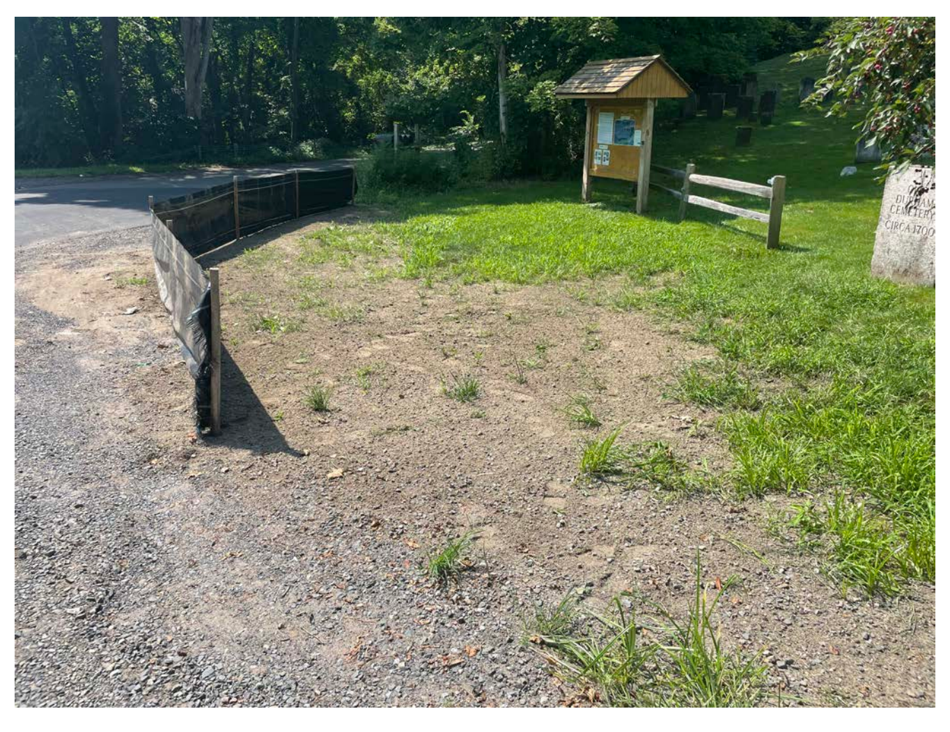
Picture 6: Loam, grass seed, and silt fence placed in front of the cemetery located on the corner of Main Street and Old Cemetery Road. View to southwest.

Contractor: Ludlow Construction Page: 8 of 9