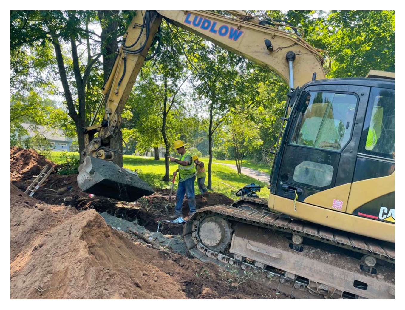
Picture 2: Ludlow placing sand over 2" copper water service line at the 109 Maple Avenue residence. View to the southeast.