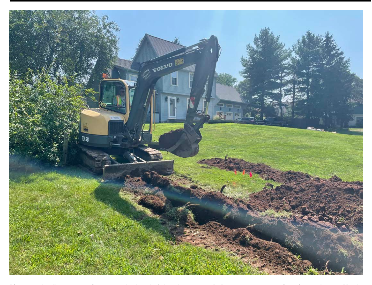
Picture 4: Ludlow excavating a trench ahead of the placement of 2" copper water service pipe at the 109 Maple Avenue property. View to the southeast.

Contractor: Ludlow Construction Page: 6 of 9