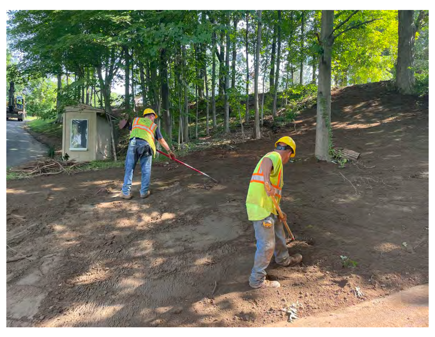
Picture 9: Ludlow grading loam on a portion of the 95R Maple Avenue property that was disturbed during the installation of a 2" copper water service line. View to northeast.

Contractor: Ludlow Construction Page: 12 of 13