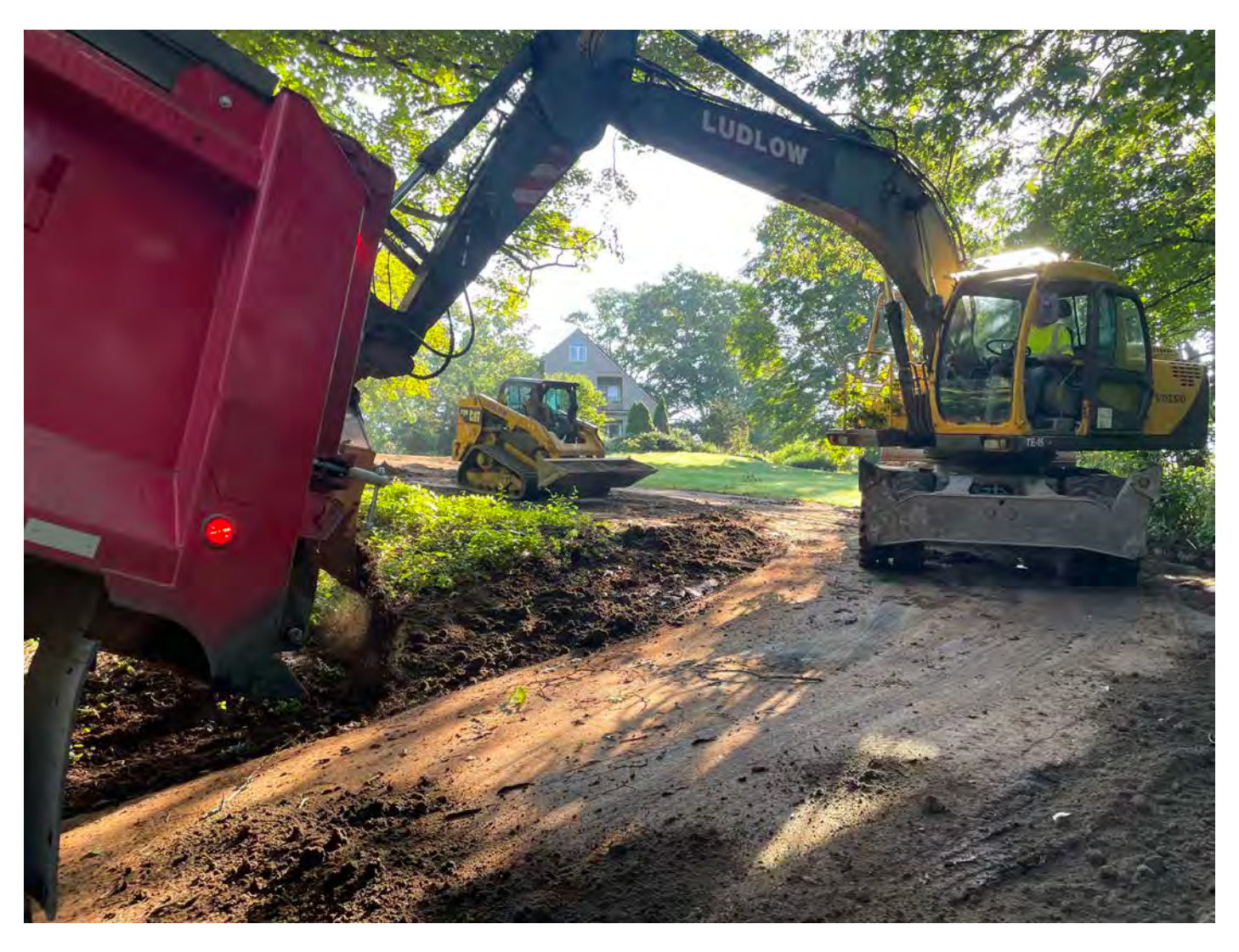
Picture 5: Ludlow placing loam on the north side of the driveway for the 95R Maple Avenue residence. View to the southeast.

Contractor: Ludlow Construction Page: 8 of 13