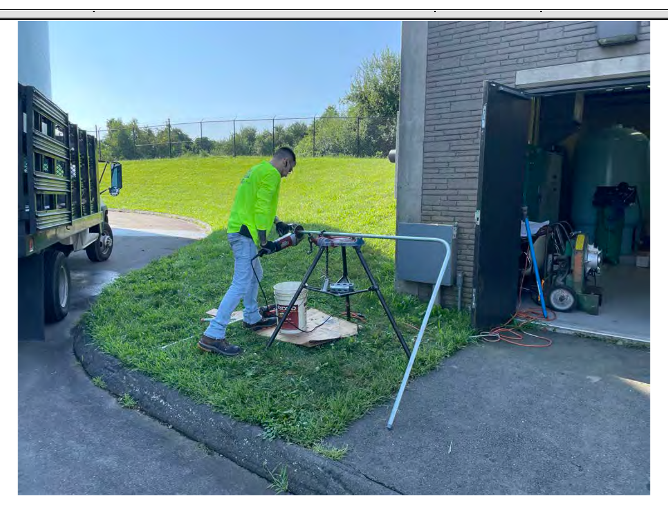
Picture 2: A&R Electrical threading the end of a steel conduit that will be installed inside of the Long Hill pump station in Middletown. View to the southeast.