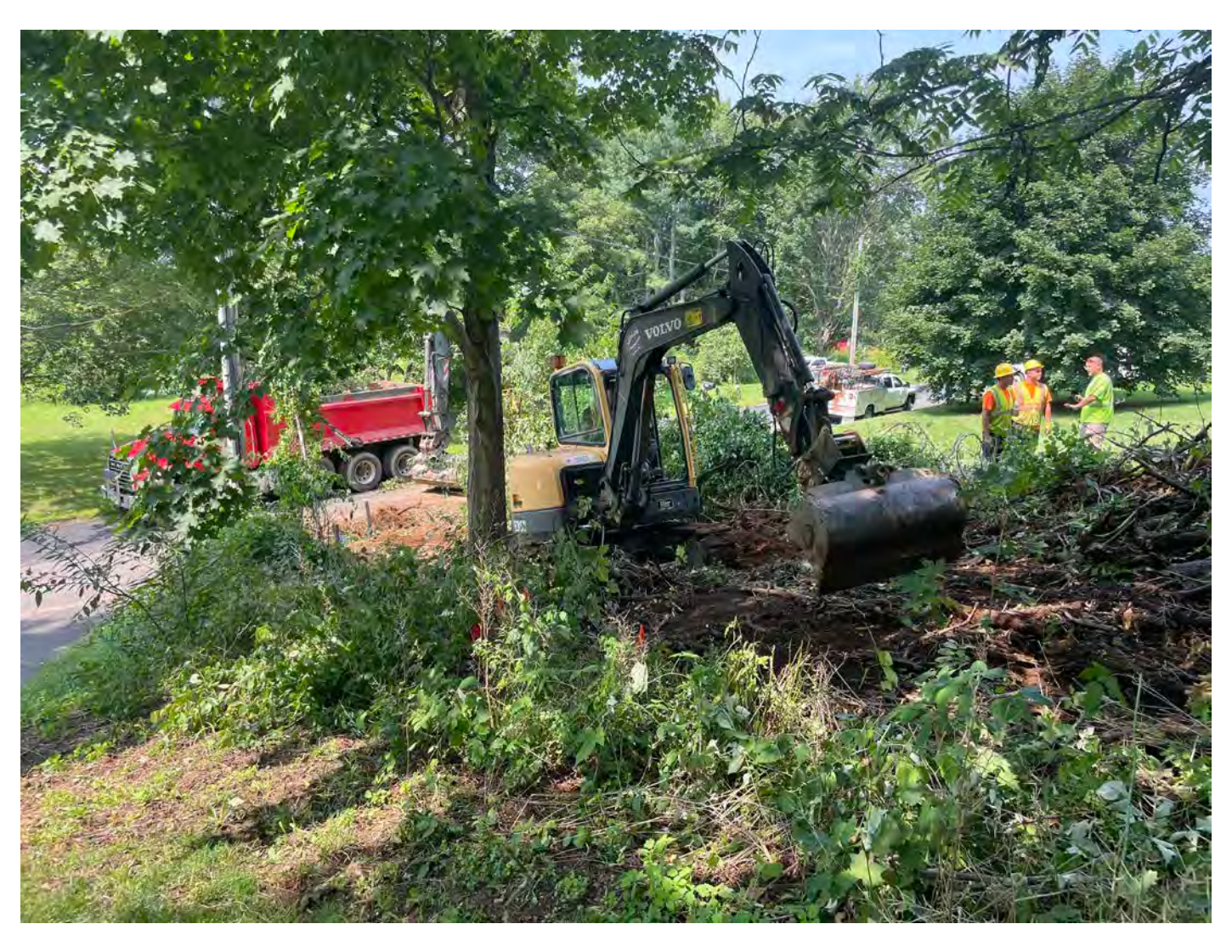
Picture 10: Ludlow grubbing brush on the northern property line of the 109 Maple Avenue property. View to northwest.

Contractor: Ludlow Construction Page: 13 of 13