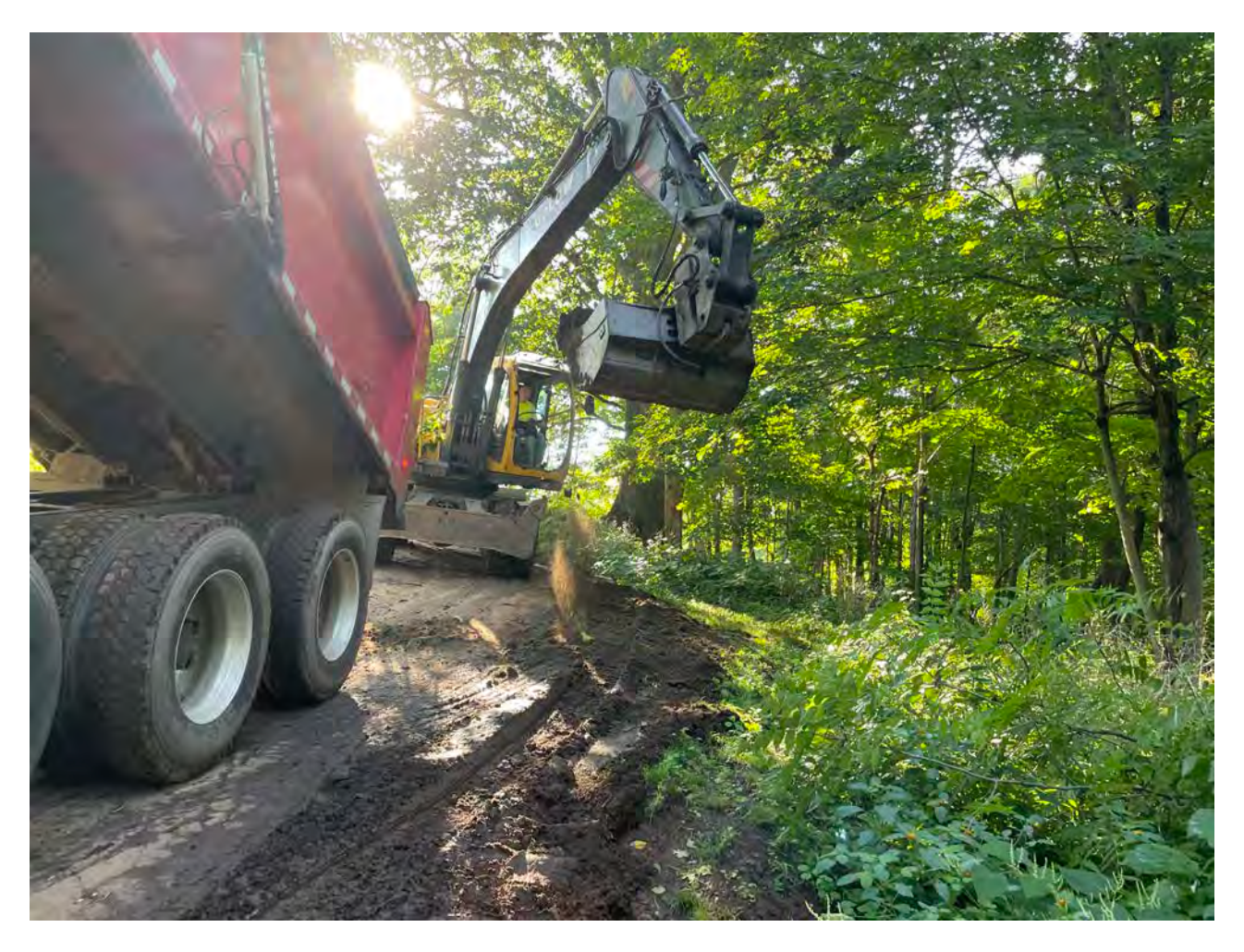
Picture 4: Ludlow placing loam on the south side of the driveway for the 95R Maple Avenue residence. View to the southeast.