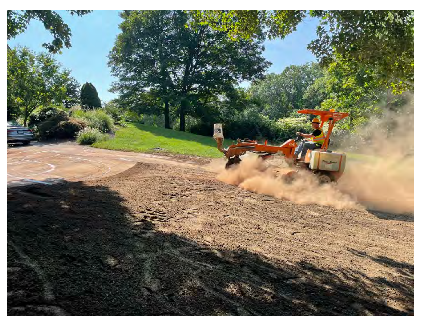
Picture 8: Ludlow using a Broce Broom to clean the driveway of the 95R Maple Avenue property. View to south.

Contractor: Ludlow Construction Page: 11 of 13