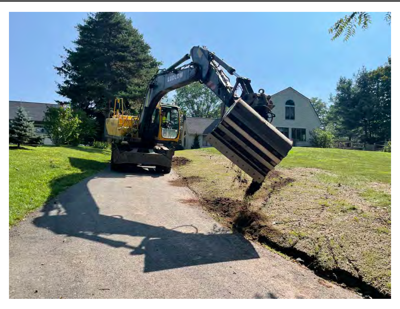
Picture 7: Ludlow placing loam on the south side of the 97 Maple Avenue property to fix some recent erosion damage to the loam and grass seed they placed recently.

Contractor: Ludlow Construction Page: 10 of 13