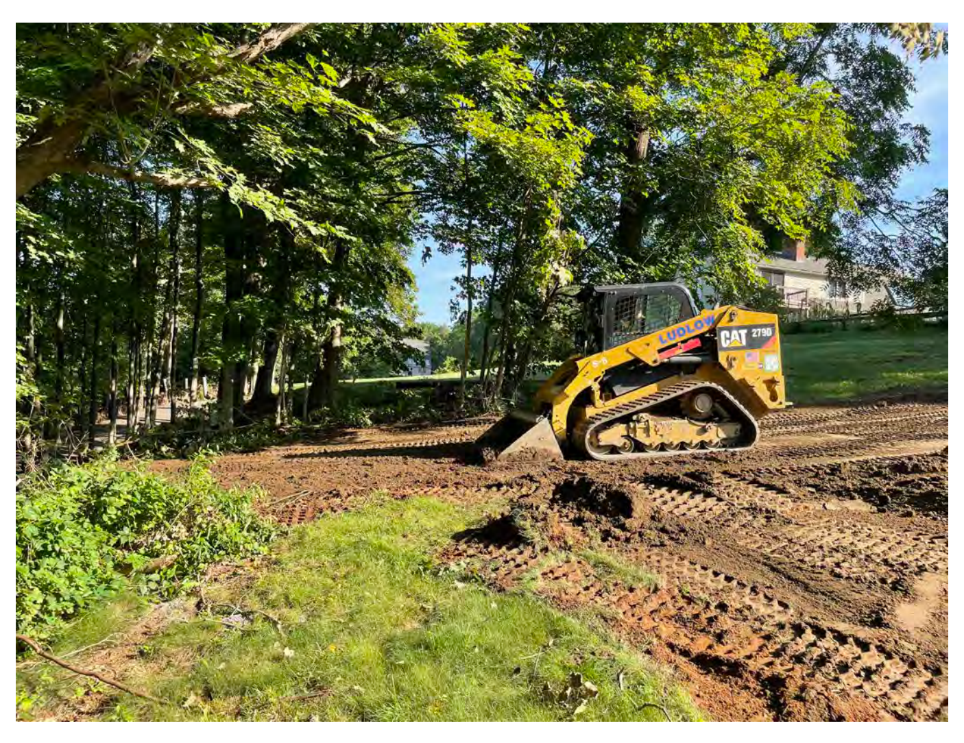
Picture 6: Ludlow grading loam on the 95R Maple Avenue property. View to the north.

Contractor: Ludlow Construction Page: 9 of 13