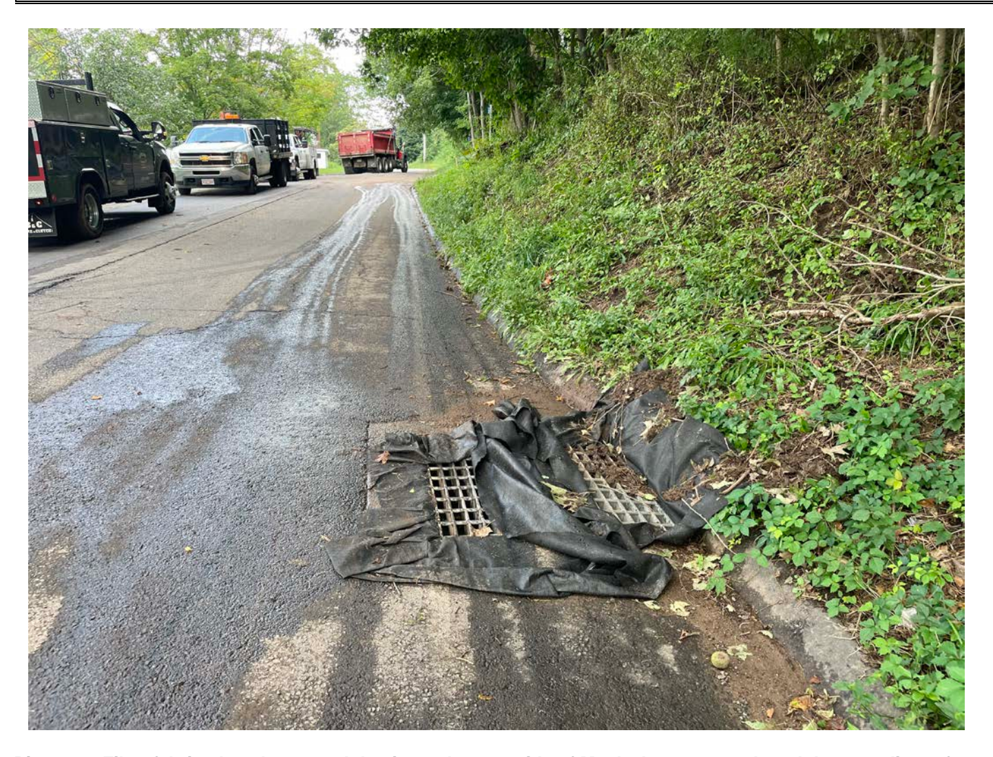
Picture 6: Filter fabric placed at a catch basin on the east side of Maple Avenue; south and downgradient of 95R Maple Avenue. View to the north.