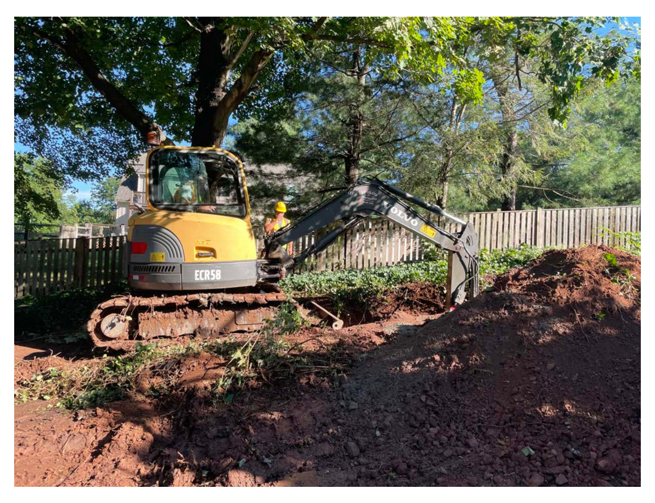
Picture 4: Ludlow excavating for the installation of a 2" copper water line at the 95R Maple Avenue residence. View to the north.