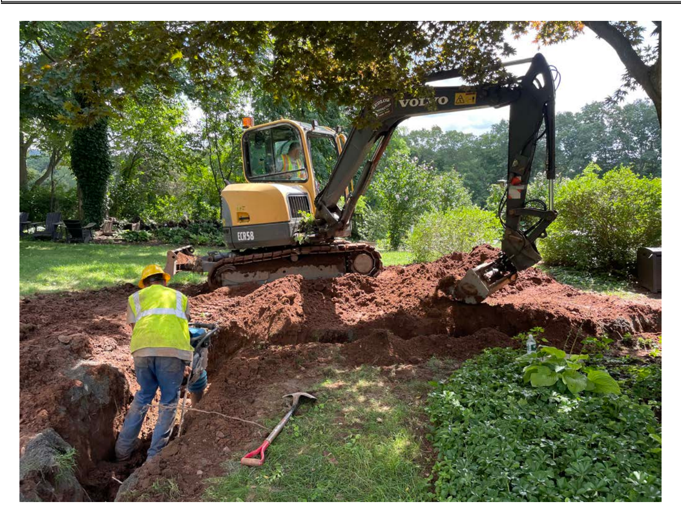
Picture 7: Ludlow placing sand over placed 2" copper water service on the east side of the 95R Maple Avenue residence. View to south.