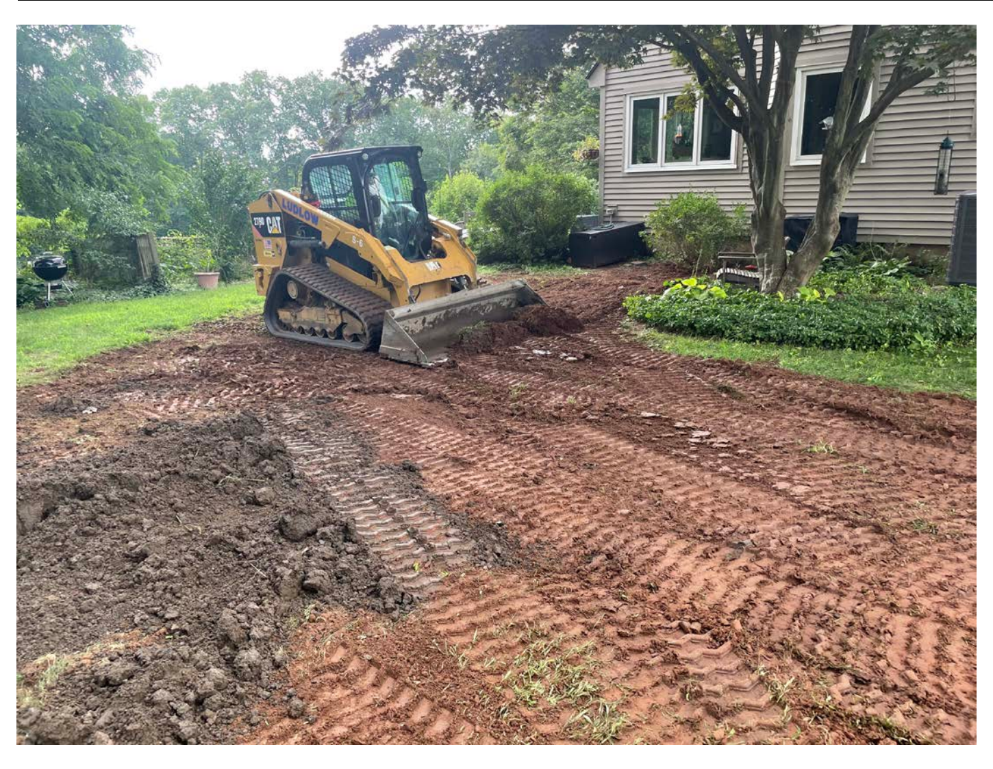
Picture 9: Ludlow grading loam over the backfilled trench at the 95R Maple Avenue property. View to southwest.

Contractor: Ludlow Construction Page: 11 of 11