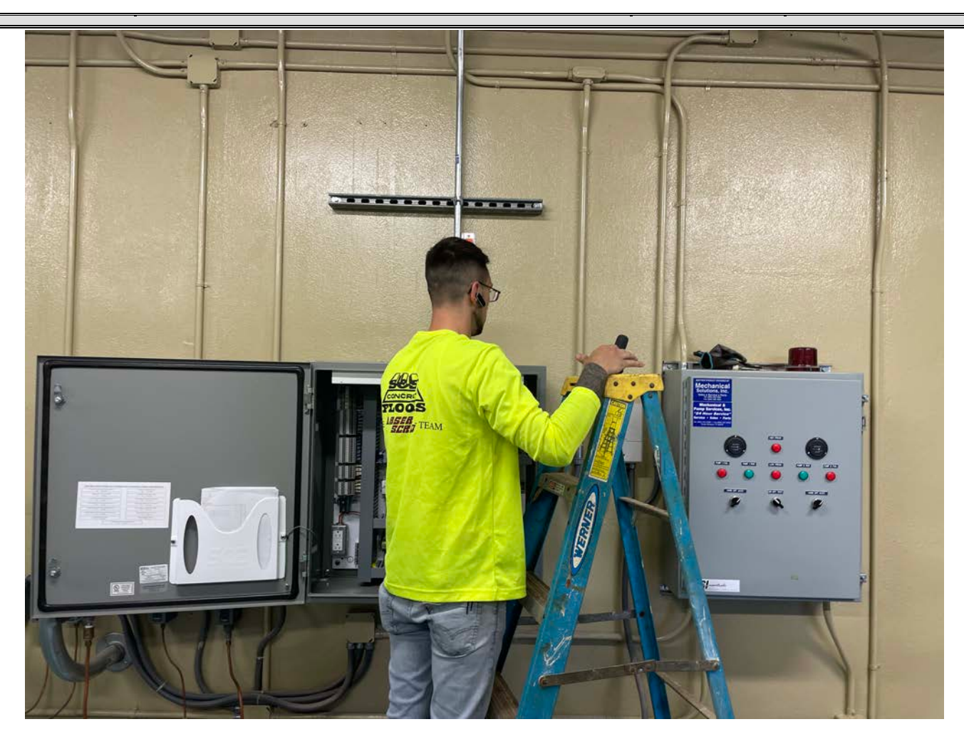
Picture 2: -A&R Electrical working on an instrumentation panel at the Long Hill pump station. View to the west.

Contractor: Ludlow Construction Page: 4 of 11