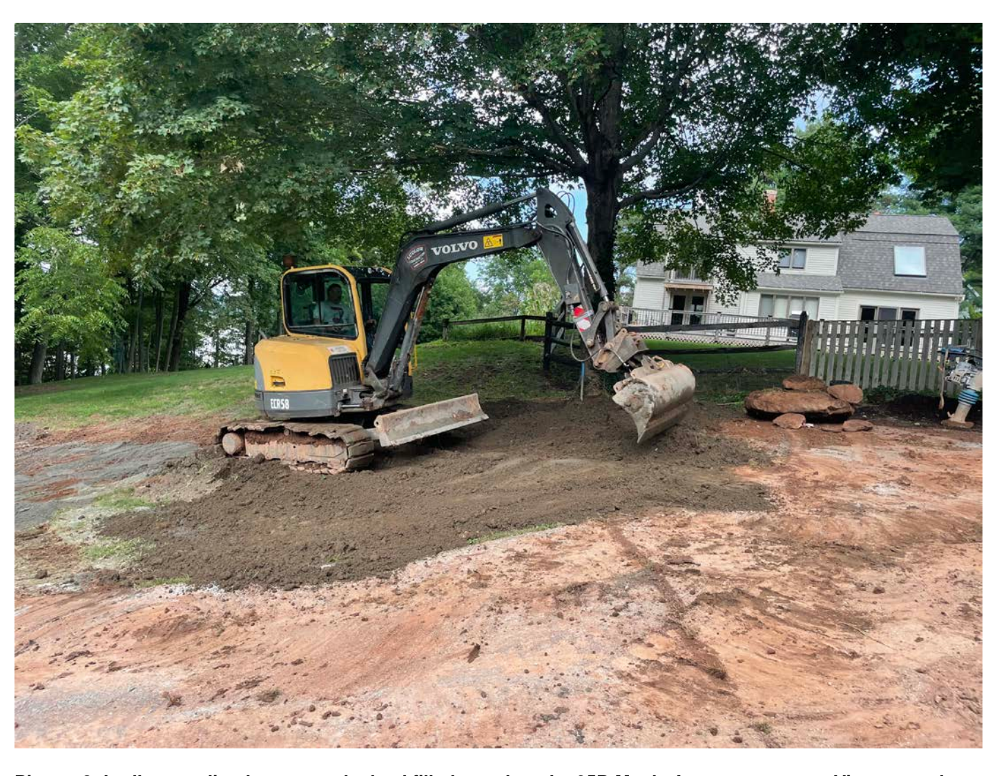
Picture 8: Ludlow grading loam over the backfilled trench at the 95R Maple Avenue property. View to north.

Contractor: Ludlow Construction Page: 10 of 11