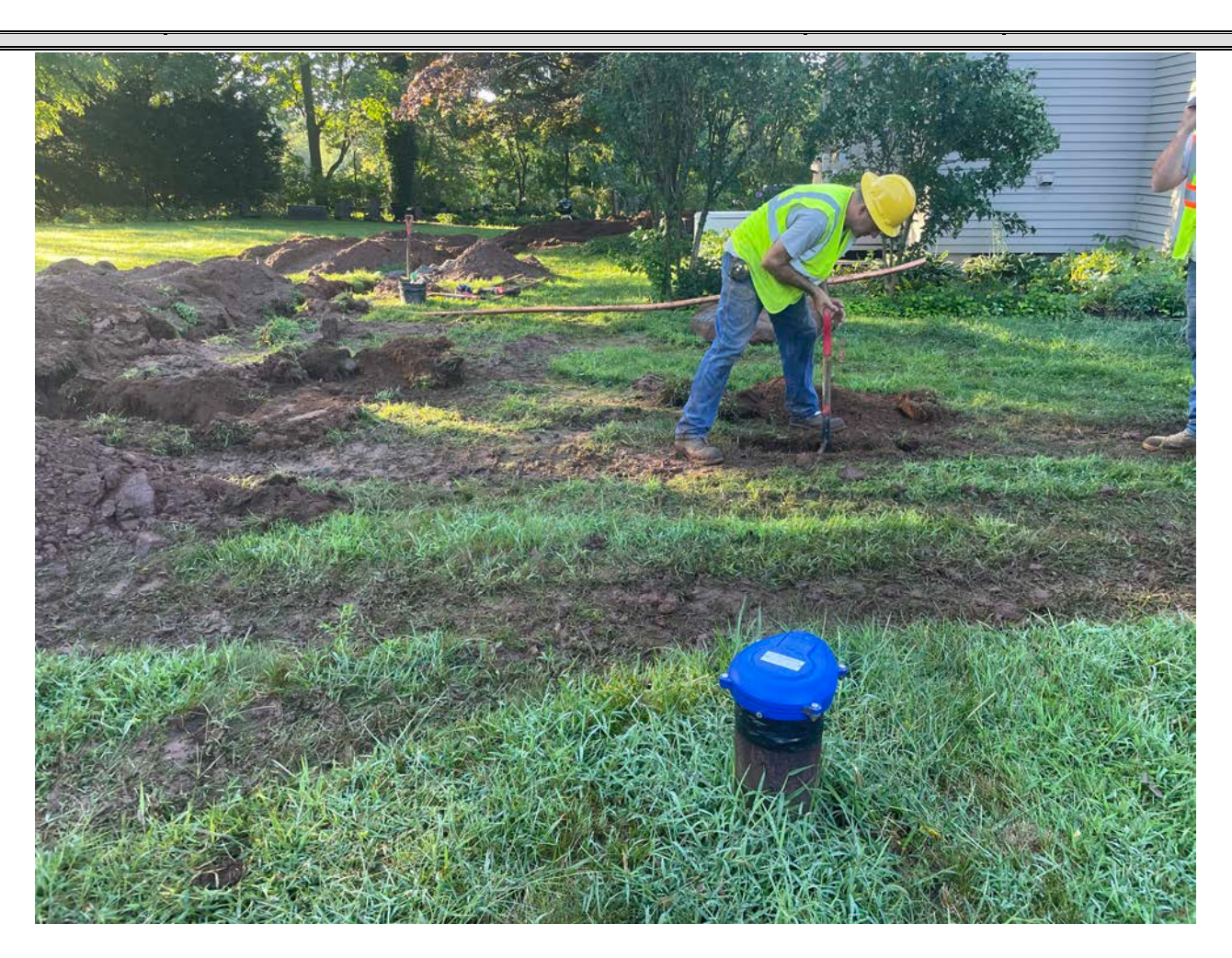
Picture 3: Ludlow hand digging to locate the water line between the 95R Maple Avenue residence and it's drinking well. View to the south.

Contractor: Ludlow Construction Page: 5 of 11