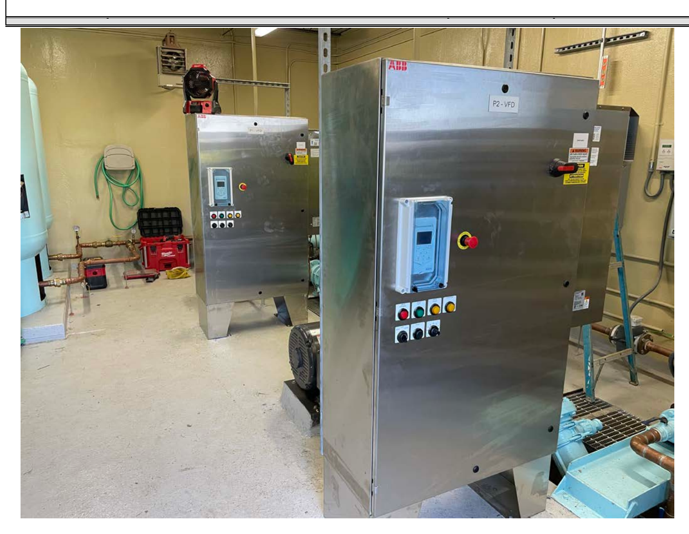
Picture 1: Long Hill pump station where A&R Electrical has installed two VFD cabinets. View to the south.

Contractor: Ludlow Construction Page: 3 of 11