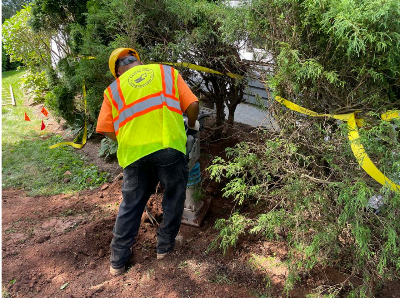
Picture 6: Ludlow compacting backfill with a jumping jack after having installed a 1" copper water service line at the 29 Maple Avenue residence. View to the northwest.