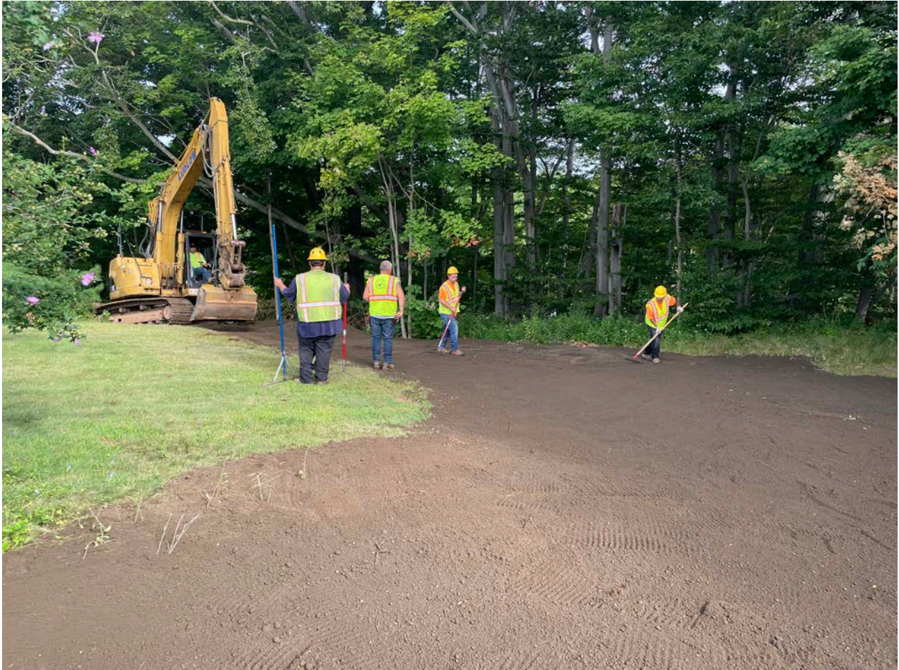
Picture 2: Ludlow raking out loam at the 10 Johns Way property as they restore the areas disturbed during the installation of a 1.5" copper water service line. View to the northwest.