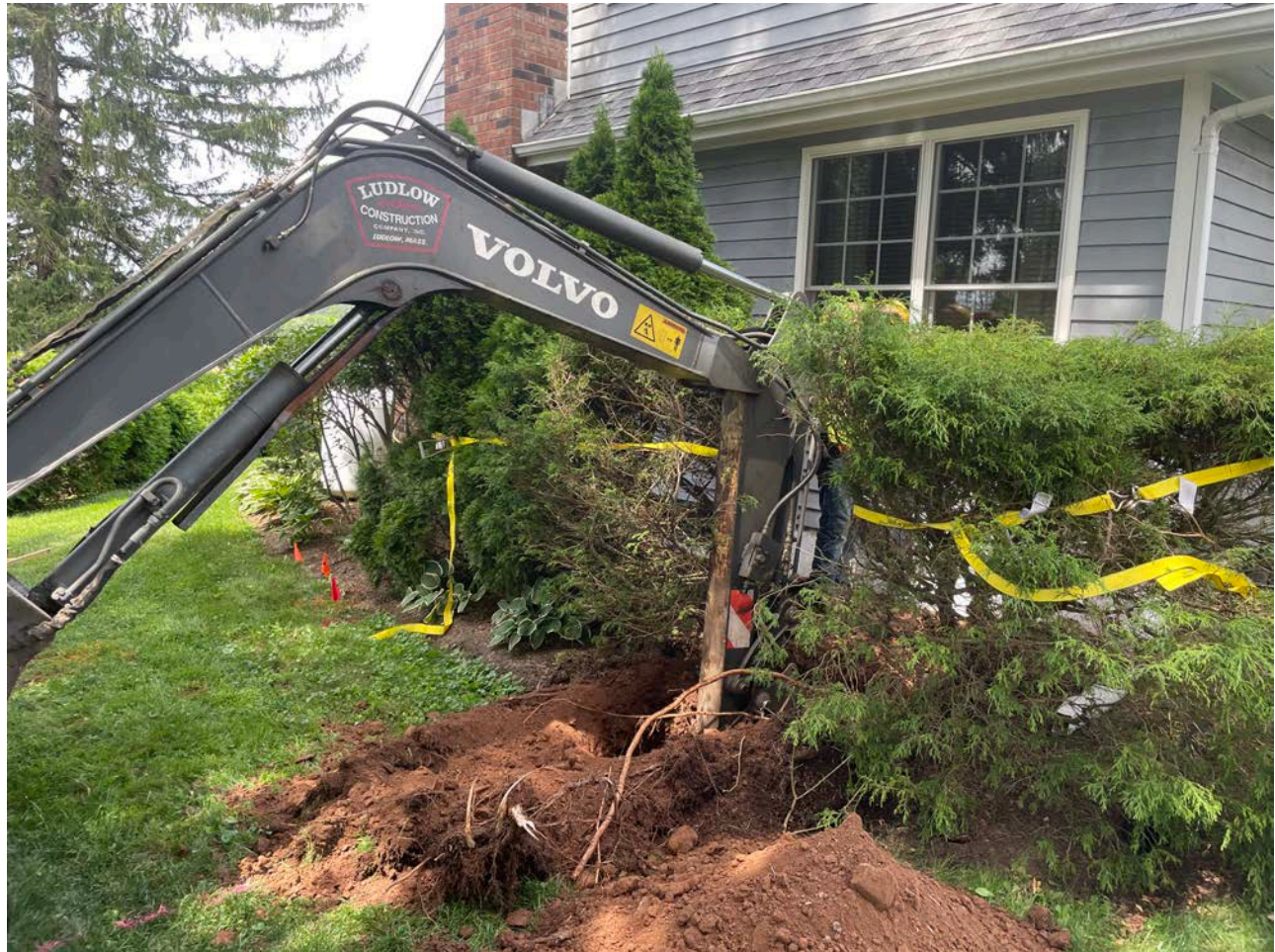
Picture 4: Ludlow excavating on the south side of the residence located at 29 Maple Avenue, Durham as they prepare to install a 1" copper water service line. View to the west.