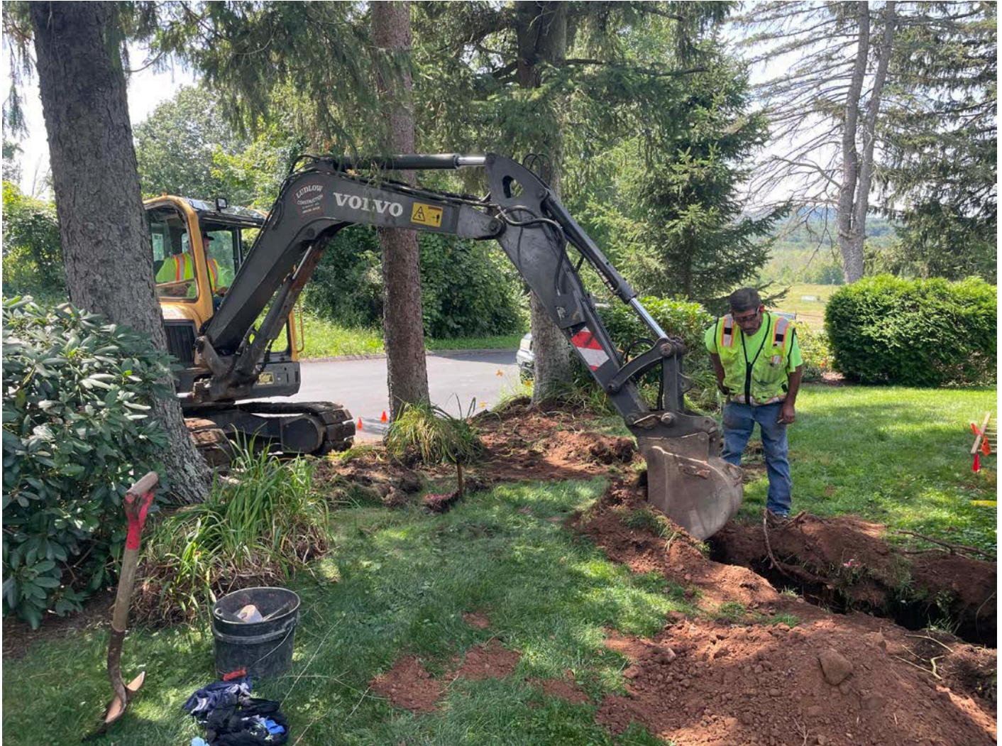
Picture 5: Ludlow excavating to the south side of the residence located at 29 Maple Avenue, Durham as they prepare to install a 1" copper water service line. View to the west.