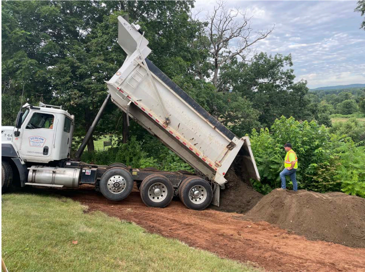
Picture 1: Ludlow delivering loam to the 10 Johns Way property as they restore the areas disturbed during the installation of a 1.5" copper water service line. View to the west.