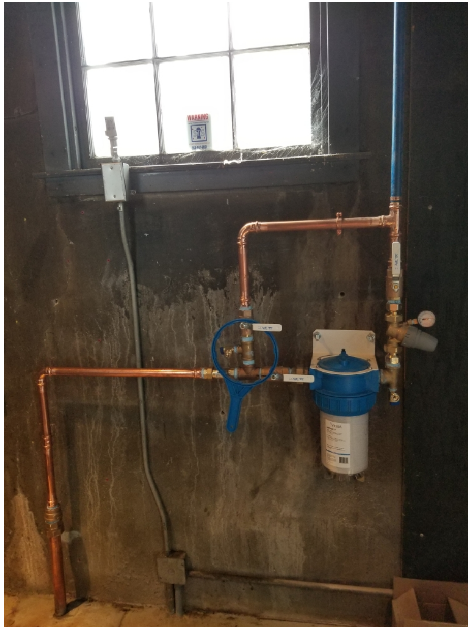
Picture 7: Final water service components that Fazzino Plumbing installed today at the residence located at 280 Main Street, Durham. View to the south.