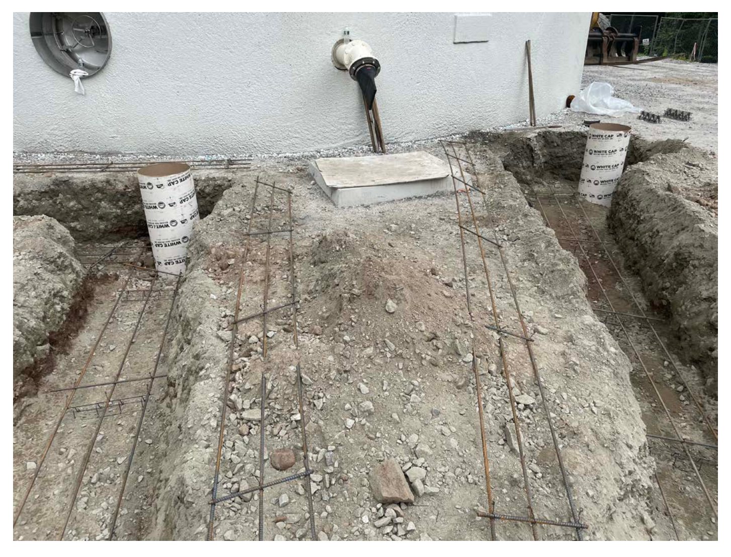
Picture 5: View of utility duct trenches, associated rebar, and sonotubes located on the west side of the water tank located to the east of the Shared Access Driveway in Middletown. View to the east.

Contractor: Ludlow Construction Page: 7 of 9