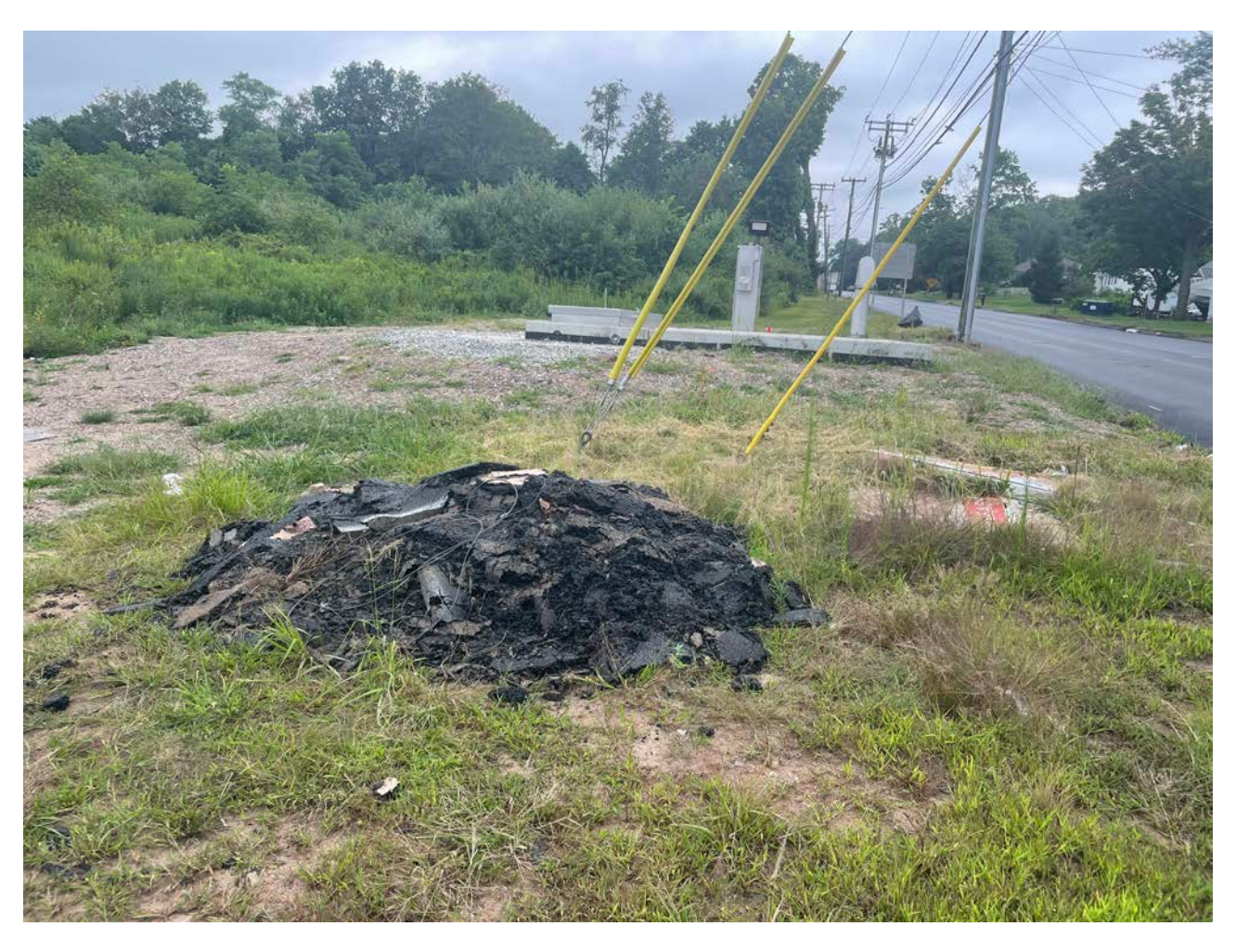
Picture 4: Waste asphalt that was recently placed just south of the pressure PRV vault. Ludlow confirmed that this material was not placed by them. View to the north.