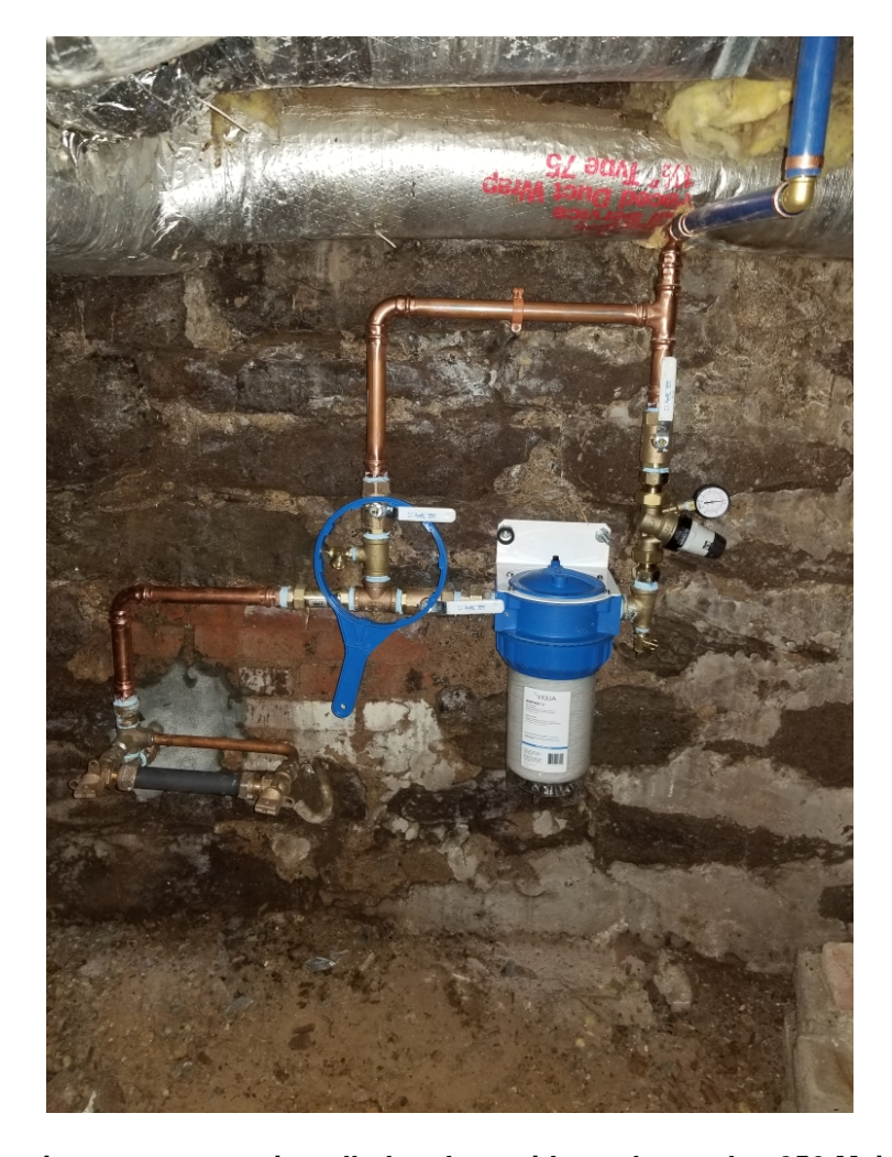
Picture 7: Final water service components installed at the residence located at 256 Main Street, Durham.