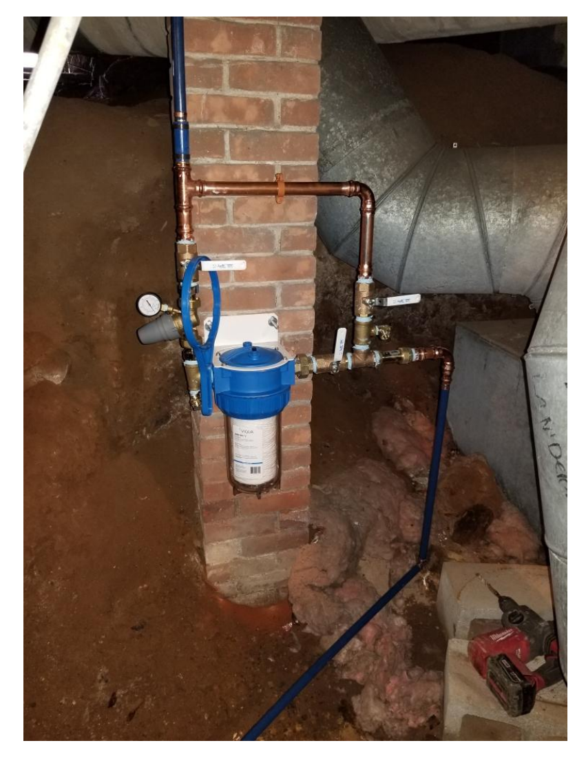
Picture 6: Final water service components installed at the church located at 236 Main Street, Durham.

Project: August 10, 2021 Durham Meadows Pipeline Installation Date: Day of Week: Tuesday Location: Main Street, Durham; Shared Access Driveway, Middletown Project #: Report No: 299 AECOM: 6061487 Page: 8 of 9 Contractor: Ludlow Construction