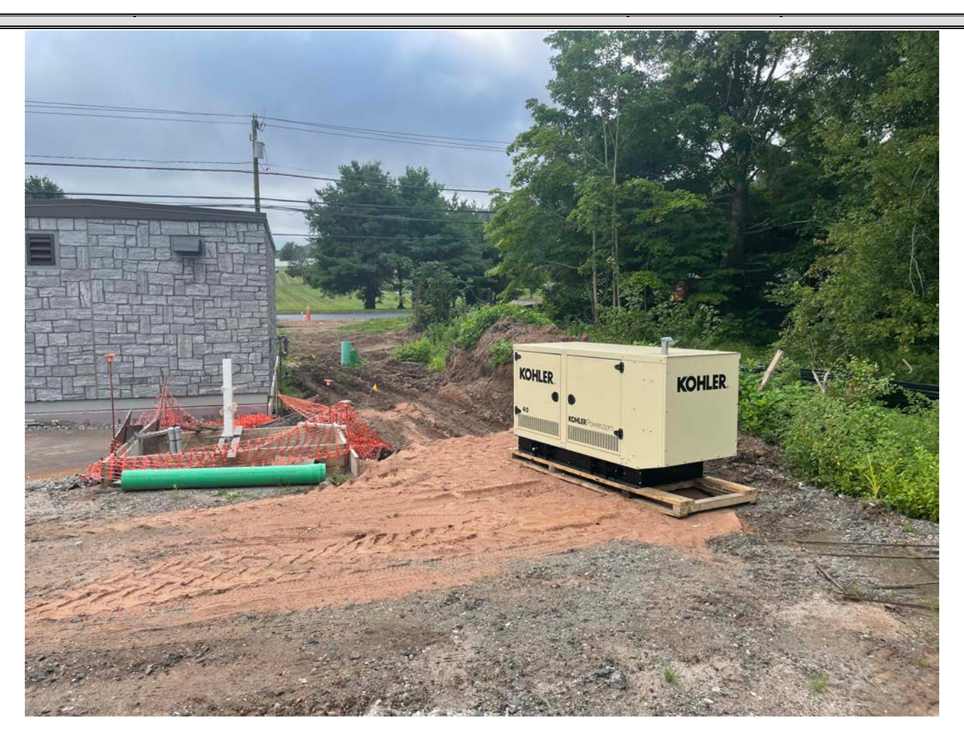
Picture 2: Generator that Ludlow staged on the west side of the booster station located at Station 750+63 in Middletown. View to the east.