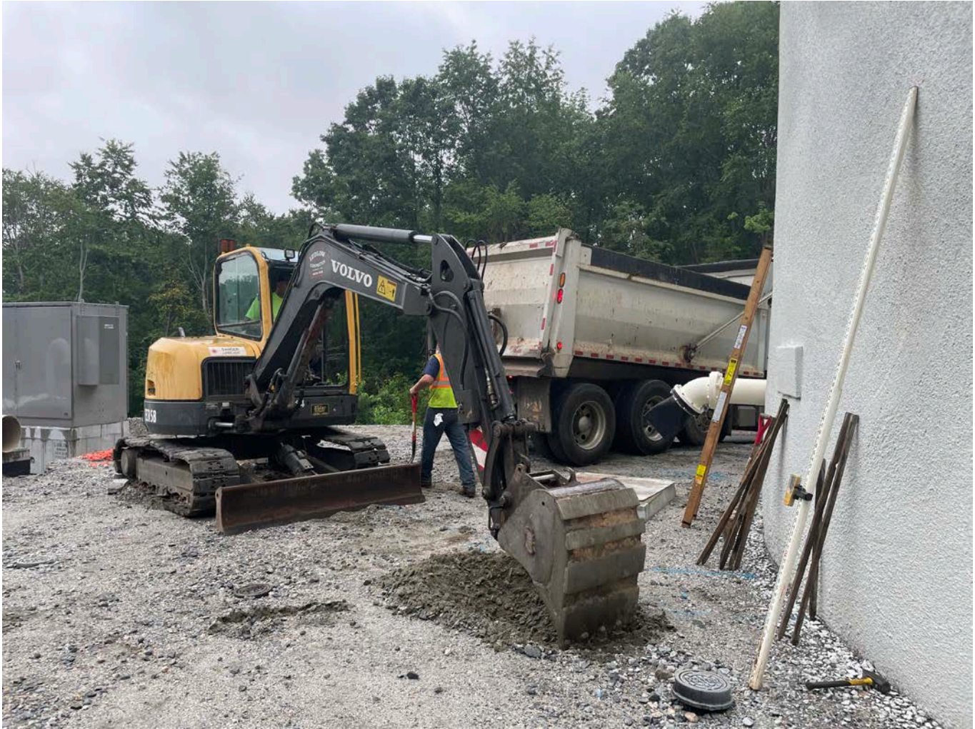
Picture 1: Ludlow excavating a trench for the installation of a duct bank on the west side of the water tank located to the east of the Shared Access Driveway in Middletown. View to the northwest.