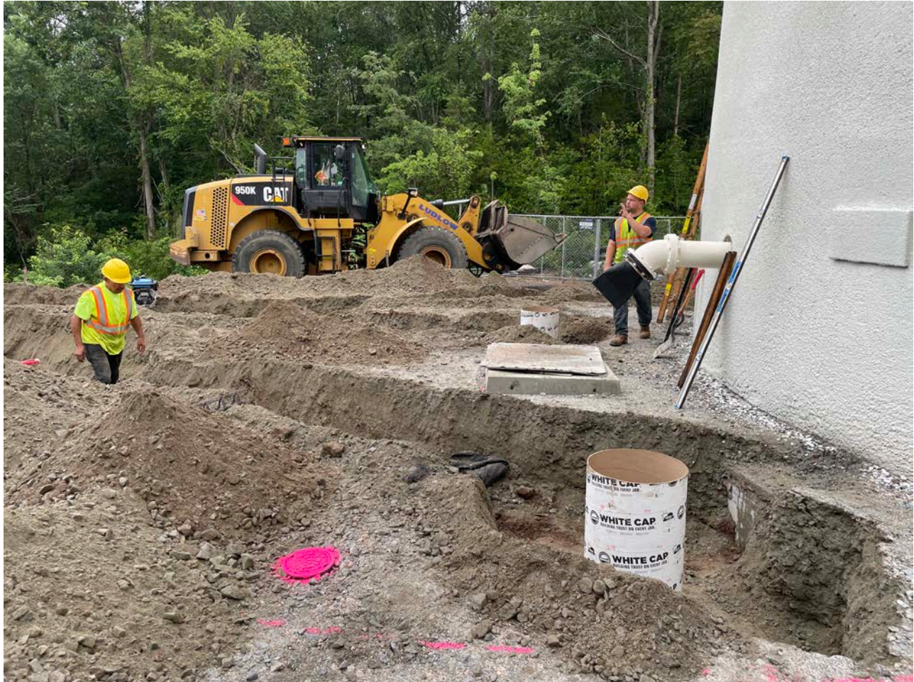
Picture 5: View of trenches that Ludlow excavated for the installation of a duct bank on the west side of the water tank located to the east of the Shared Access Driveway in Middletown. View to the north.