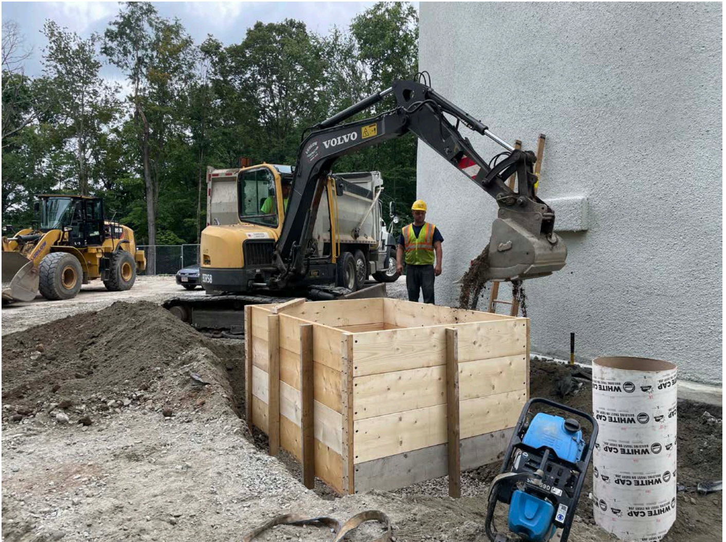
Picture 9: Ludlow placing fill around the concrete form for the slab that a blower will be staged upon on the northeast side of the water tank located east of the Shared Access Driveway in Middletown. View to the southwest.