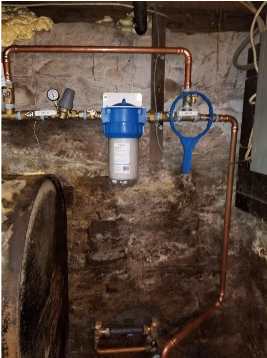
Picture 10: Final water service components installed at the residence located at 120 Main Street, Durham.