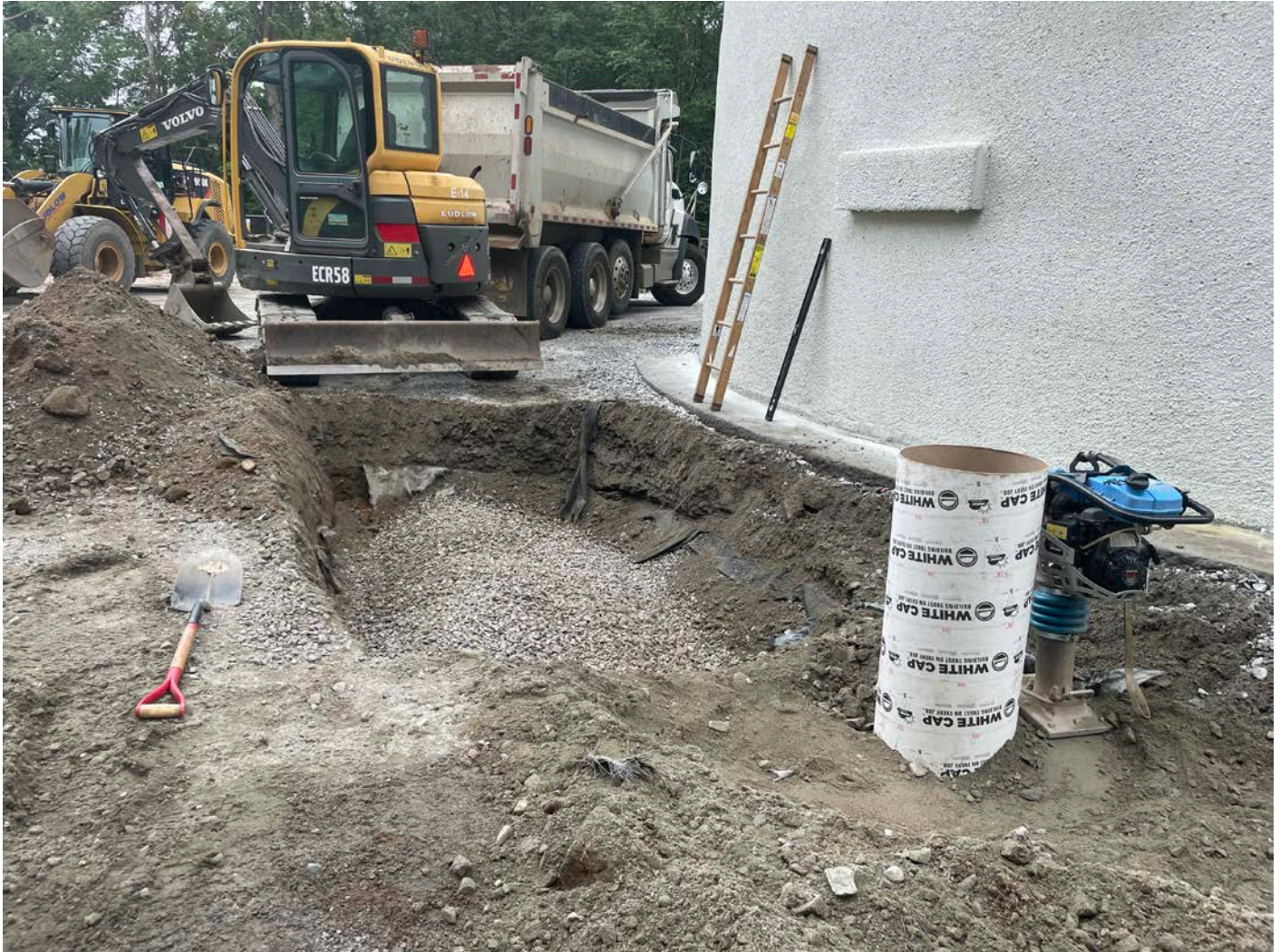
Picture 7: 3/4" gravel that Ludlow placed at the footprint for the blower that will be installed on the northeast side of the water tank located to the east of the Shared Access Driveway in Middletown. View to the southwest.