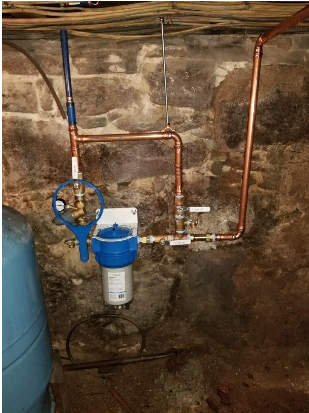
Picture 12: Final water service components installed at the residence located at 297 Main Street, Durham. View to the north.