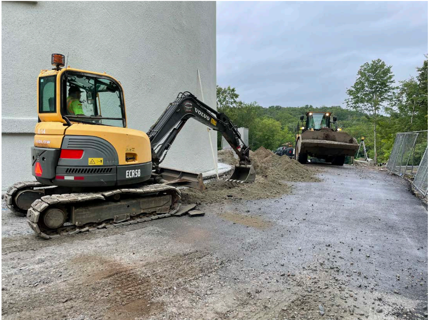
Picture 6: Ludlow excavating a trench for the installation of a duct bank on the north side of the water tank located to the east of the Shared Access Driveway in Middletown. View to the west.