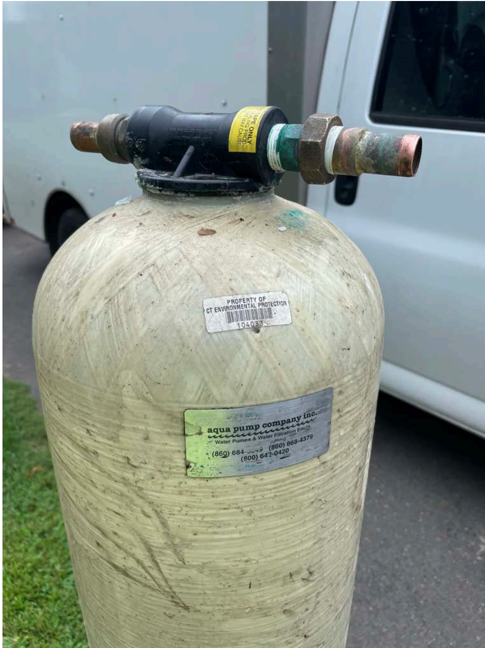
Picture 8: Sand filter that Fazzino Plumbing removed from the residence located at 261 Main Street, Durham, as part of the installation of final water service components.