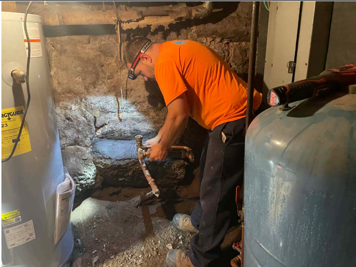
Picture 2: Fazzino Plumbing working at the residence located at 297 Main Street, Durham installing final water service components. View to the west.