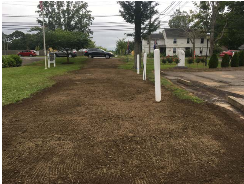
Picture 5: Facing east. Final grading 280 Main Street from roughly mid-point.