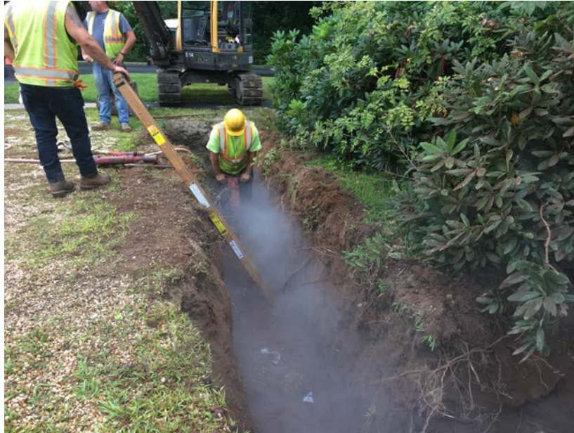
Picture 9: Facing west. Jack hammering one of two bedrock highs. The other was near the foundation wall.