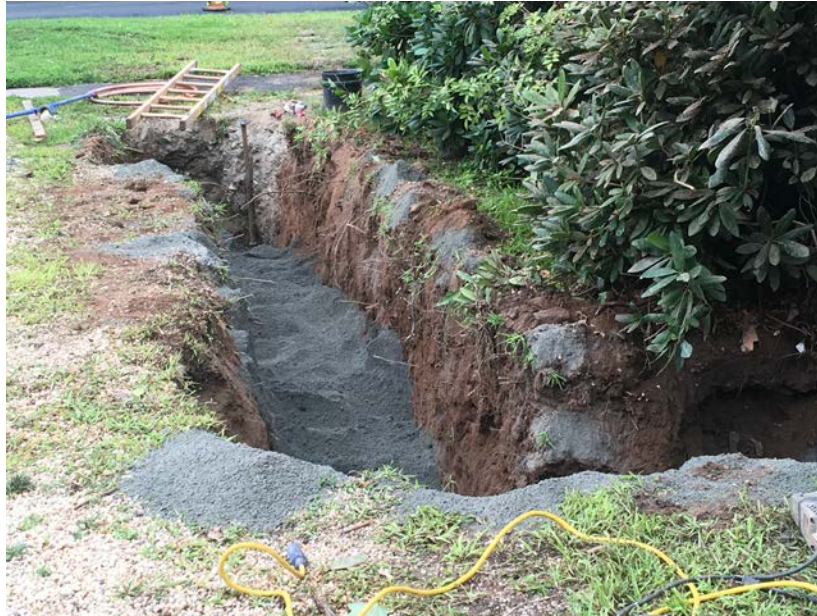
Picture 11: Facing west. 289 Main Street. Sand layer over the water line. Curb stop at top of picture by the ladder. Tie-offs were not yet completed and will be included in Fridays report.