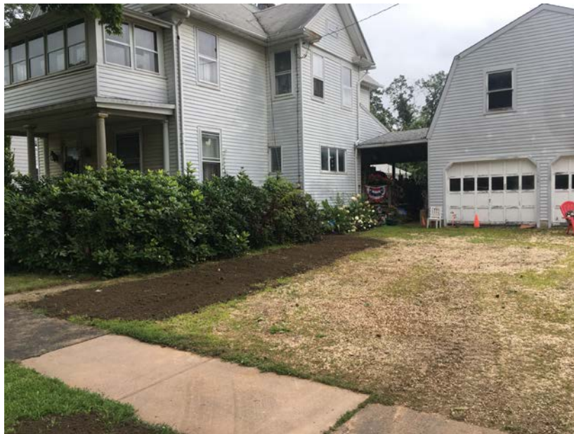
Picture 14: Facing northeast. Trench from curb stop to house and driveway of 289 Main St. Final grading..