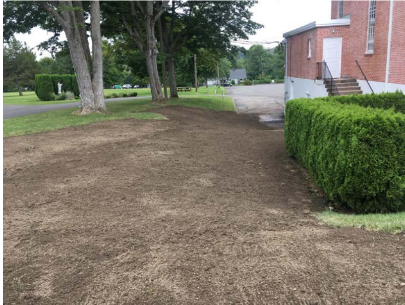
Picture 4: Facing west. Final grading 280 Main Street from roughly mid-point.