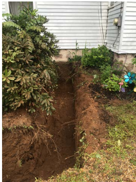
Picture 8: Facing north. View of turn into house. 1" copper line enters 8 feet from southwest corner at depth of 4.8 feet below top of sill.