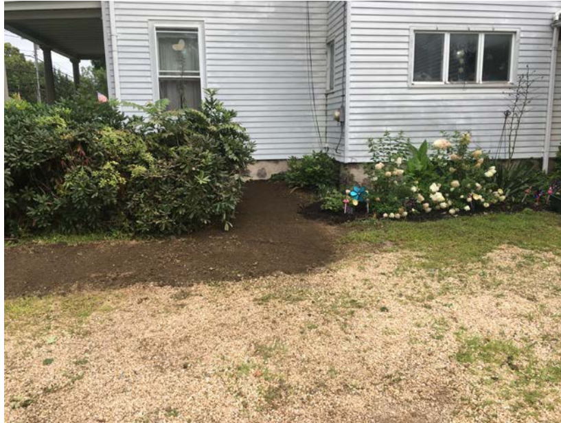
Picture 15: Facing north. Final grading 289 Main St. driveway and trench into house. 1" copper line enters 8 feet from southeast building corner (not porch corner).