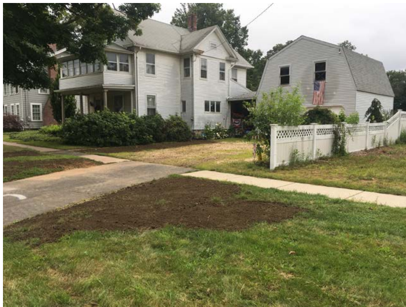
Picture 12: Facing northeast. Overview of completed installation at 289 Main Street.