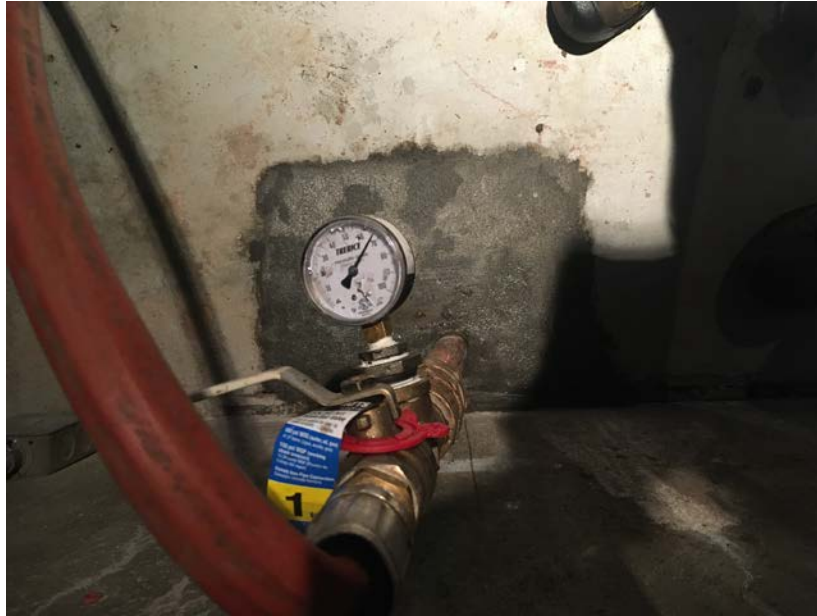
Picture 2: Facing down. Water line in through the floor at the back of 280 Main Street (Notre Dame Church) Pressure test of the system to insure no leaks. Note cemented floor restoration.