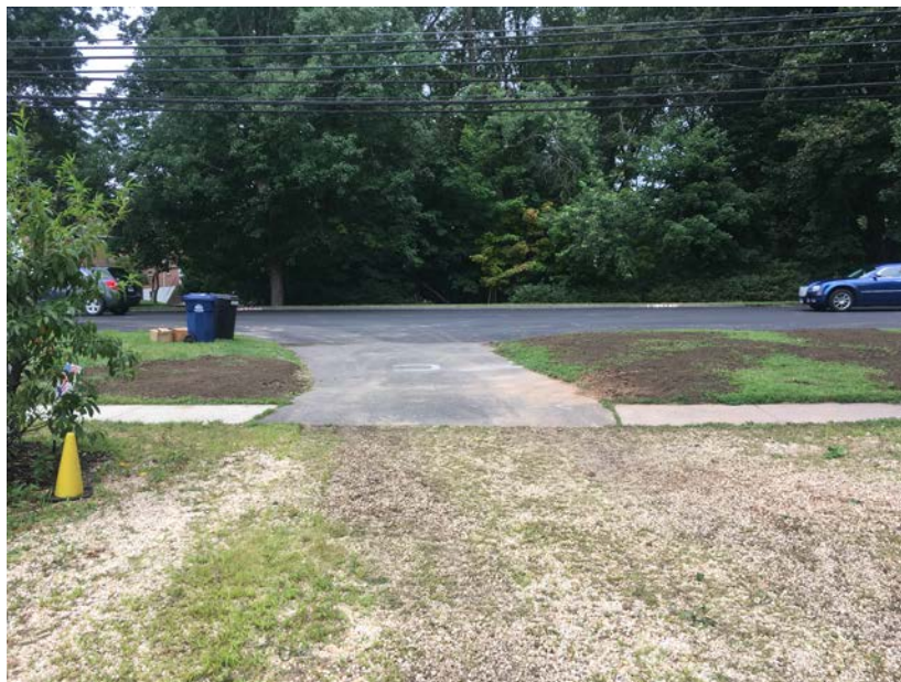
Picture 16: Facing west. Final grading at 289 Main St. View is from garage facing Route 17. House is to the right of the photo.