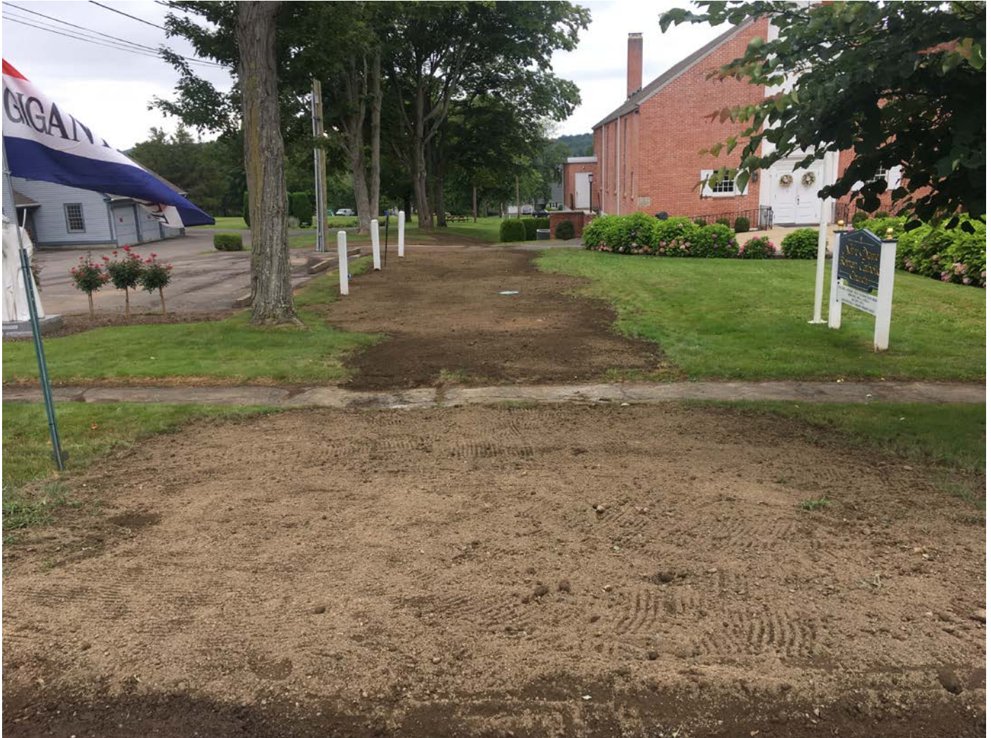
Picture 6: Facing west. Overview of the entire run from Route 17 up the south side of Notre Dame Church, 280 Main Street.

Project: Durham Meadows Pipeline Installation Date: August 05, 2021 Location: Main Street and Maple Avenue, Durham; Shared Access Driveway, Middletown Day of Week: Thursday Project #: AECOM: 6061487 Report No: 296 Contractor: Ludlow Construction Page: 7 of 12