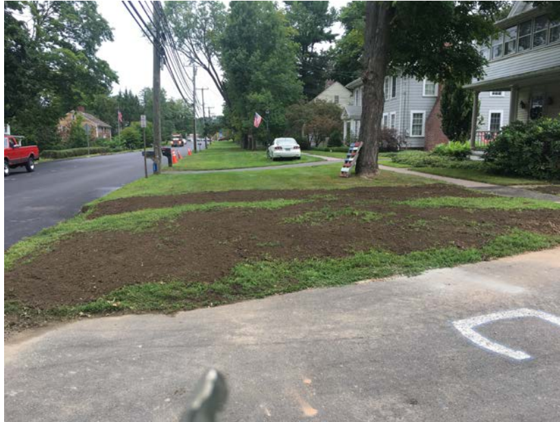
Picture 13: Facing north. Front lawn 289 Main Street. Driveway "C" is for 289 Main St. Final grading.