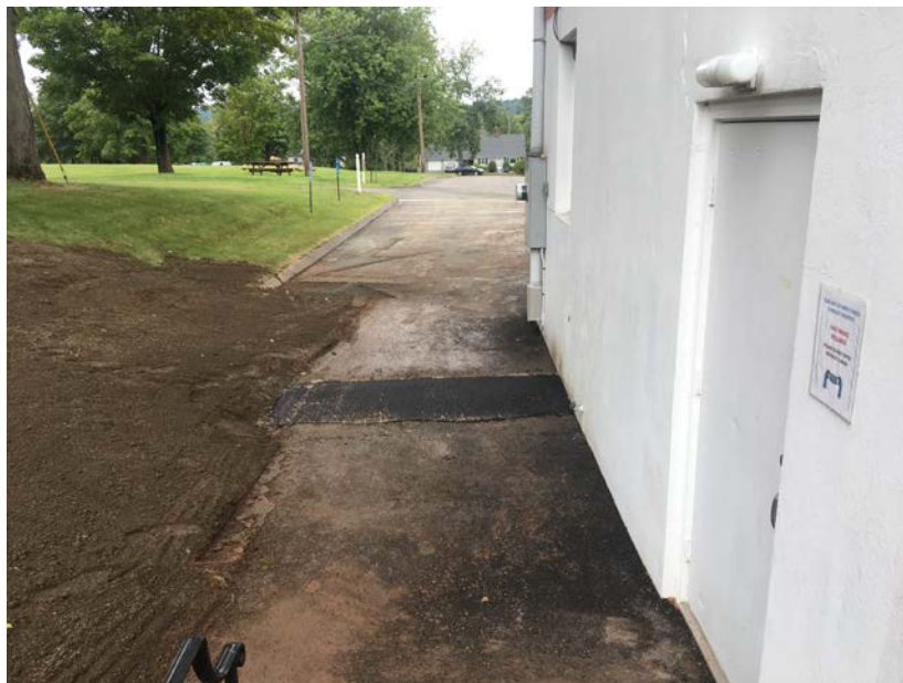
Picture 3: Facing west. Hot patched walkway where 1.5" copper enters 280 Main St. on southwest corner.