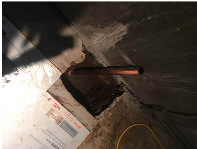
Picture 12: Inside picture of 280 Main Street. Behind copper pipe is the same wall as can be seen from outside. Picture is facing south and down. Note in the hole created for the 1.5' copper line to the left of the new service is the same pipe seen behind the ladder in the previous picture and that pipe has been plugged.