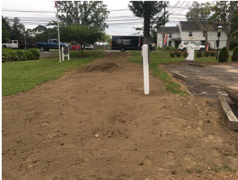
Picture 14: Facing east, End of day at 280 Main Street. This section was completed on Monday and final loam cover was raked out today. Minor cleaning up including returning parking bocks to their original positions.