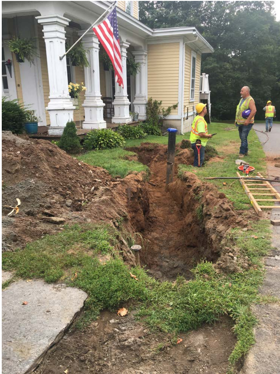
Picture 5: Facing east-northeast. Trench into 227 Main Street. To left of picture is row of hedges and sidewalk. In foreground is the curb stop and mid distance the well. Due to a bend in the conduit (not visible) this trench will need to be extended.