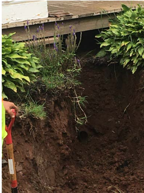
Picture 7: Conduit under porch for 1" copper water line into 227 Main St. Depth is approximately 3 feet.