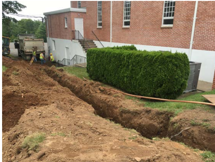
Picture 9: Facing westerly. 280 Main Street Notre Dame Church continuation from Monday.