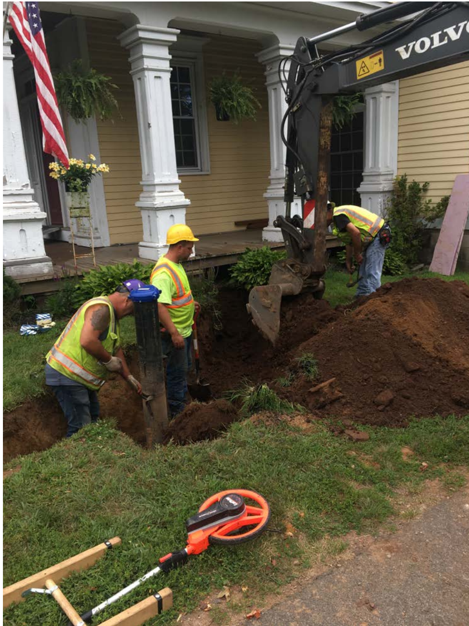
Picture 6: Facing northeast. Extension of the trench at 227 Main Street up to the porch edge in order to remove the elbow in the line. The 1' copper line was not flexible enough to make the turn.