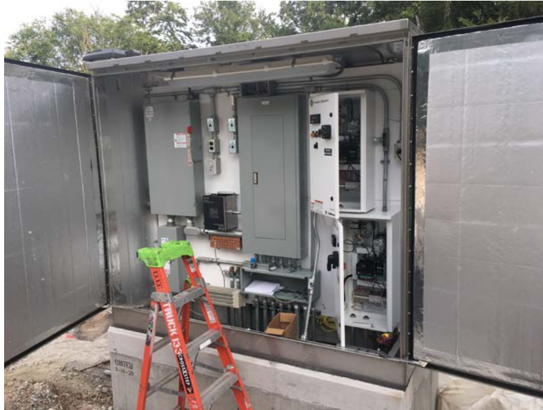
Picture 1: United Concrete electrician working on Control Box up at the Tank. Reconfigured box with new control panels. Electrician will return Friday 8/6 to complete conduits and wiring.