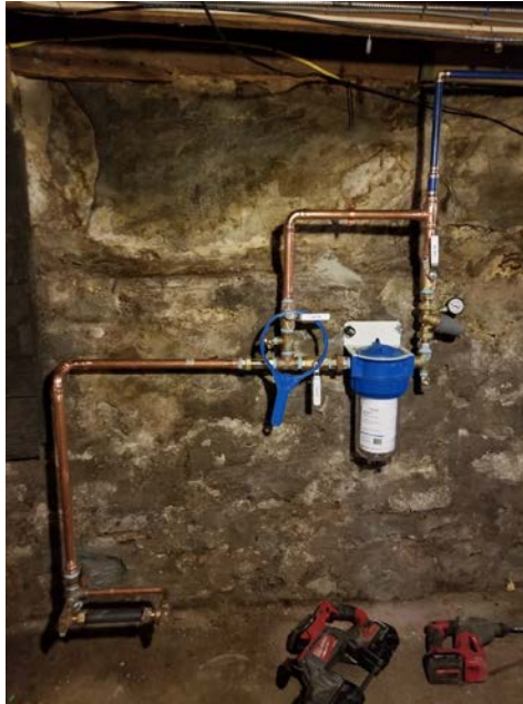
Picture 3: Fazzino 246 Main Street installation on the east wall, water line enters on the east wall.