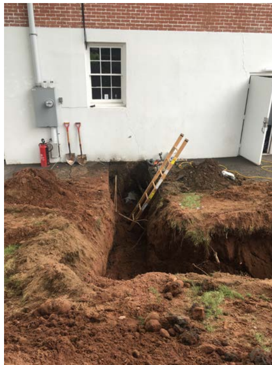
Picture 10: Facing north, Trench turns into south side of Church at 290 Main St..