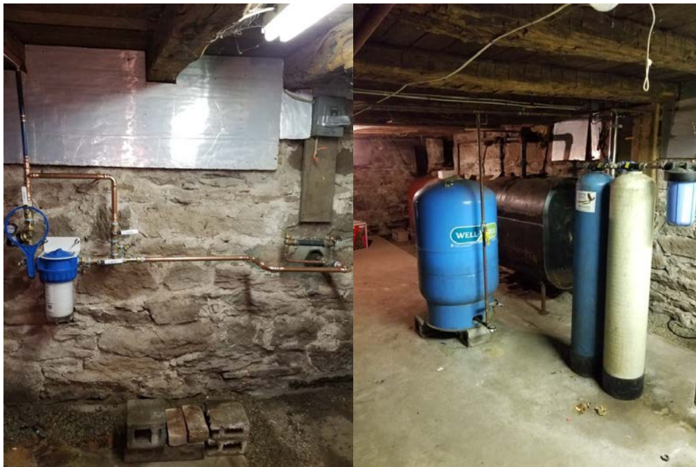
Picture 2: Fazzino installation on south wall of 227 Main Street on left. On right items removed.