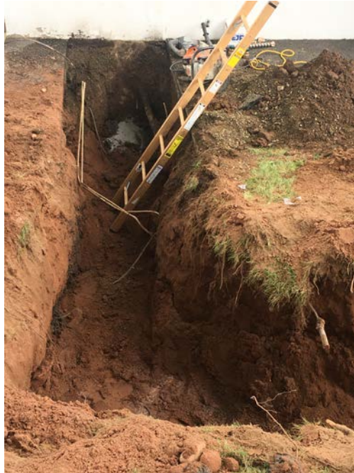
Picture 11: Facing North. 280 Main Street. Notre Dame Church collection of abandoned pipes and wires. Wires were not energized. On the left are the small copper lines and on the left is 1.5 inch line seen just behind the ladder.