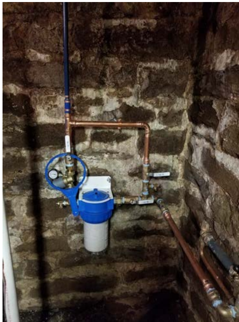
Picture 4: Fazzino 243 Main Street installation on the south wall, water line enters on the west wall.