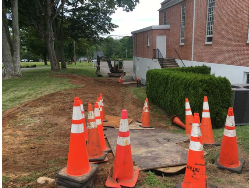
Picture 13: Facing west. End of day at 280 Main Street. Some final grading yet to be completed.