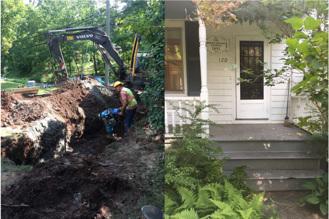
Picture 5: Facing northeast – 120 Main St. Backfilling new line and corporation connection. Replaced improperly installed corporation stop that prevented water flow to building. The water main is approximately 24 feet from the top step of the porch.