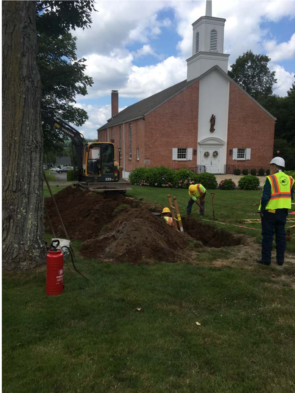
Picture 6: Facing west. 280 Main Street (Notre Dame Church) Installation. Curb stop 48 feet from water main in Route 17. Line will run down south side (left) of the building to the back corner.