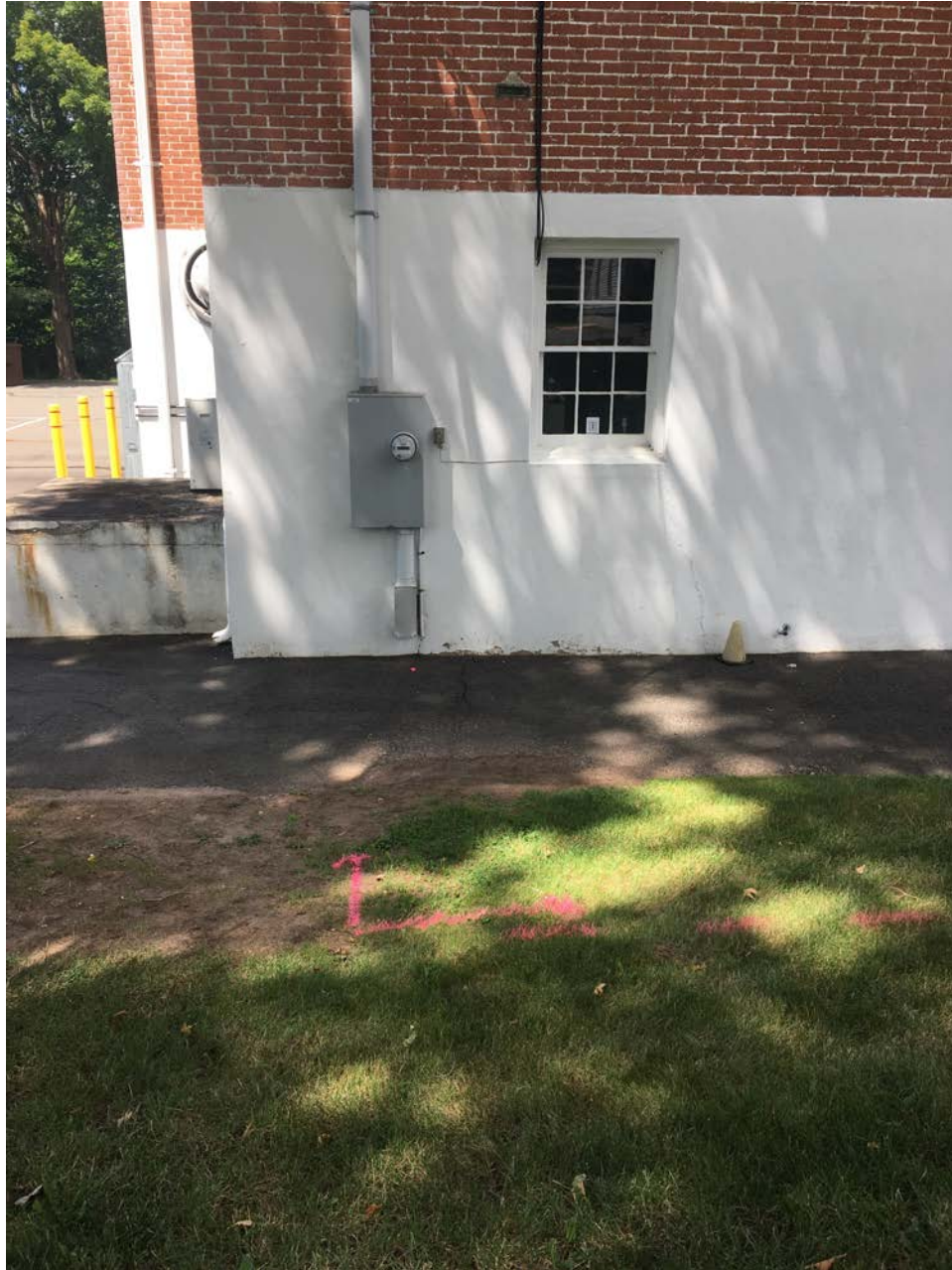
Picture 8: Facing north. Ludlow will have to go under the floor of the building and then come up to install the water line at 280 Main Street. This will likely be completed later this week.