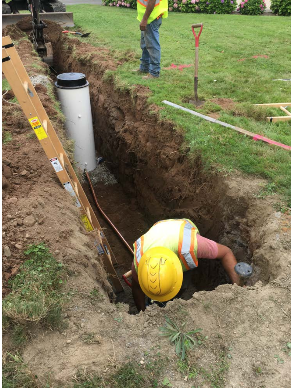
Picture 9: Facing east. 280 Main Street curb stop and meter vault set 10 feet apart. 1.5-inch copper line in trench. Ludlow installed 79.2 feet of line today.