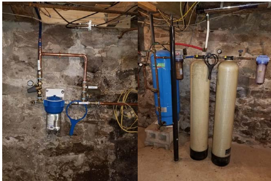
Picture 2: Fazzino installation at 242 Main Street. Installation is on the east wall of the home.