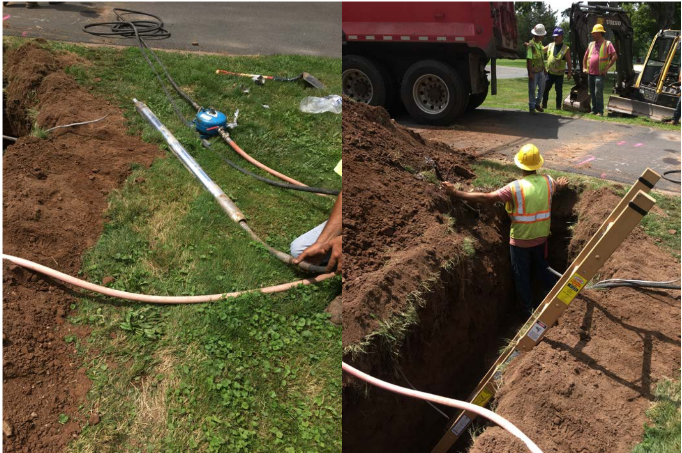
Picture 10: Facing southerly. Picture on left is the mole used to pull water line under the pavement area at 280 Main Street to avoid excavating asphalt walkway. On the right behind the ladder is an example of one of the three Romex electric lines buried about 6 inches deep that were breached and later splice back together. In the Ludlow workers hand is and irrigation line, also about 6 inches deep, that was splice back together. There is still a leak in the line, not in any of the dug-up parts that were repaired, but – Ludlow thinks – likely a connection that was pulled out. Leak will be trouble shot after connection of municipal water so as not to dry out the well in the search.