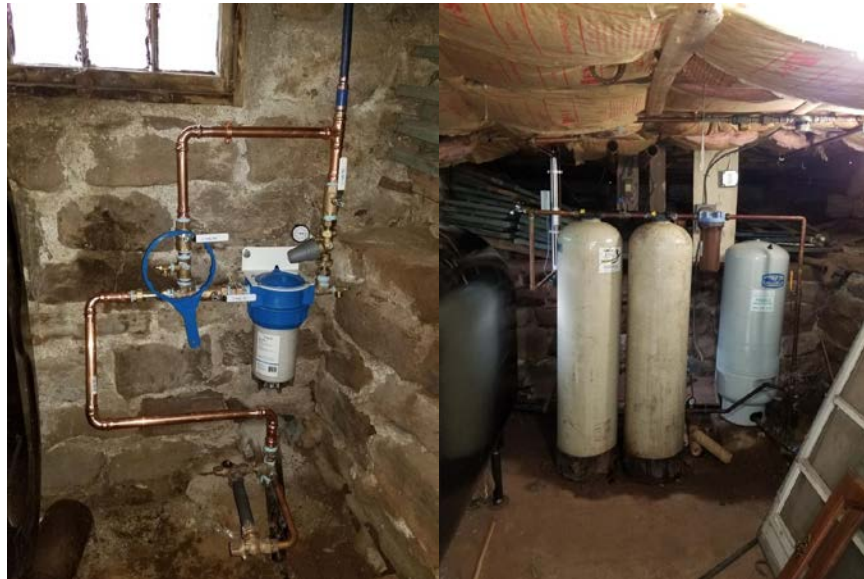
Picture 1: Fazzino installation at 239 Main Street. Completed on south wall of building.