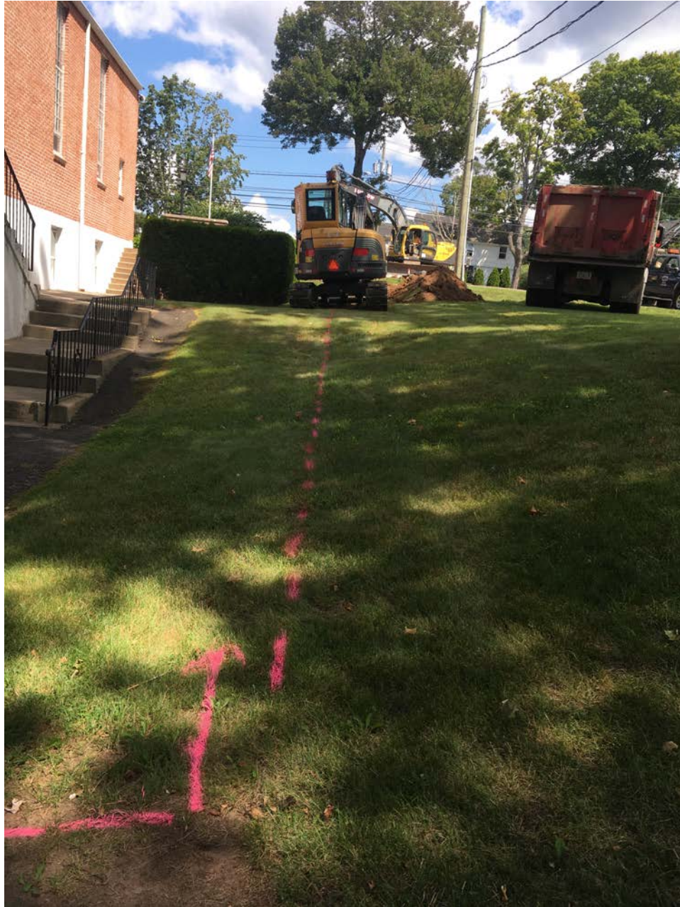
Picture 7: Facing east. View from back of 280 Main Street, where water line will go into the building.