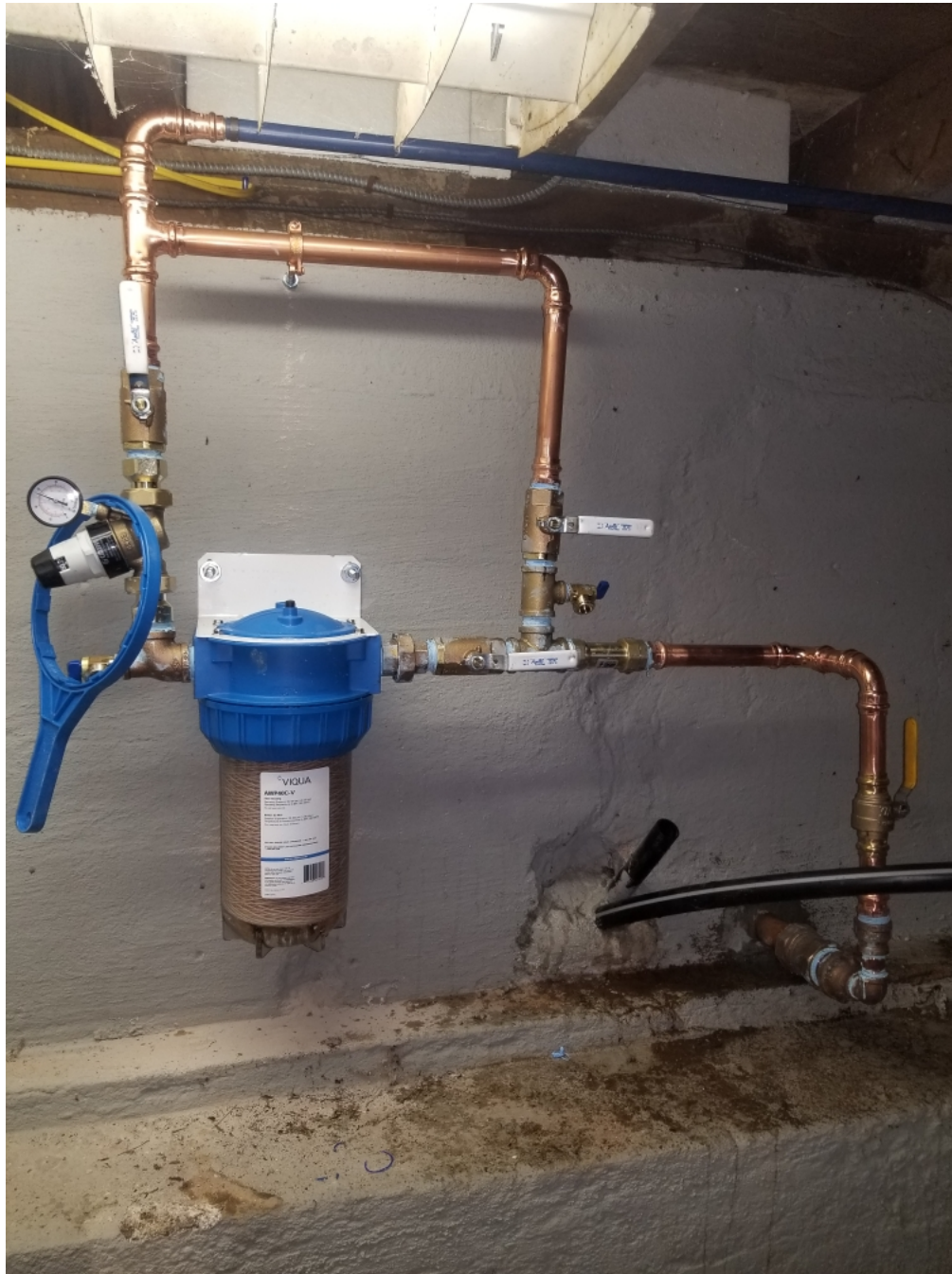
Picture 11: View of final water service components installed at the 151R Main Street building.