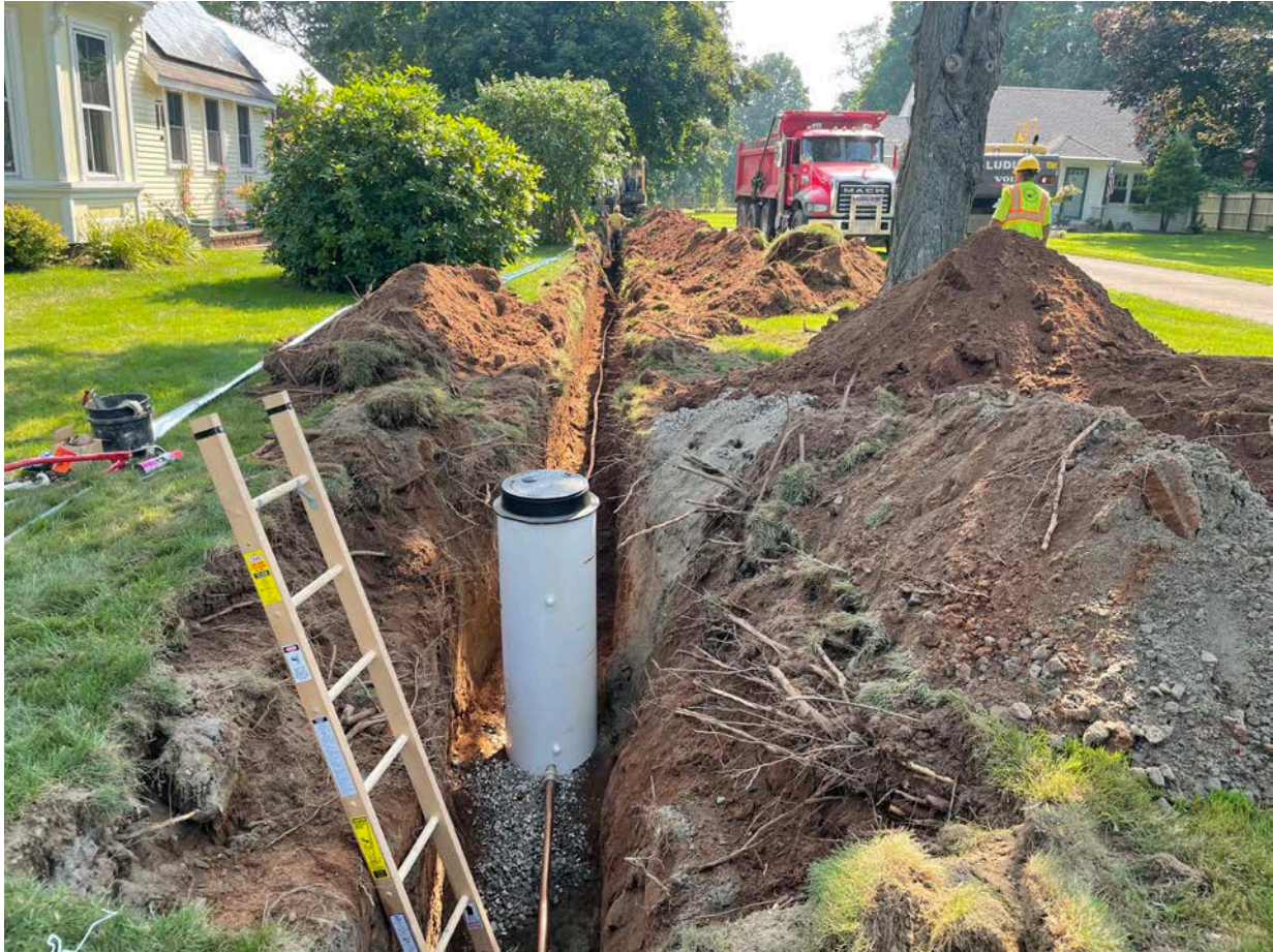
Picture 4: Meter pit that Ludlow has connected 1.5" copper water service line to at the 261 Main Street residence. View to the east.