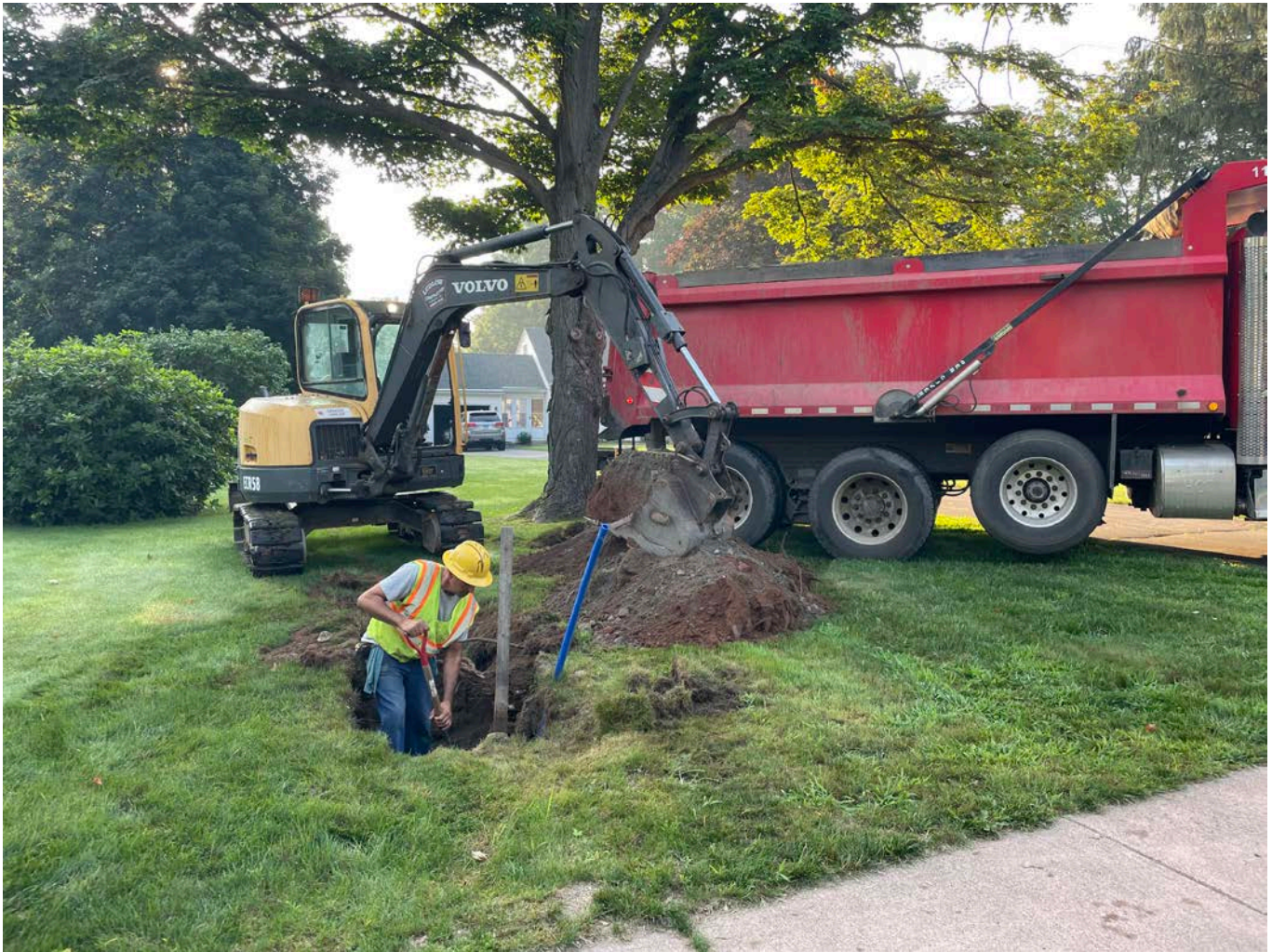
Picture 1: Ludlow excavating east of the curb stop associated with the residence at 261 Main Street, Durham, for the installation of a 1.5" copper water service line. View to the east.