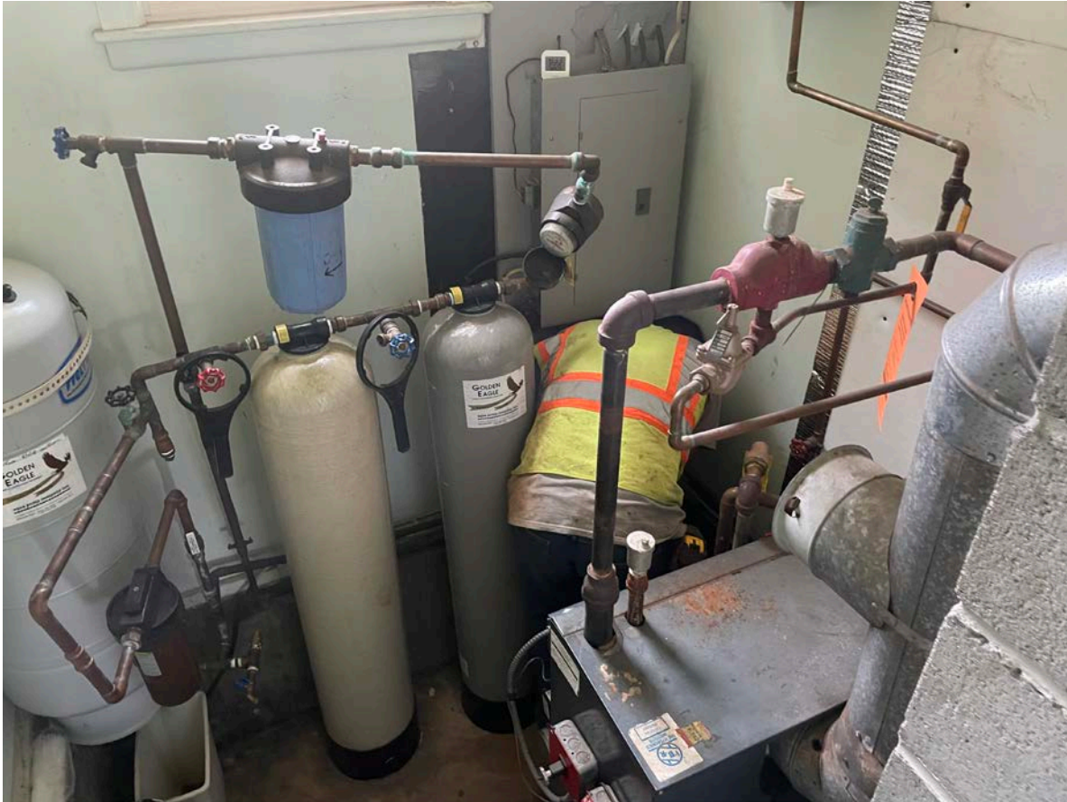
Picture 8: Ludlow drilling through the floor of the 261 Main Street residence during the installation of a 1.5" copper water service line. View to the southeast.