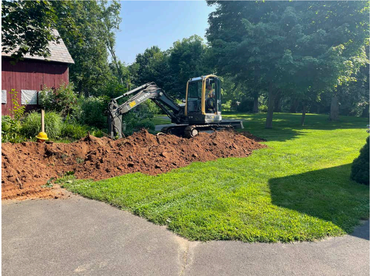
Picture 5: Ludlow excavating at the 261 Main Street property for the installation of a 1.5” copper water service line. View to the northeast.

Project: Durham Meadows Pipeline Installation Date: July 27, 2021 Location: Main Street and Maple Avenue, Durham Day of Week: Tuesday Project #: AECOM: 6061487 Report No: 289 Contractor: Ludlow Construction Page: 8 of 15