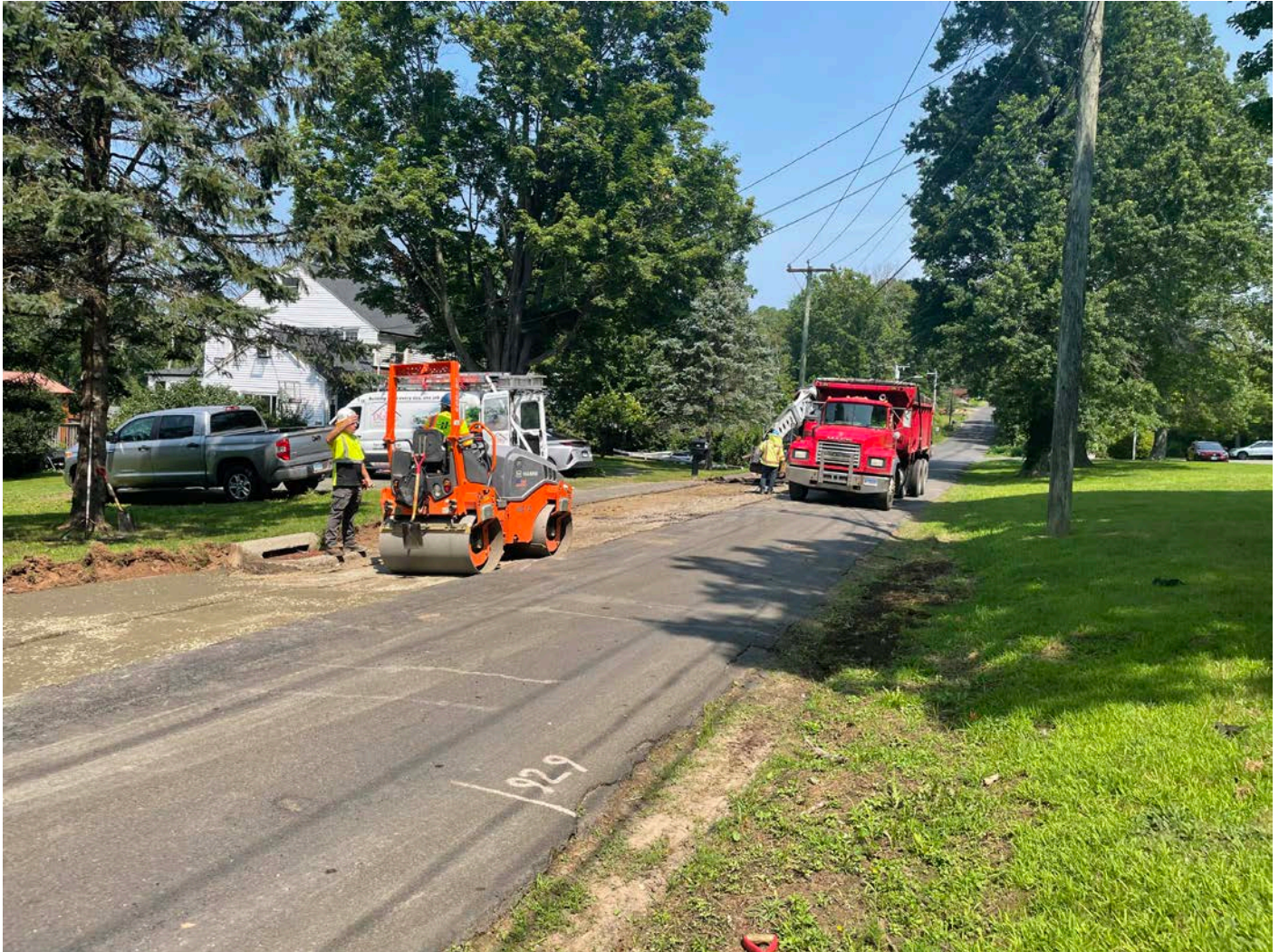
Picture 6: Laydon performing permanent paving activities on a trench overcut on Maple Avenue at ~Station 929+50. View to the northwest.