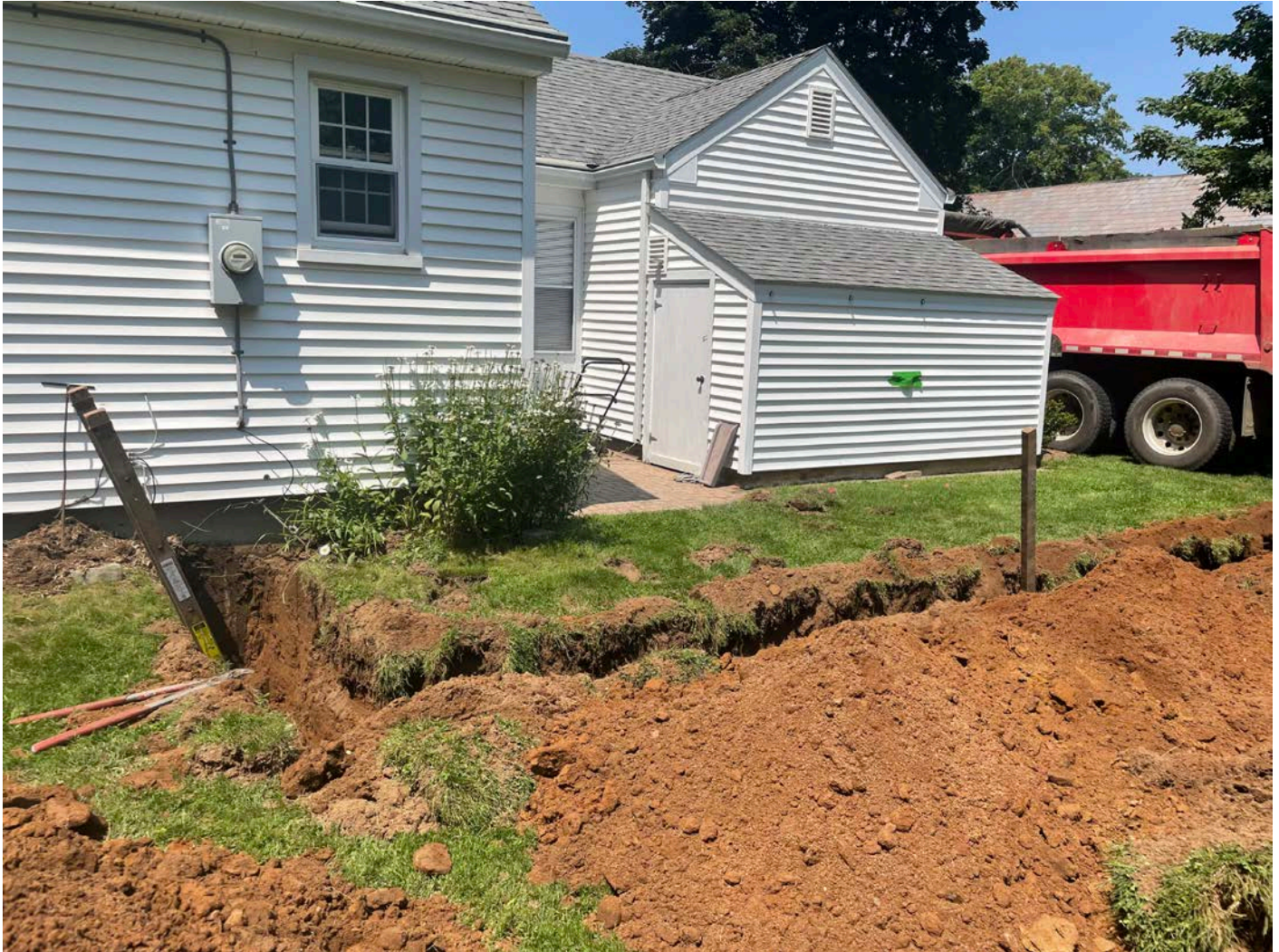
Picture 7: View of excavation made at the 261 Main Street residence for the installation of a 1.5" copper water service line on the home's east side. View to the southwest.

Project: Durham Meadows Pipeline Installation Date: July 27, 2021 Location: Main Street and Maple Avenue, Durham Day of Week: Tuesday Project #: AECOM: 6061487 Report No: 289 Contractor: Ludlow Construction Page: 10 of 15