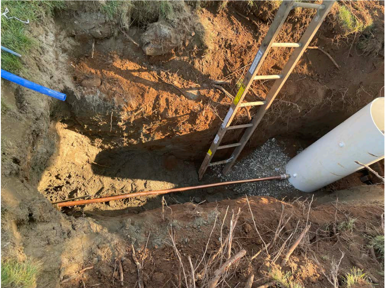
Picture 3: 1.5" copper water service line that Ludlow has connected between the curb stop for the 261 Main Street residence and its associated meter pit. View to the north.