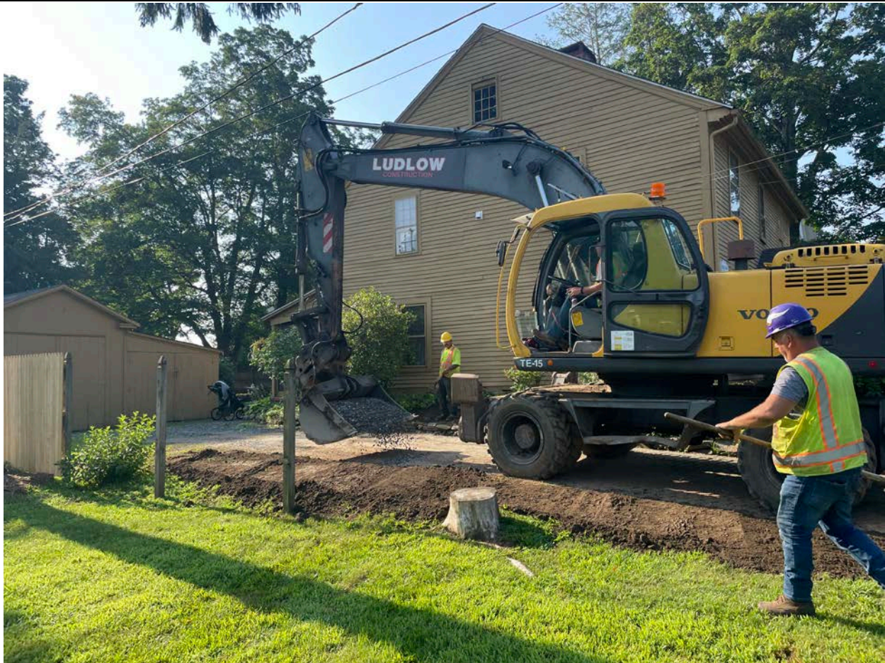
Picture 2: Ludlow placing gravel on the driveway of the 257 Main Street residence after having installed a 1” copper water service line at the property yesterday. View to the northeast.