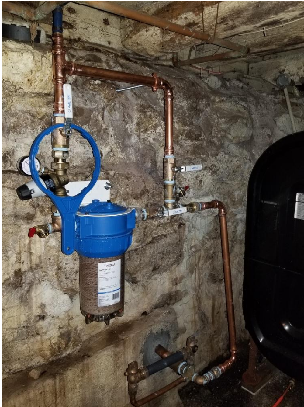
Picture 12: View of final water service components installed at the 153 Main Street building.