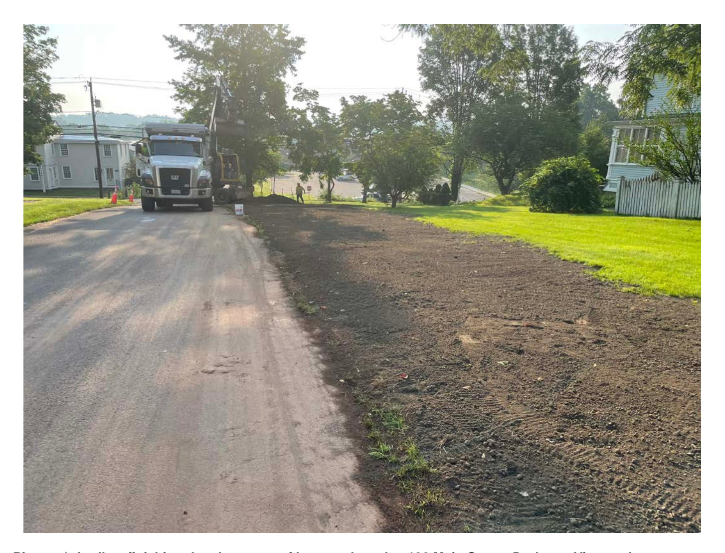
Picture 1: Ludlow finishing the placement of loam and seed at 196 Main Street, Durham. View to the east.