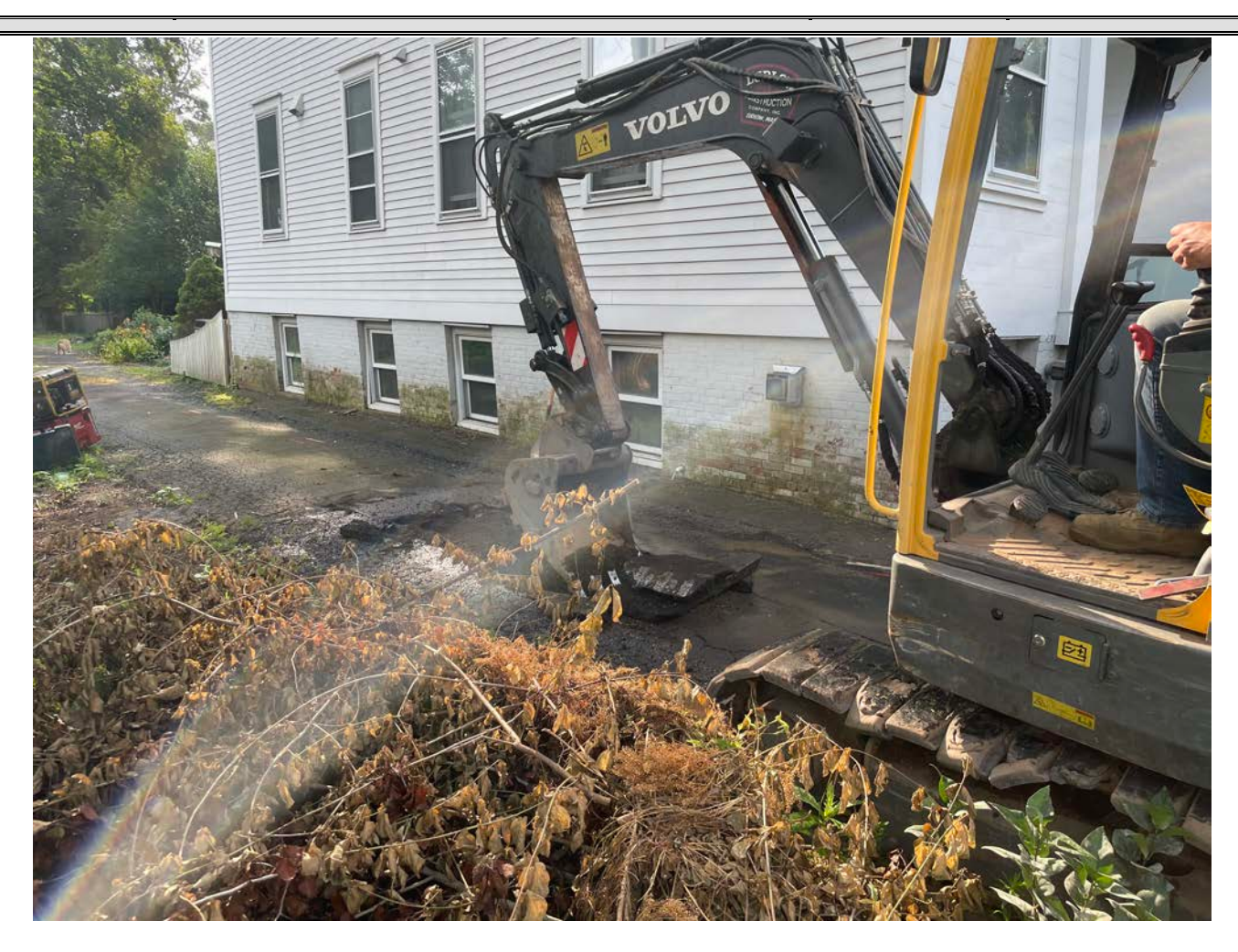
Picture 3: Ludlow excavating on the driveway of the 253 Main Street residence as they prepare to install 1" copper water service line to the home. View to the northwest.