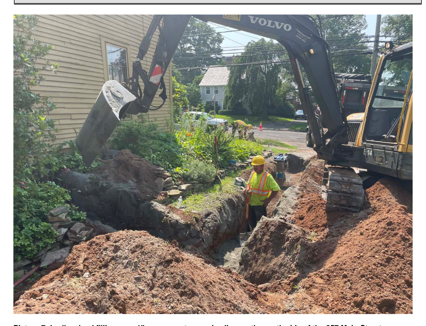
Picture 7: Ludlow backfilling over 1" copper water service line on the north side of the 257 Main Street residence. View to the southwest.