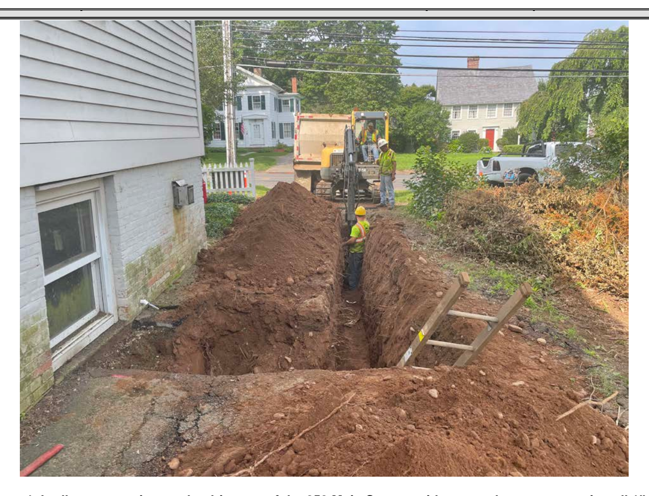
Picture 4: Ludlow excavating on the driveway of the 253 Main Street residence as they prepare to install 1" copper water service line to the home. View to the west.