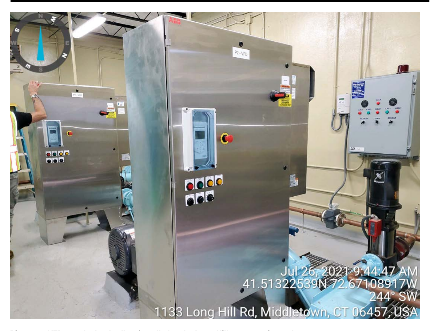
Picture 9: VFD panels that Ludlow installed at the Long Hill pump station today.

Contractor: Ludlow Construction Page: 12 of 12