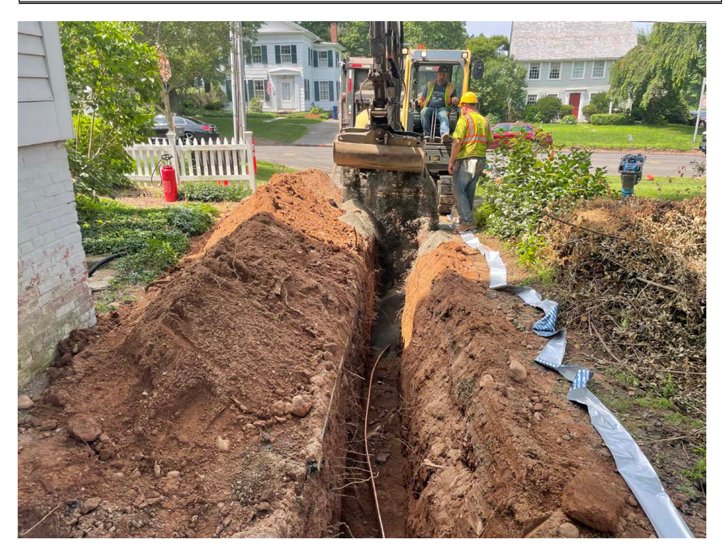
Picture 6: Ludlow backfilling over 1" copper water service line on the north side of the 253 Main Street residence. View to the west.

Contractor: Ludlow Construction Page: 9 of 12