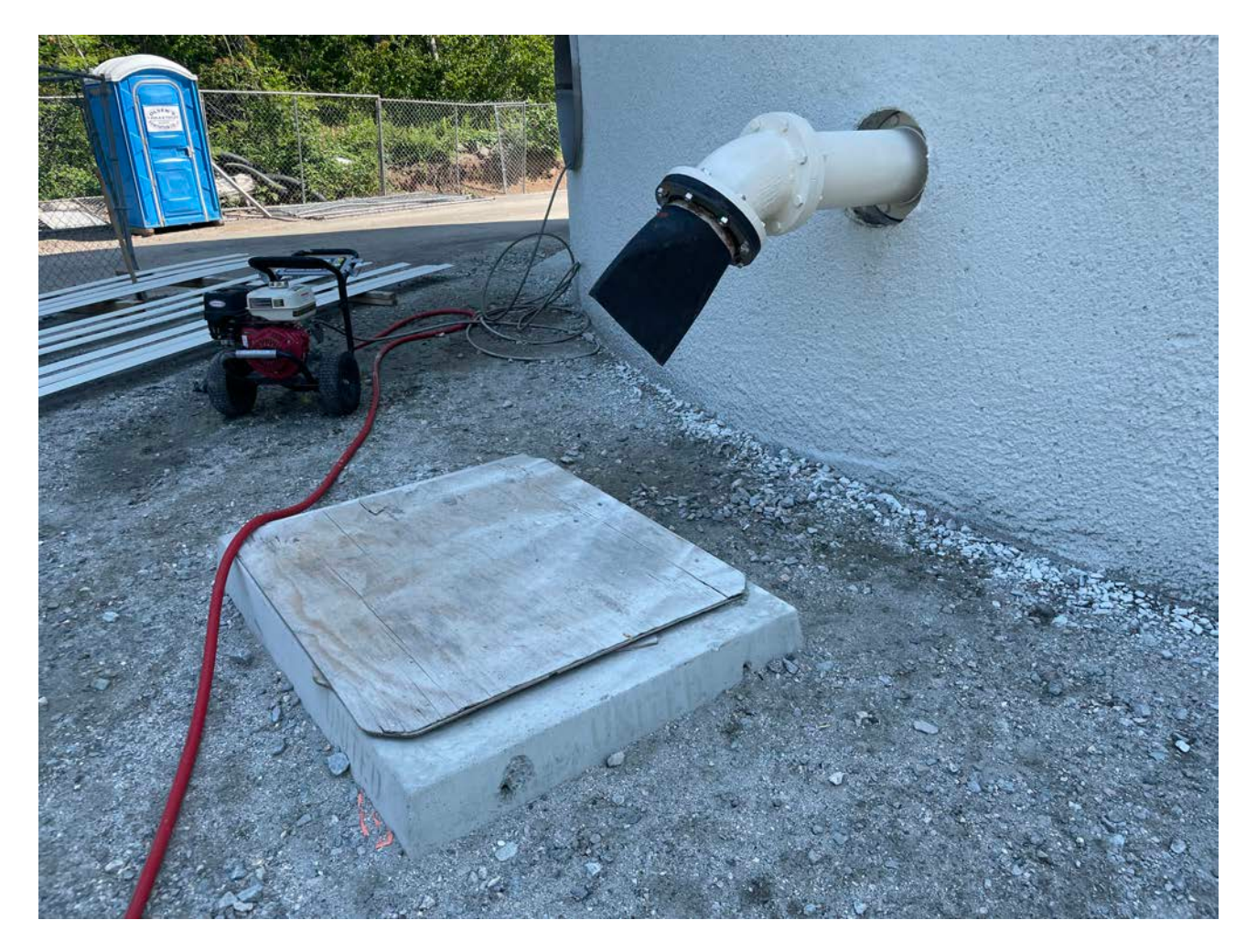
Picture 3: Overflow pipe on the exterior of the water tank located east of the Shared Access Road that DN Tanks painted. View to the north.