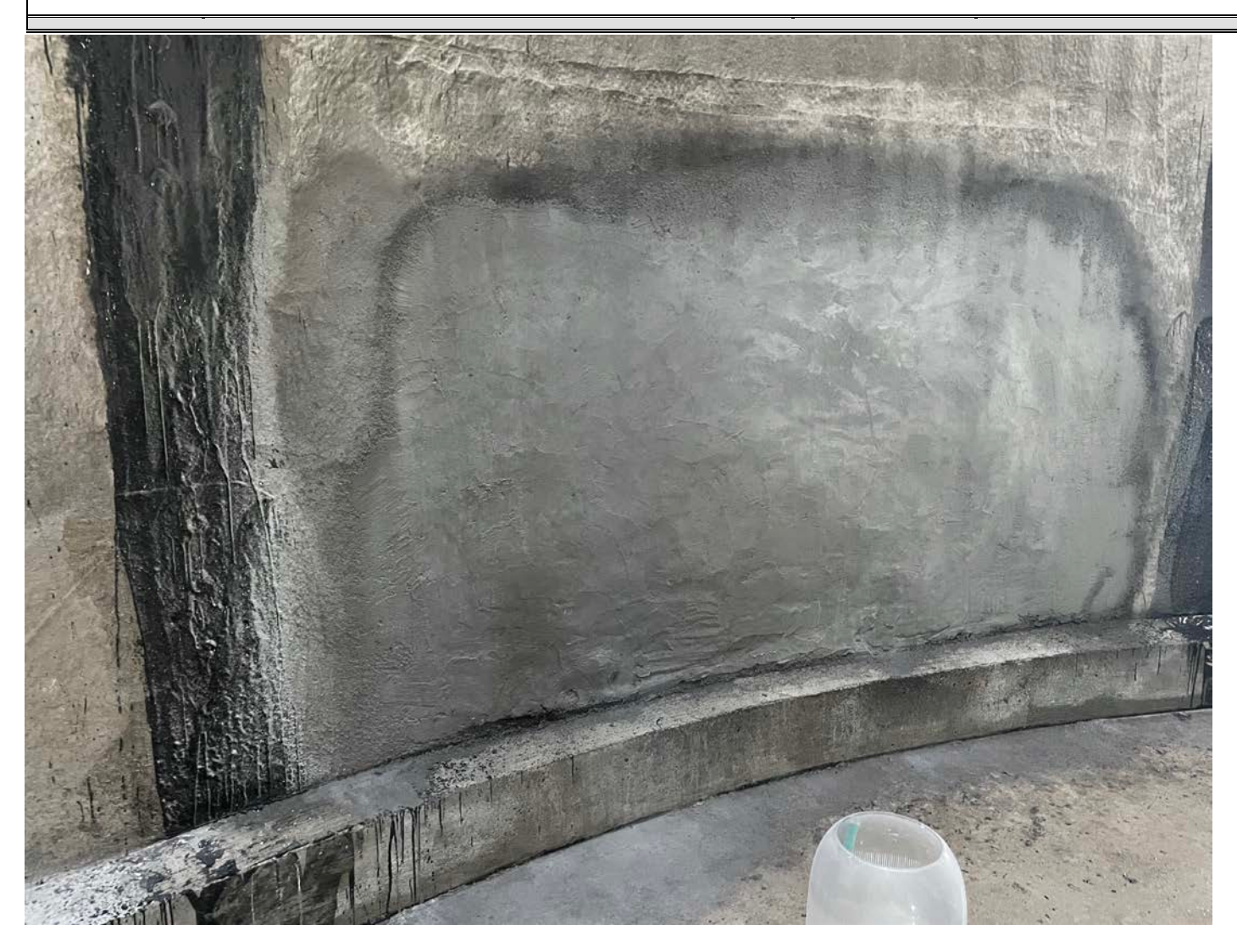
Picture 5: Non-shrink grout that DN Tanks mortared over the repaired portion of the water tank where a temporary access was once located. View to the east.