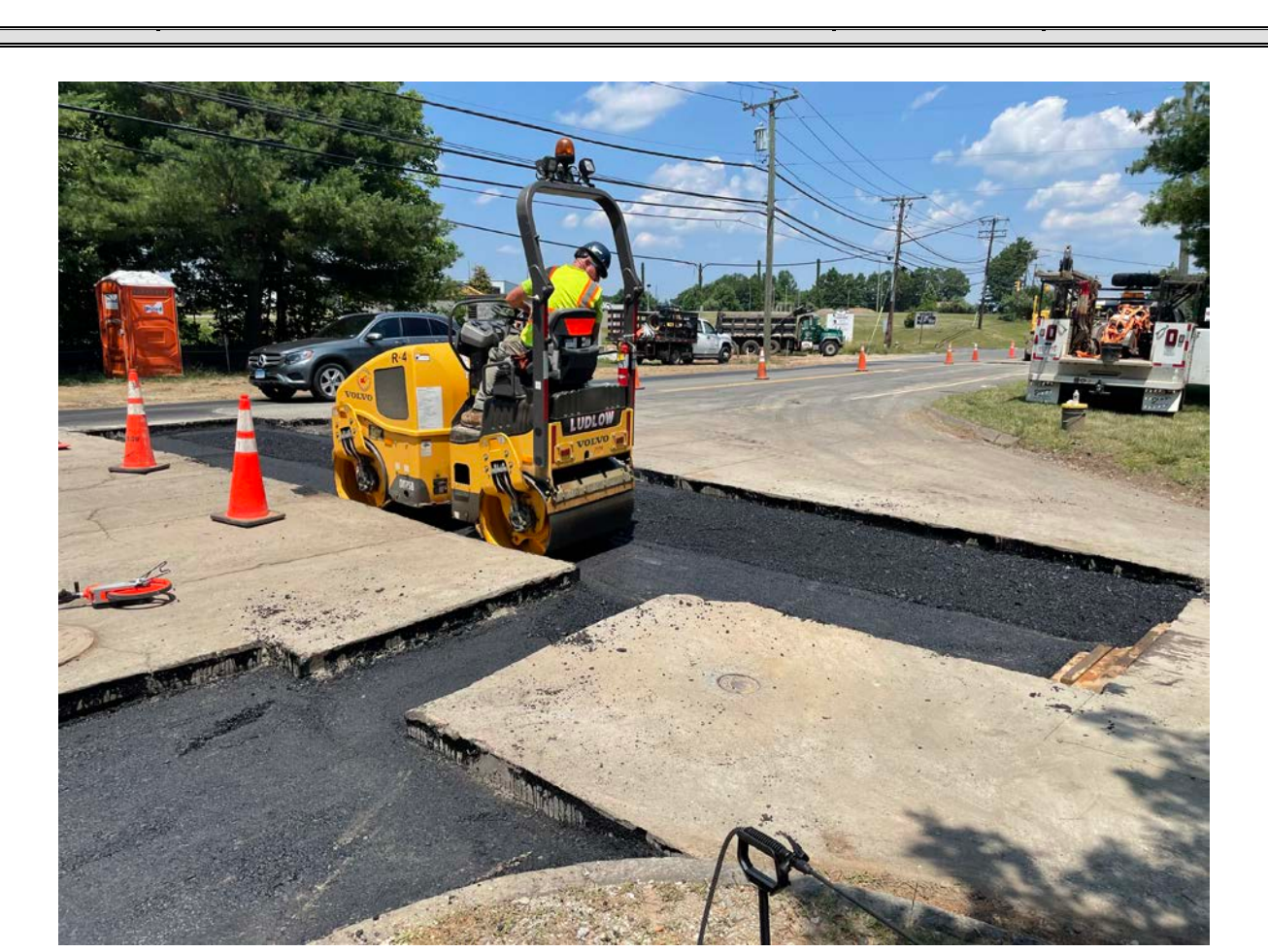
Picture 9: Ludlow rolling the first lift of asphalt on trench overcuts on the northbound lane of S. Main Street, Middletown. View to the north.

Contractor: Ludlow Construction Page: 11 of 11