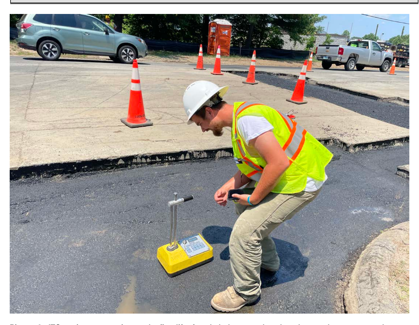
Picture 8: JTC testing compaction on the first lift of asphalt that was placed on the trench overcuts on the northbound lane of S. Main Street, Middletown. View to the west.

Contractor: Ludlow Construction Page: 10 of 11