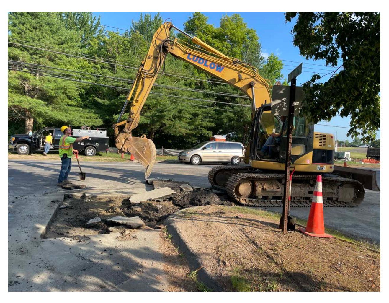
Picture 1: Ludlow removing asphalt from a trench cut overcut at the intersection of Talcott Ridge Drive and S. Main Street, Middletown. View to the west.

Contractor: Ludlow Construction Page: 3 of 11