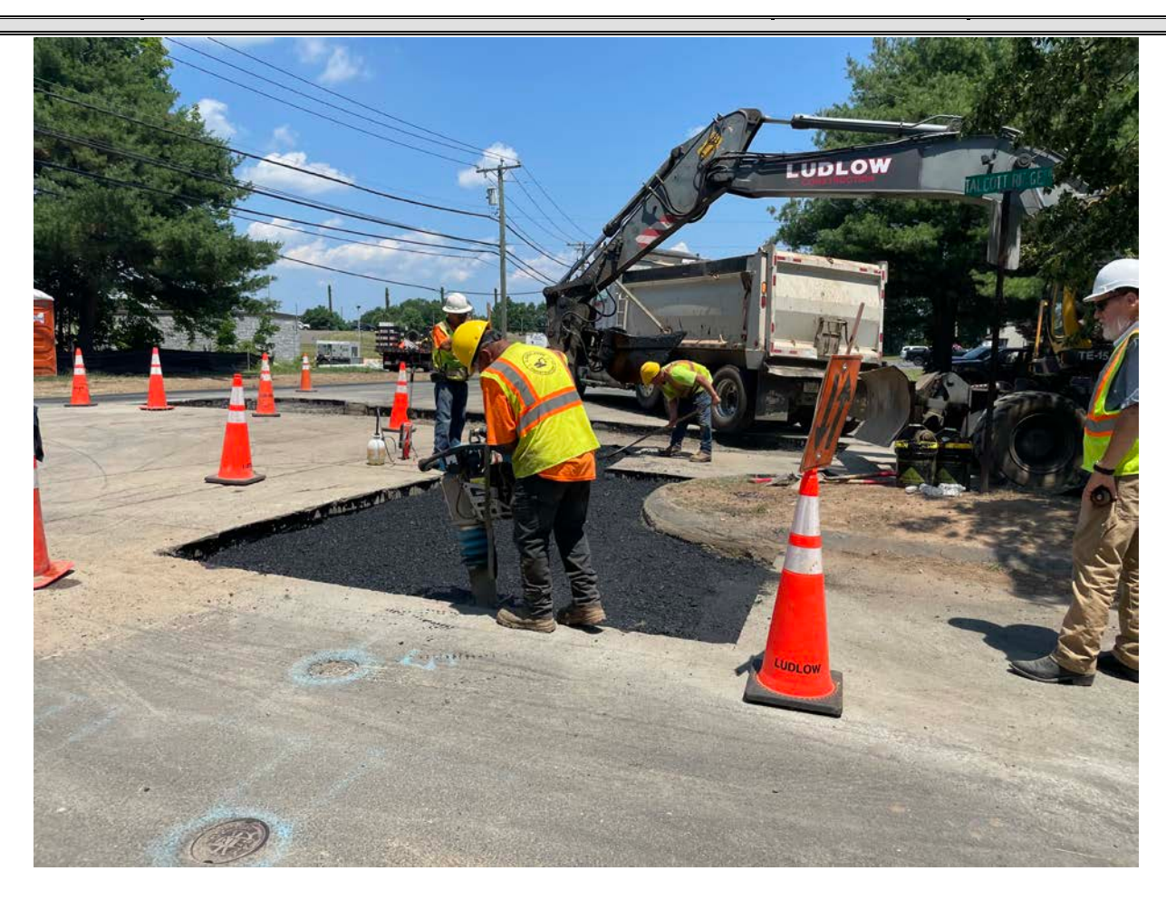
Picture 7: Ludlow using a jumping jack to compact asphalt along the edge of a trench overcut on S. Main Street as part of permanent paving activities. View to the north.