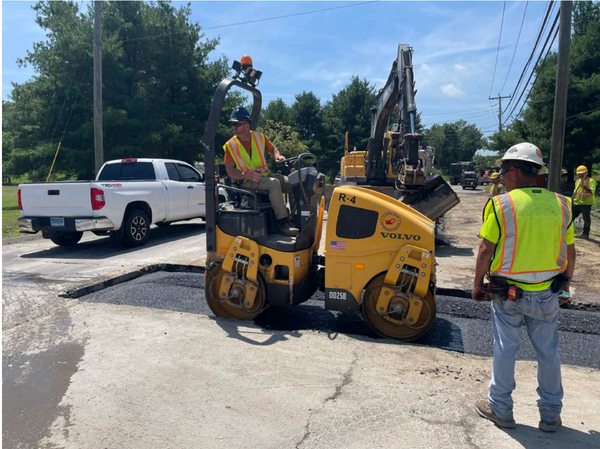
Picture 6: Ludlow rolling asphalt on trench overcuts on S. Main Street as part of permanent paving activities. View to the south.