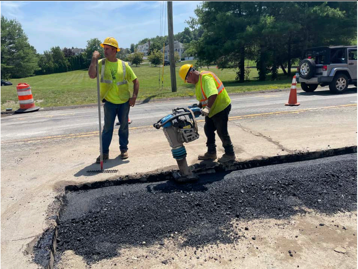
Picture 7: Ludlow using a jumping jack to compact asphalt on trench overcuts on S. Main Street as part of permanent paving activities. View to the east.