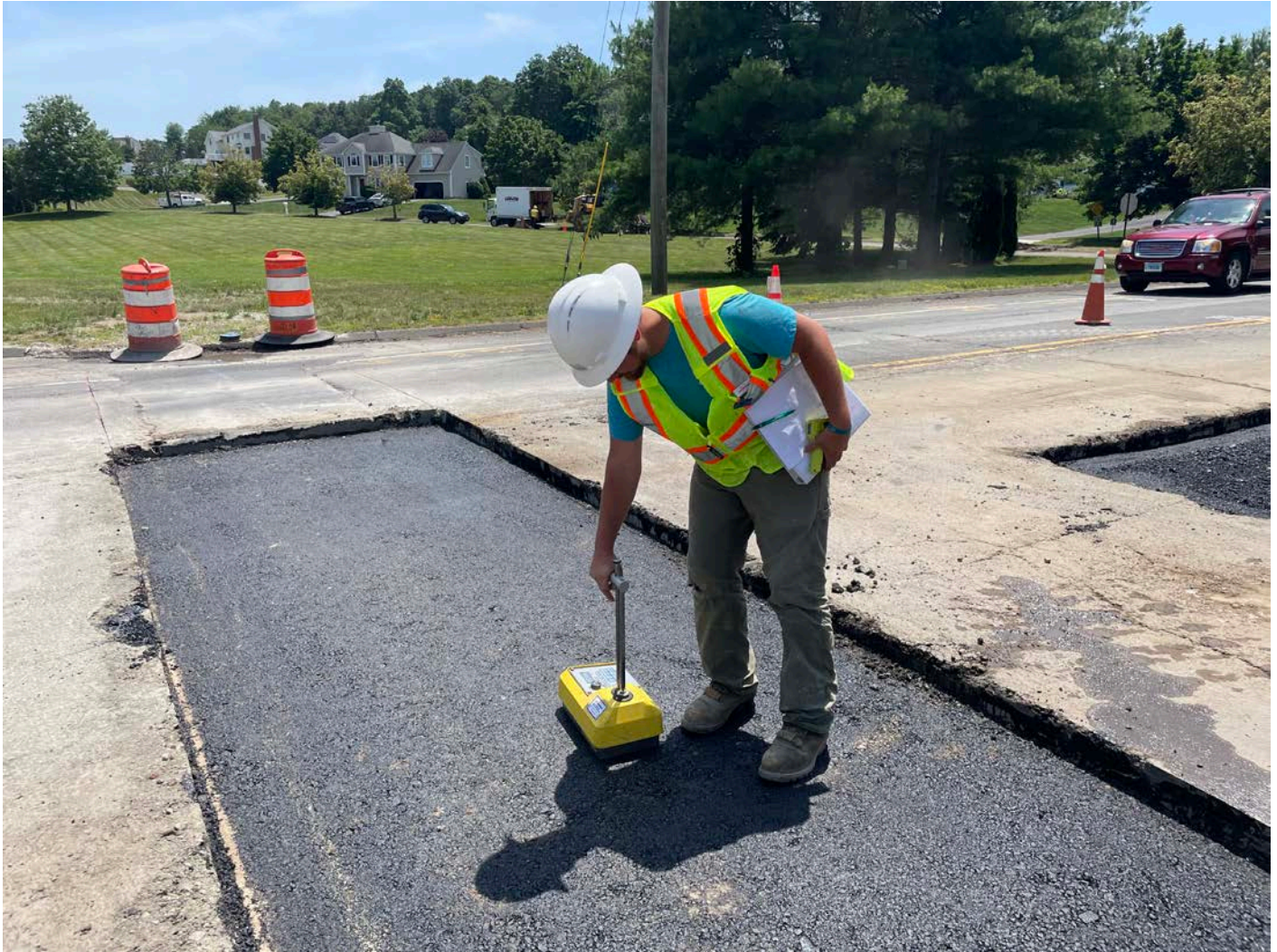
Picture 8: JTC testing compaction on the first lift of asphalt that was placed on the trench overcuts on the southbound lane of S. Main Street, Middletown. View to the east.

Project: Durham Meadows Pipeline Installation Date: June 28, 2021 Location: S. Main Street and the Shared Access Driveway, Middletown Day of Week: Monday Project #: AECOM: 6061487 Report No: 273 Contractor: Ludlow Construction Page: 11 of 12