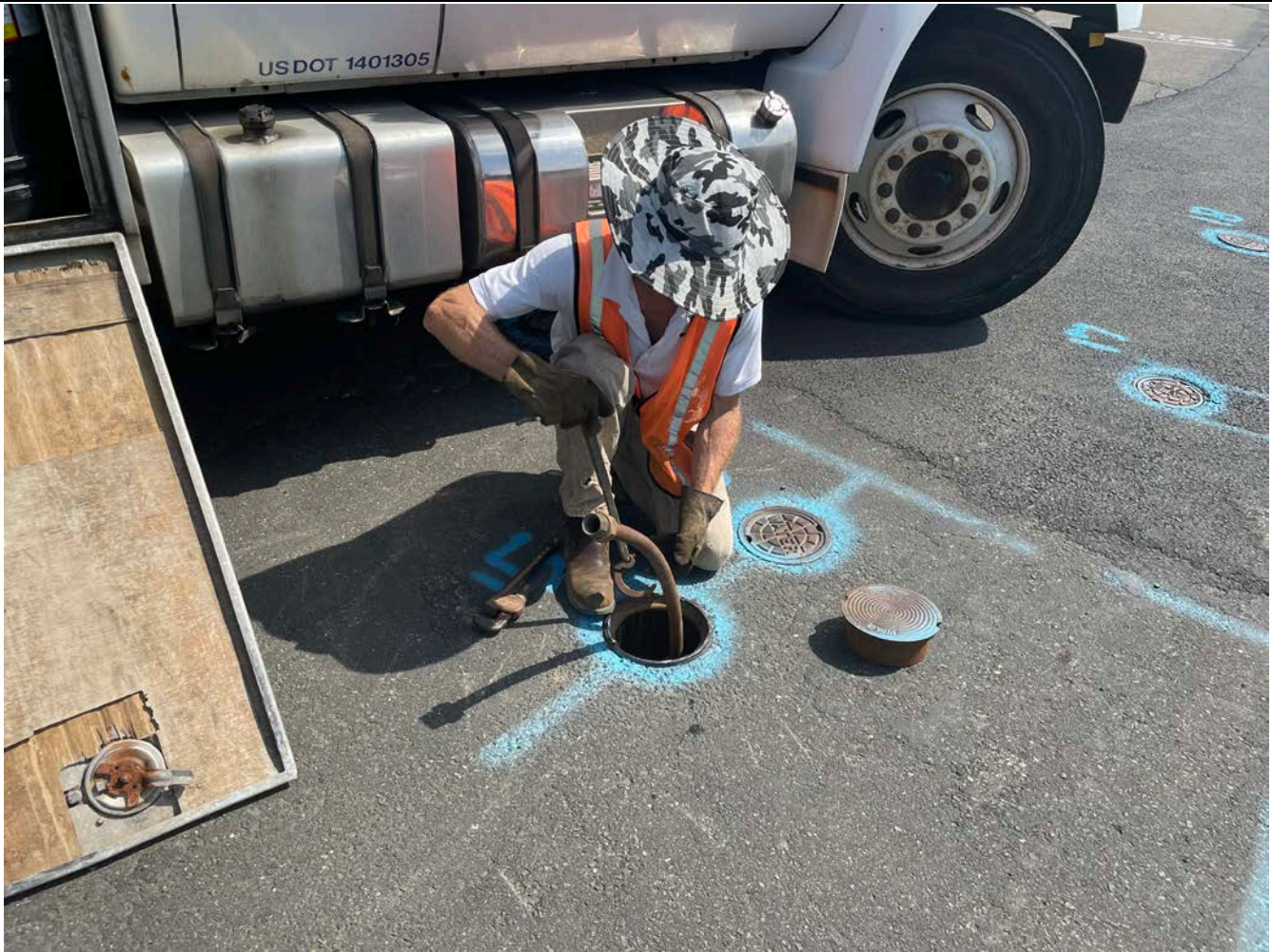
Picture 4: JMS setting up to inject sodium hypochlorite into an 8" DIP water line at the intersection of Talcott Ridge Drive and Watch Hill Drive as part of chlorination activities. View to the southwest.