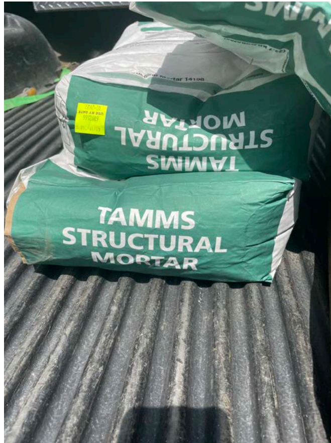
Picture 9: Non-shrinking grout that DN Tanks is using to plug small holes in the water tank roof that were used to run lines into the tank for the lift system.