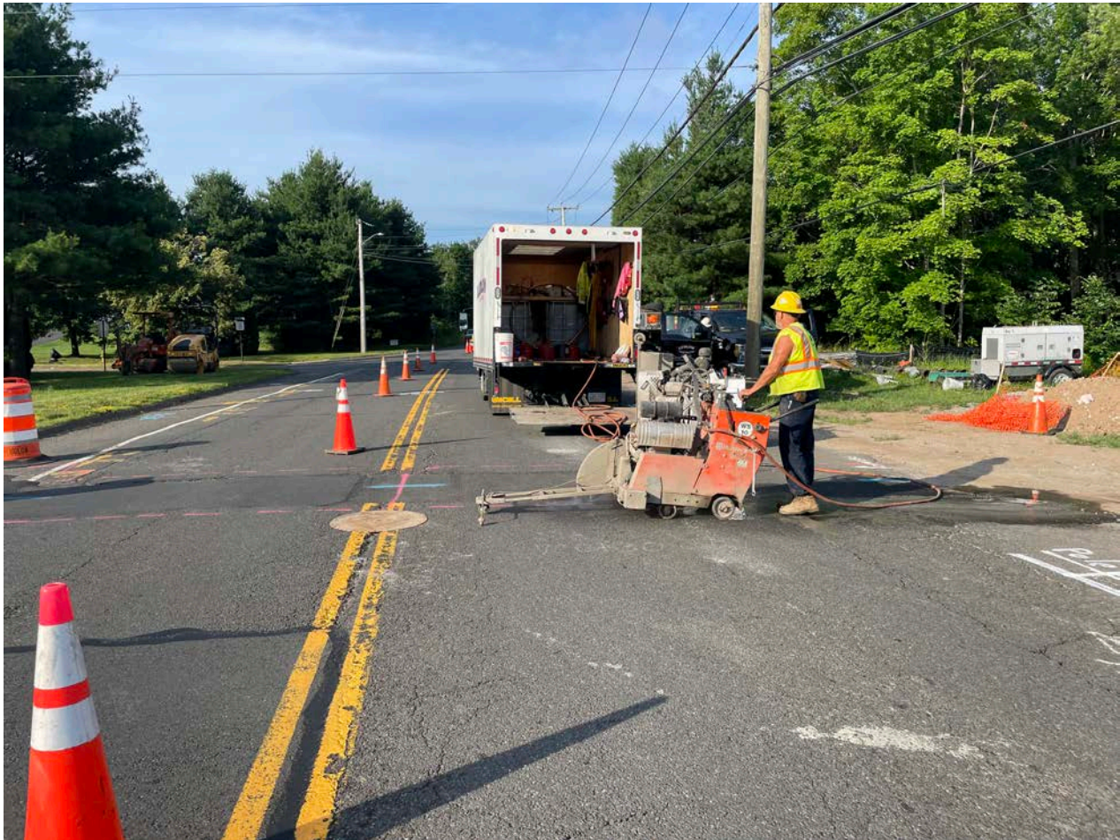
Picture 1: Ludlow saw cutting pavement on trench overcuts as they prepare to place permanent pavement. ~Station 700+00, S. Main Street, Middletown. View to the south.

Project: Durham Meadows Pipeline Installation Date: June 28, 2021 Location: S. Main Street and the Shared Access Driveway, Middletown Day of Week: Monday Project #: AECOM: 6061487 Report No: 273 Contractor: Ludlow Construction Page: 4 of 12