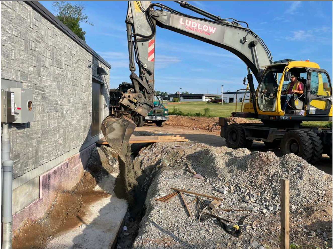
Picture 2: Ludlow placing sand in the utility trench located on the north side of the booster station. View to the west.