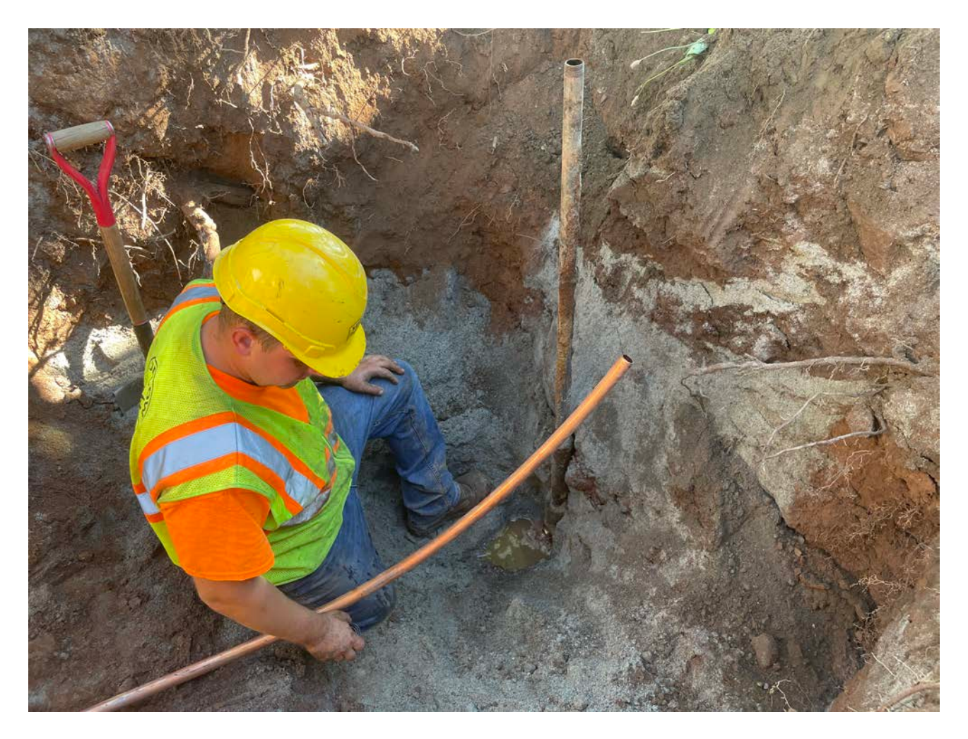
Picture 3: Ludlow preparing to connect 1" copper water service line to the curb stop for 188 Main Street, Durham. View to the northeast.