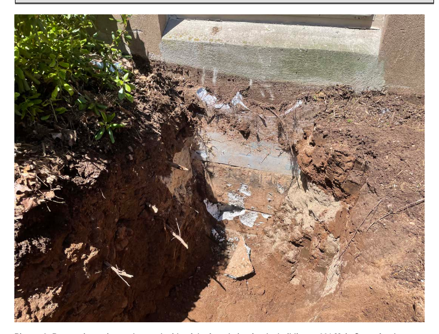
Picture 8: Penetration point on the south side of the foundation for the building at 201 Main Street for the installation of a 1" copper water service line. View to the north.