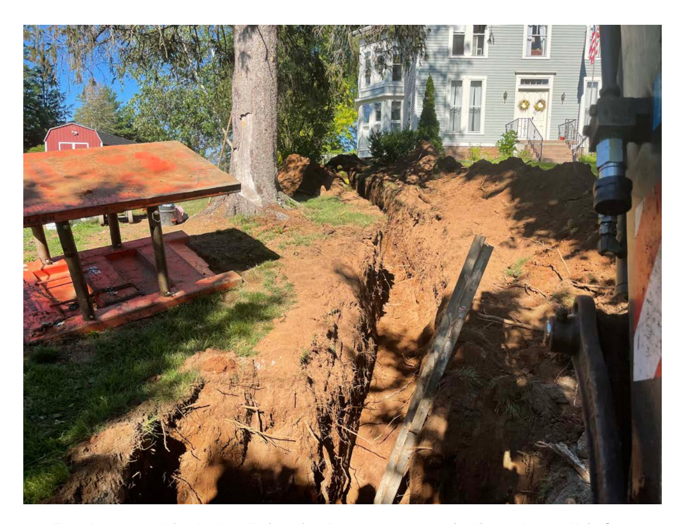
Picture 1: Trench excavated for the Installation of a 1" copper water service line at the 188 Main Street residence. View to the west.