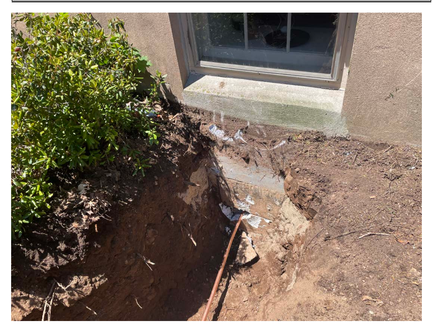
Picture 11: 1" copper water service line that has been fed through the penetration that was made on the south wall of the foundation for the 201 Main Street. View to the north.