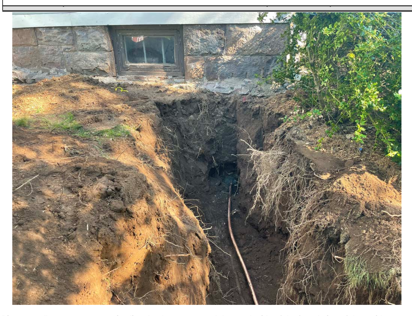
Picture 4: 1" copper water service line that has penetrated the south side of the foundation of the residence at 188 Main Street in Durham. View to the north.