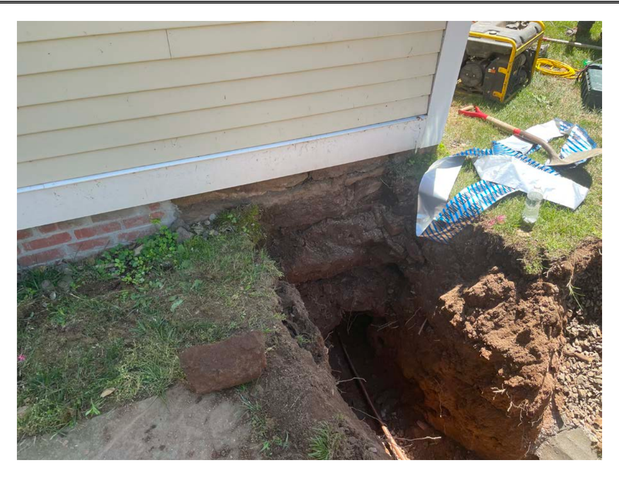
Picture 9: North-facing foundation of the building at 199 Main Street, Durham where Ludlow inserted a 1" copper water service line. View to the southwest.