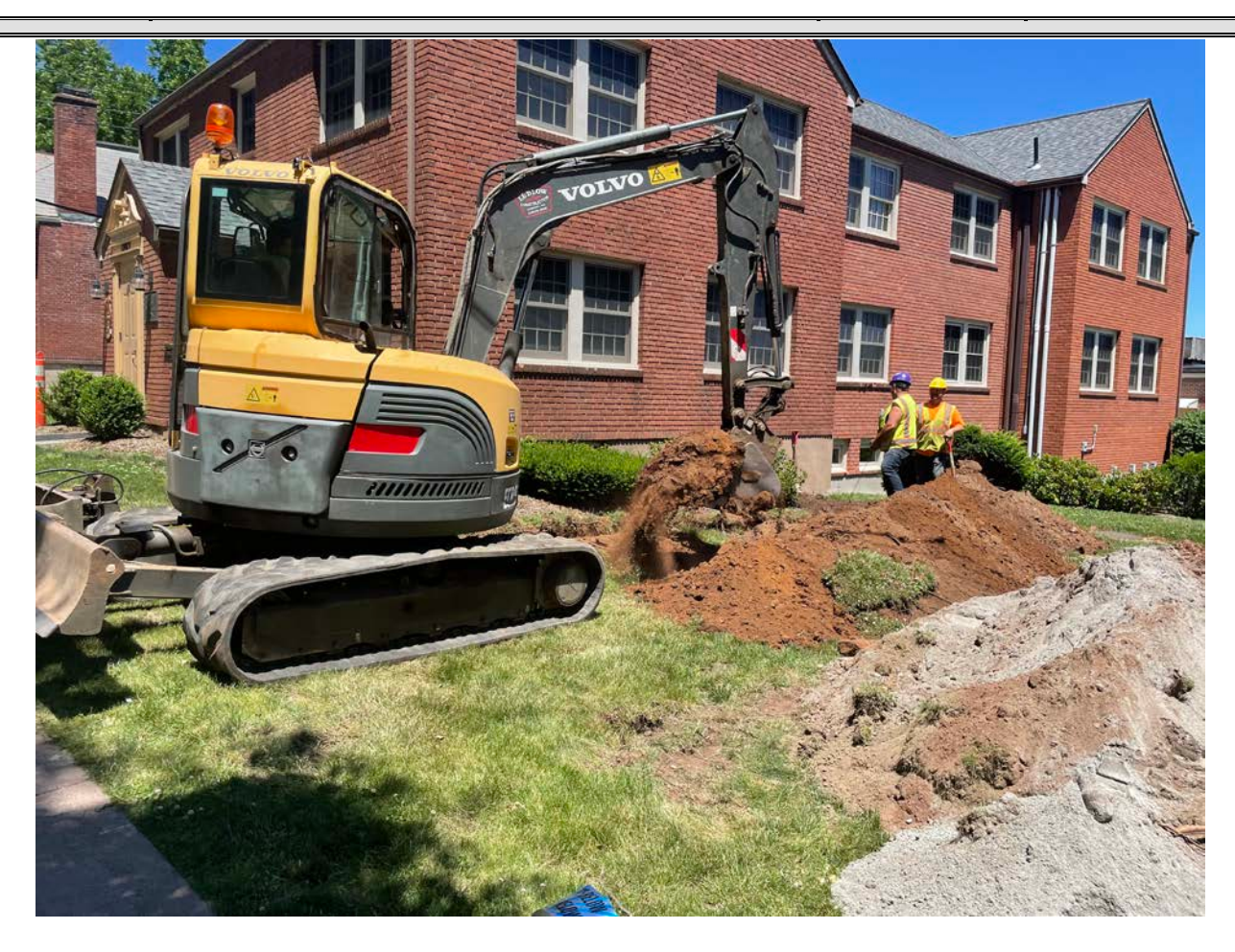
Picture 7: Ludlow excavating for the installation of a 1" copper water service line on the south side of the 201 Main Street building. View to the northeast.