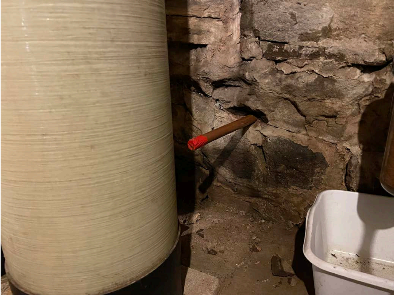
Picture 4: 1" copper water service line that has penetrated the north side of the foundation of the residence at 176 Main Street in Durham. View to the north.

Project: Durham Meadows Pipeline Installation Date: June 23, 2021 Location: Main Street, Durham; S. Main Street and the Shared Access Driveway, Middletown Day of Week: Wednesday Project #: AECOM: 6061487 Report No: 270 Contractor: Ludlow Construction Page: 6 of 11