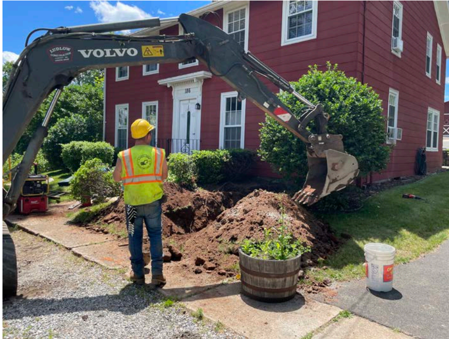
Picture 7: Ludlow excavating for the installation of a 1" copper water service line on the east side of the 186 Main Street residence. View to the southwest.