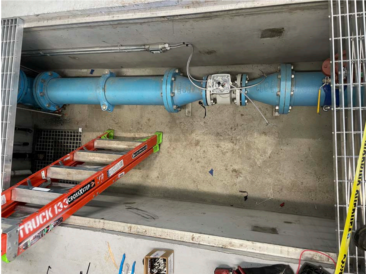
Picture 6: View of the flow meter at the booster station that United Concrete is wiring today. Station 750+63.

Project: Durham Meadows Pipeline Installation Date: June 23, 2021 Location: Main Street, Durham; S. Main Street and the Shared Access Driveway, Middletown Day of Week: Wednesday Project #: AECOM: 6061487 Report No: 270 Contractor: Ludlow Construction Page: 8 of 11