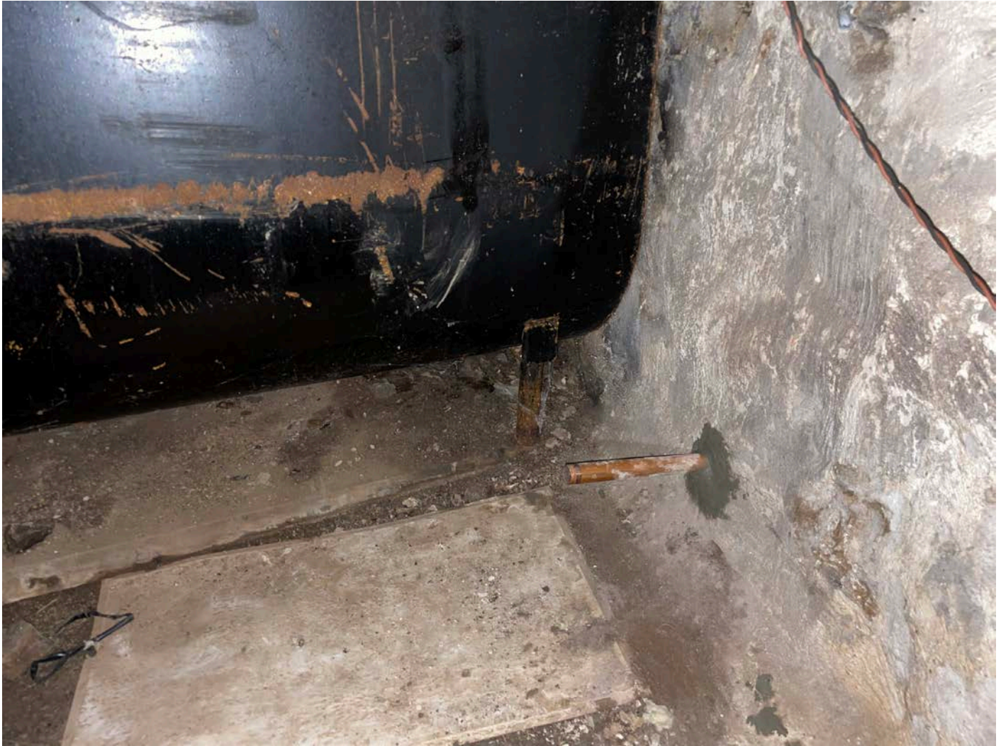
Picture 8: 1" copper water service line that has penetrated the western foundation of the residence at 186 Main Street in Durham. View to the northwest.

Project: Durham Meadows Pipeline Installation Date: June 23, 2021 Location: Main Street, Durham; S. Main Street and the Shared Access Driveway, Middletown Day of Week: Wednesday Project #: AECOM: 6061487 Report No: 270 Contractor: Ludlow Construction Page: 10 of 11