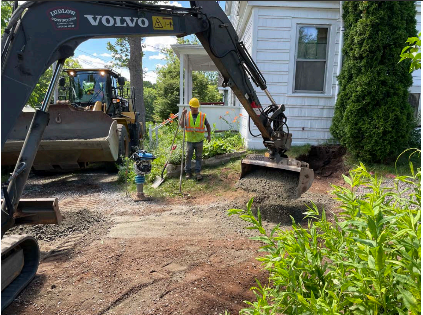
Picture 5: Ludlow backfilling over 1" copper water service line that Ludlow has just installed at the 176 Main Street residence in Durham. View to the south.