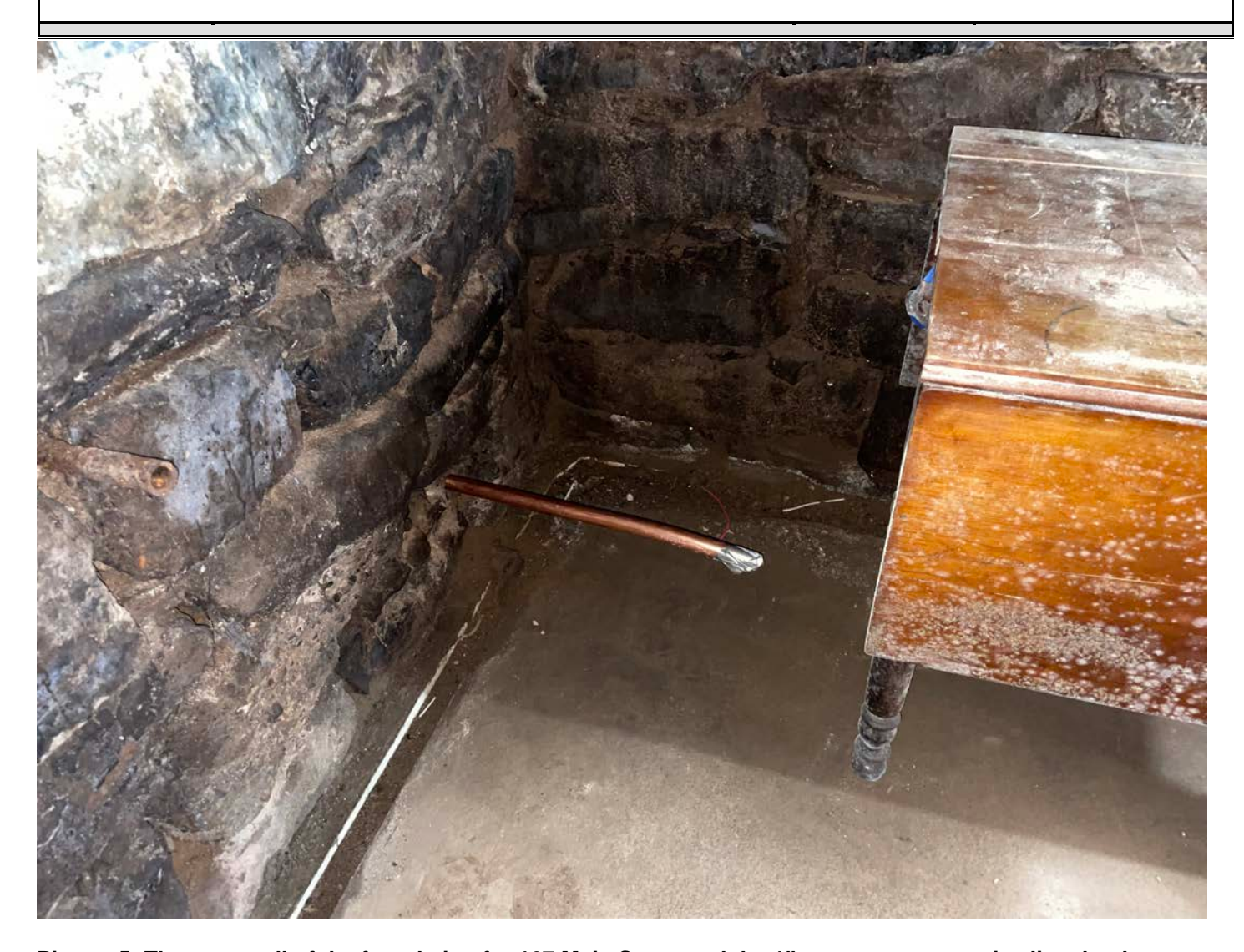
Picture 5: The west wall of the foundation for 167 Main Street and the 1" copper water service line that has penetrated the foundation. View to the north.