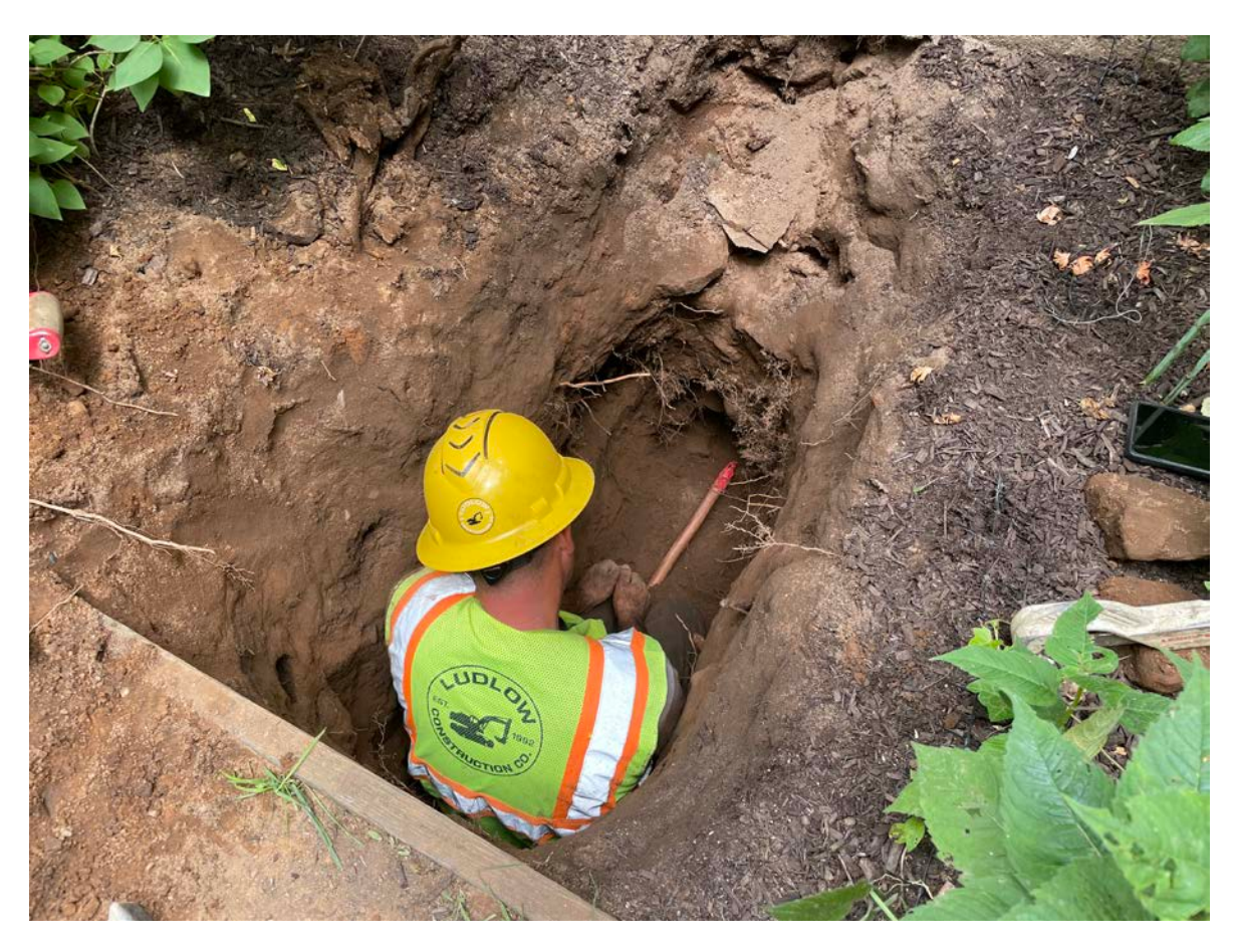
Picture 9: Ludlow inserting a 1" copper water service line through the south wall of the foundation of the 168 Main Street residence. View to the northwest.