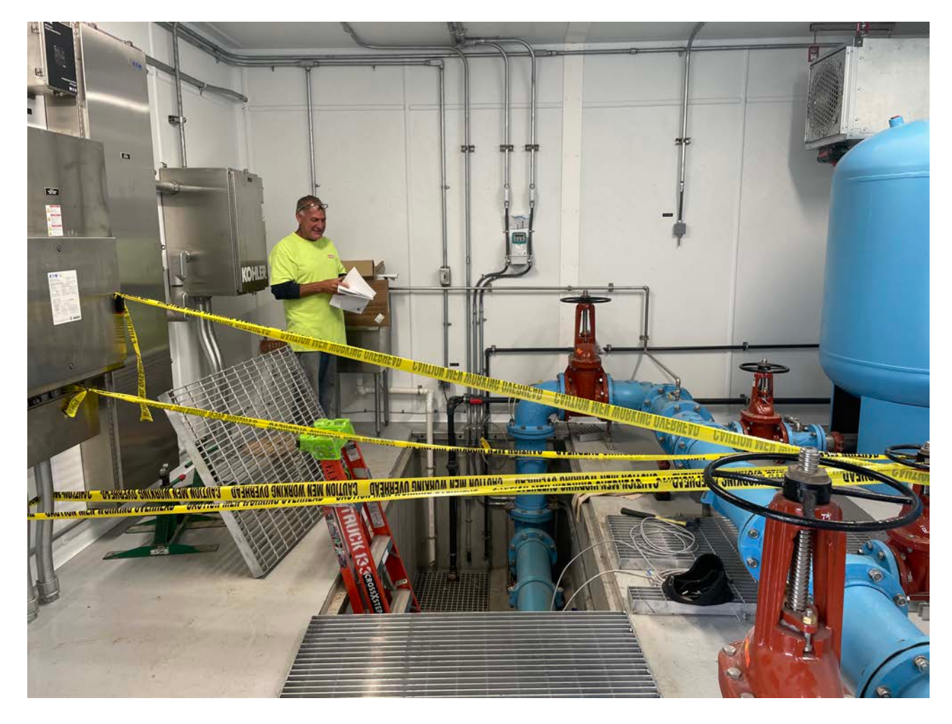
Picture 3: United Concrete working on installing wiring between the two halves of the booster station structure. Station 750+63. View to the east.