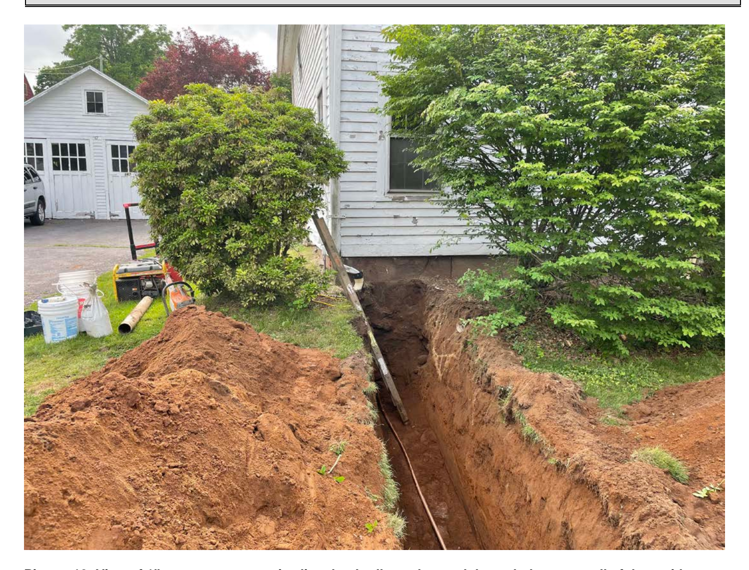
Picture 10: View of 1" copper water service line that Ludlow advanced through the west wall of the residence at 167 Main Street, Durham. View is to the east.