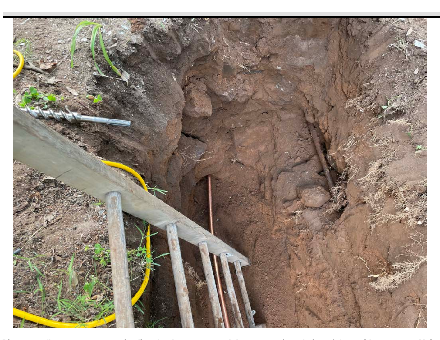
Picture 4: 1" copper water service line that has penetrated the western foundation of the residence at 167 Main Street in Durham. View to the east.

Contractor: Ludlow Construction Page: 6 of 12