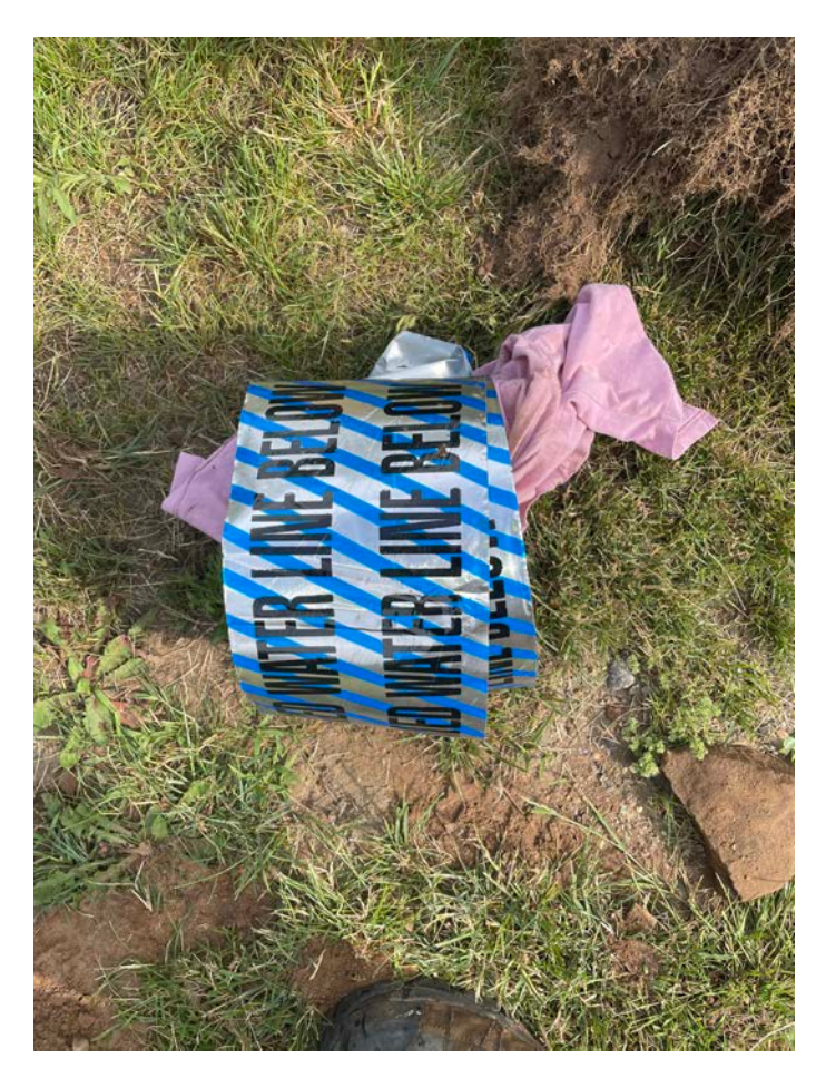
Picture 7: Caution tape that Ludlow is placing over the 1" copper water service lines they have been installing between homes and their associated curb stops.

Contractor: Ludlow Construction Page: 9 of 12