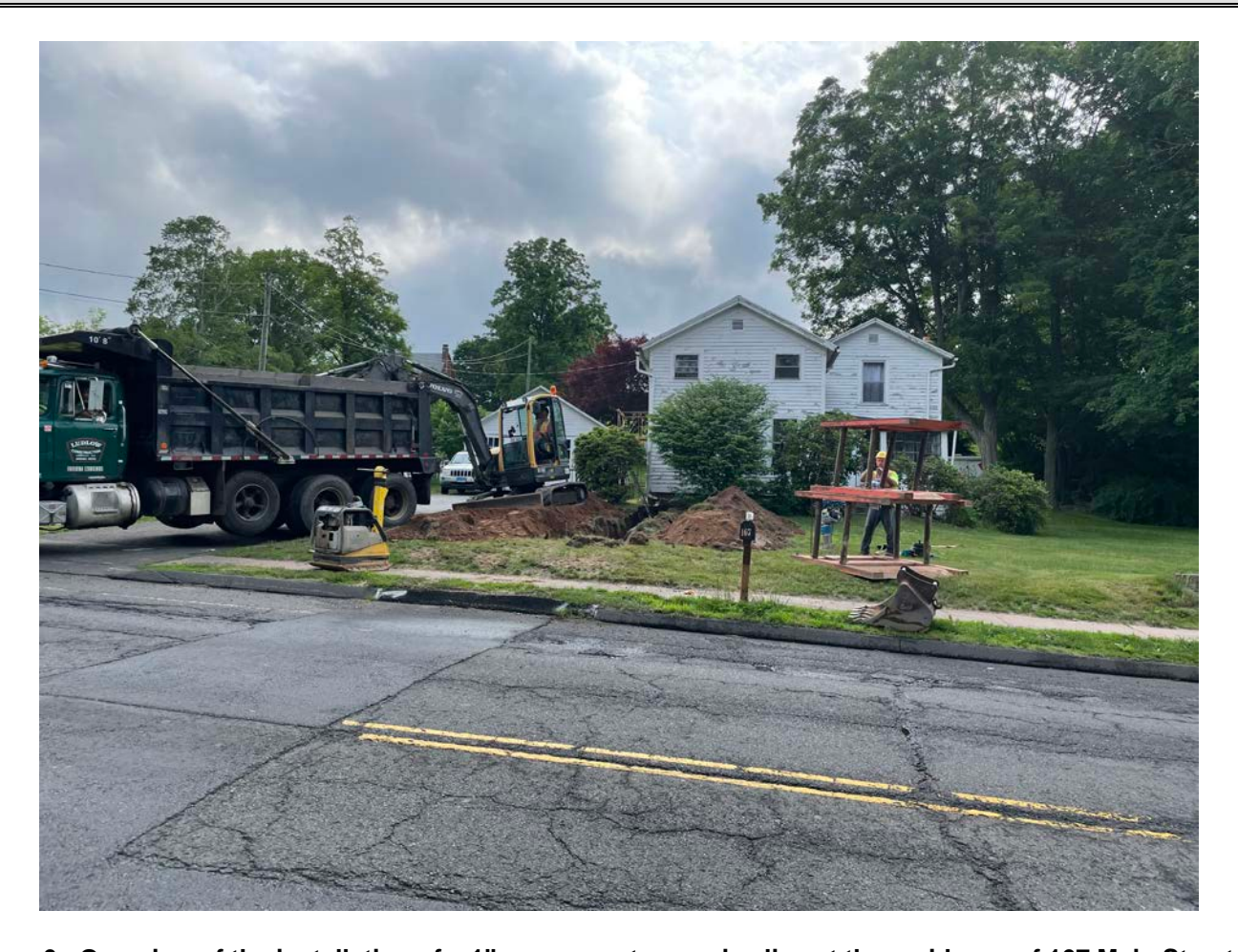
Picture 6: Overview of the installation of a 1" copper water service line at the residence of 167 Main Street in Durham. View to the east.