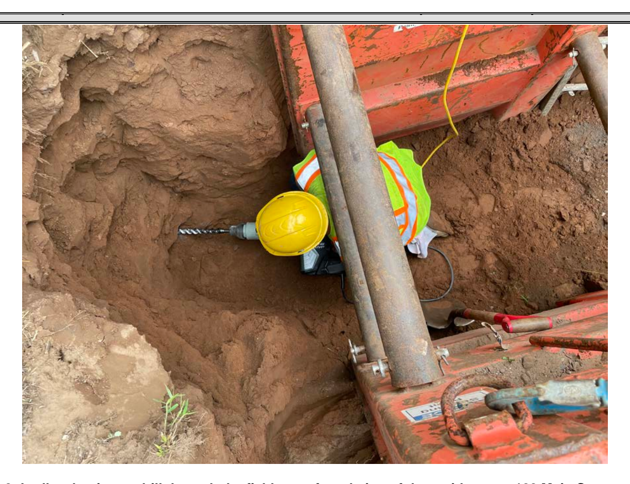
Picture 2: Ludlow begins to drill through the fieldstone foundation of the residence at 120 Main Street, Durham, for the installation of a 1" copper water service line.