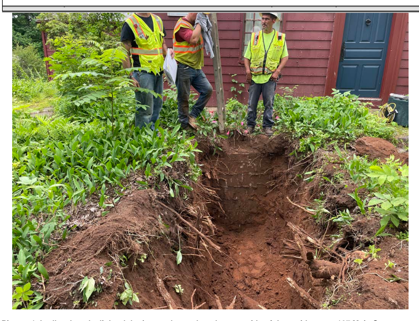
Picture 4: Ludlow has daylighted the jog out located on the west side of the residence at 127 Main Street, Durham. The west wall of the jog out was later penetrated for the insertion of a 1" copper water service line. View to the east.