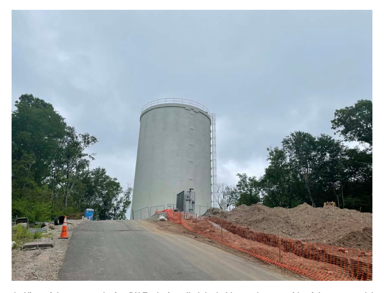
Picture 6: View of the water tank after DN Tanks installed the ladder on the west side of the water tank located east of the Shared Access Driveway in Middletown. View to the east.