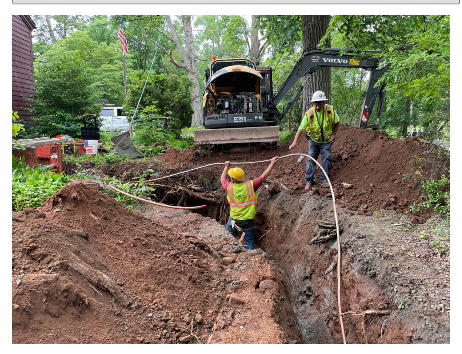
Picture 8: Ludlow placing 1" copper water service line in the trench they have excavated at 127 Main Street between the curb stop and the west side of the residence's foundation. View to the south.

Contractor: Ludlow Construction Page: 10 of 12