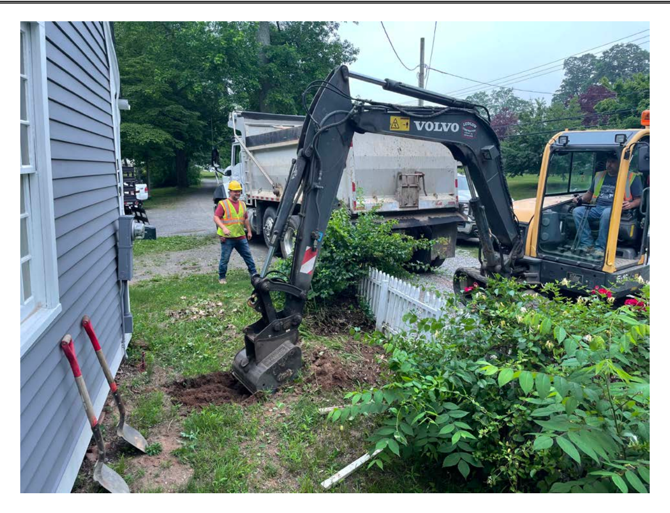
Picture 1: Ludlow begins excavating for the installation of a 1" copper water service line on the west side of the residence at 120 Main Street, Durham. View to the south.