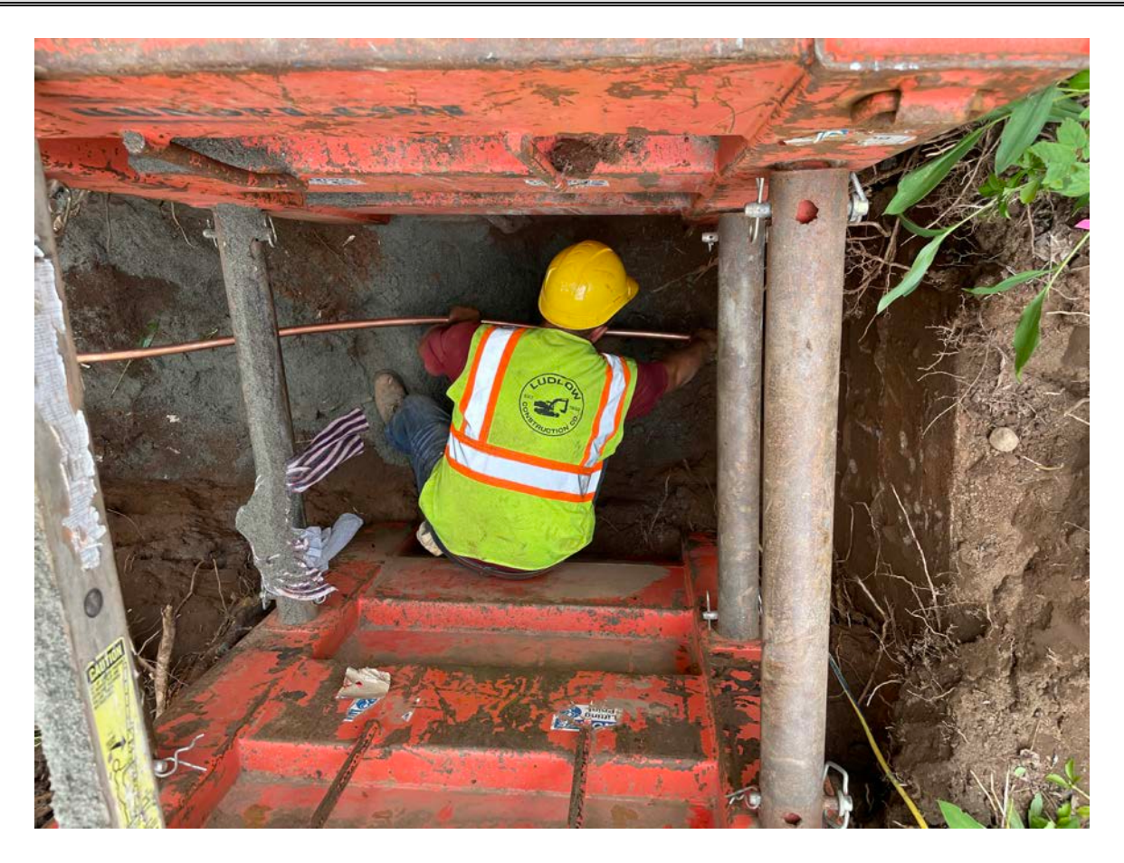
Picture 9: Ludlow inserting a 1" copper water service line through the west wall of the jog out located on the west side of the foundation of the residence at 127 Main Street, Durham.