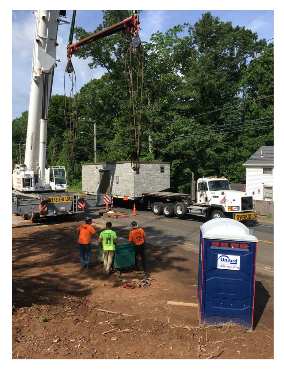
Picture 5: Facing southwest. Meter building arrives on step-deck low-boy trailer.