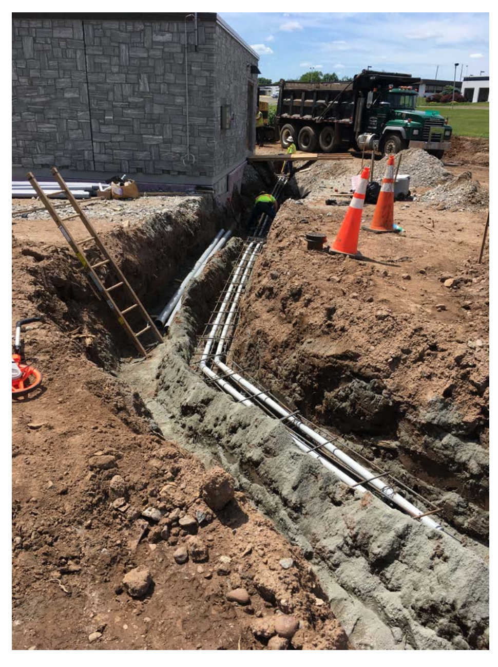
Picture 12: Facing west. Conduit from the booster station toward the street.

Contractor: Ludlow Construction Page: 14 of 15