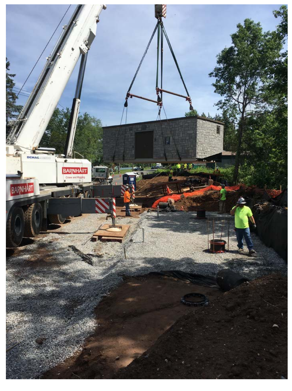
Picture 8: Facing north. Lifting the meter building off the low-boy truck

Contractor: Ludlow Construction Page: 10 of 15