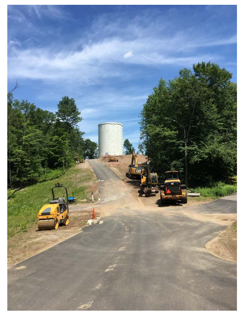
Picture 10: Facing east. View of water tank after first coat of coating. Soil on road is from overnight wash out of new catch basin.

Contractor: Ludlow Construction Page: 12 of 15