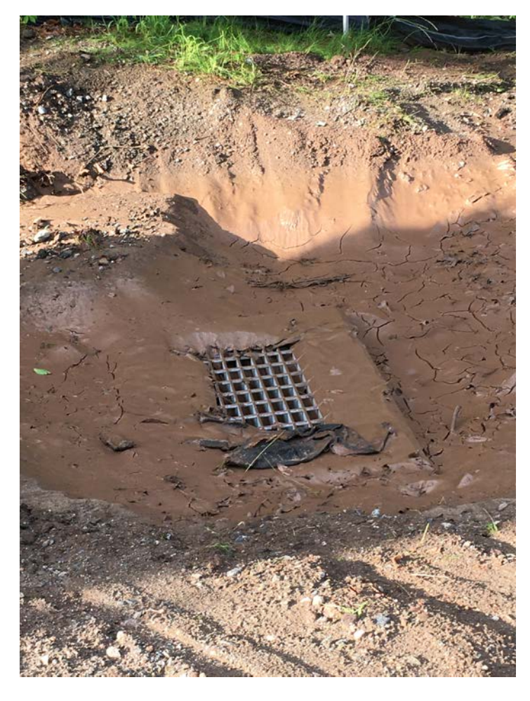
Picture 2: Facing south. View into new catch basin at tank site with silted in and flooded because silt sock plugged.

06/10/21 Res. Representative: W. Abrahams-Dematte Date: