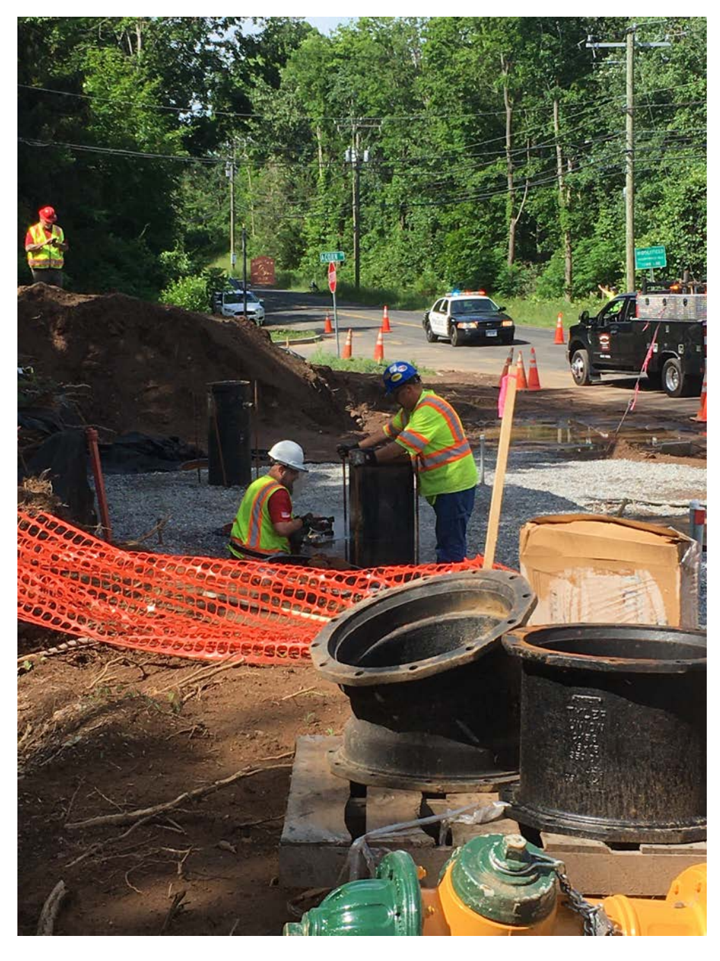
Picture 7: Facing south. United Concrete shortening piping to align with meter house piping.

Contractor: Ludlow Construction Page: 9 of 15