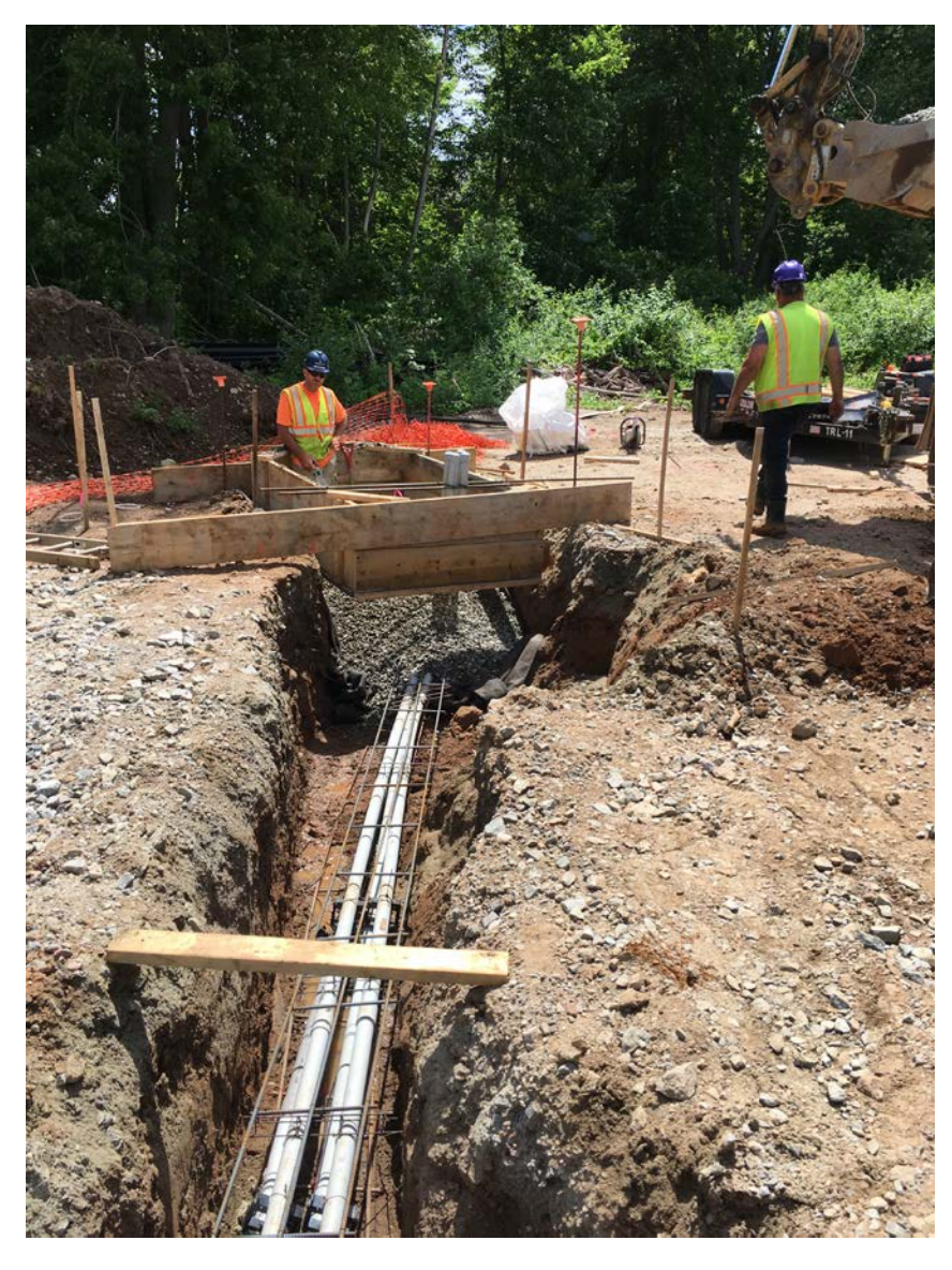
Picture 13: Facing south. Behind booster station this the form for the concrete pad for the generator. The stone base needs to be raised to the bottom of the form prior to concrete pad. Conduit leading to the generator pad in foreground.