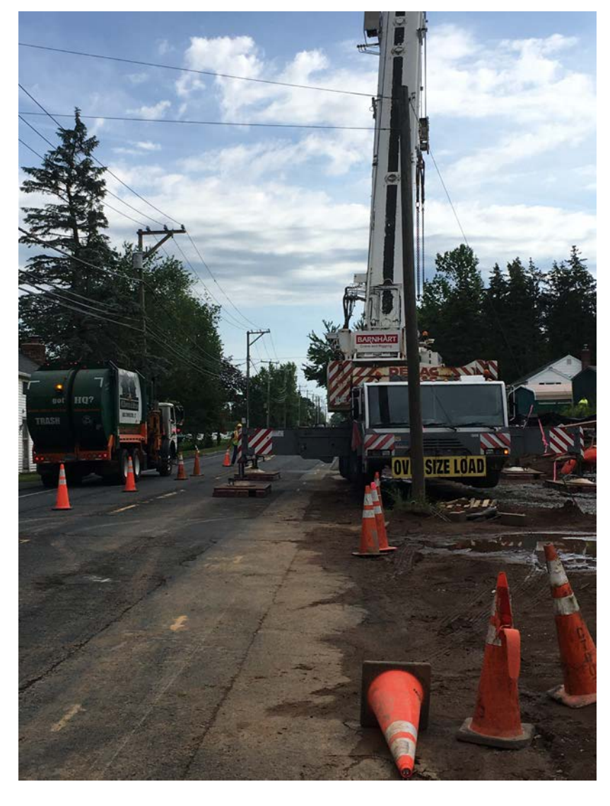
Picture 3: Facing north. Crane with outriggers extended. However back end of crane was slightly over center line hence cone placement. Traffic was able to safely pass.

Contractor: Ludlow Construction Page: 5 of 15