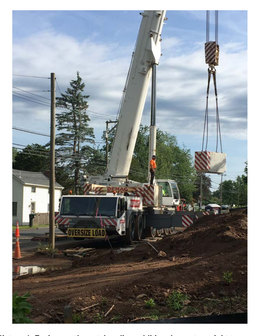
Picture 4: Facing northwest. Loading additional counterweight to crane.