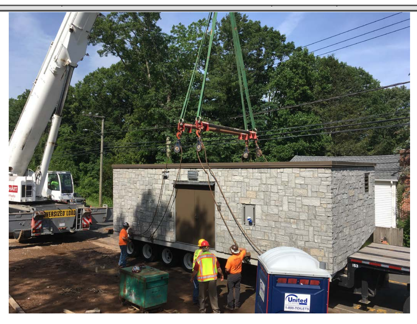
Picture 6: Facing southwest. Setting up rigging. Notice that the spreader bars are too short. Longer bars were brought in so that rigging did not damage top of meter building.

Contractor: Ludlow Construction Page: 8 of 15