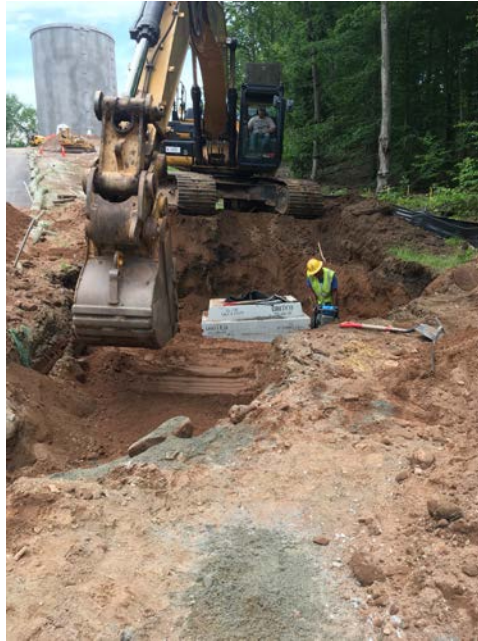
Picture 7: New catch basin install. Connects to catch basin on north side of access driveway.