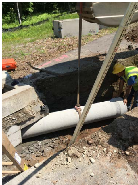
Picture 6: Ludlow installing first piece 12” drain pipe into receiving catch basin.