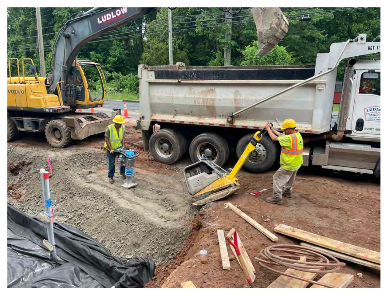
Picture 6: Ludlow compacting gravel over the 16" DIP pipe they installed on the north side of the water meter vault footprint located at ~Station 124+80. View to the southwest.

Contractor: Ludlow Construction Page: 8 of 10