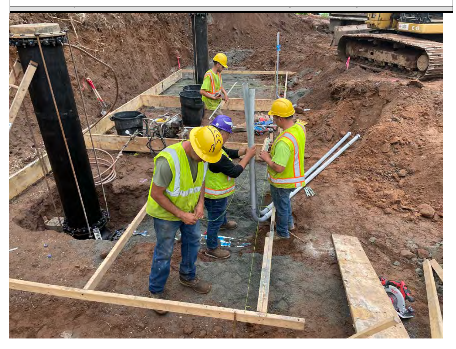
Picture 5: Ludlow installing additional PVC conduits on the west side of the water meter vault footprint. View to the south.

Contractor: Ludlow Construction Page: 7 of 10