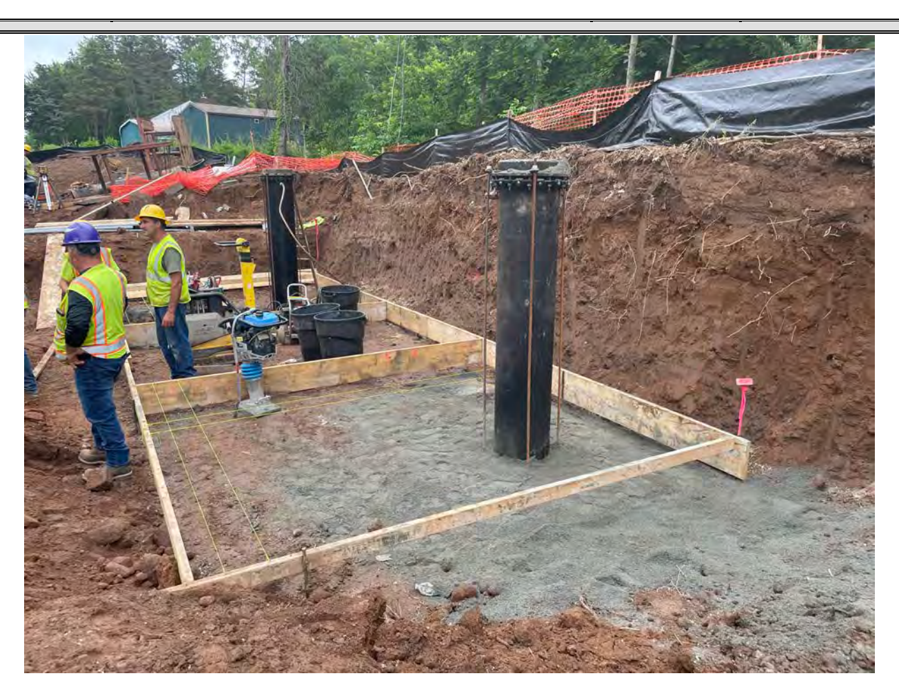
Picture 2: View of the water meter vault footprint and the pressure test that Ludlow is conducting today. View to the north.

Contractor: Ludlow Construction Page: 4 of 10