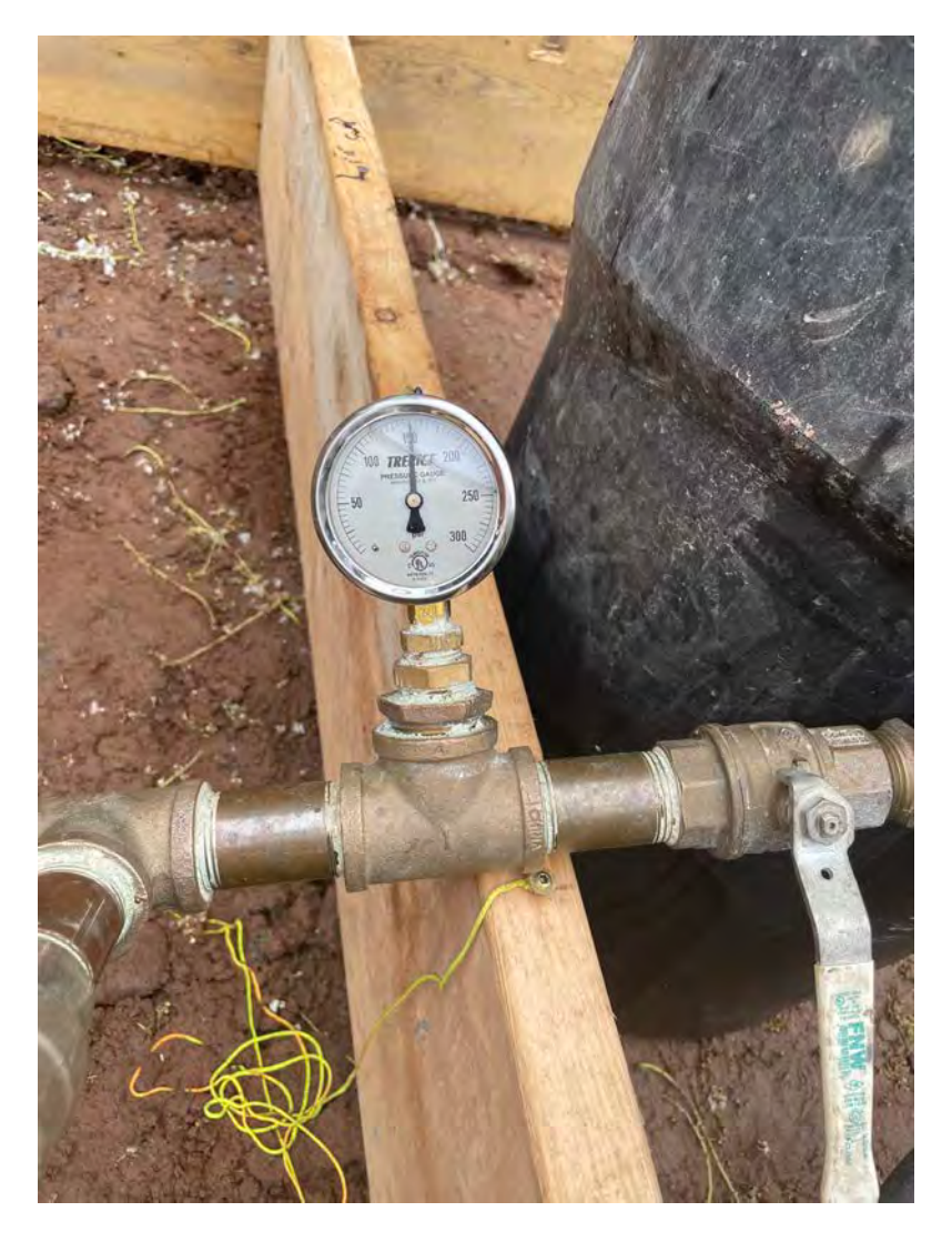
Picture 3: Starting pressure of 150 PSI on the pressure test that Ludlow is performing today at the water meter vault.