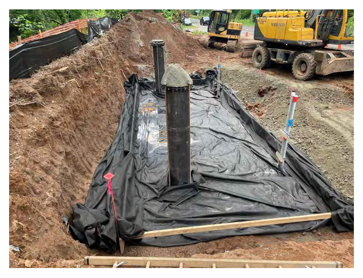
Picture 7: View of the water meter vault footprint, where Ludlow has lined it with geofabric. View to the south.

06/04/21 Res. Representative: J. Meunier Date: