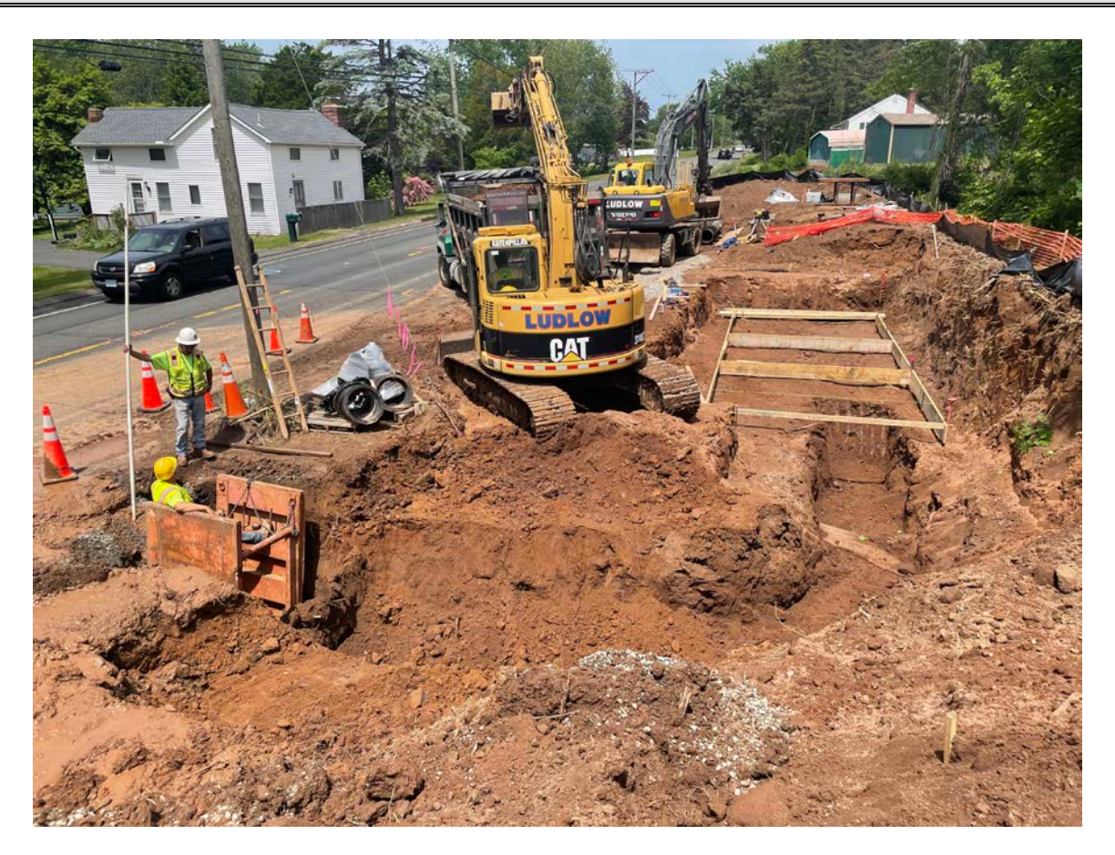
Picture 7: Overview of excavation activities at Station 125+20, and the water meter vault work zone. View to the northwest.