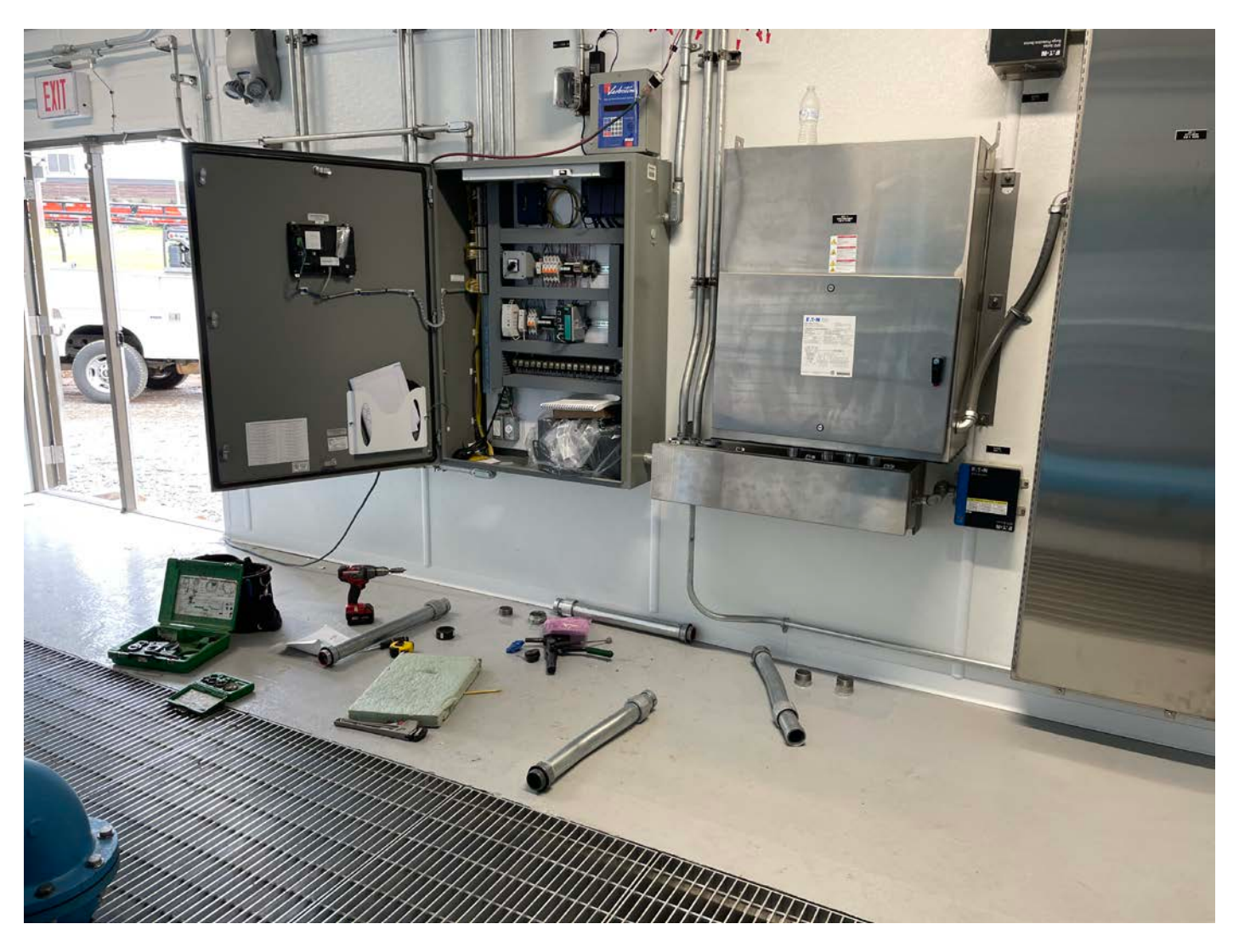
Picture 3: United Concrete installing conduits on the underside of the PLC pump cabinet located inside of the booster station at Station 750+63. View to the northwest.

Contractor: Ludlow Construction Page: 5 of 11