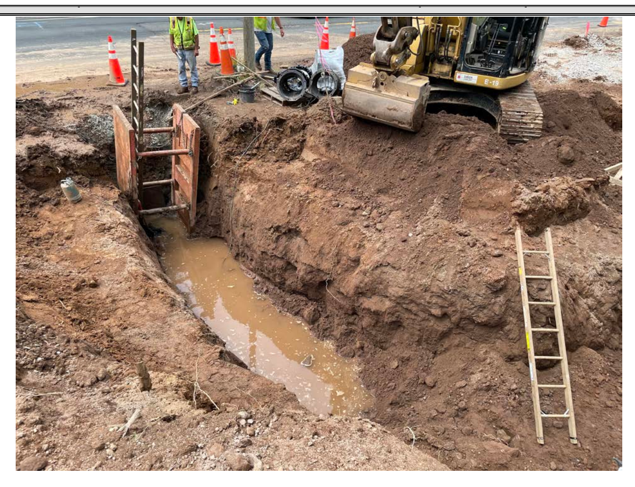
Picture 8: Water in the excavation located at the water meter vault work zone that came from beneath the 16" DIP that crosses S. Main Street at Station 125+20. View to the west.