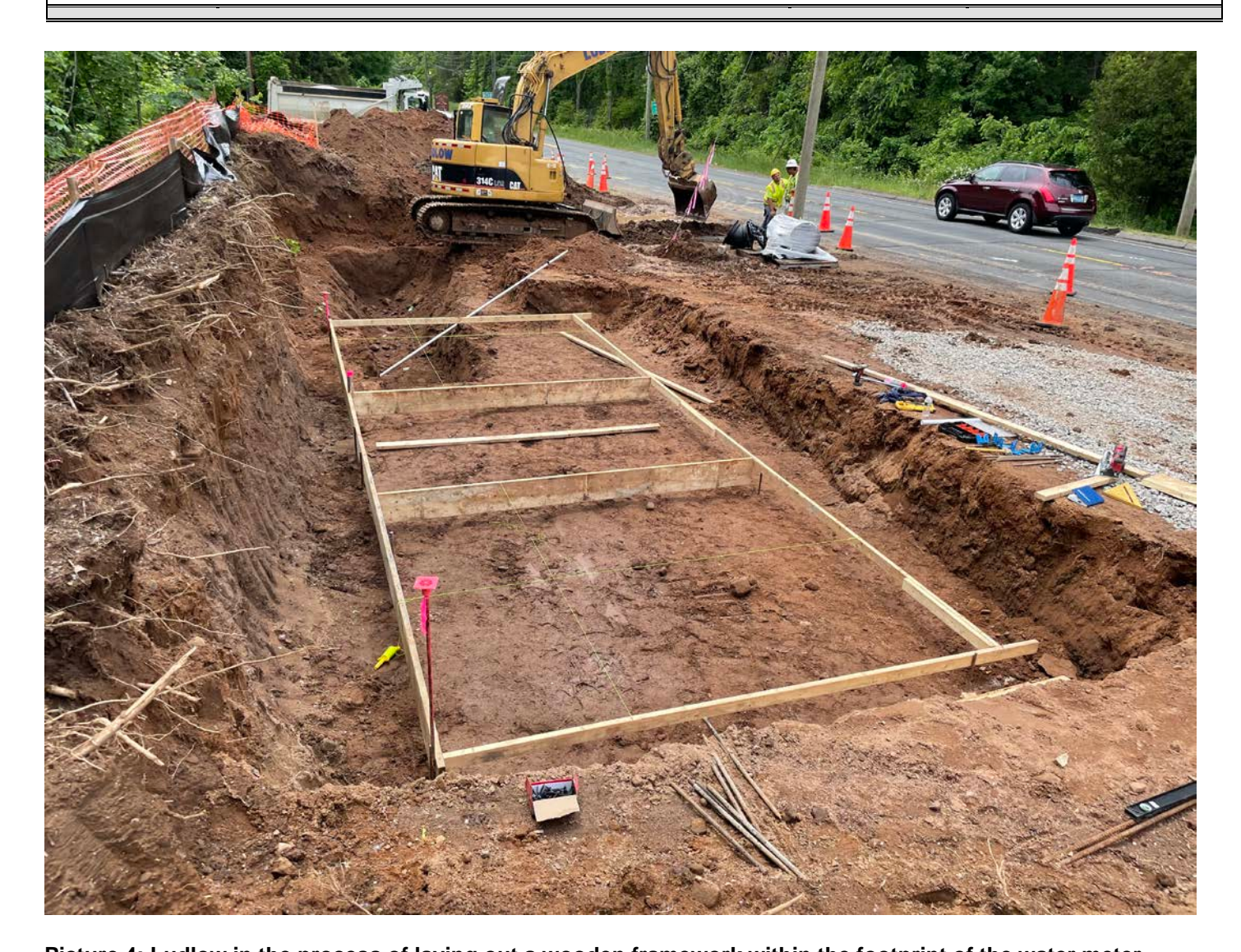
Picture 4: Ludlow in the process of laying out a wooden framework within the footprint of the water meter vault that will assist them in the accurate placement of piping going in and out of the vault. View to the southeast.