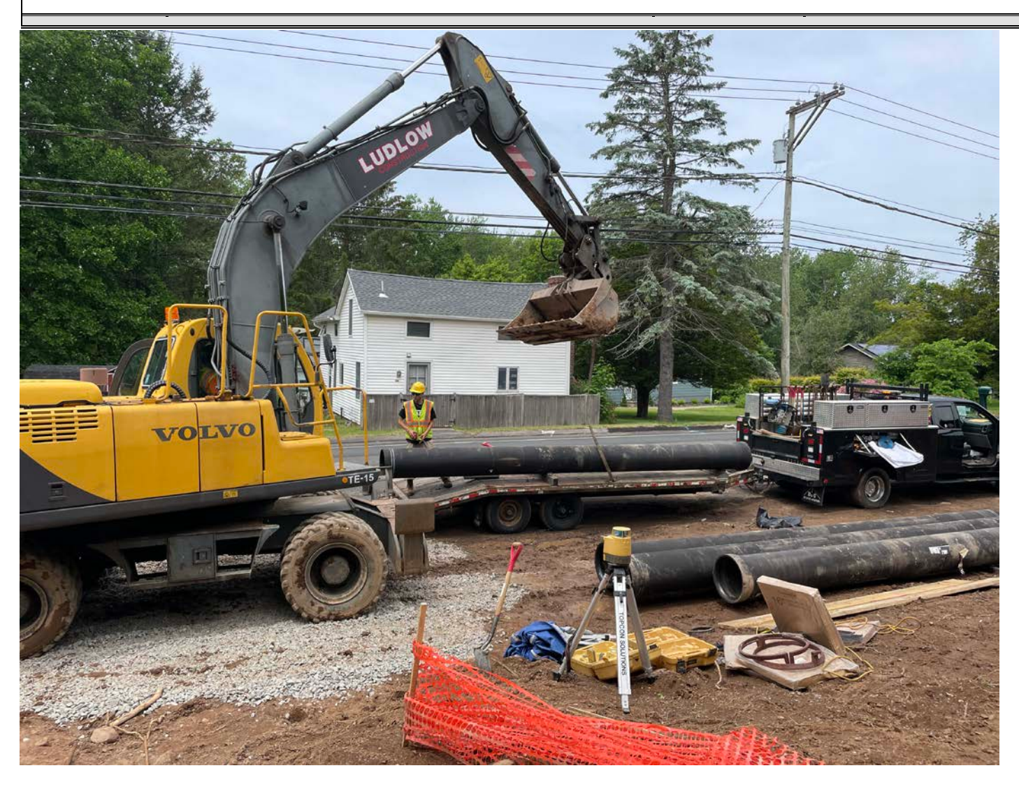
Picture 5: Ludlow offloading 16" DIP at the water meter vault work zone located at ~Station 124+80 on S. Main Street in Middletown. View to the northwest.

Contractor: Ludlow Construction Page: 7 of 11