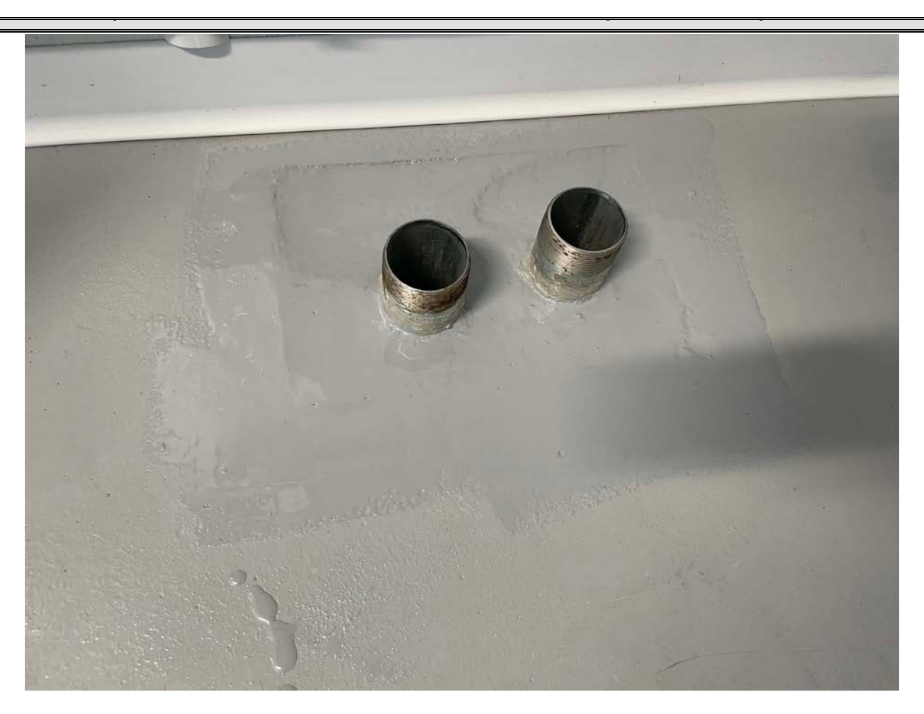
Picture 2: Concrete patch around conduits located on the floor of the booster station that were sealed off with the same epoxy-based paint that the booster station floor was coated with.