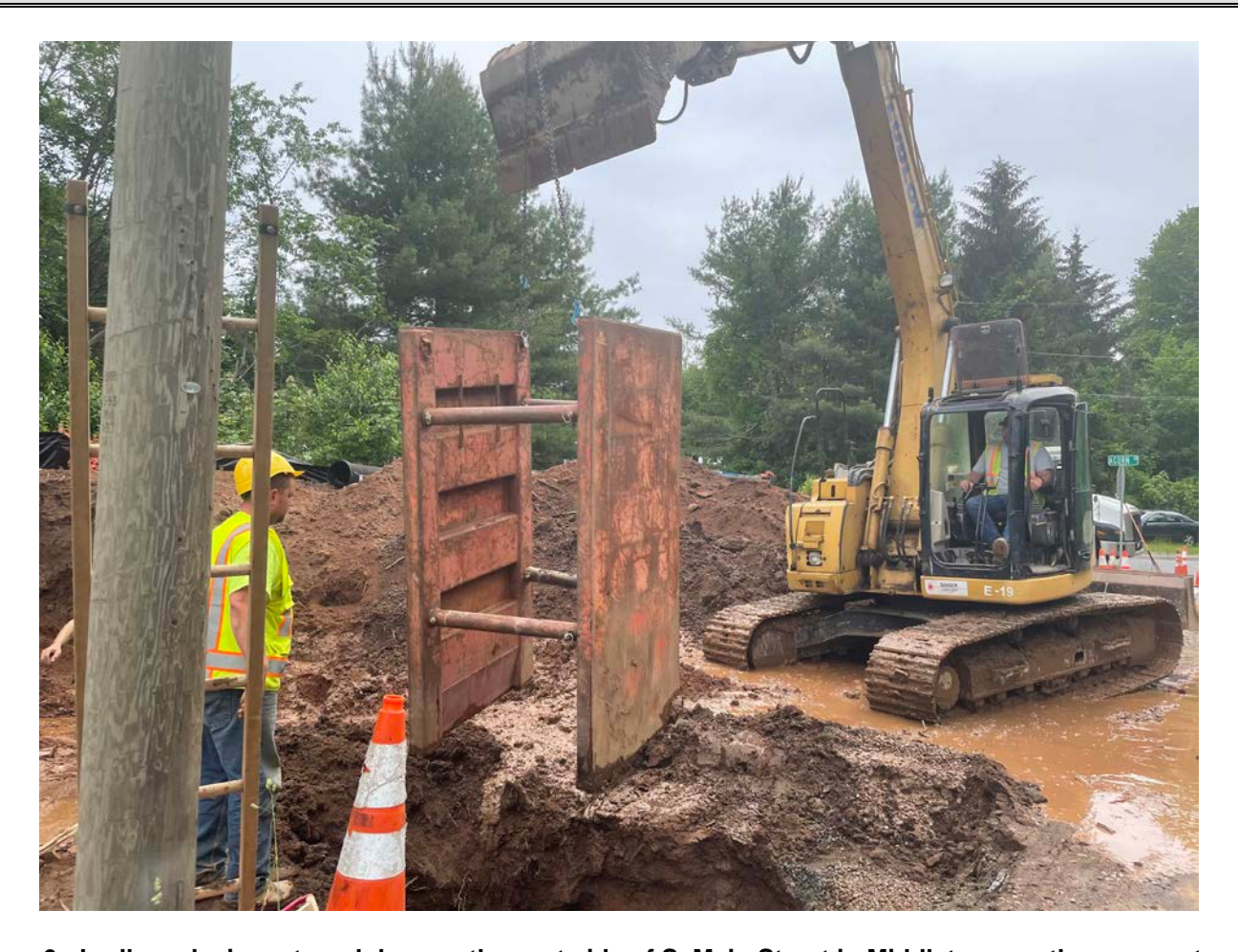
Picture 6: Ludlow placing a trench box on the east side of S. Main Street in Middletown as they excavate at Station 125+20 for the installation of 16" DIP. View to the south.