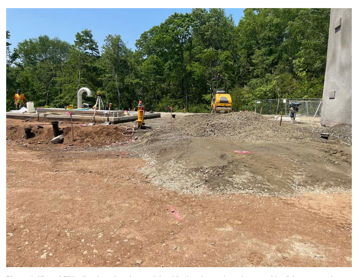
Picture 9: View of fill Ludlow has placed around the altitude valve vault on the west side of the water tank located east of the Shared Access Driveway in Middletown. View to the north.

Contractor: Ludlow Construction Page: 12 of 13