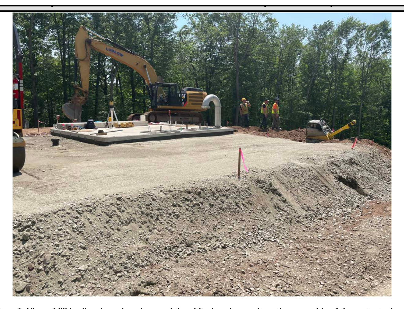
Picture 8: View of fill Ludlow has placed around the altitude valve vault on the west side of the water tank located east of the Shared Access Driveway in Middletown. View to the southwest.