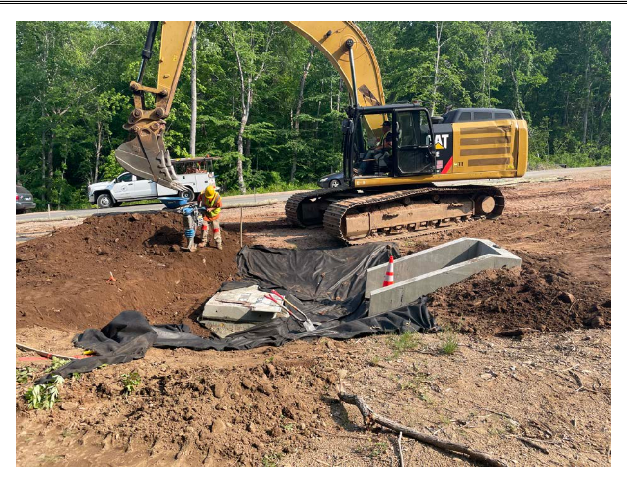
Picture 1: Ludlow compacting fill with a jumping jack on the northwest side of the plunge pool located at ~Station 11+60. View to the north.

Contractor: Ludlow Construction Page: 4 of 13