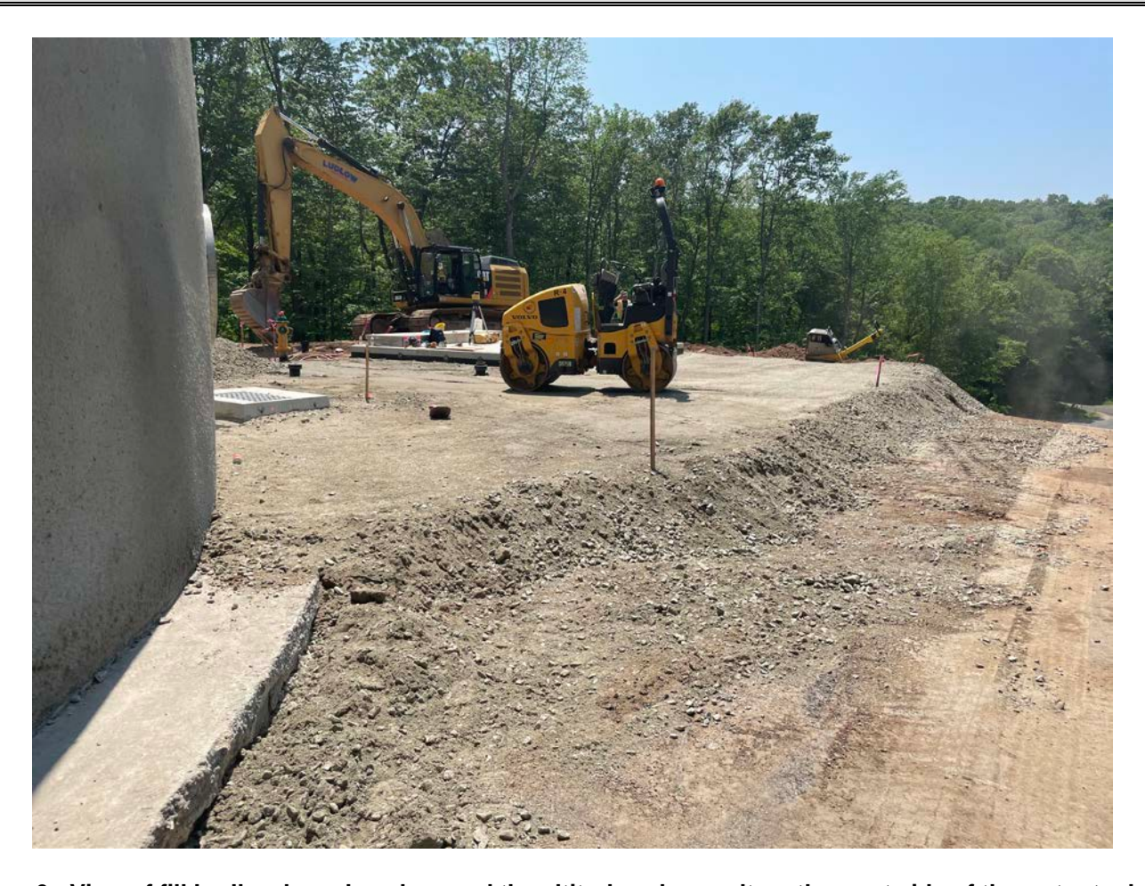
Picture 6: View of fill Ludlow has placed around the altitude valve vault on the west side of the water tank located east of the Shared Access Driveway in Middletown. View to the southwest.

Contractor: Ludlow Construction Page: 9 of 13