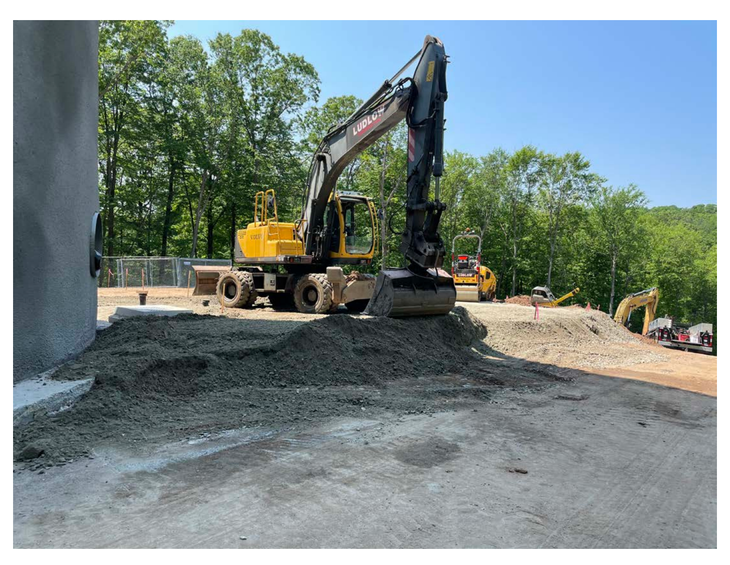
Picture 3: Ludlow placing fill in 1' lifts to raise the grade around the altitude vault on the west side of the water tank located east of the Shared Access Driveway in Middletown. View to the southwest.

Contractor: Ludlow Construction Page: 6 of 13