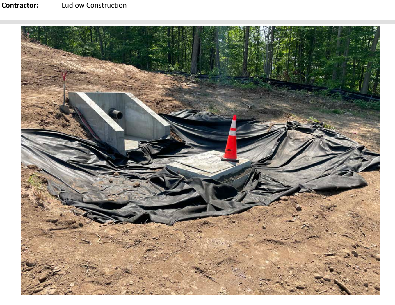
Picture 2: Headwall located at Station 11+50 catch basin under construction. View to the southeast.