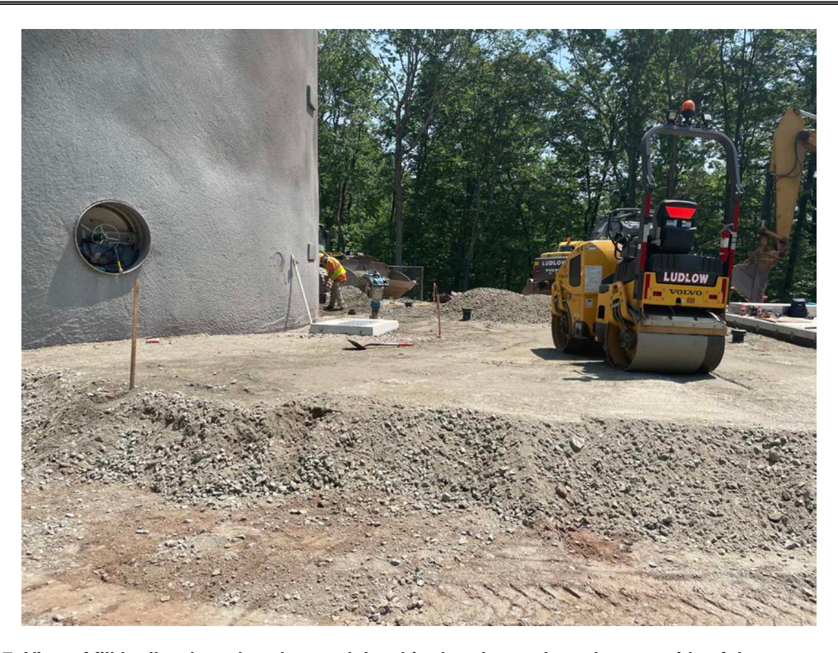
Picture 7: View of fill Ludlow has placed around the altitude valve vault on the west side of the water tank located east of the Shared Access Driveway in Middletown. View to the south.

Contractor: Ludlow Construction Page: 10 of 13