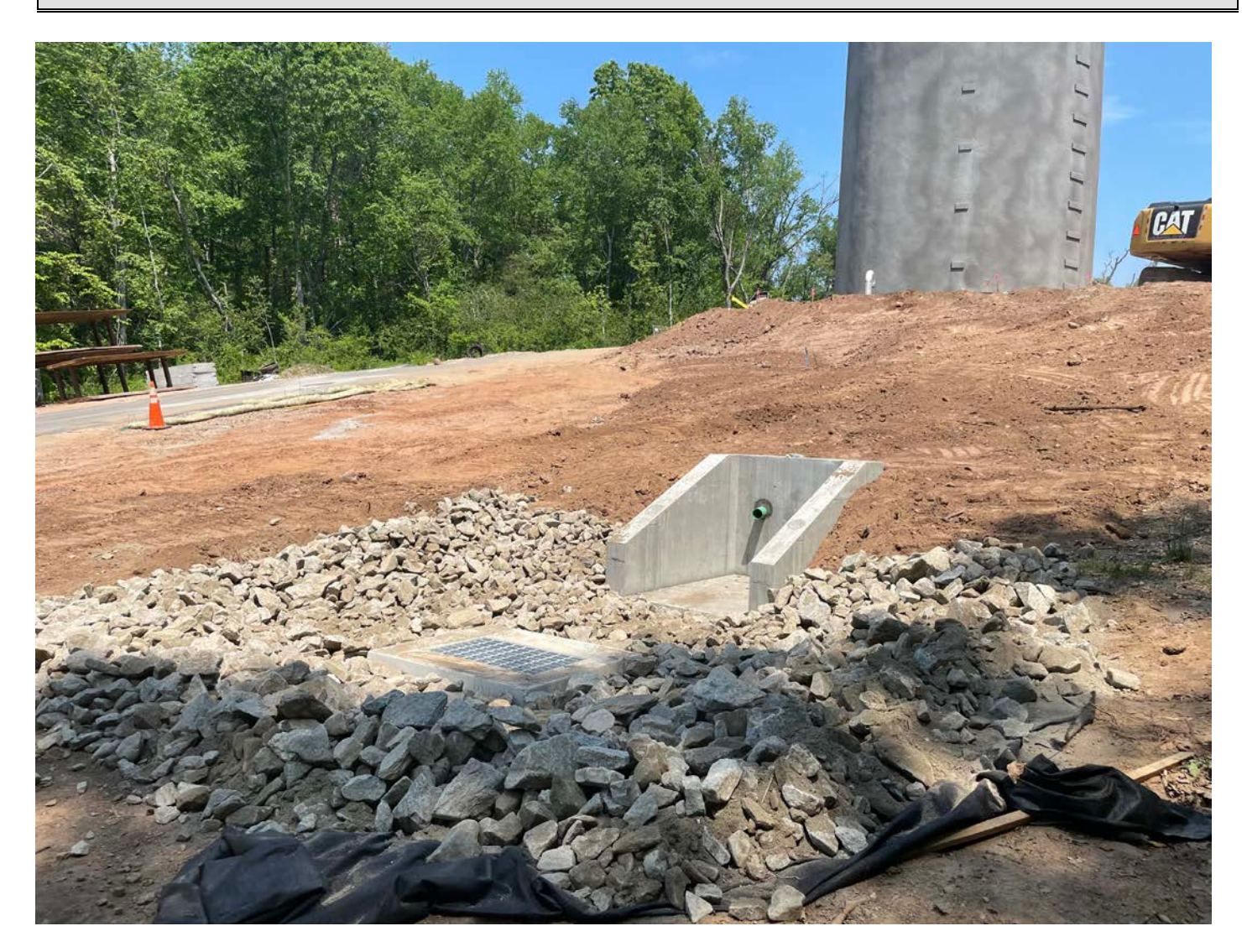
Picture 10: View of the headwall, catch basin, and plunge pool located west of the water tank. View to the northeast.