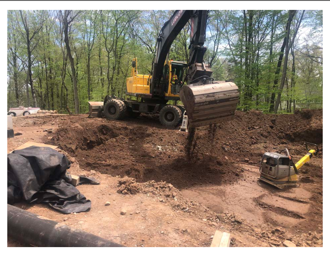
Picture 6: Ludlow placing native fill over the 8" DIP drain line between the southwest side of the water tank and the headwall located at Station 11+70. Water tank work zone located east of the Shared Access Driveway in Middletown. View to the south.

Contractor: Ludlow Construction Page: 8 of 9