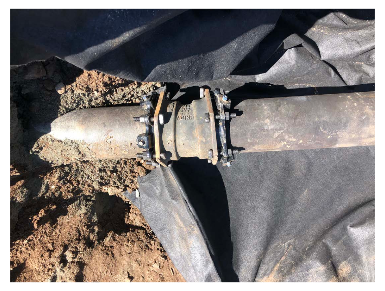
Picture 3: 11.25° DIP bend placed in line with the 8" DIP drain line that Ludlow is installing between the water tank and the headwall located at ~Station 11+70 in Middletown. View to the east.