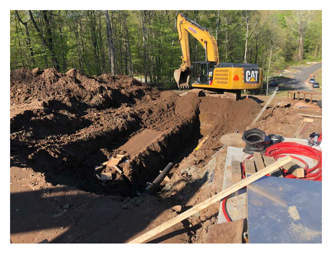
Picture 1: Ludlow in the process of installing 8" DIP for the tank drain between the southwest side of the water tank and the headwall located at ~Station 11+70 in Middletown. View to the west.