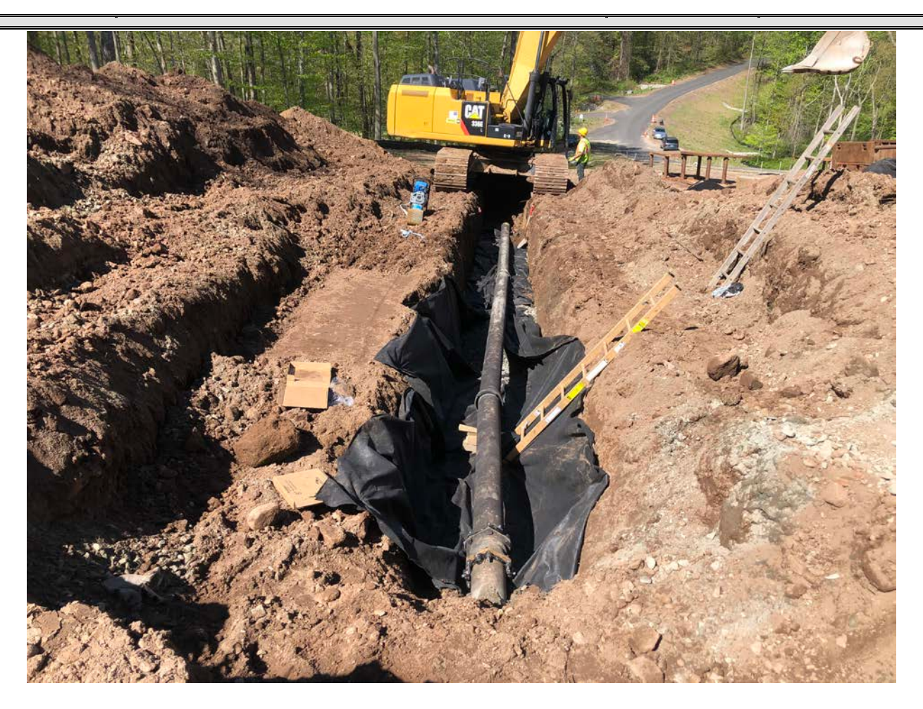
Picture 2: Geofabric placed over <sup>3</sup>/<sub>4</sub>" gravel and another layer of geofabric beneath the 8" DIP that is being installed for the drain between the southwest side of the water tank and the headwall located at ~Station 11+70 in Middletown. View to the west.