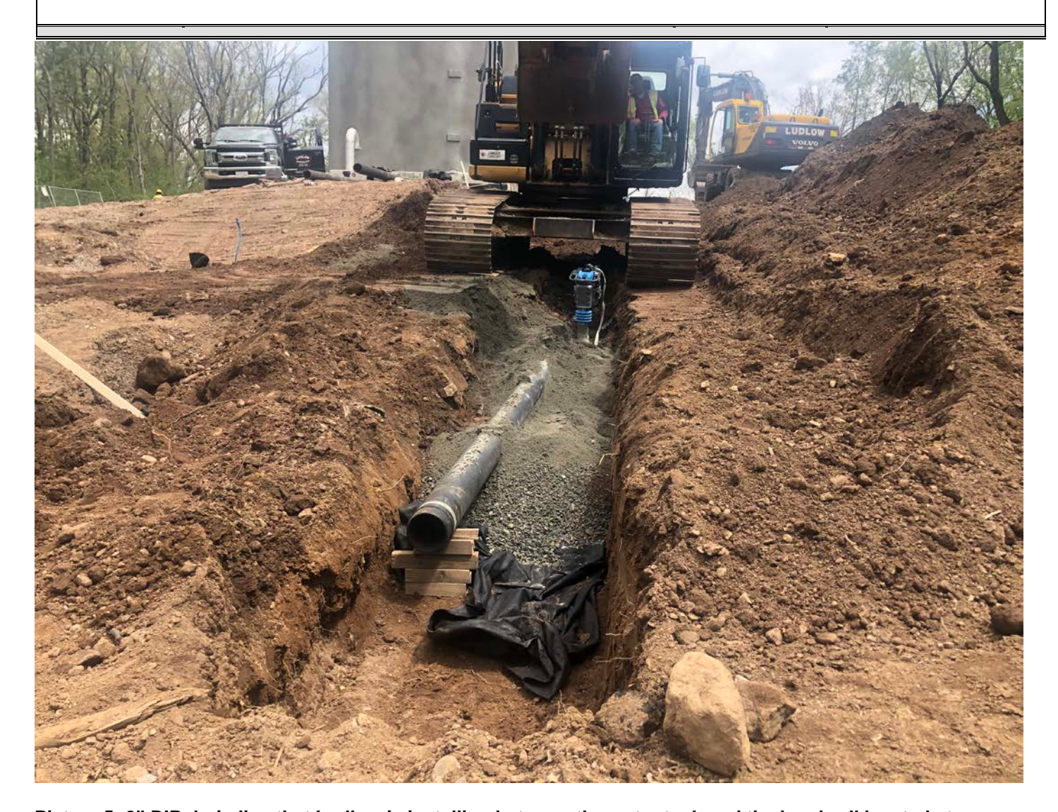
Picture 5: 8" DIP drain line that Ludlow is installing between the water tank and the headwall located at ~Station 11+70 in Middletown. View to the east.