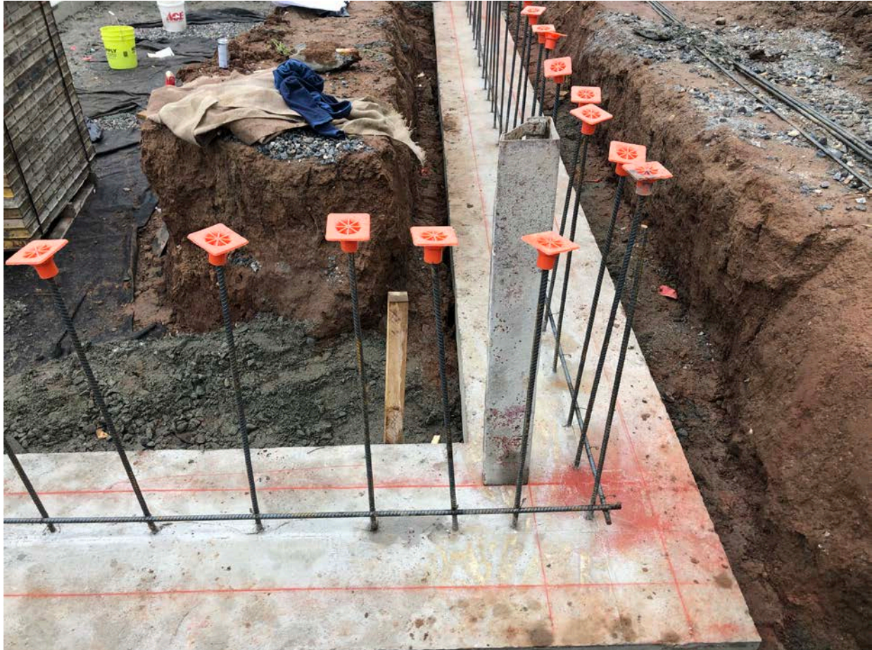
Picture 2: View of the booster station footings with vertical dowels cast in place for the frost wall. Wood forms have just been removed from the sides of the footings. Station 750+63 in Middletown.