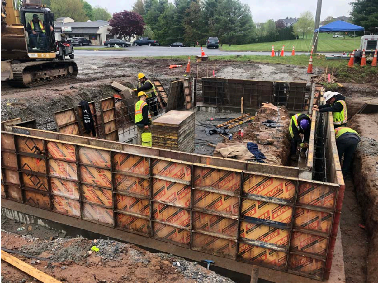
Picture 6: Ludlow in the process of erecting concrete forms at the booster station footprint located at Station 750+63, Middletown. View to the east.