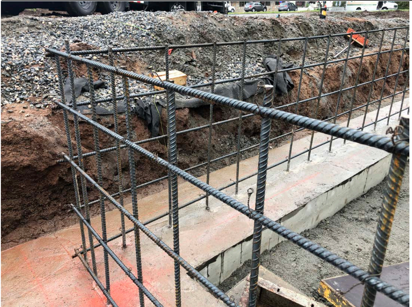
Picture 5: Rebar that has been placed as part of the construction of the frost wall for the booster station located at Station 750+63 in Middletown.