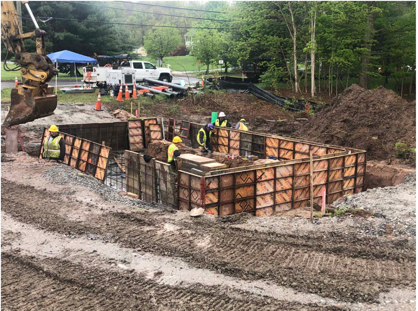
Picture 8: Ludlow in the process of erecting concrete forms at the booster station footprint located at Station 750+63, Middletown. View to the southeast.