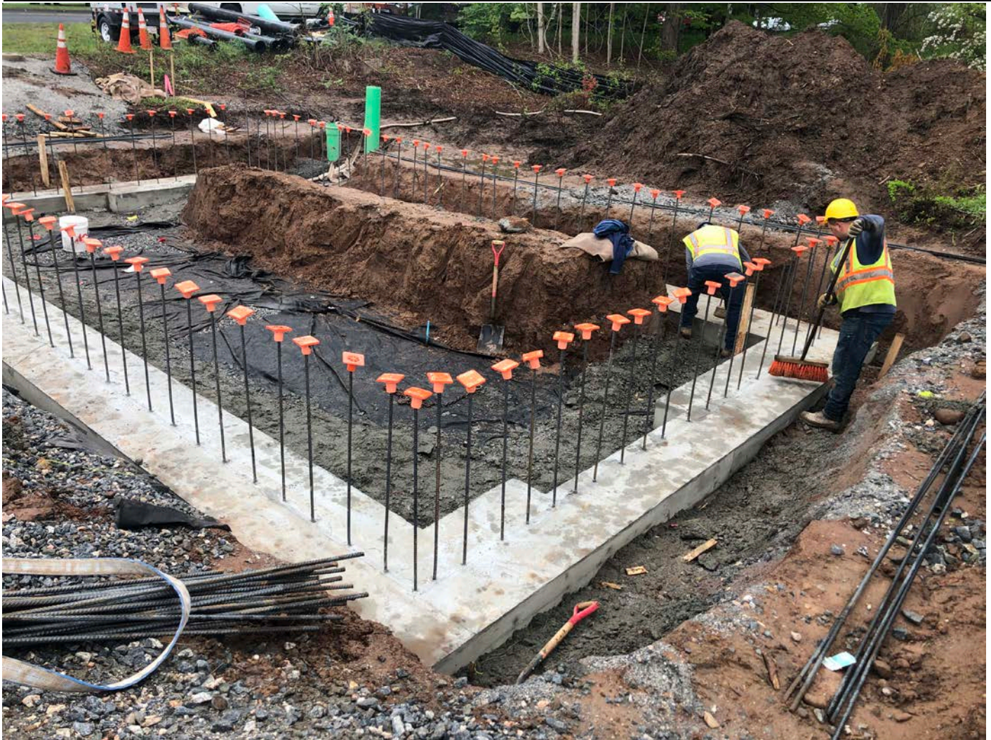
Picture 1: View of the booster station footings with vertical dowels cast in place for the frost wall. Wood forms have just been removed from the sides of the footings. Station 750+63 South Main Street in Middletown. View to the southeast.