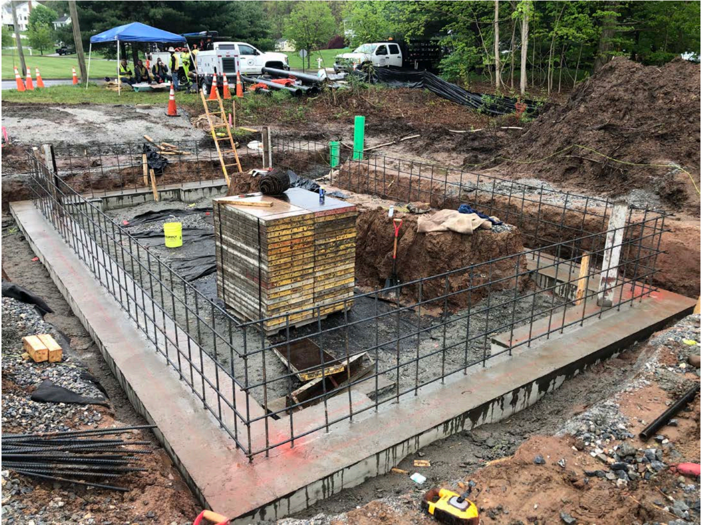
Picture 4: View of the booster station footprint with footings cast in place and the majority of the frost wall rebar installed and secured with wire ties at the booster station located Station 750+63, Middletown. View to the southeast.