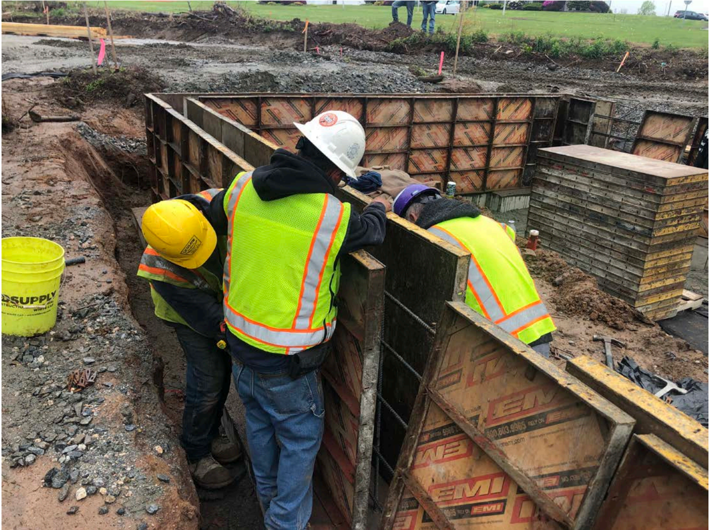
Picture 7: Ludlow in the process of erecting concrete forms at the booster station footprint located at Station 750+63, Middletown. View to the northwest.

Project: Durham Meadows Pipeline Installation Date: May 5, 2021 Location: South Main Street, Middletown Day of Week: Wednesday Project #: AECOM: 6061487 Report No: 236 Contractor: Ludlow Construction Page: 9 of 10