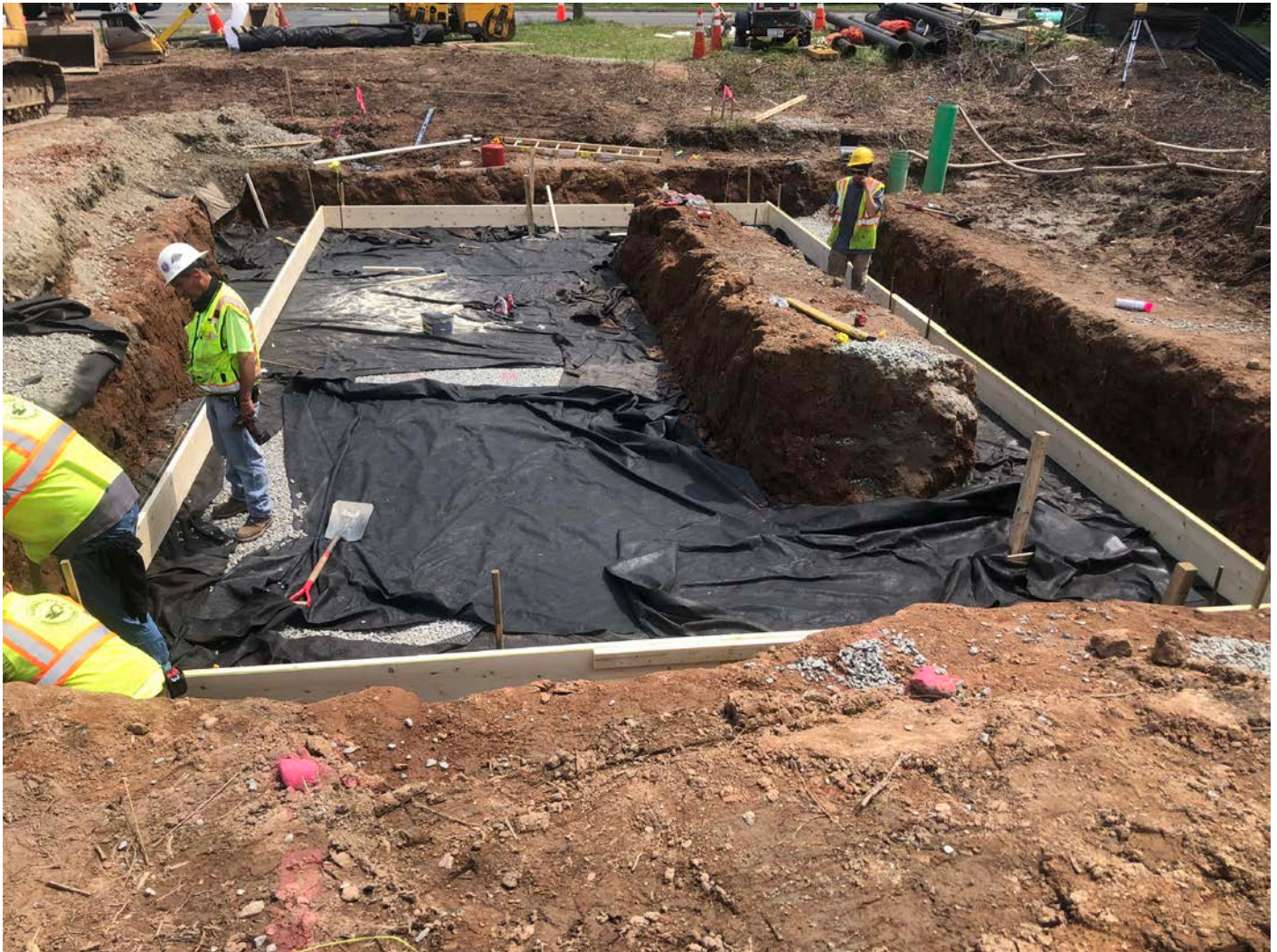
Picture 6: View of the booster station footprint depicting progress of the construction of the forms for the booster station footing. Station 750+63, Middletown. View to the west.