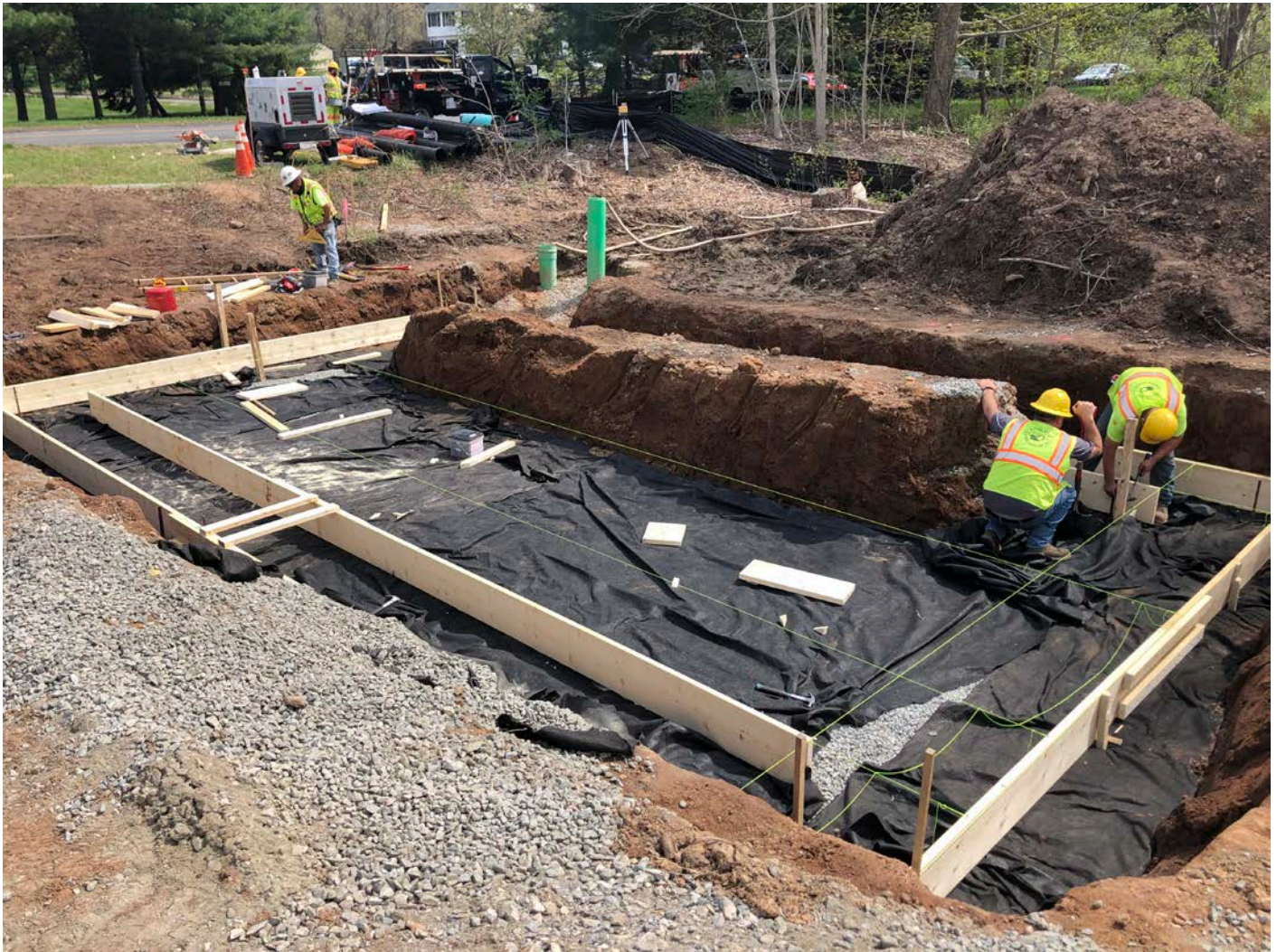
Picture 7: View of the booster station footprint depicting progress of the construction of the forms for the booster station footing. Station 750+63, Middletown. View to the southeast.