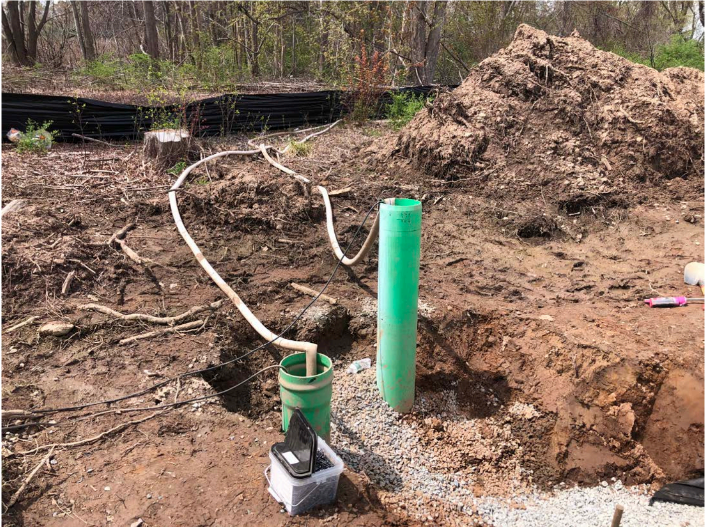
Picture 5: Dewatering wells that Ludlow is using to lower the water table on the southeast corner of the booster station footprint located at 750+63 in Middletown. View to the southwest.