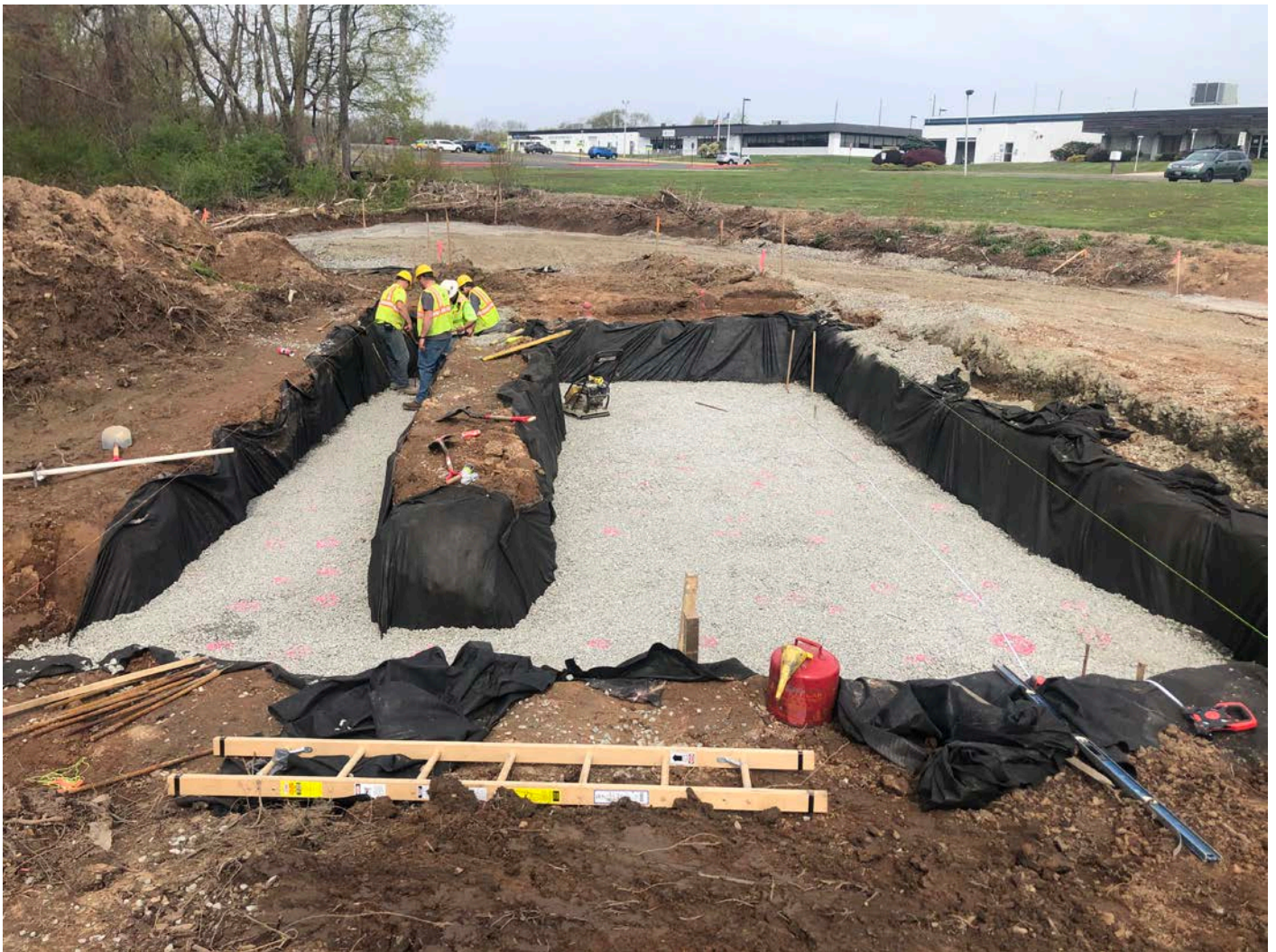
Picture 3: View of the booster station footprint with \frac{3}{4} " gravel and geofabric in place. Station 750+63; view to the west.