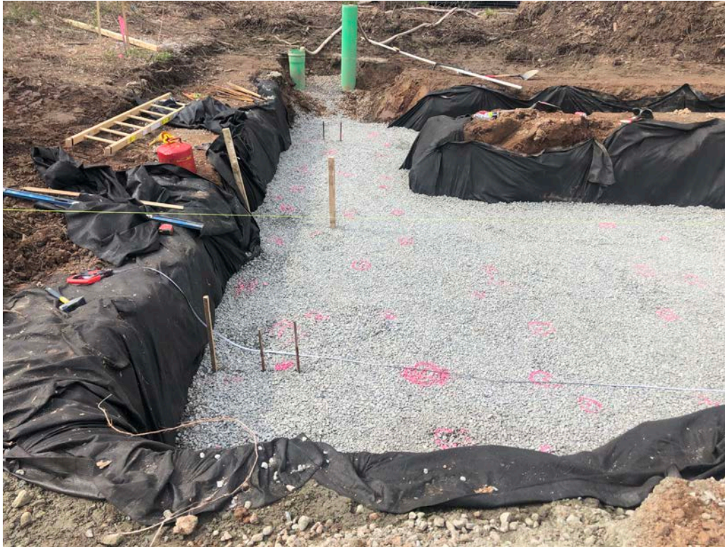
Picture 2: View of the booster station footprint with 3/4" gravel and geofabric in place. Station 750+63; view to the south.