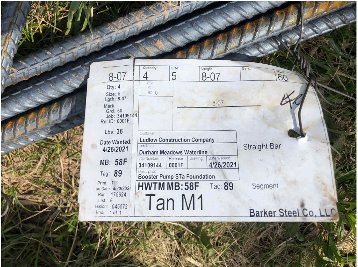
Picture 6: Tag attached to the size 5 rebar that Ludlow will be using in the footings and frost walls they will pour as part of the installation of the booster station located at Station 750+63.