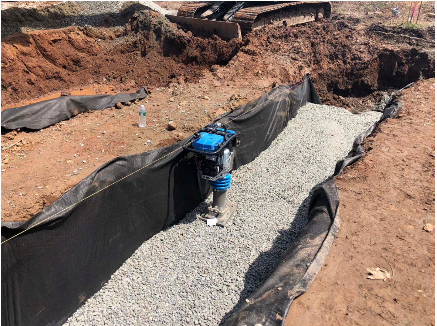
Picture 4: Ludlow has been using a jumping jack to compact the \frac{3}{4} " gravel they are placing on top of geofabric as they prepare the booster station footprint for the installation of footings and frost walls. View to the west/southwest.