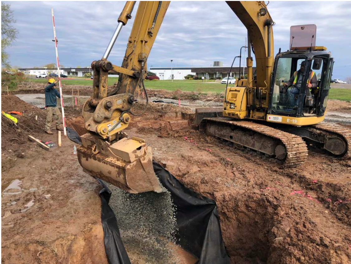
Picture 1: Ludlow placing ¾" gravel on top of geofabric as they prepare the ground for the installation of the footings and frost walls associated with the booster station that will be placed at Station 750+63. View to the northwest.