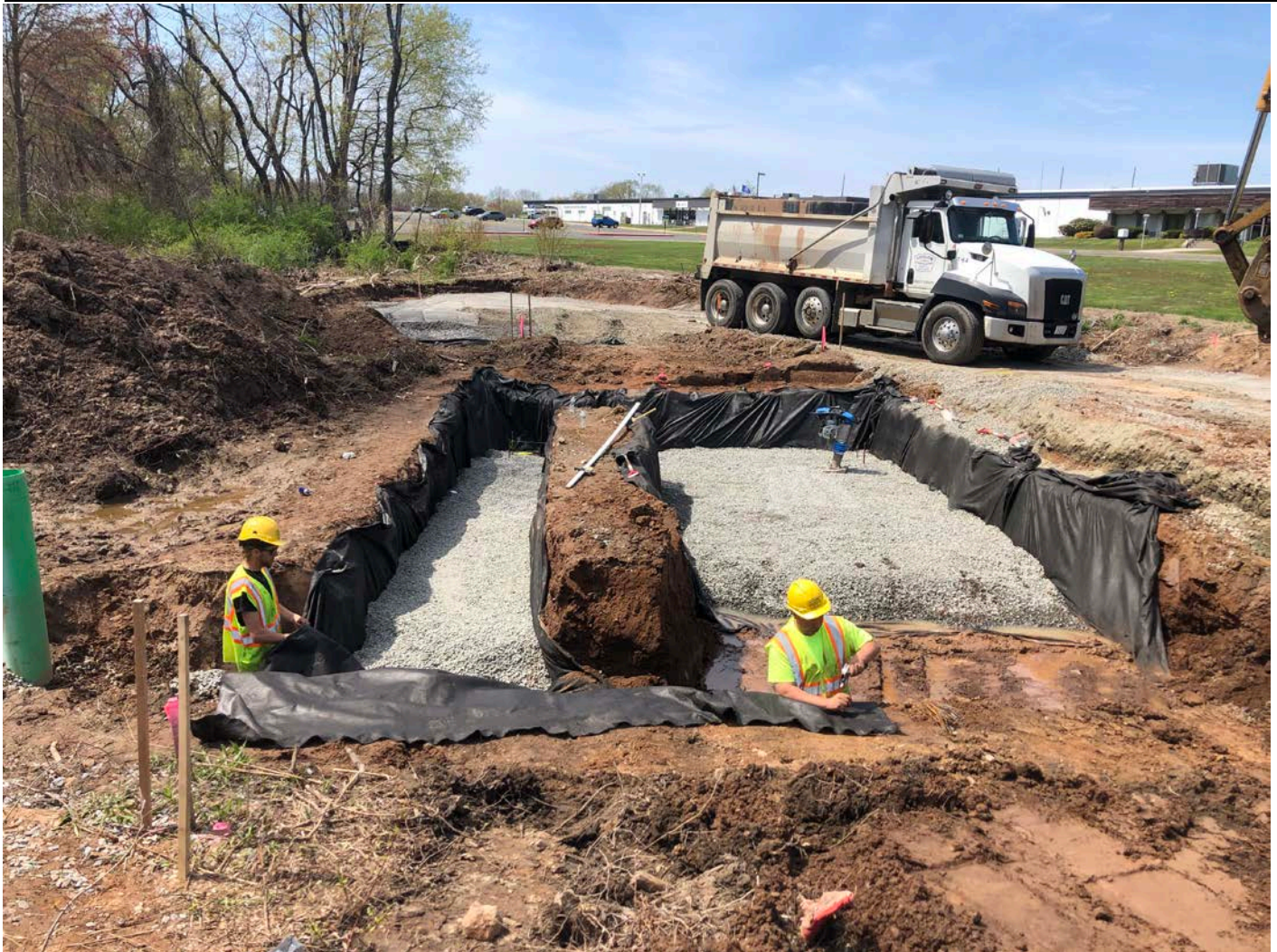
Picture 5: View of the booster station footprint located at Station 750+63 in Middletown as Ludlow continues to place 3/4" gravel and geofabric ahead of the installation of footings and frost walls. View to the west.