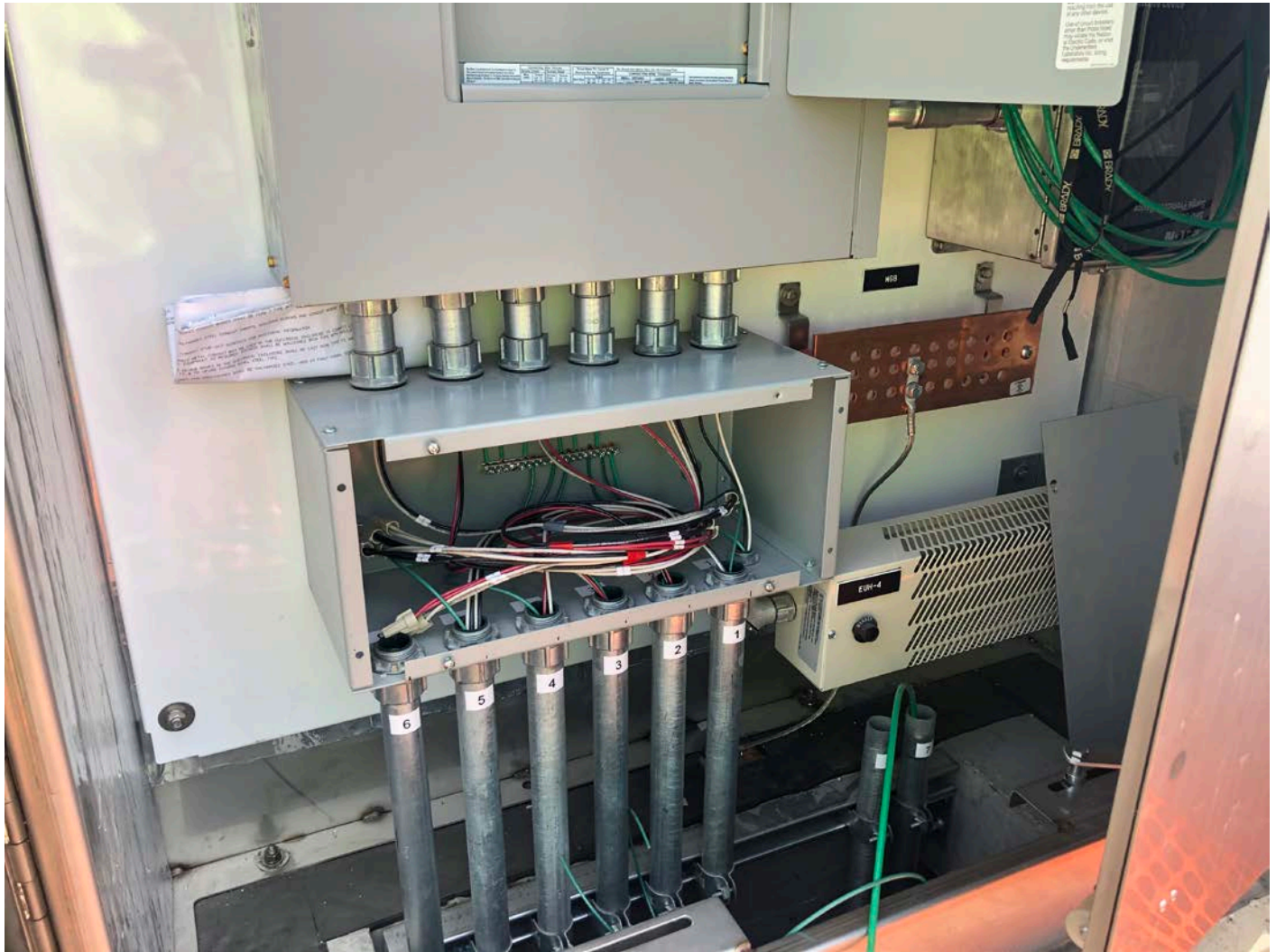
Picture 7: Electrical enclosure and the wiring that United Concrete has performed so far, located adjacent to and north of the pressure reducing valve vault located at ~Station 161+30 in Durham. View to the southeast.