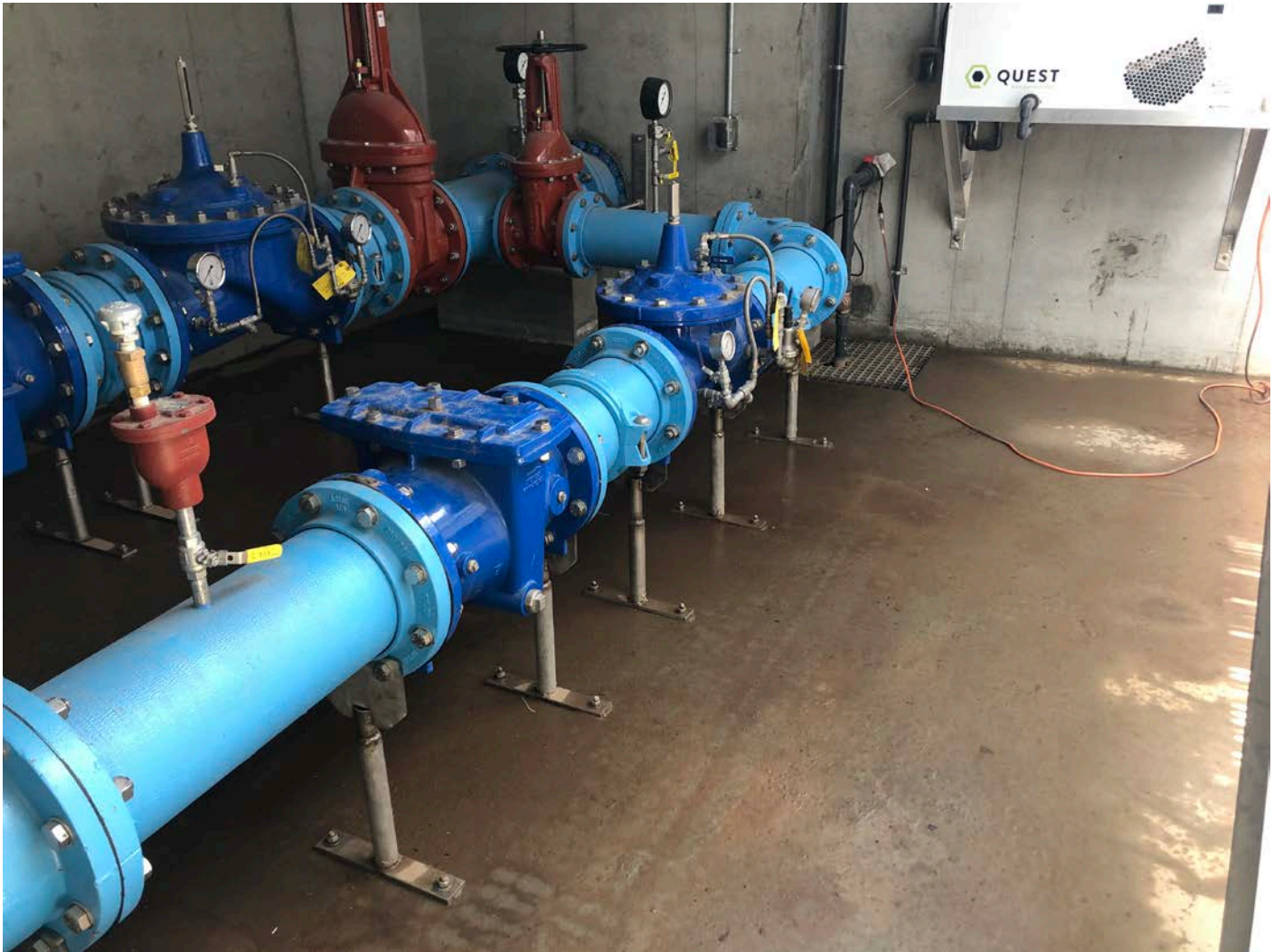
Picture 10: Wet floor observed in the pressure reducing valve vault located at ~Station 161+30 in Durham. View to the northeast. View to the south/southwest.