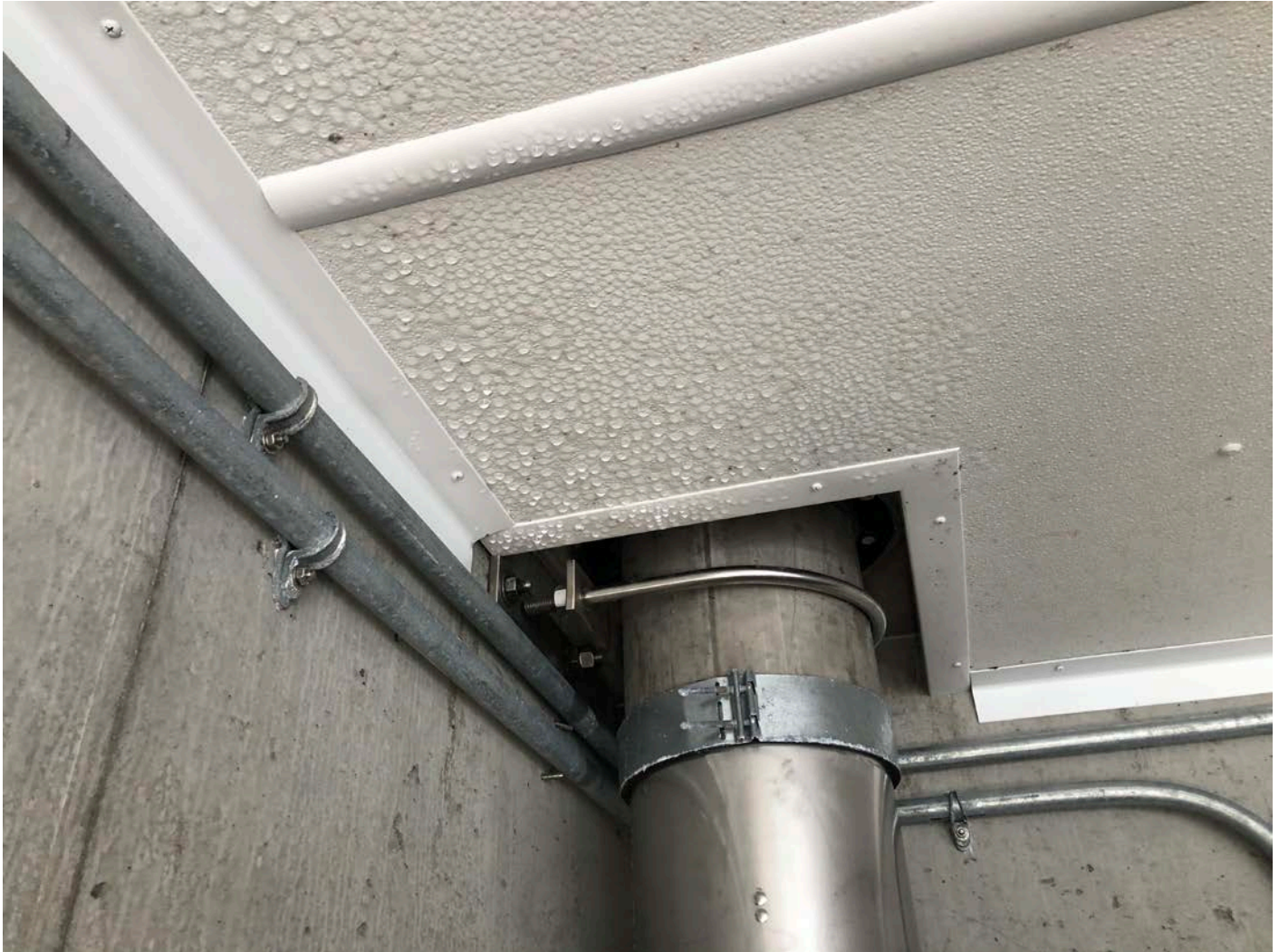
Picture 9: Condensate observed on the northeast corner of the ceiling of the pressure reducing valve vault located at ~Station 161+30 in Durham. View to the northeast.