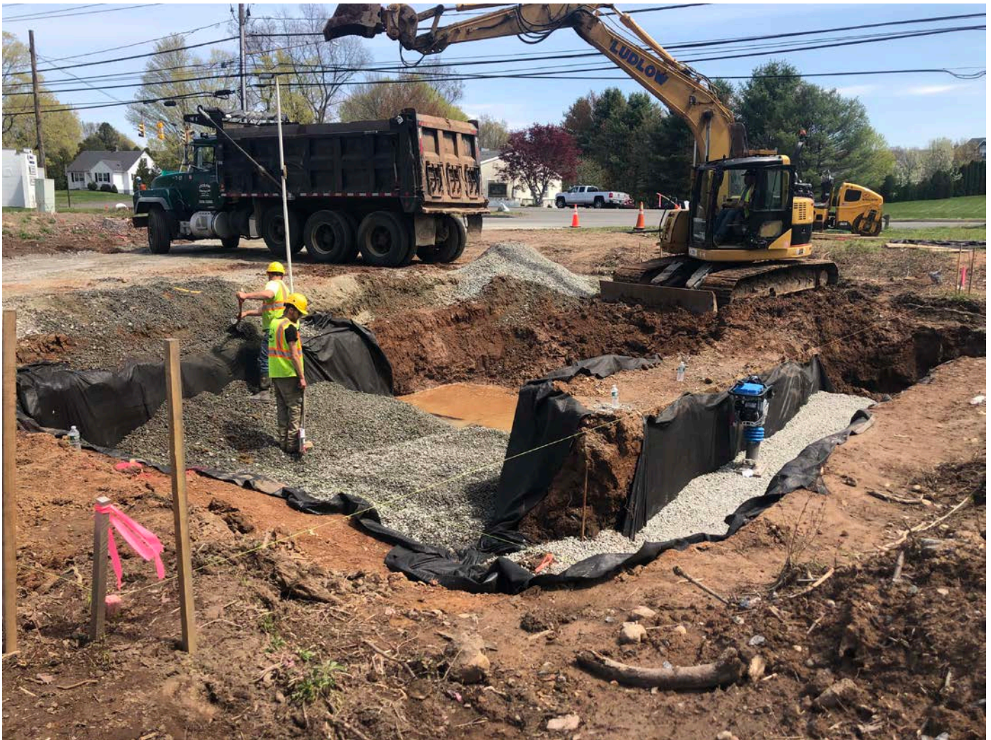
Picture 3: View of the booster station footprint located at Station 750+63 in Middletown. View to the northeast.