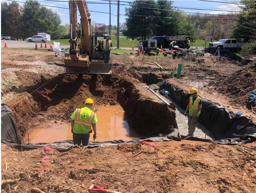
Picture 2: View of the earthwork Ludlow is performing at Station 750+63 as they prepare the ground for the installation of footings and frost walls associated with the booster station that will soon be installed here. View to the west.