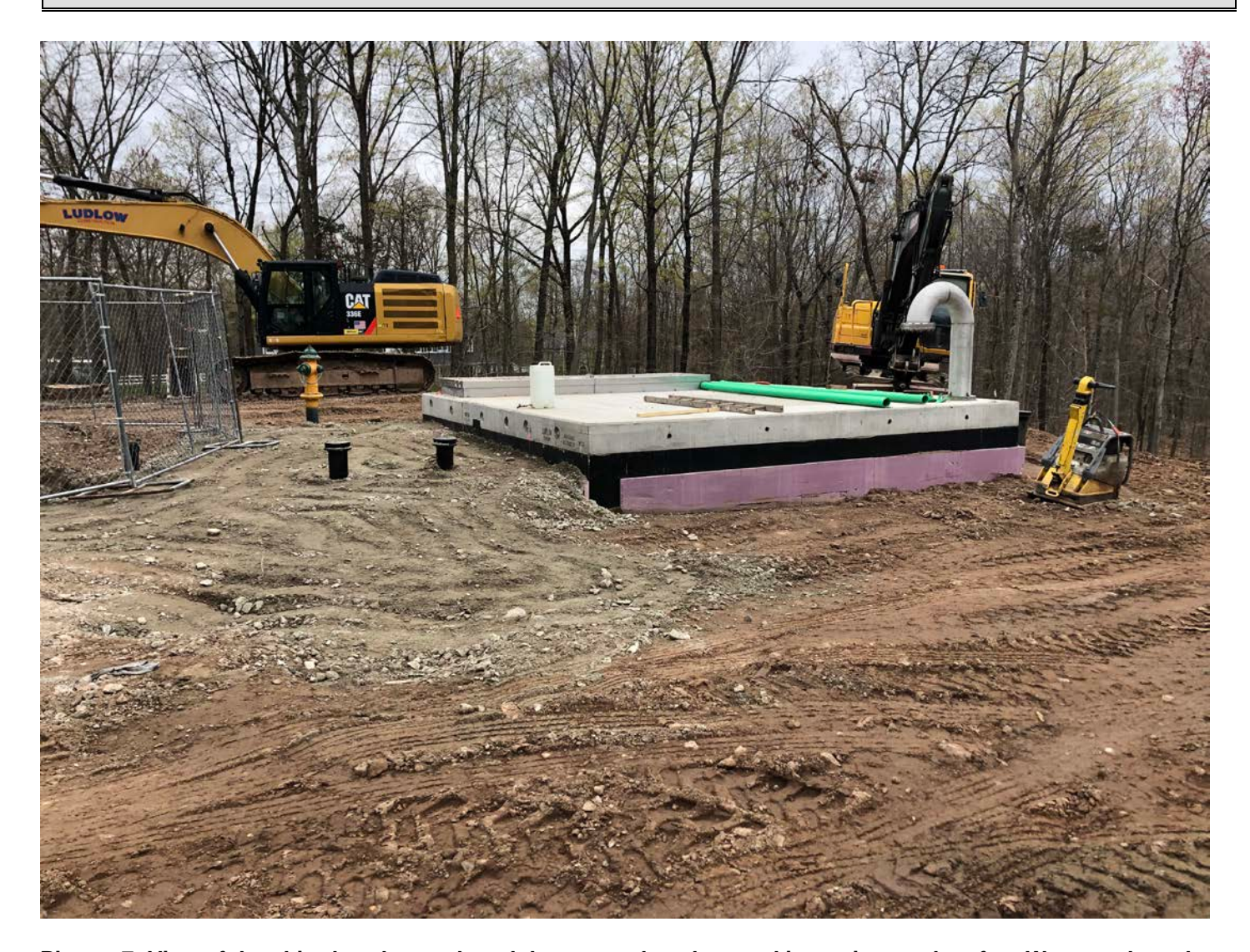
Picture 7: View of the altitude valve vault and the cover placed around its perimeter thus far. Water tank work zone located east of the Shared Access Driveway in Middletown. View to the southwest.