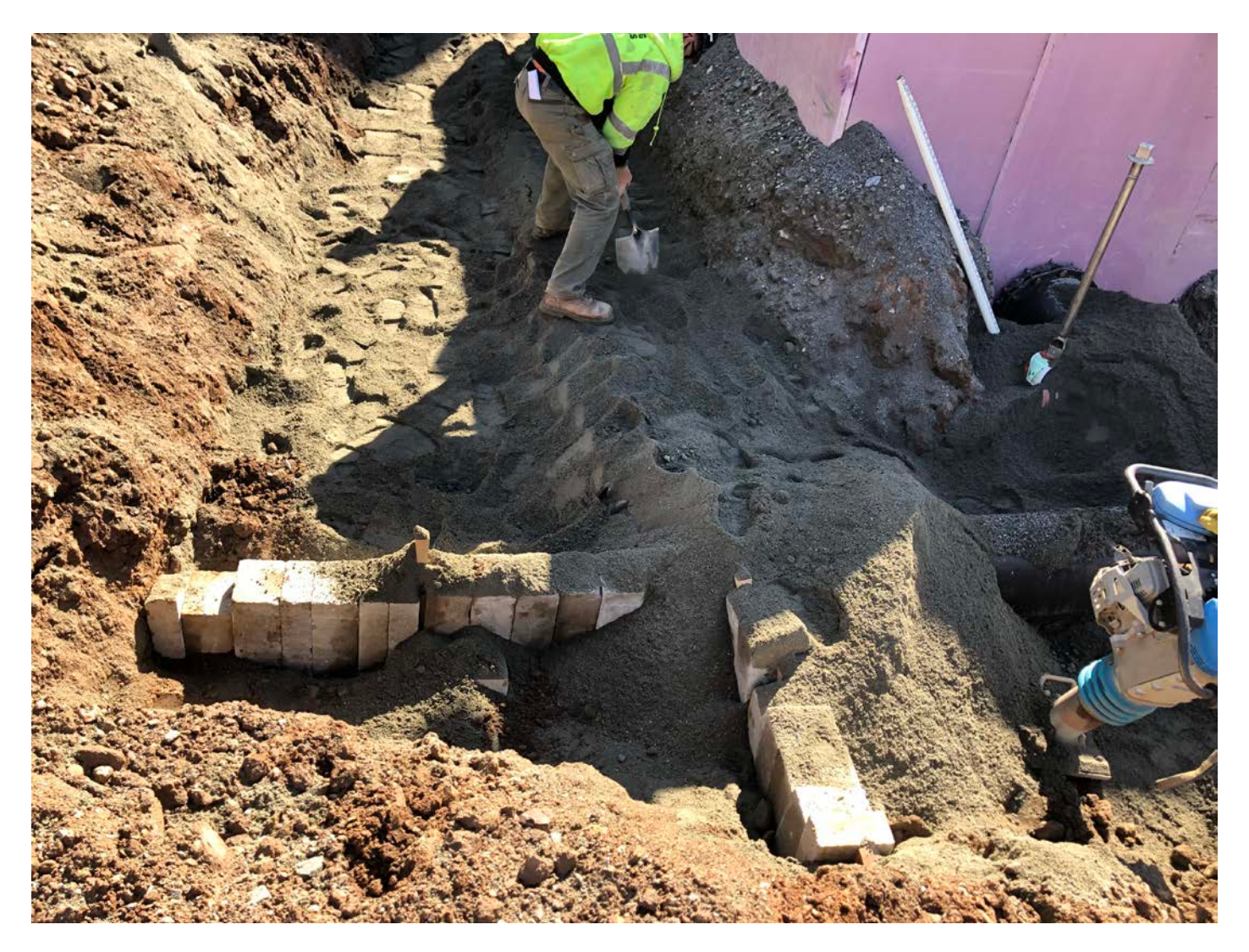
Picture 3: Thrust blocks placed on the 90° corner of the 16" DIP bypass line that is located northwest of the altitude valve vault. Shared Access Driveway in Middletown; View to the east.