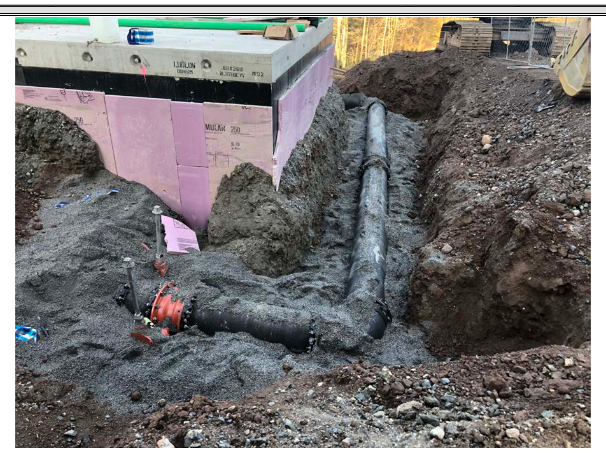
Picture 1: View of the 16" DIP bypass line that Ludlow installed on the north side of the altitude valve vault located east of the Shared Access Driveway in Middletown. View to the west.