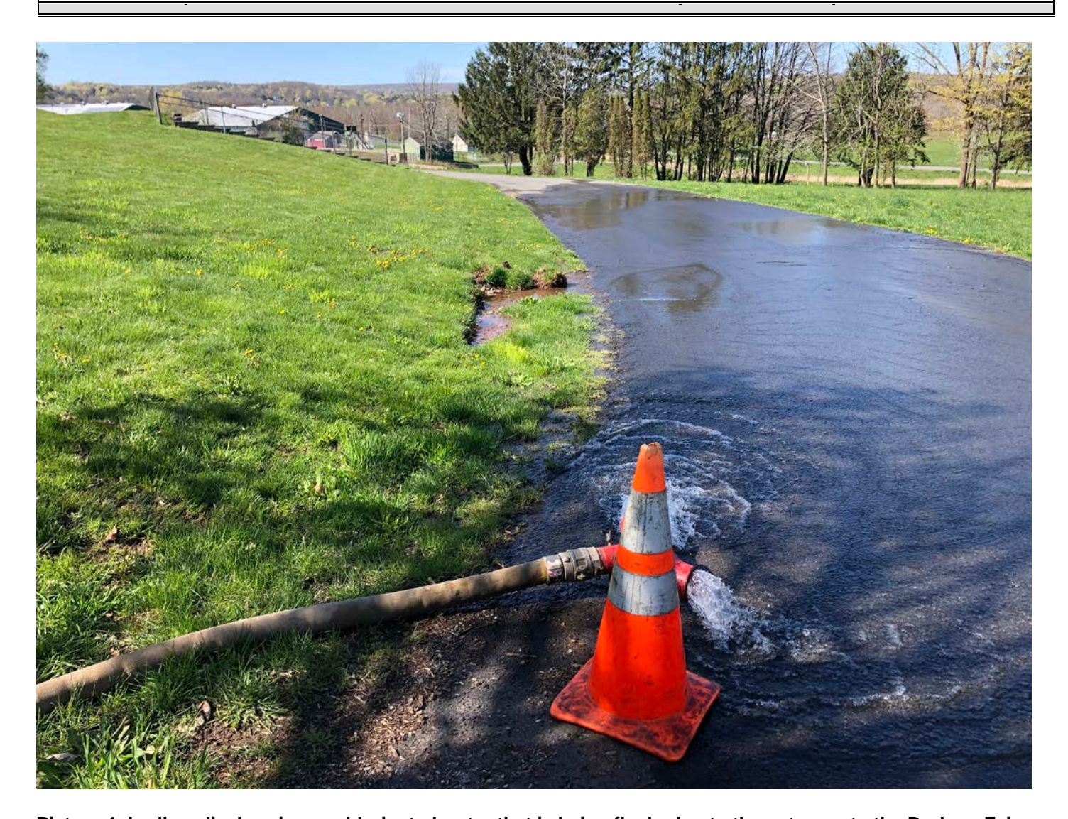
Picture 4: Ludlow discharging unchlorinated water that is being flushed onto the entrance to the Durham Fair grounds from the 12" DIP waterline on Maple Avenue as part of chlorination activities being performed by Ludlow today. View to the south/southwest.