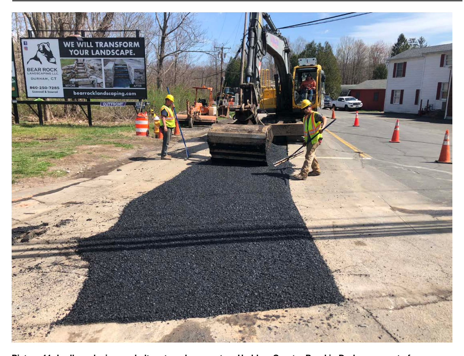
Picture 11: Ludlow placing asphalt on trench overcut on Haddam Quarter Road in Durham as part of permanent paving activities. View to the east.