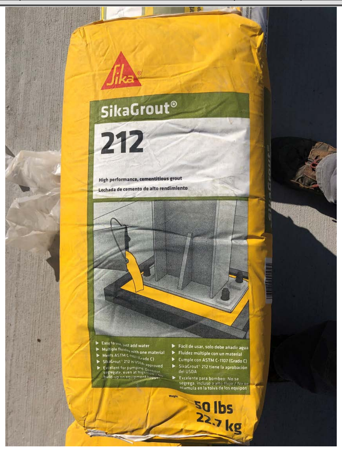
Picture 2: Grout that United Concrete will use on the side walls of the altitude valve vault walls. East of the Shared Access Driveway, Middletown.