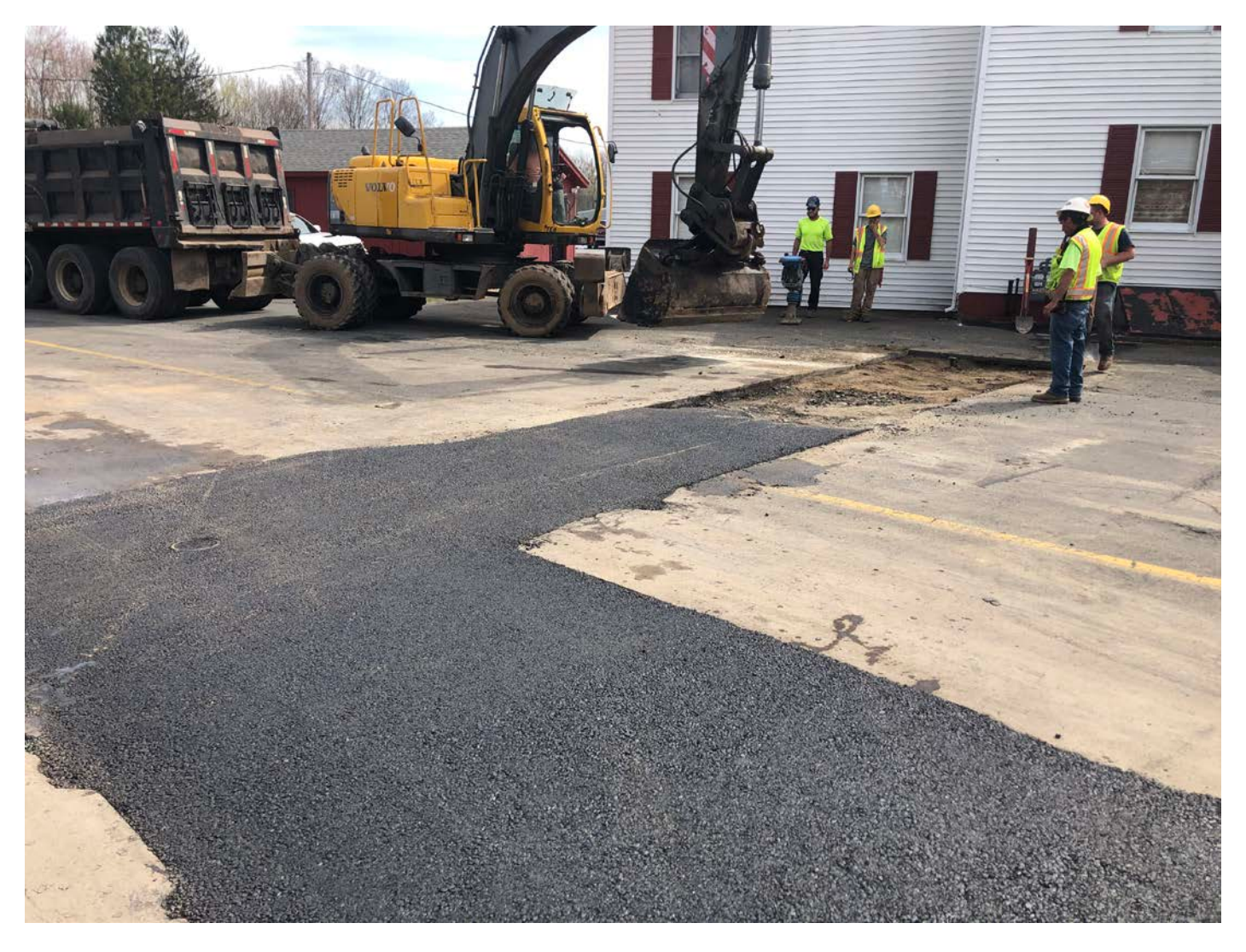
Picture 13: Ludlow placing asphalt on the curb stop trench overcut on Haddam Quarter Road in Durham as part of permanent paving activities. Rooster Liquors visible in the rear. View to the southeast.