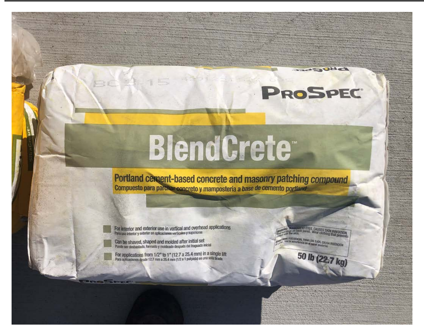
Picture 3: Grout that United Concrete will use on the bottom sections of the altitude valve vault. East of the Shared Access Driveway, Middletown.