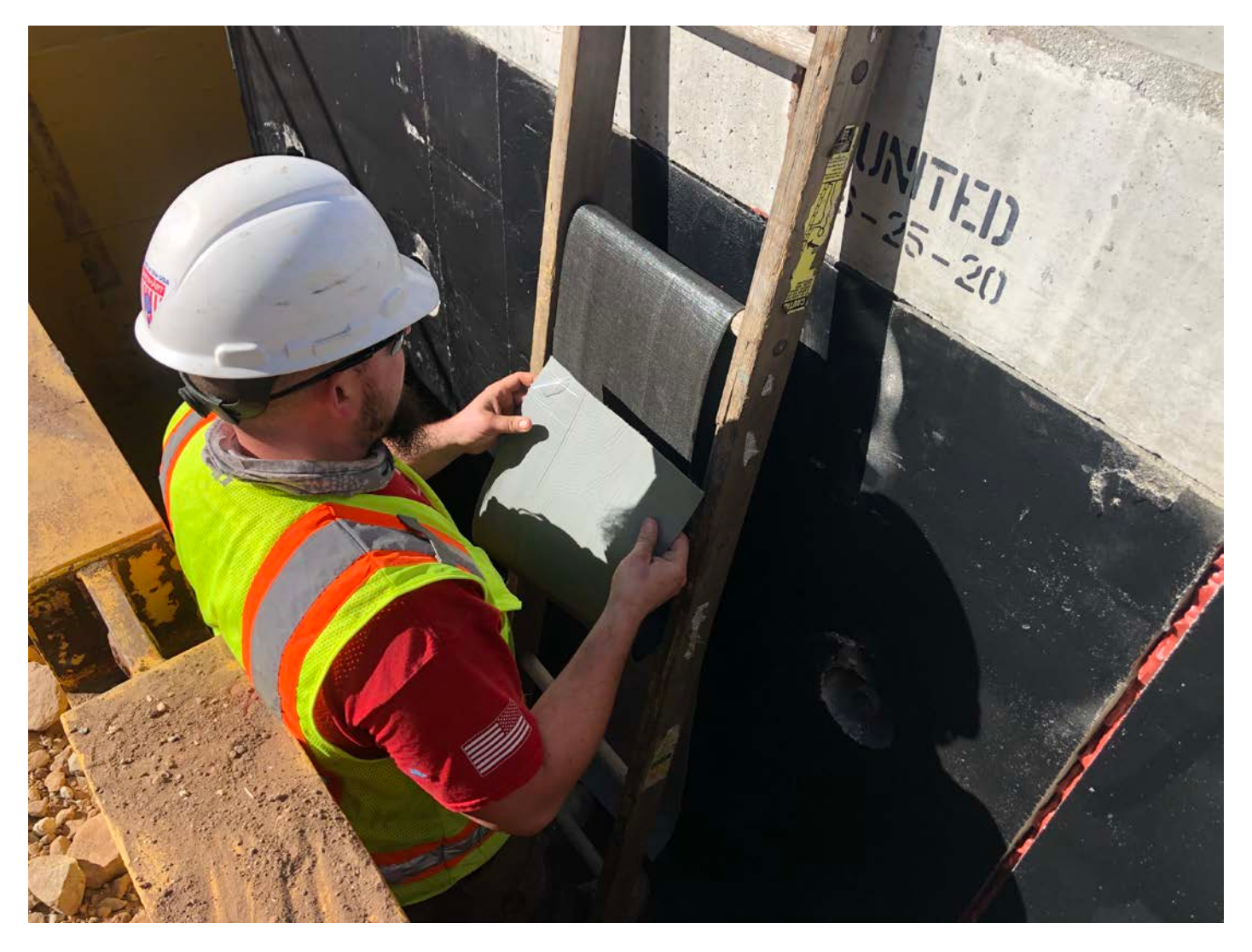
Picture 4: United Concrete applying Boa tape to the side joints of the altitude valve vault walls. East of the Shared Access Driveway, Middletown. View to the southwest.