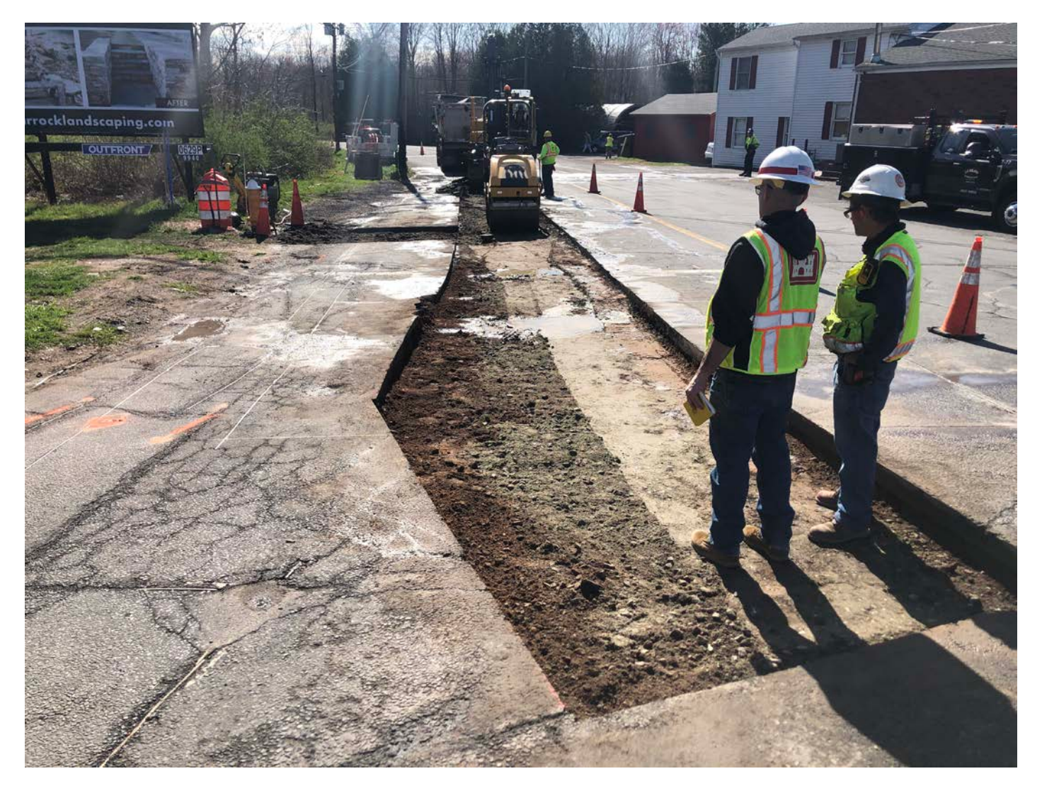
Picture 5: Asphalt that Ludlow stripped away on Haddam Quarter Road, Durham, as part of permanent paving activities. View to the east.

Res. Representative: J. Meunier Date: 04/14/21