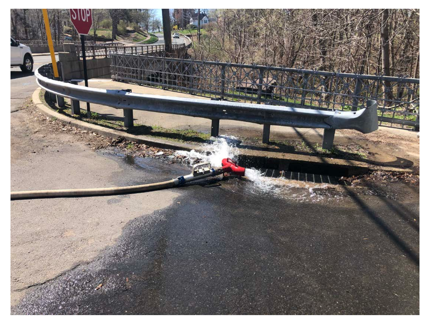
Picture 6: Ludlow and JMS discharging water that they are flushing from the 16" DIP waterline from 327 Main Street to the intersection of Main Street and Old Cemetery Road, Durham. View to the south.