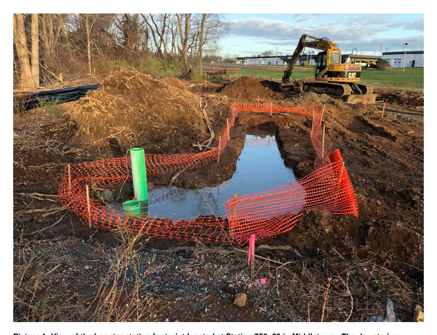
Picture 1: View of the booster station footprint located at Station 750+63 in Middletown. The dewatering pumps were not operating at the time the picture was taken. View to the west.