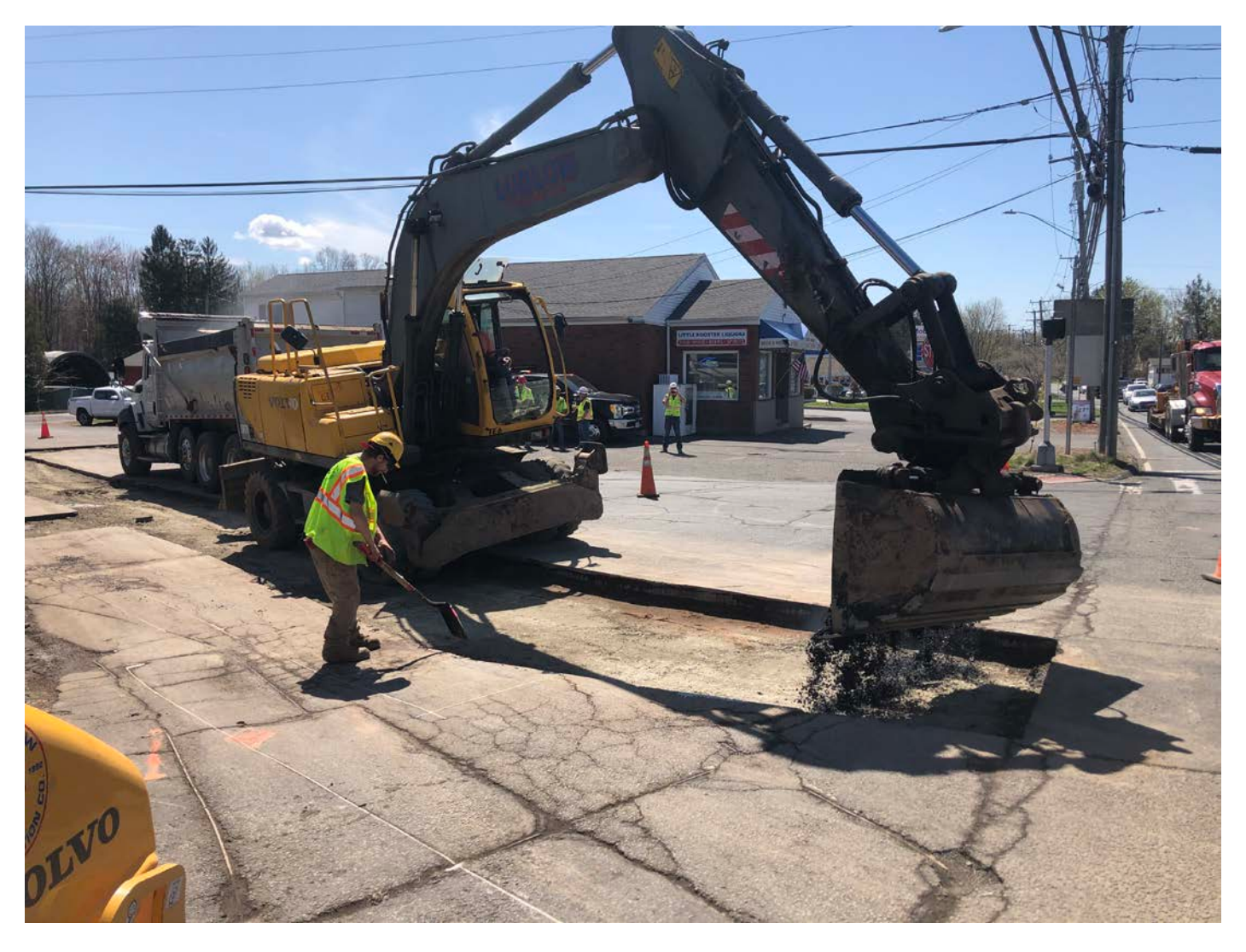
Picture 9: Ludlow placing the first lift of asphalt as part of permanent paving activities on Haddam Quarter Road, Durham. View to the southeast.