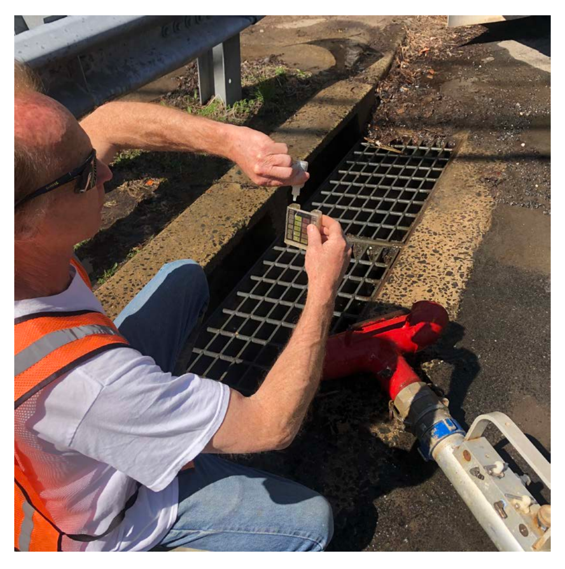
Picture 7: JMS is dechlorinating water that is being purged from the Main Street water line with calcium thiosulphate prior to discharging it and is testing the water frequently for residual chlorine.