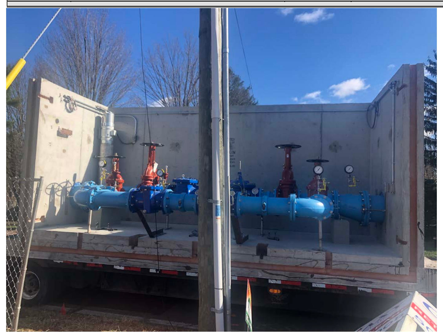
Picture 5: The second section of the PRV vault that was installed at Station 161+30 to the west of Main Street, Durham today.