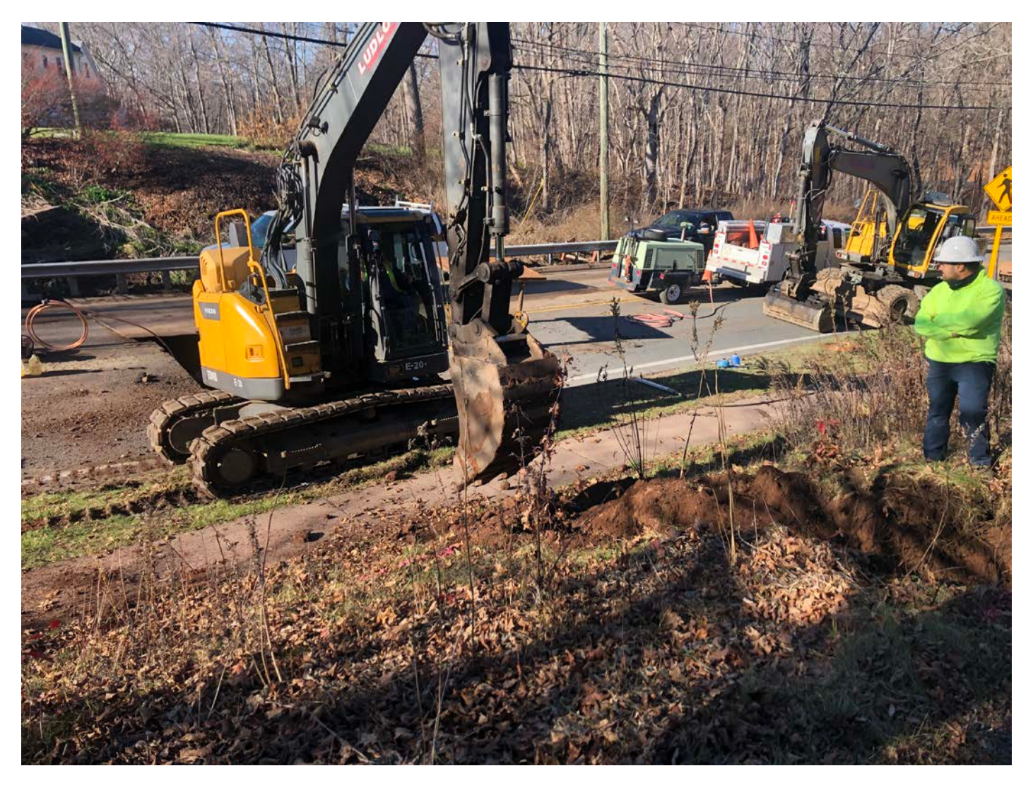
Picture 7: Ludlow excavating on the 127 Main Street, Durham property for the installation of a curb stop. View to the northwest.

Res. Representative: J. Meunier Date: 11/24/20