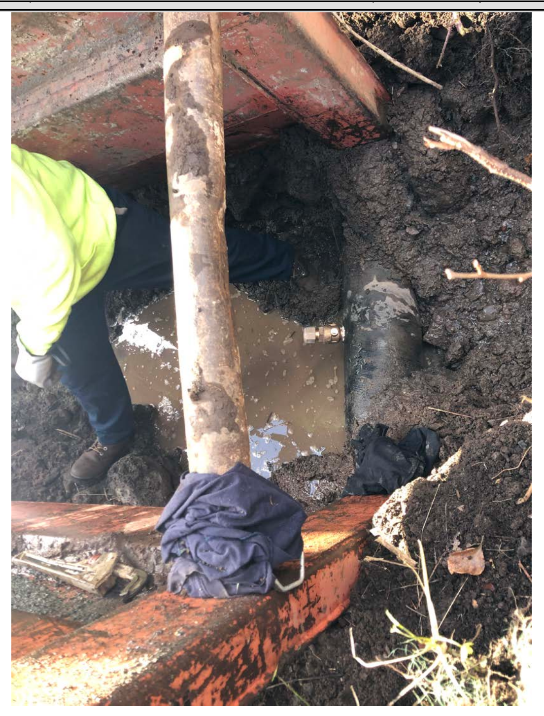
Picture 2: Corporation stop that Ludlow installed on the existing Town waterline as part of curb stop installation activities for 127 Main Street, Durham.