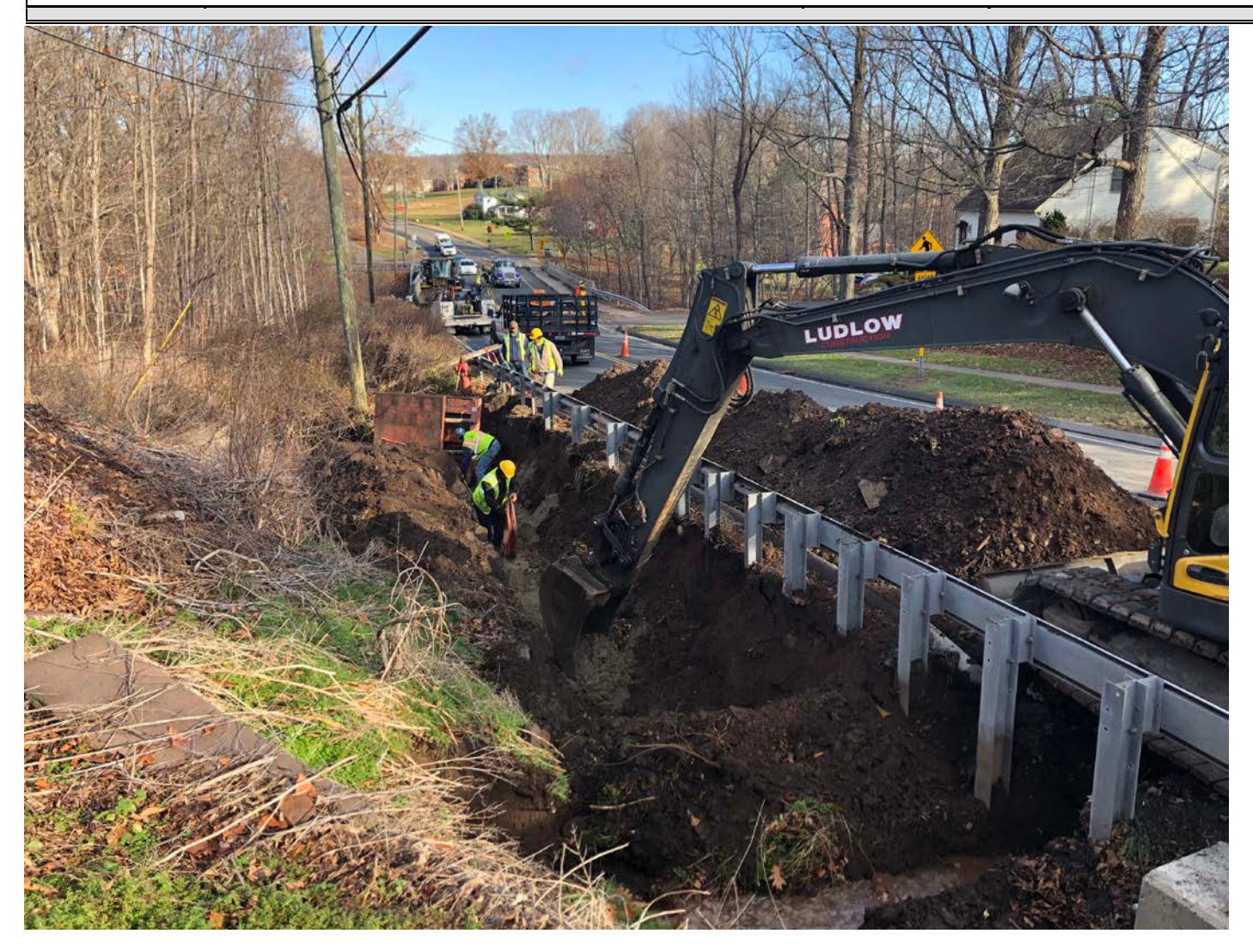
Picture 1: Ludlow excavating to the west of Main Street as part of installation activities for a curb stop at 127 Main Street, Durham. View to the northeast.

Res. Representative: J. Meunier Date: 11/24/20