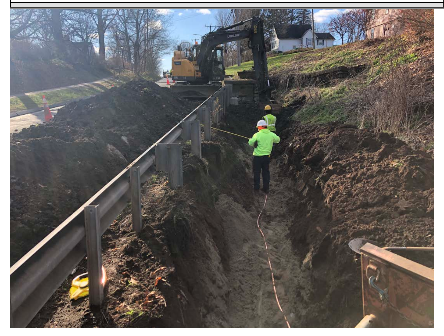
Picture 3: Ludlow installing 1" copper service line 6.5' to the west of Main Street, Durham for the installation of a curb stop at 127 Main Street. View to the south.