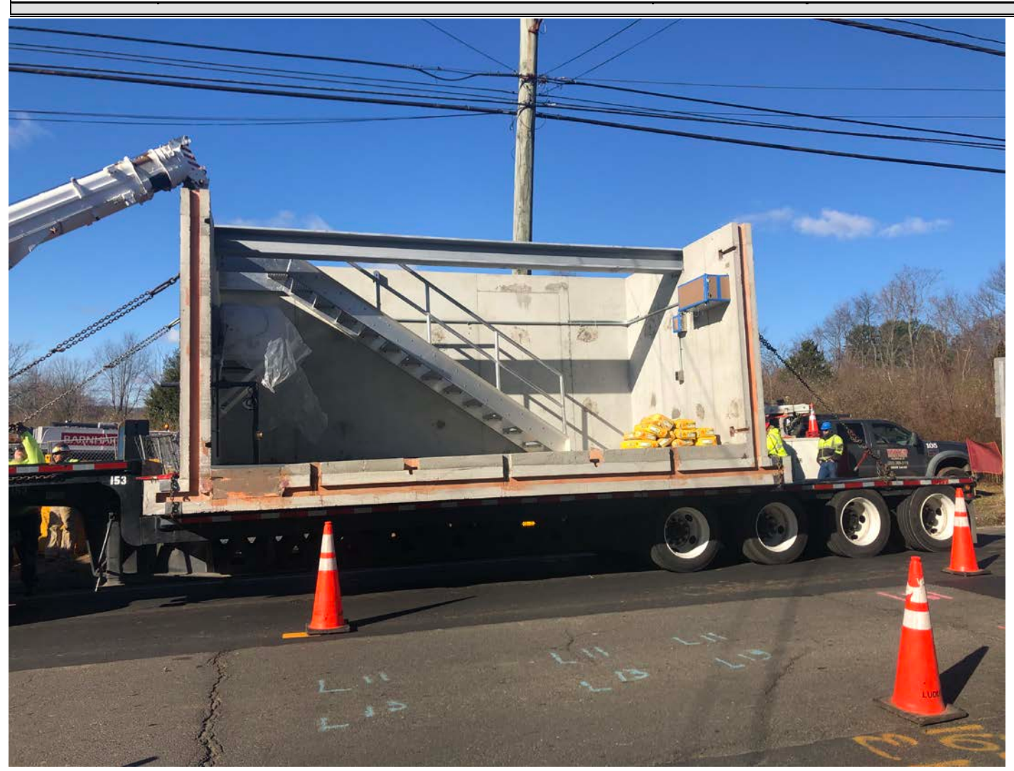
Picture 4: One of the sections of the PRV vault that was installed at Station 161+30 to the west of Main Street, Durham today.