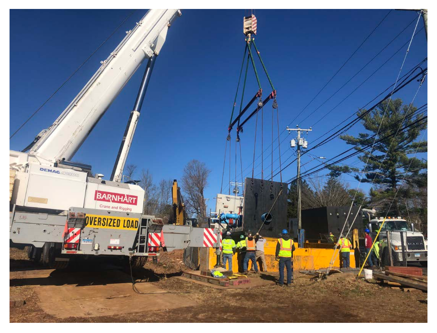
Picture 6: United hoisting the first of two sections of the PRV vault at Station 161+30, to the west of Main Street, Durham. View to the north.