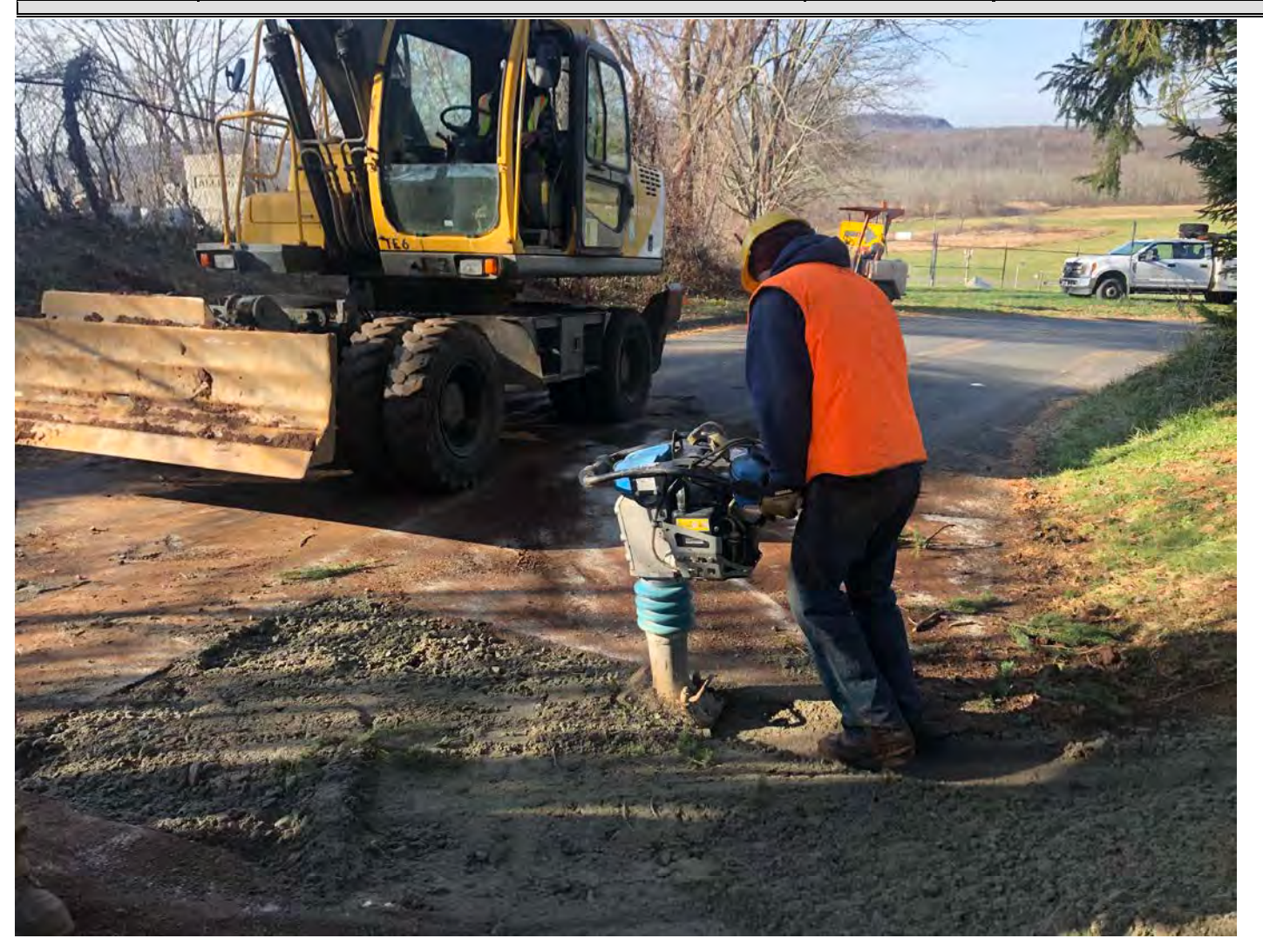
Picture 3: Ludlow compacting backfill in the trench that was excavated for the installation of a corporation stop and a curb stop for 29 Maple Avenue, Durham. View to the west.

Project #:AECOM: 6061487Report No:204Contractor:Ludlow ConstructionPage:5 of 8