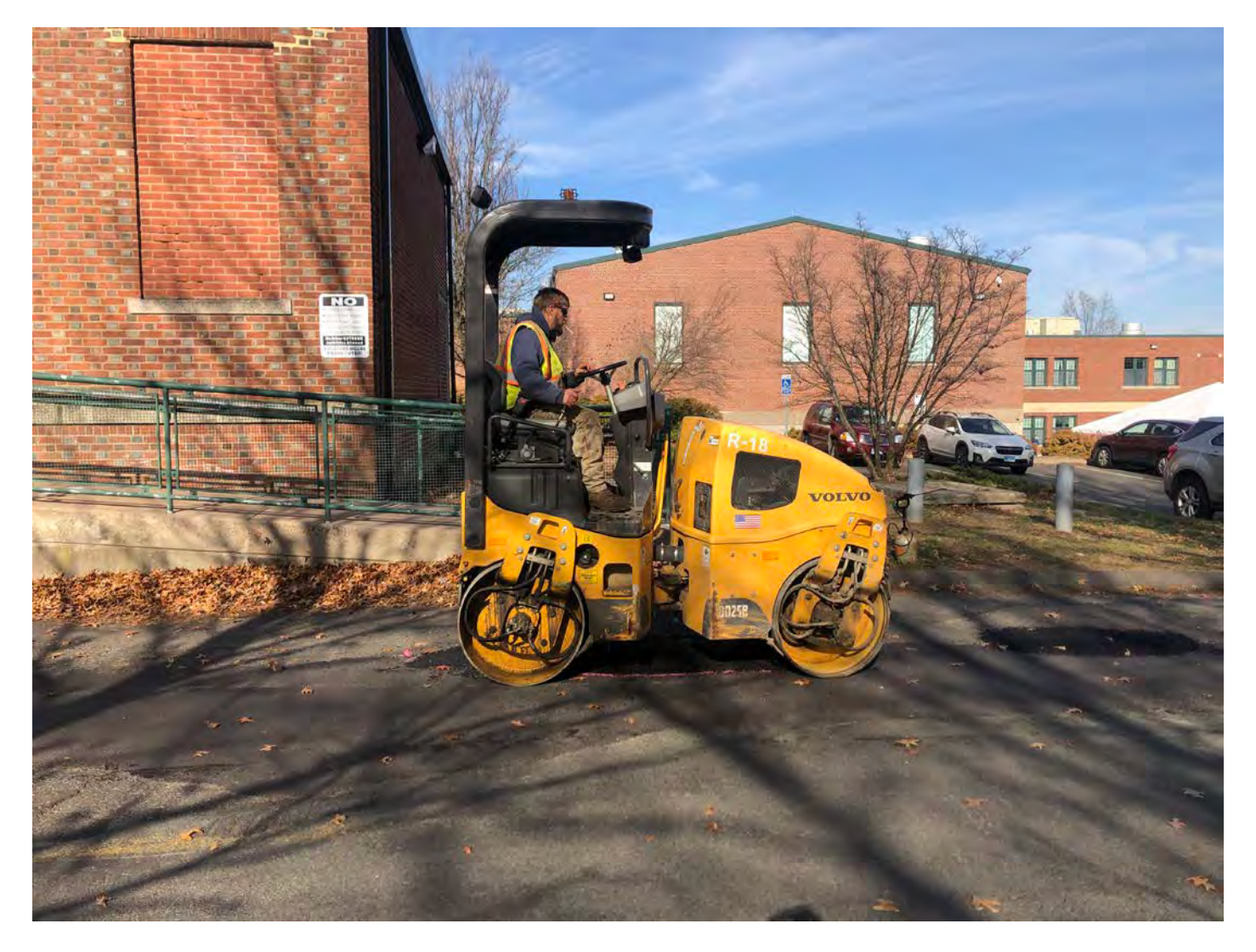
Picture 6: Ludlow compacting asphalt that they have placed to fill depressions on Pickett Lane, Durham at Station 504+00. View to the north.

Res. Representative: J. Meunier Date: 11/19/20