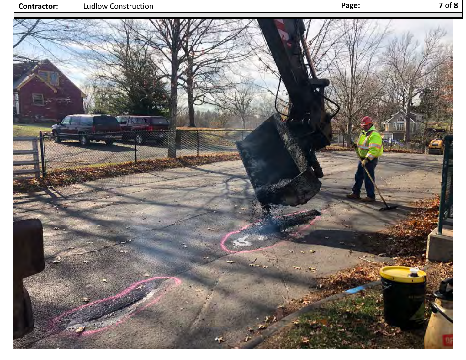
Picture 5: Ludlow patching potholes and depressions on Pickett Lane, Durham at Station 504+00. View to the northeast.

Res. Representative: J. Meunier Date: 11/19/20