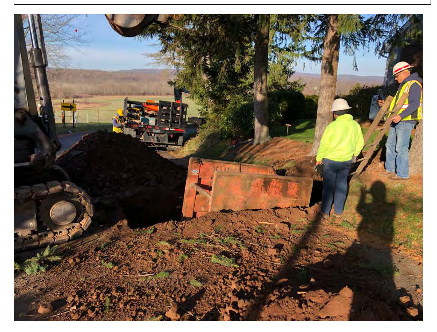
Picture 1: Ludlow excavating at 29 Maple Avenue, Durham for the installation of the installation of a curb stop. View to the west.