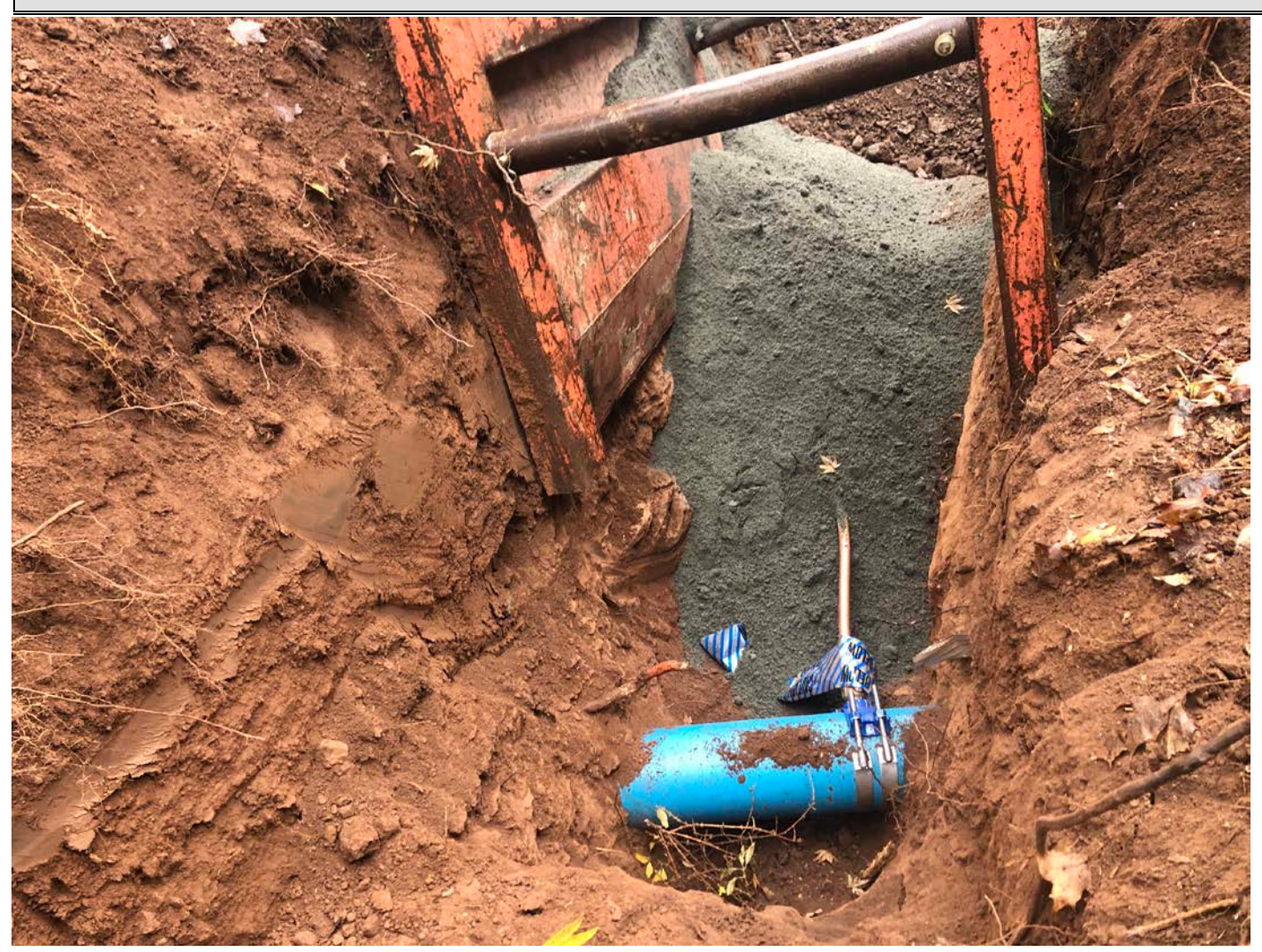
Picture 4: 1" copper water service line that Ludlow just installed on the corporation stop they installed on the 8" PVC Town water line on the 120 Main Street property for the installation of a curb stop at 119 Main Street, Durham. View to the east.