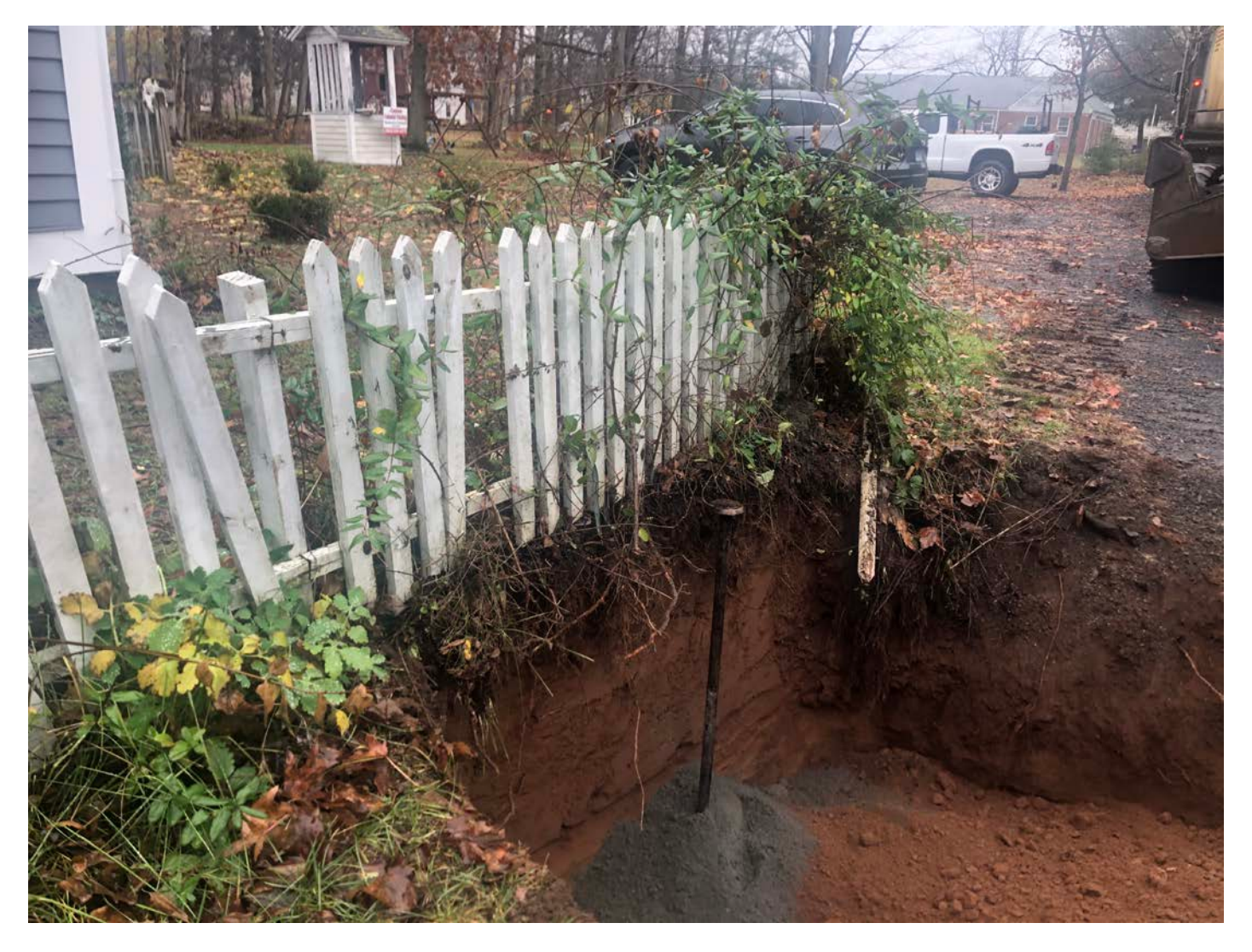
Picture 9: Curb stop that Ludlow installed at 119 Main Street, Durham. View to the north.