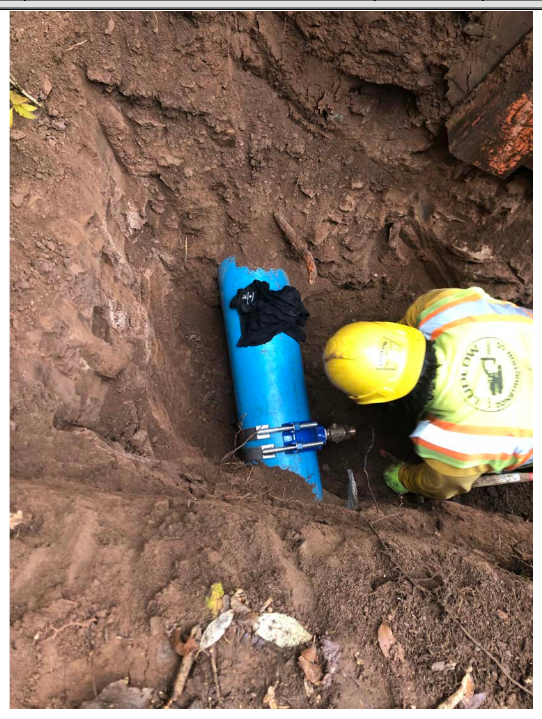
Picture 2: Ludlow installing a saddle and a corporation stop on the 8" PVC Town water line located on the 120 Main Street property for the installation of a curb stop at 119 Main Street, Durham.