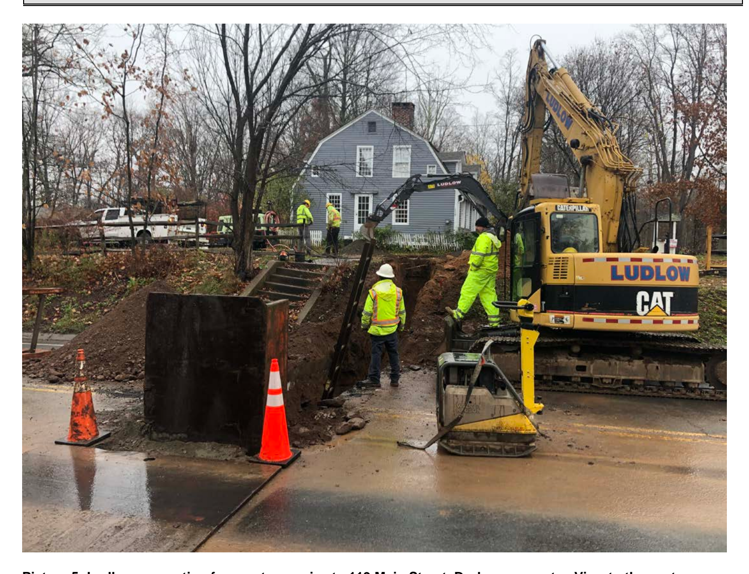
Picture 5: Ludlow excavating for a water service to 119 Main Street, Durham property. View to the east.