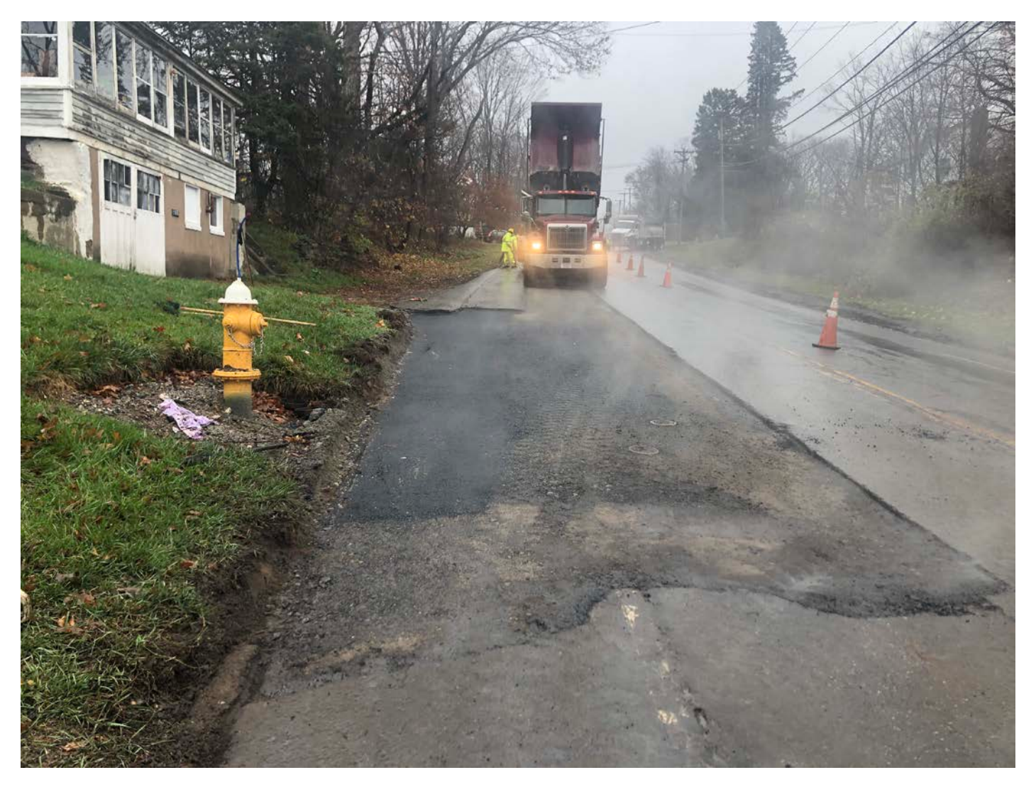
Picture 8: Second lift of asphalt placed and compacted on the westbound lane of Route 68, Durham as part of permanent pavement activities on trench overcuts. View to the east.