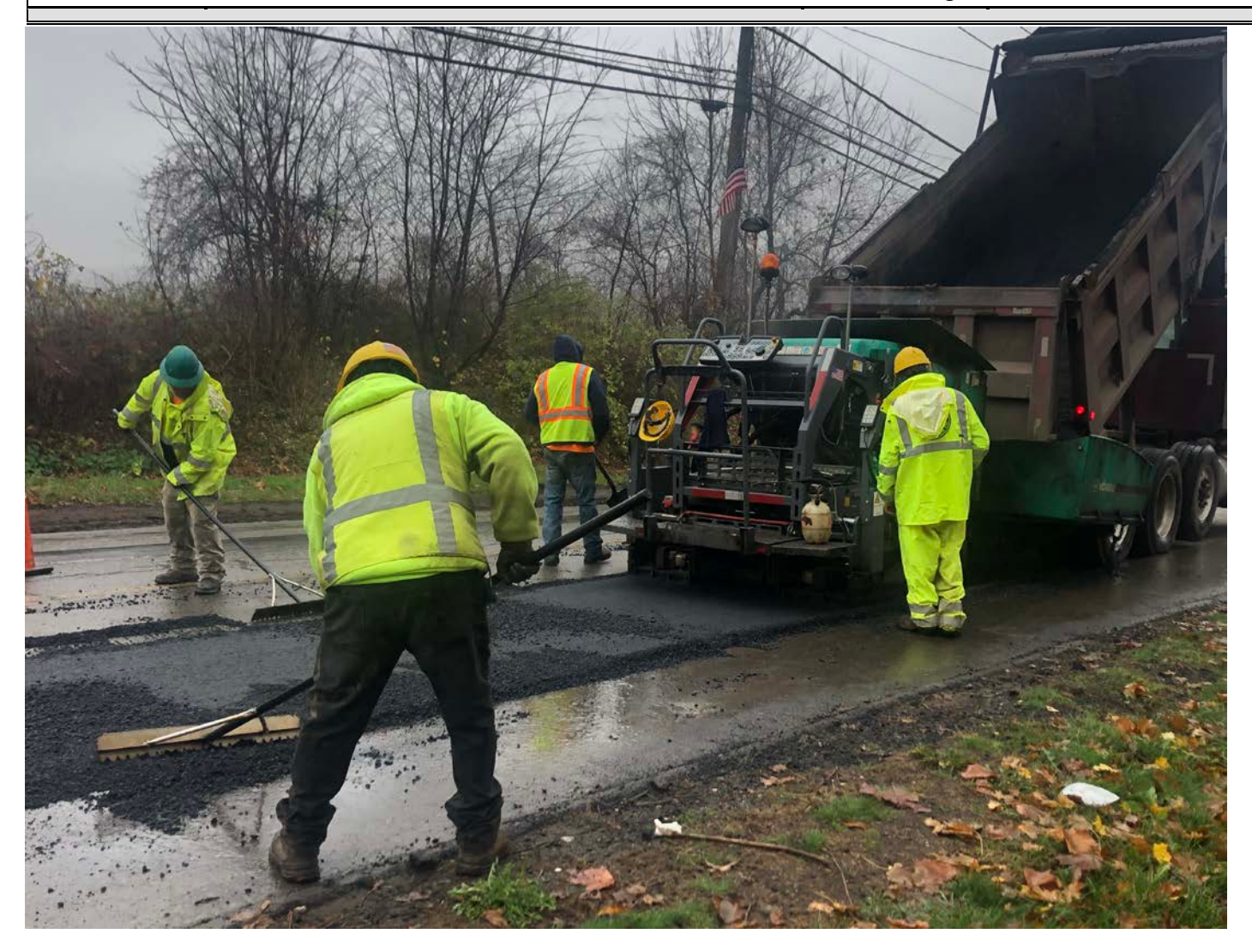
Picture 7: Ludlow placing asphalt on the westbound lane of Route 68, Durham as part of permanent pavement activities on trench overcuts. View to the southwest.