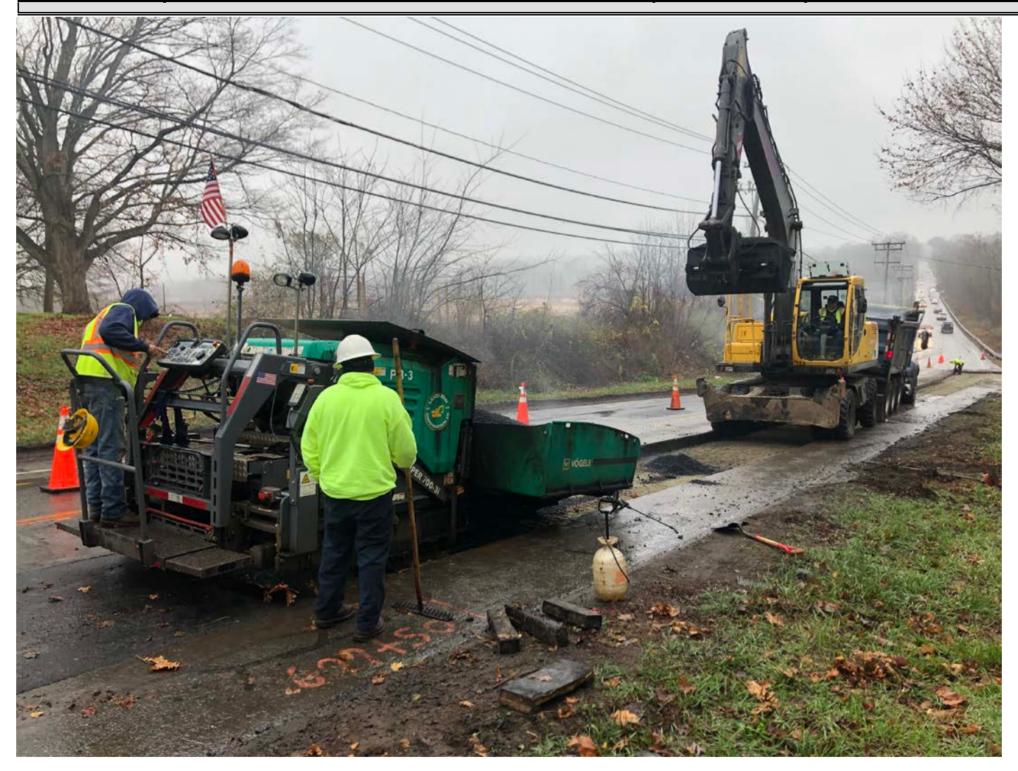
Picture 3: Ludlow excavating pavement for trench overcuts on the westbound lane of Main Street, Durham between Stations 607+50 and 609+60 as part of permanent paving activities. View to the southwest.