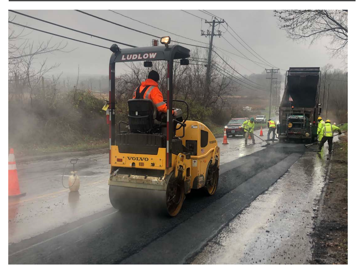
Picture 6: Ludlow compacting pavement on the westbound lane of Route 68, Durham as part of permanent pavement activities on trench overcuts. View to the southwest.