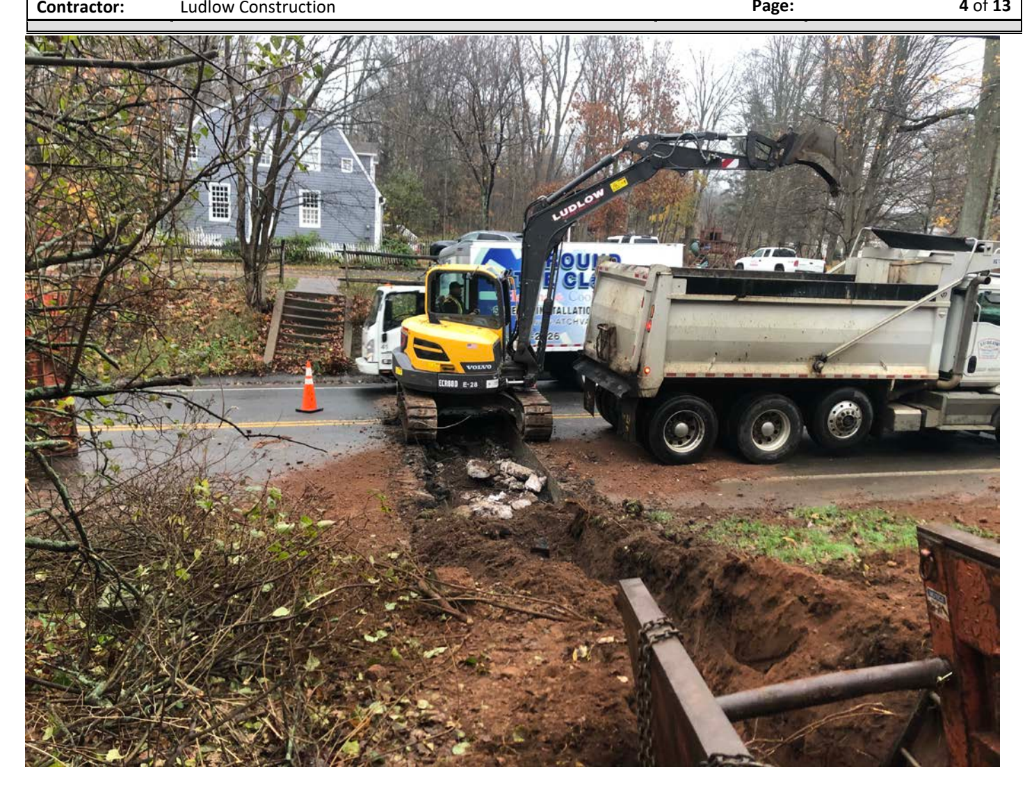
Picture 1: Ludlow excavating from the 120 Main Street residence (where the Town water line is located) to the 119 Main Street residence as part of installation activities for the placement of a water service to 119 Main Street. Main Street, Durham; view to the east.